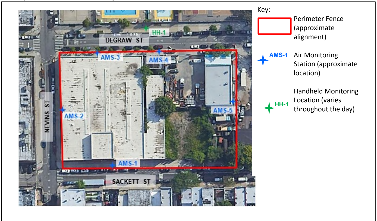
Figure 1 – CAMP Air Monitoring Station Locations

There were elevated PM 10 concentrations recorded at AMS-1 through AMS-5 during the night of 07/04/24 into the morning of 07/05/24. No elevated TVOC concentrations were recorded during the same period. No work performed onsite (July 4 th holiday). Elevated PM 10 concentrations were likely attributable to July 4th fireworks. NYSDEC was notified by email on 07/05/24. There were no other TVOCs or PM 10 concentrations above the CAMP-established action levels, or observations of dust or odors associated with the Site during the monitoring period.