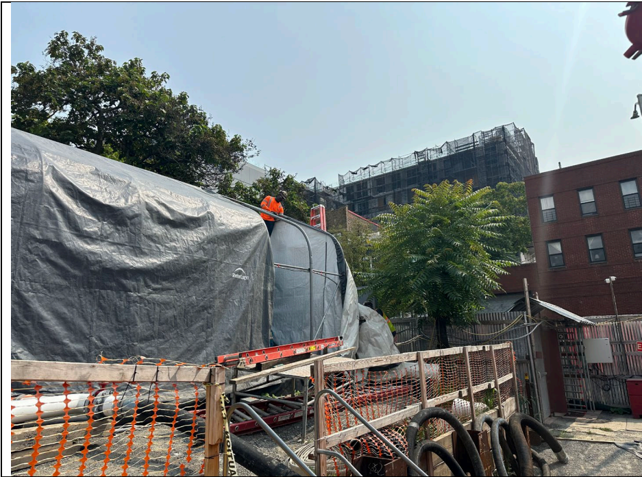
Photo 3: Looking southeast, view of CEI reinstalling the fabric of the WTS enclosure.