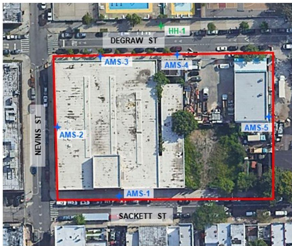
Figure 1 – CAMP Air Monitoring Station Locations

There were no TVOCs or PM 10 concentrations above the CAMP-established action levels, or observations of dust or odors associated with the Site during the monitoring period.