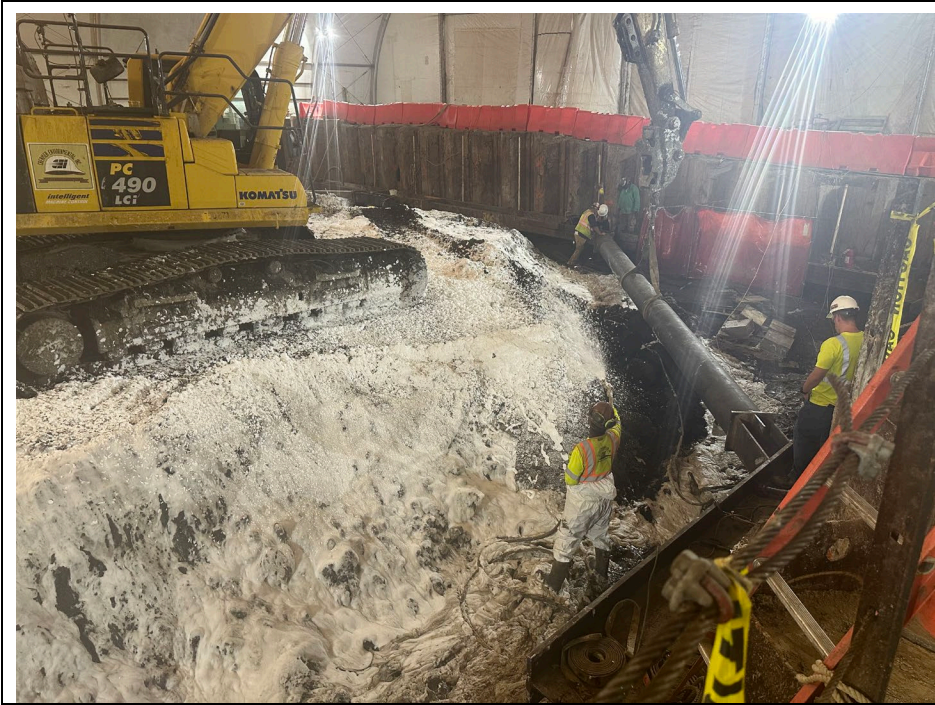
Photo 3: Looking southeast, view of CEI installing corner bracing in the southwest corner of former Gas Holder 4 excavation area and applying Atmos odor suppressing foam.