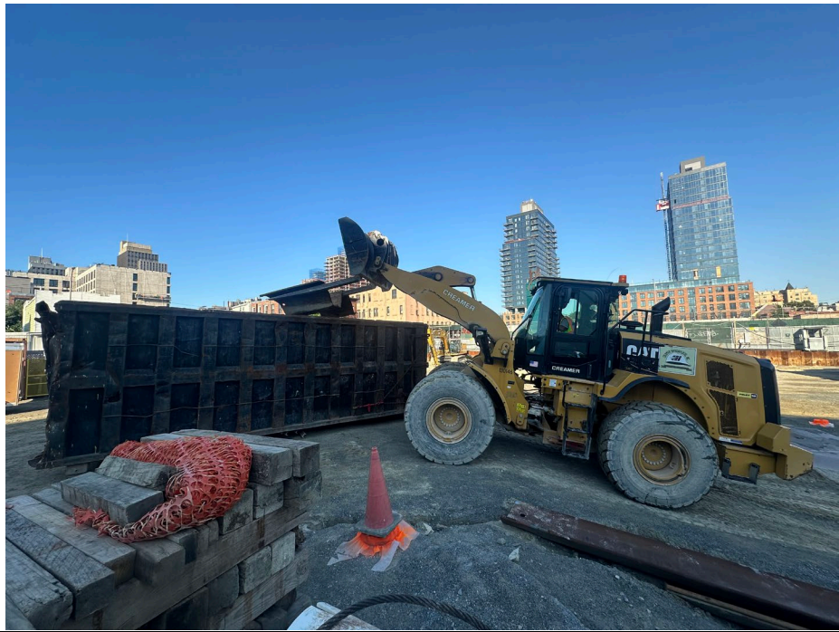
Photo 3: Looking southwest, view of CEI loading a roll-off container with scrap metal for offsite disposal.