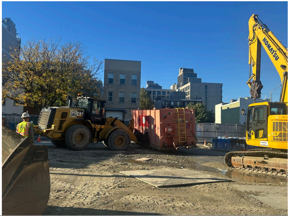
Photo 3: Looking south, view of CEI relocating a frac tank within the southern portion of the site.