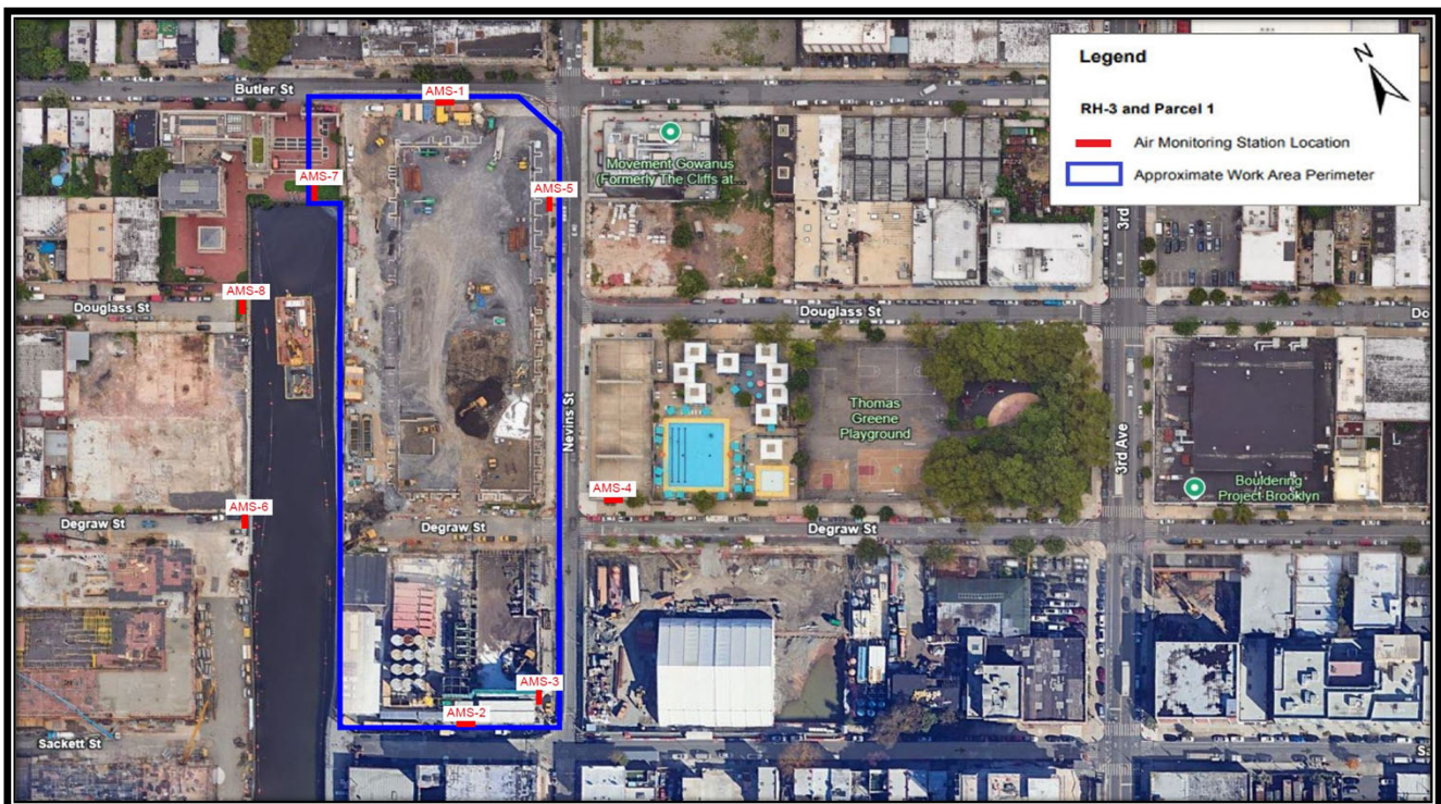
Figure 1 - CAMP Station Locations