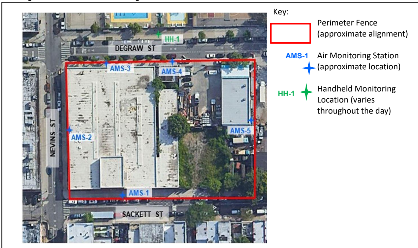
Figure 1 – CAMP Air Monitoring Station Locations

There were no TVOCs or PM 10 concentrations detected above the CAMP-established action levels, or observations of dust or odors associated with the project leaving the Site during the monitoring period.