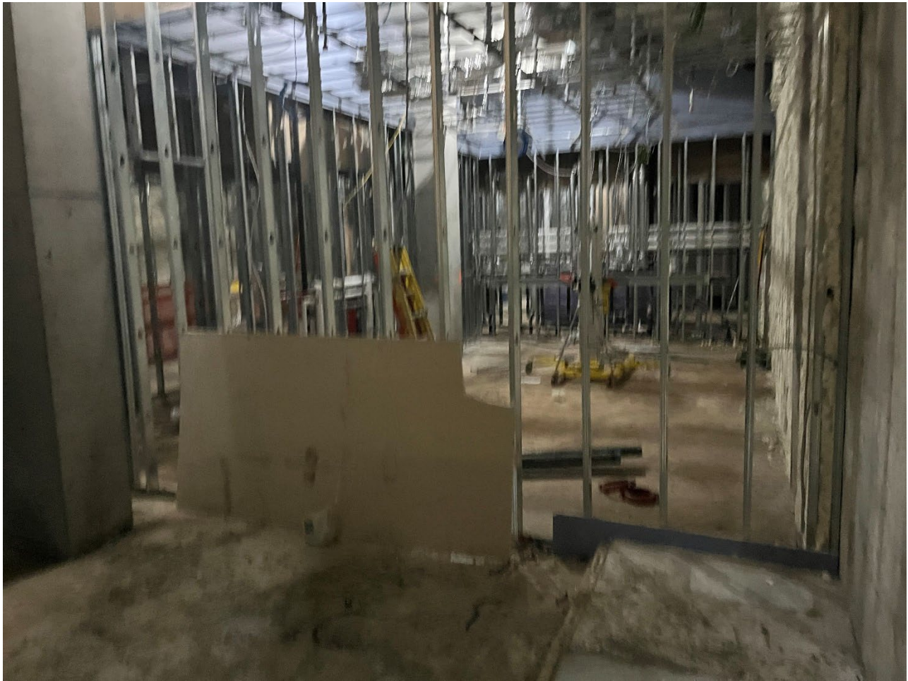
View of the DIY Art Room from the Electrical Room, which is the proposed location of sample IA-4. Facing west.