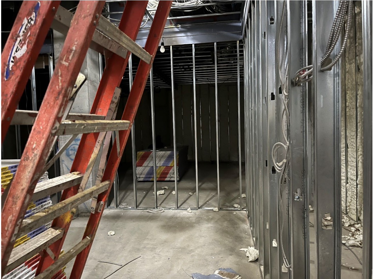
View of the Screening Room, which is the proposed location for samples IA-1 and SS-1, from the Golf Sim Room, facing west.