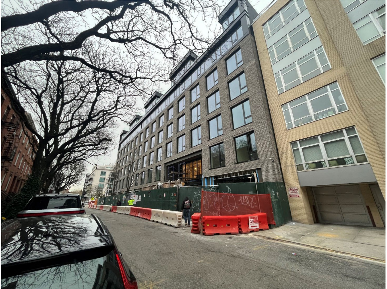
View of the building from Front Street, facing east.