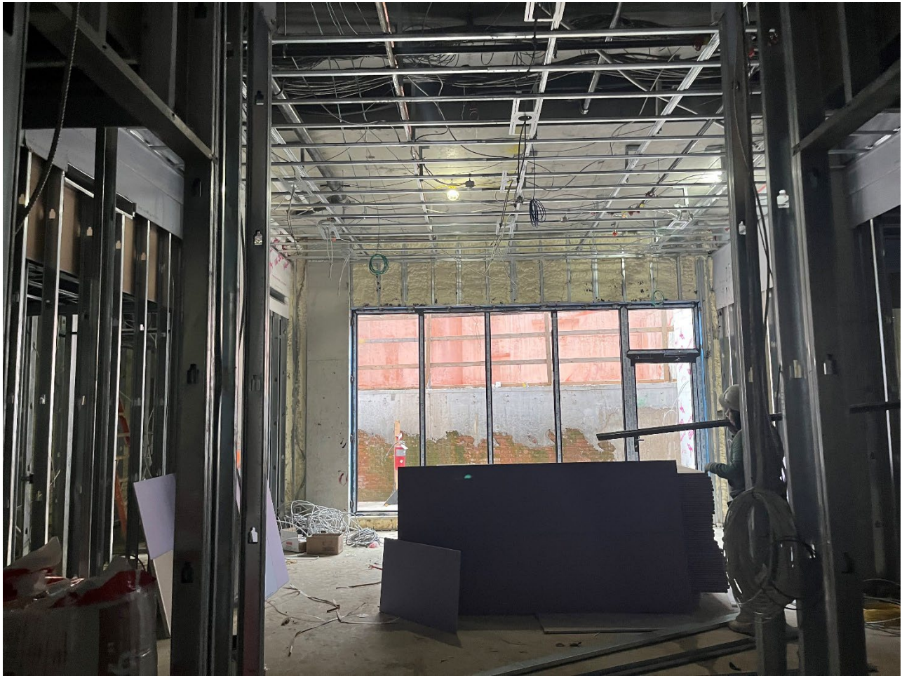
The open door and window frame on the eastern wall of the Sauna/Spa Room, facing east.