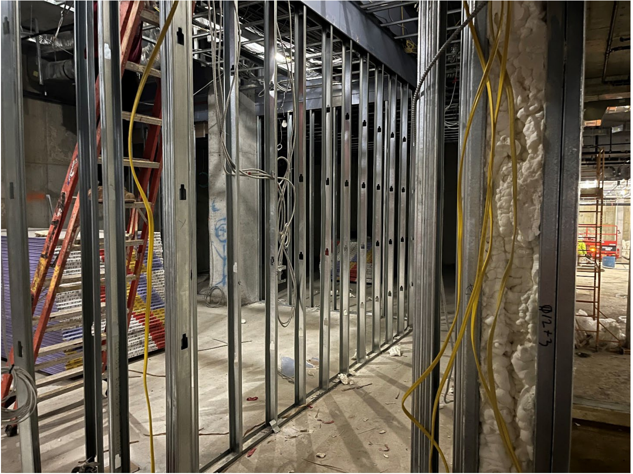
View of the Golf Sim Room and Screening Room from the corner of the hallway near the doorway to the Parking Garage, facing west.