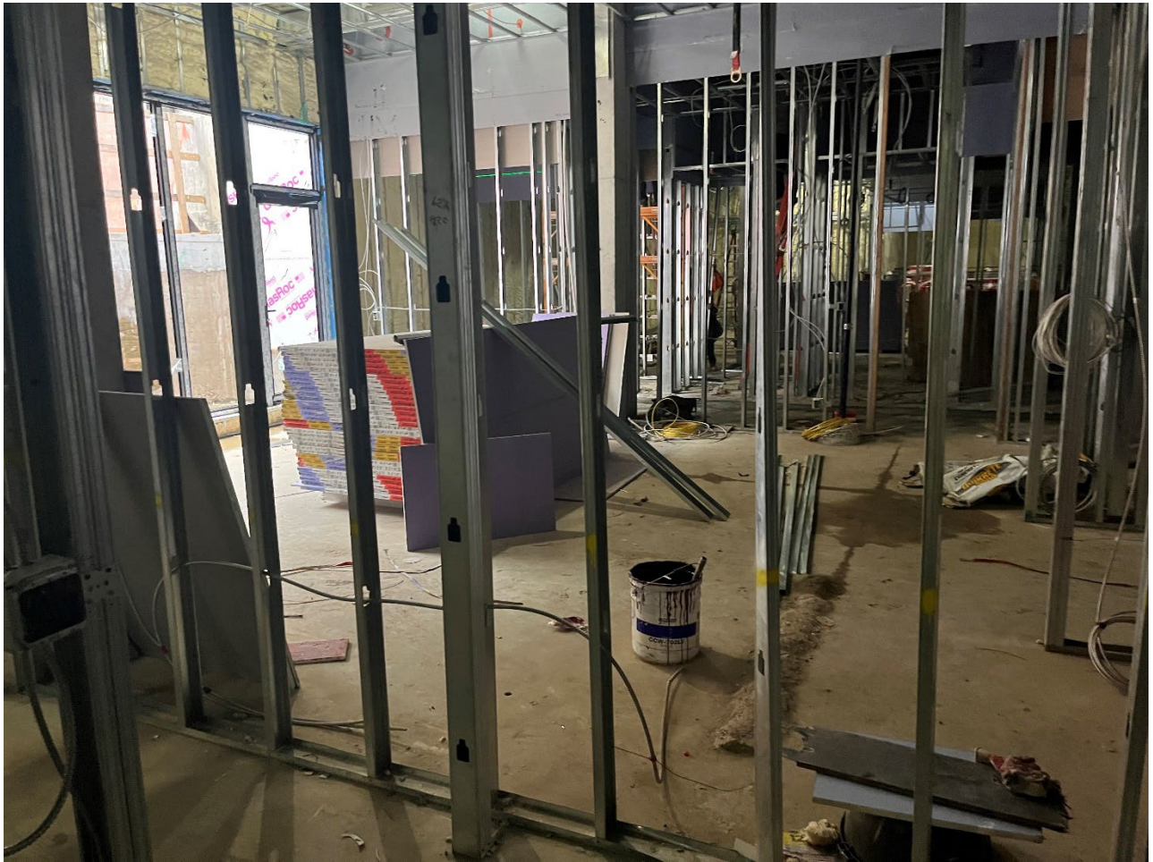
View of the Sauna Spa Room, which is the proposed location of sample IA-3. Facing south.