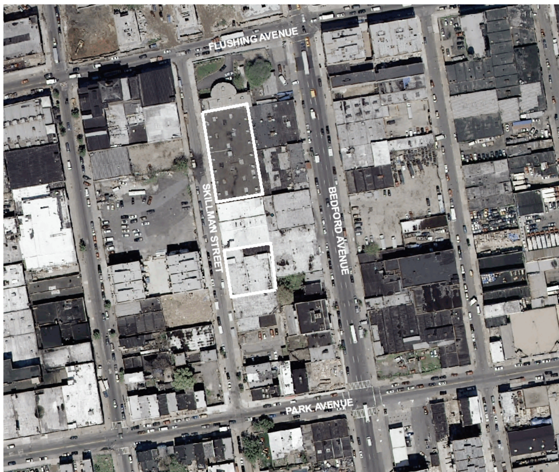
Skillman St. Holder Station outlined in white

NYSDEC, Region 2 1 Hunters Point Plaza 47-40 21 st St. Long Island City, NY 11101 (718) 482-4995