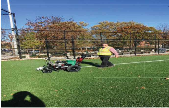
Stripping at BF9