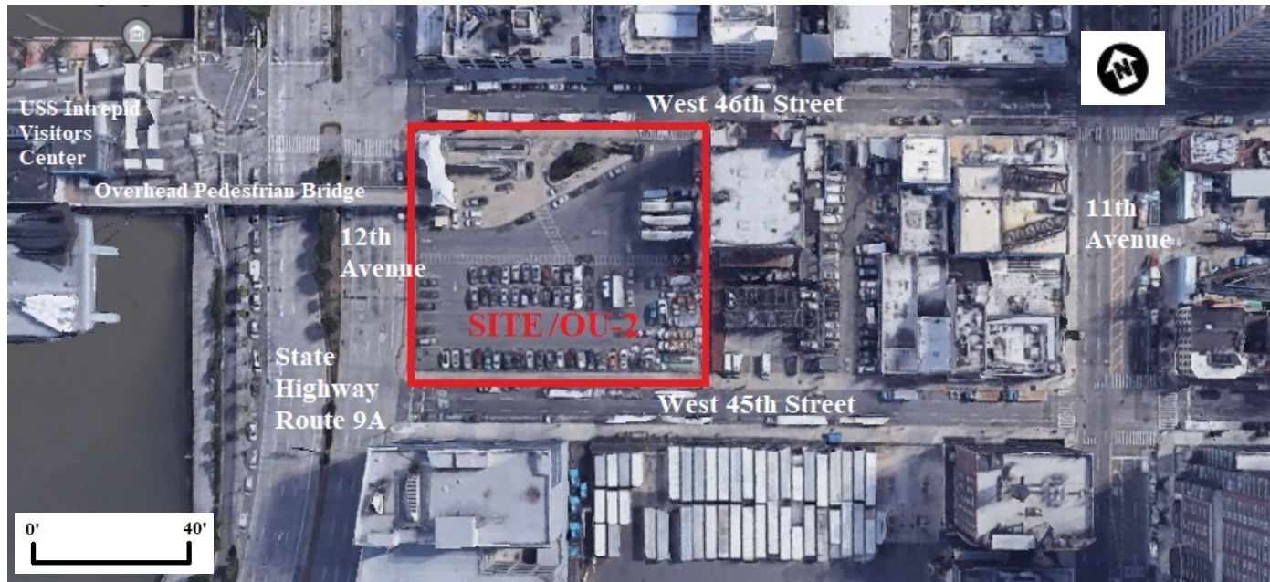
Figure 2 - Proposed Remedial Action