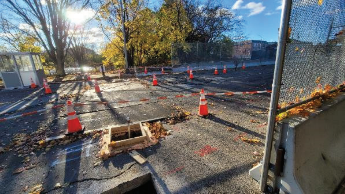
Tuesday 12 th Start of day