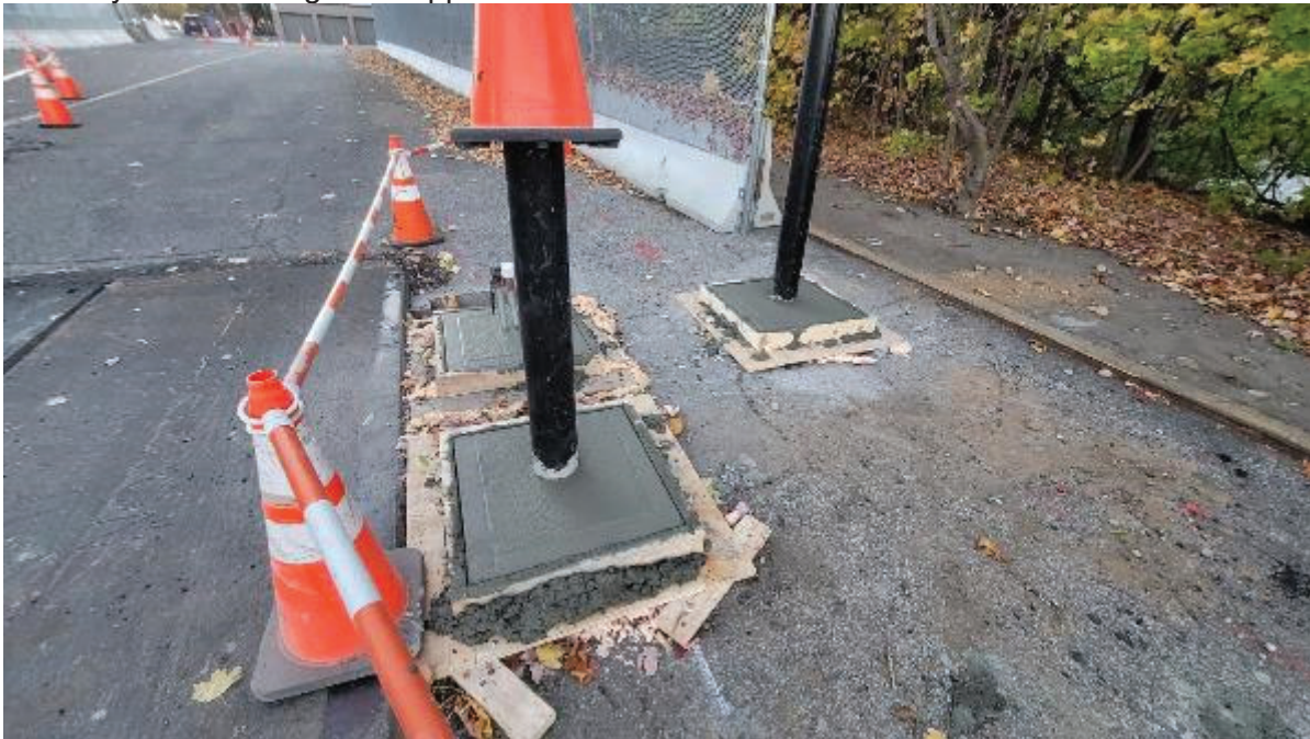
Tuesday13th Grouting and support