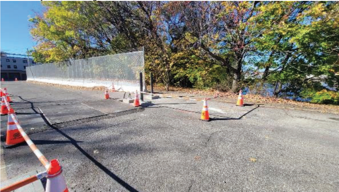
Wednesday 14 th Grouted the bollards and top off