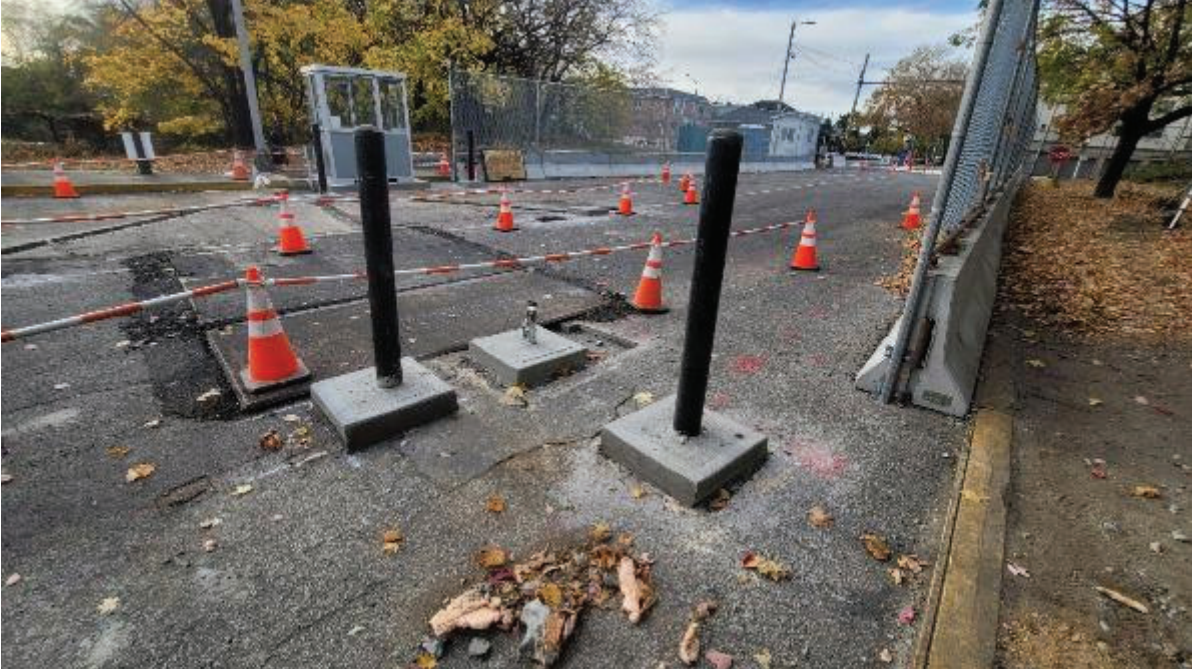
Friday 15 th Start of day