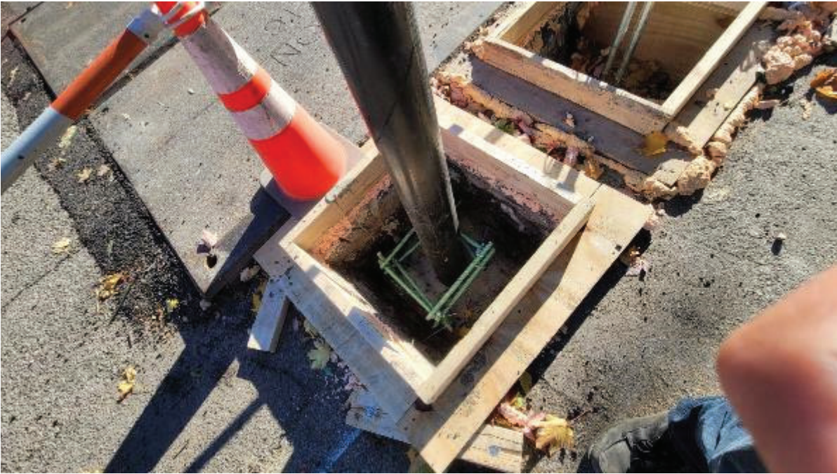
Tuesday13th Grouting and support