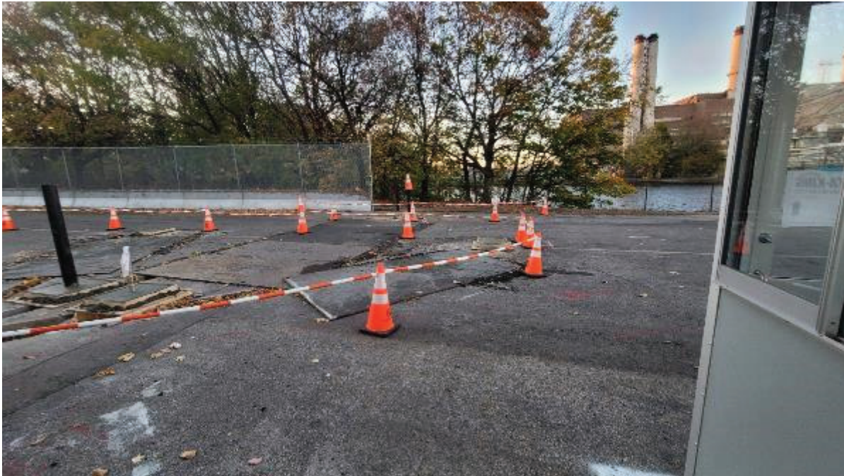
Tuesday13th Grouting and support