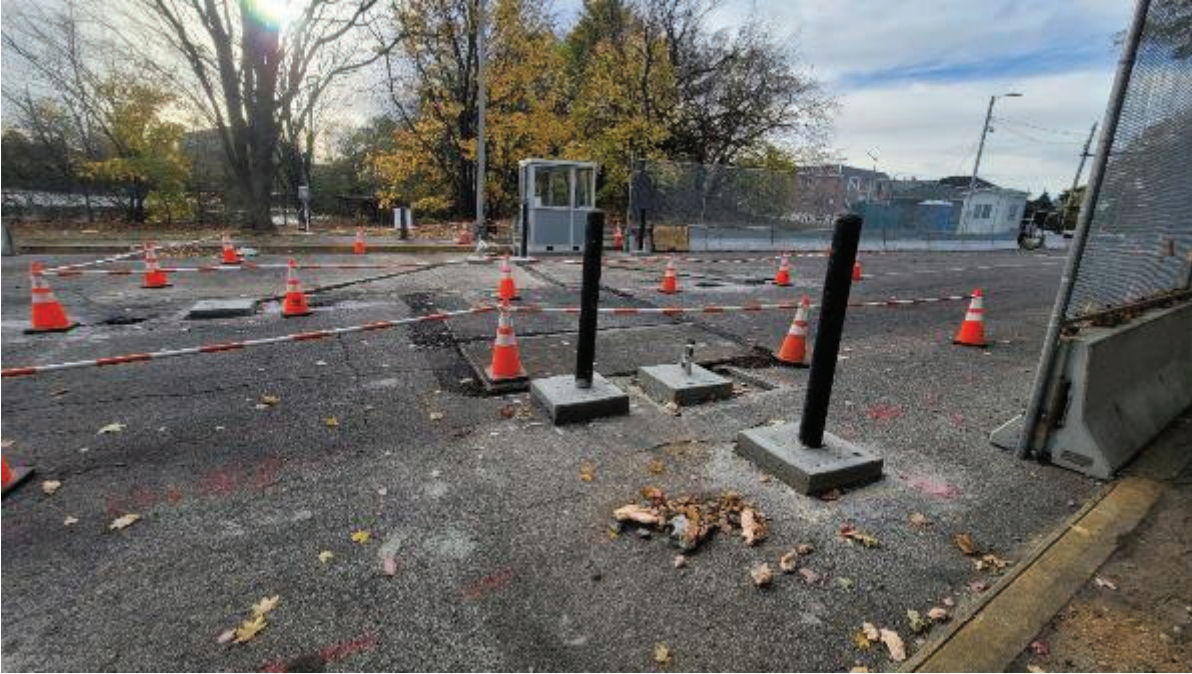
Friday 15 th Start of day