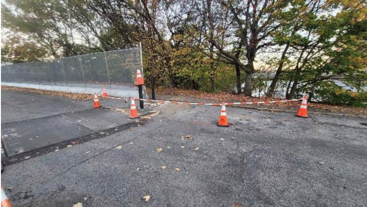
Tuesday13th Grouting and support