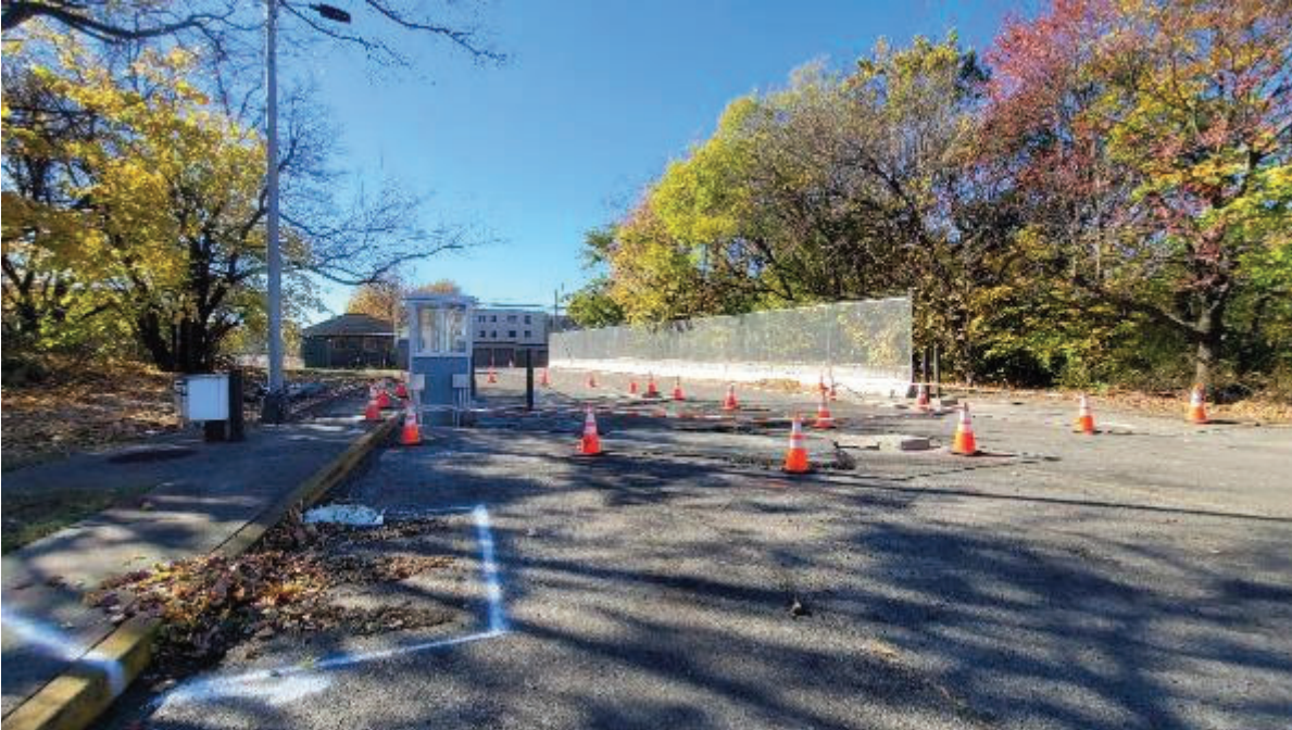
Wednesday 14 th Moved guard house to concrete slab zoomed out