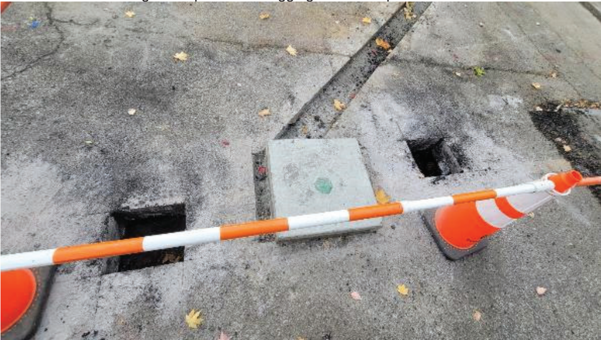
Friday 15 th New square cutting for future bollards