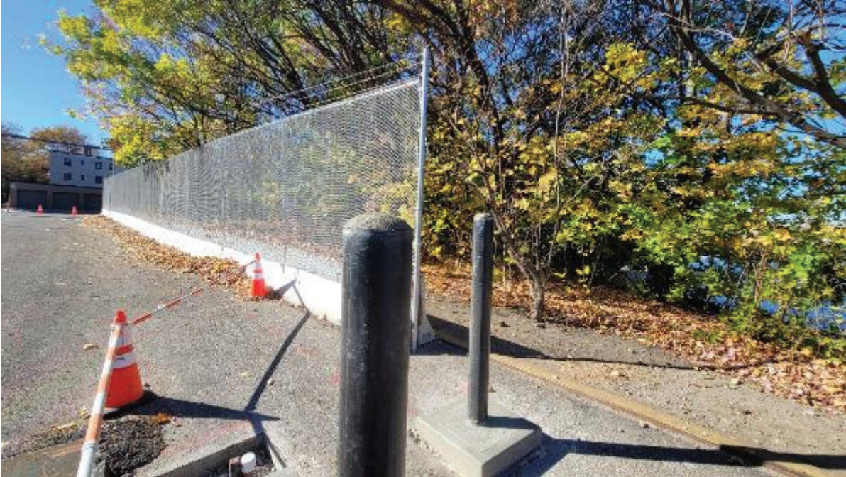
Wednesday 14 th Grouted the bollards and top off