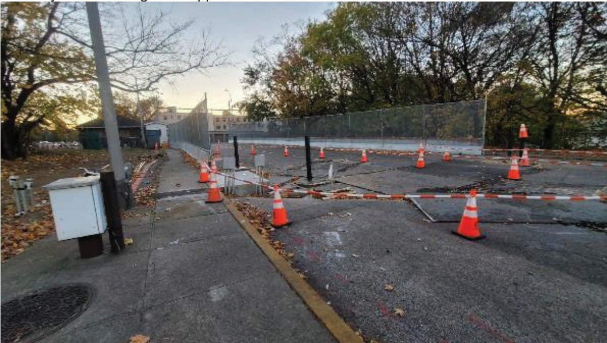
Tuesday13th Grouting and support