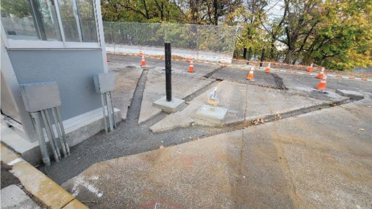
Friday 15 cleared cement for future asphalt