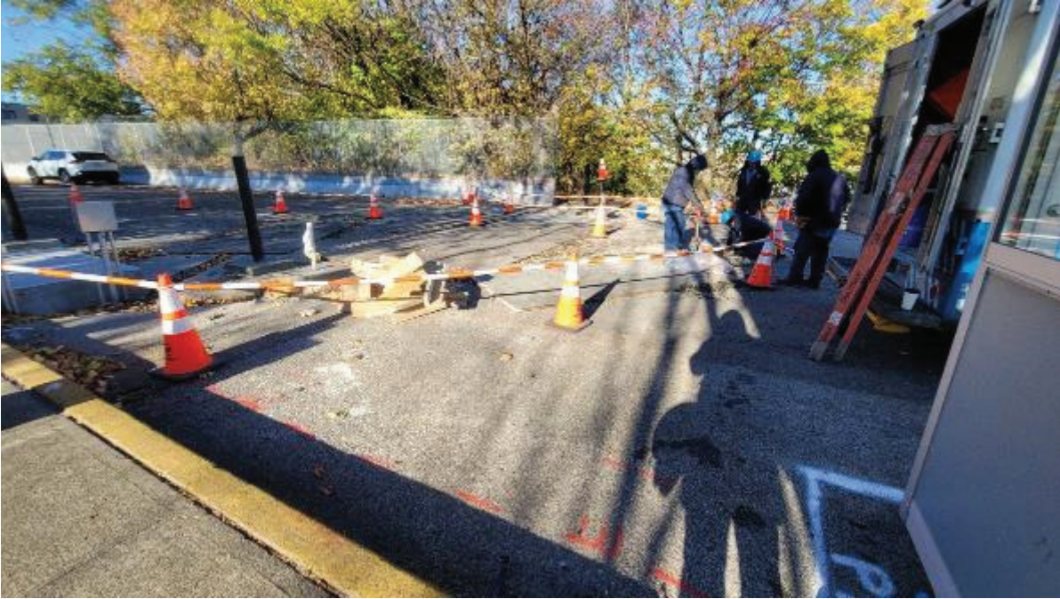
Wednesday 14 th Removing wooden box frame