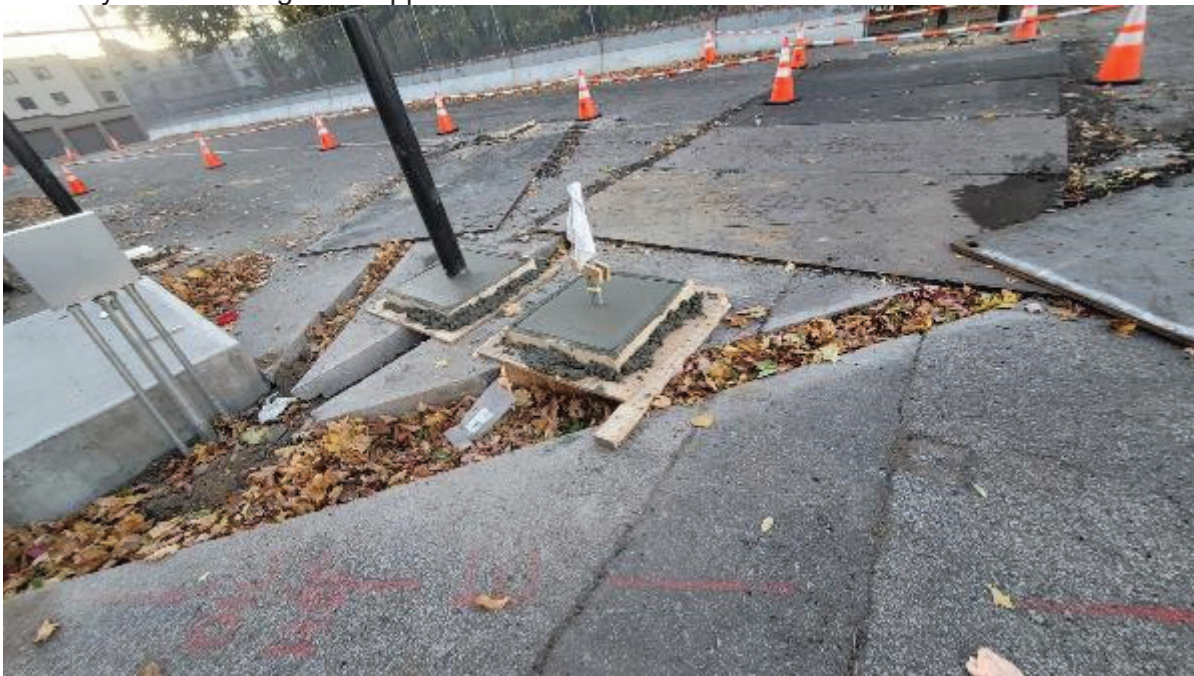
Tuesday13th Grouting and support