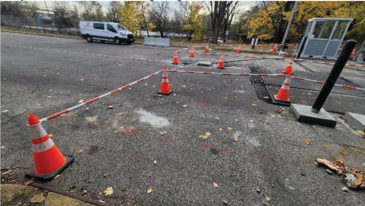
Friday 15 th Start of day