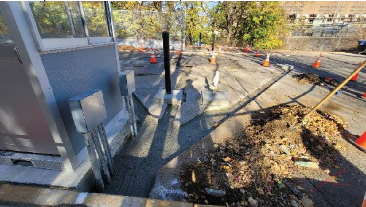
Thursday 14 th Trenches cleared and cement added