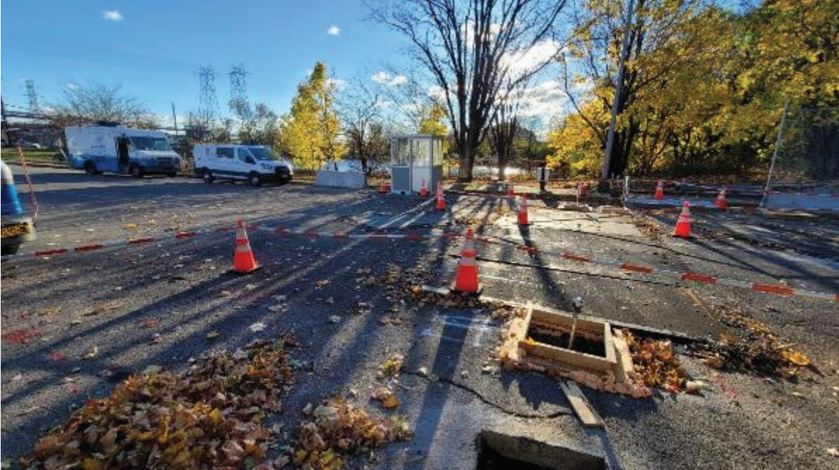
Tuesday 13 th