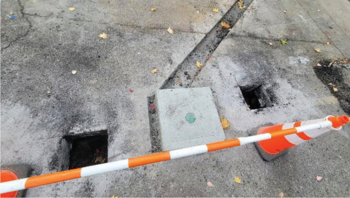
Friday 15 th New square cutting for future bollards