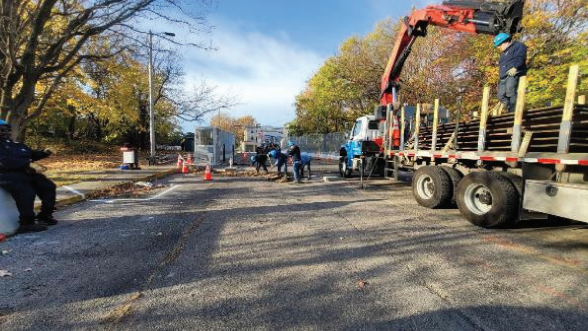
TH 14 th truck removing metal plates and digging the new square for removable bollards.