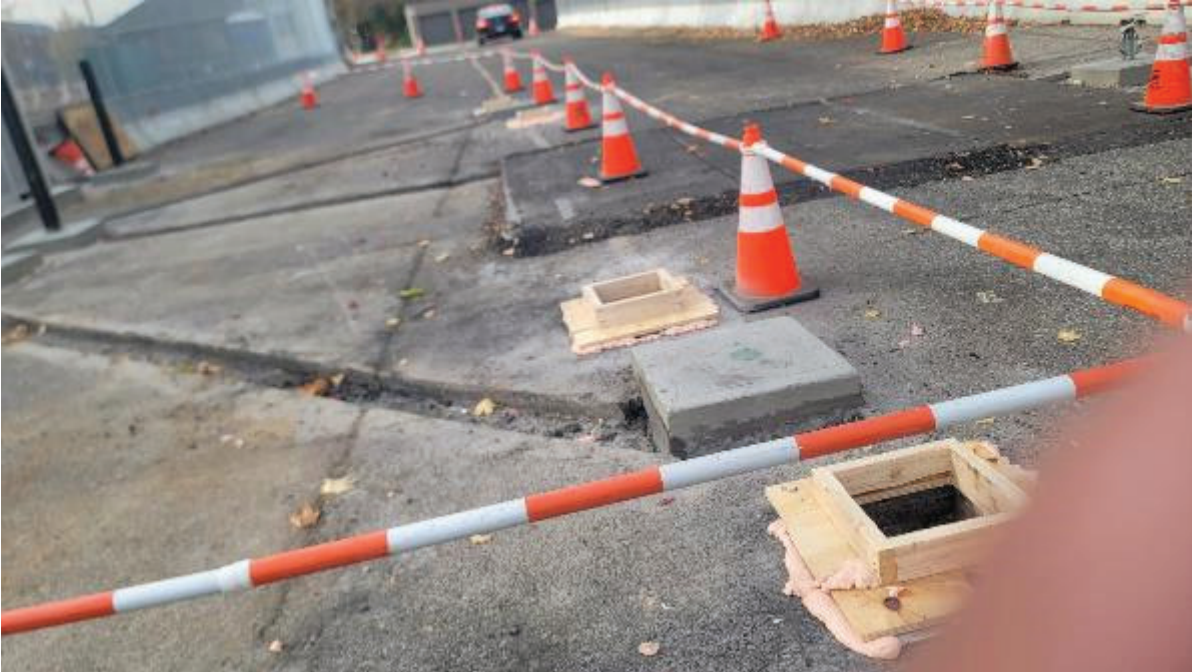
Friday 15 th Wooden frames for future grouting