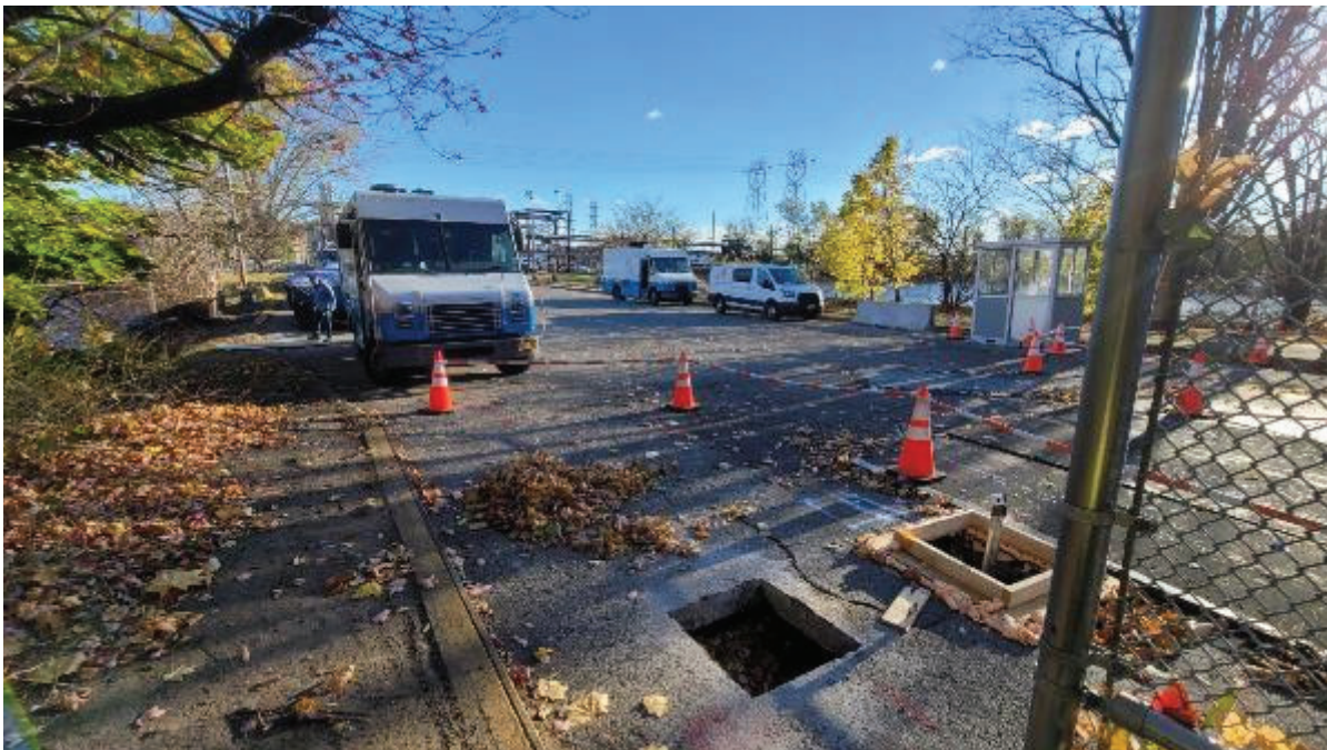
Tuesday 12 th Start of day