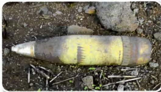
Example of a large caliber munition

Because explosive hazards associated with military munitions from past military activities may remain on the Coastal Battery & Sm Arms Ranges - Land, the U.S. Army Corps of Engineers recommends that the landowner and visitors follow the 3Rs of Explosives Safety - Recognize, Retreat and Report.