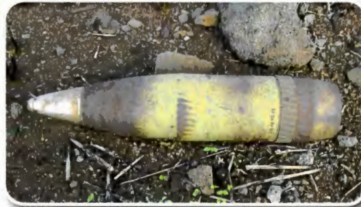
Example of a large caliber munition

Because explosive hazards associated with military munitions from past military activities may remain in the waters of the Coastal Battery & Sm Arms Ranges - Water, the U.S. Army Corps of Engineers recommends that waterbody managers and visitors follow the 3Rs of Explosives Safety - Recognize, Retreat and Report.