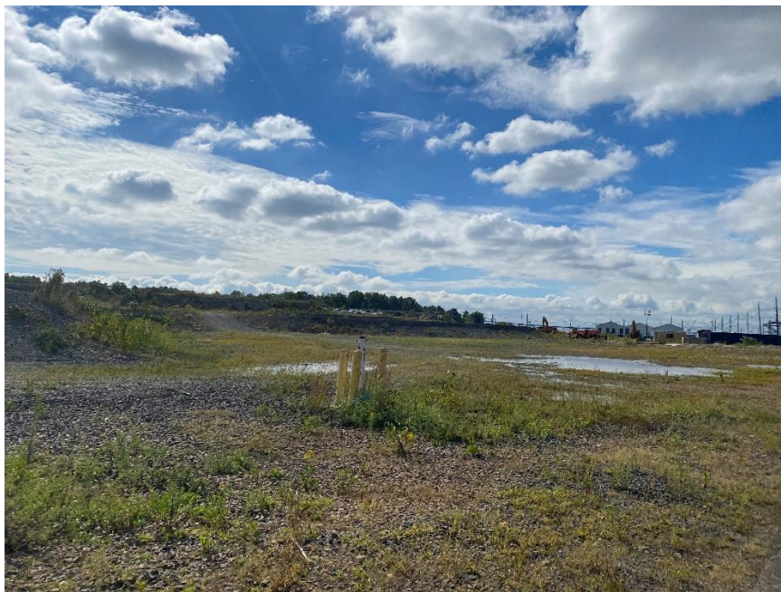
Photo 2: View of site conditions in ICM 1 Central Area, facing southeast.