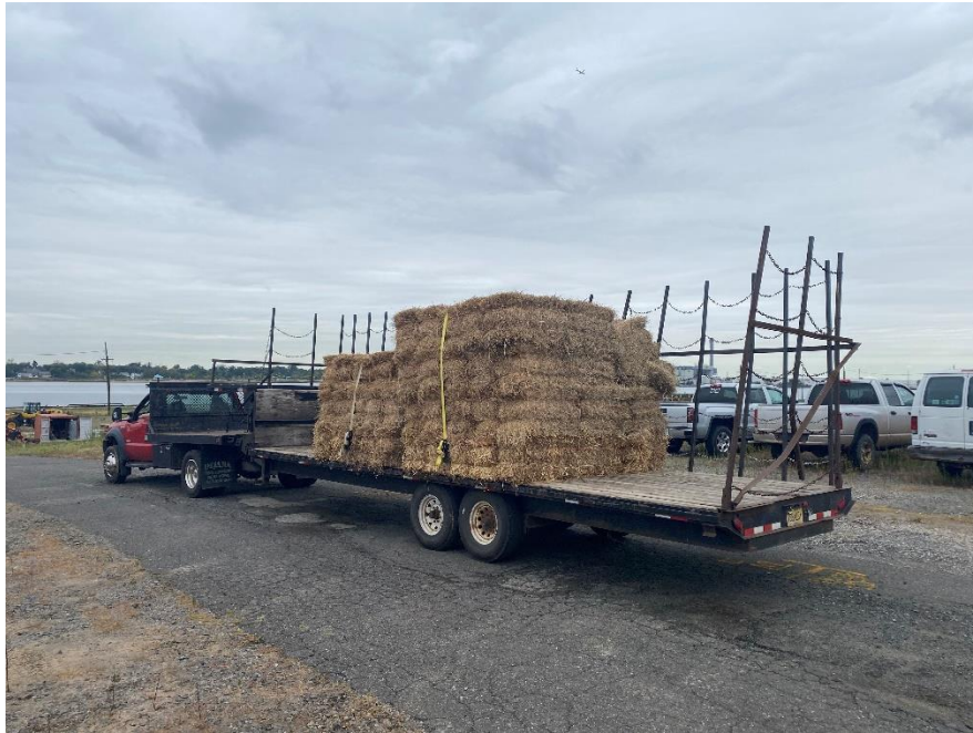
Photo 1: View of Entact E&S control delivery in the IRM 1 Central Area, facing west.