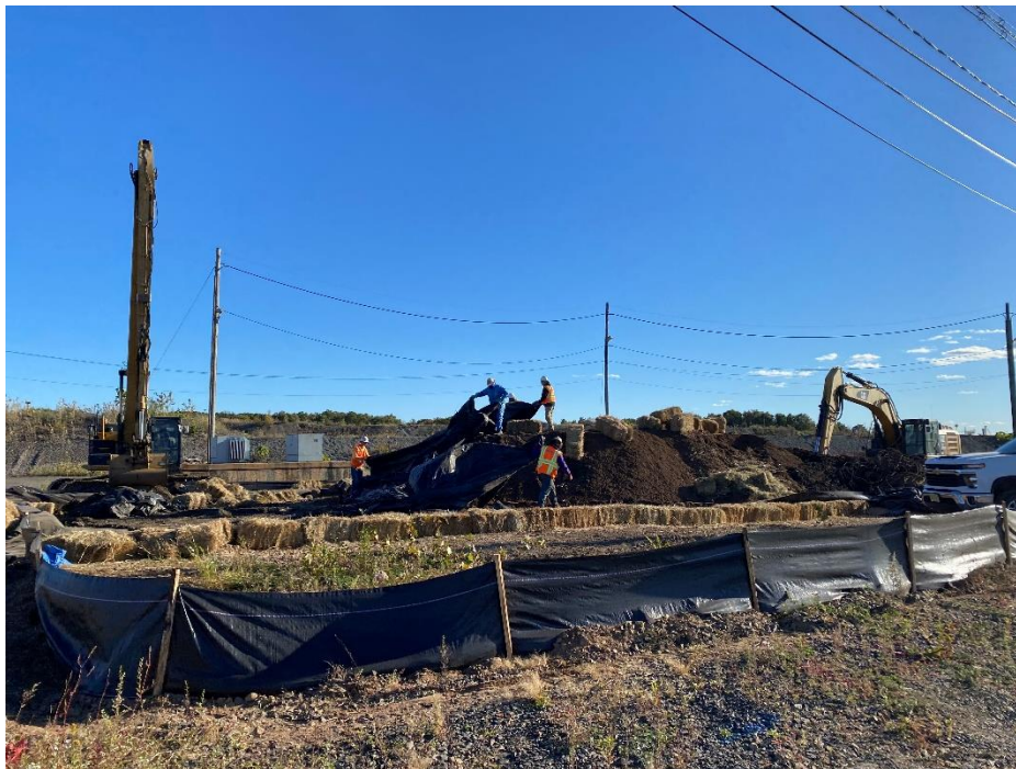
Photo 2: View of excavated soil stockpile containment and tarp covering at the end of the work shift, IRM 1 Eastern Area, facing east.