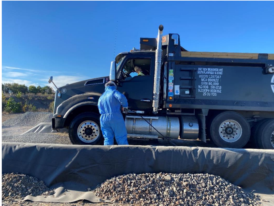
Photo 1: View of truck washing activities in IRM 1 Central Area, facing south.