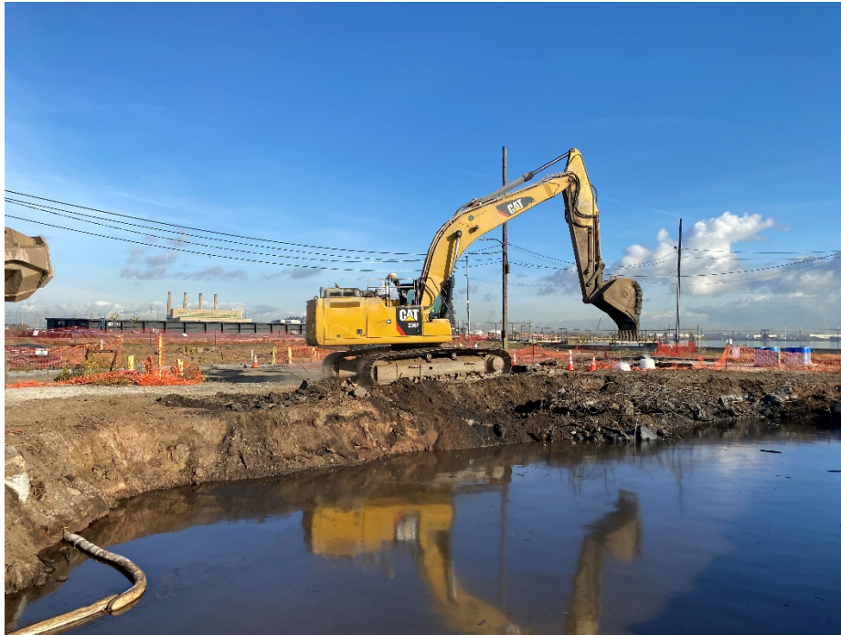
Photo 1: View of excavation activities in Excavation 1, IRM 1 Western Area, facing southeast.