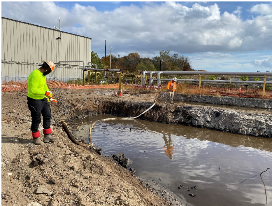
Photo 2: View of LNAPL collection using absorbent sock in Excavation 5, IRM 1 Eastern Area, facing northeast.