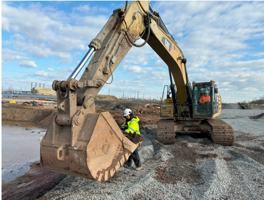
Photo 3: View of shaker testing at Excavation 11, IRM 1 Central Area, facing northeast.