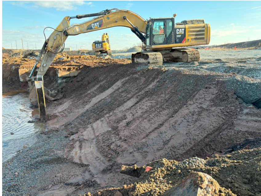
Photo 1: View of east sidewall at Excavation 11, IRM 1 Central Area, facing north.