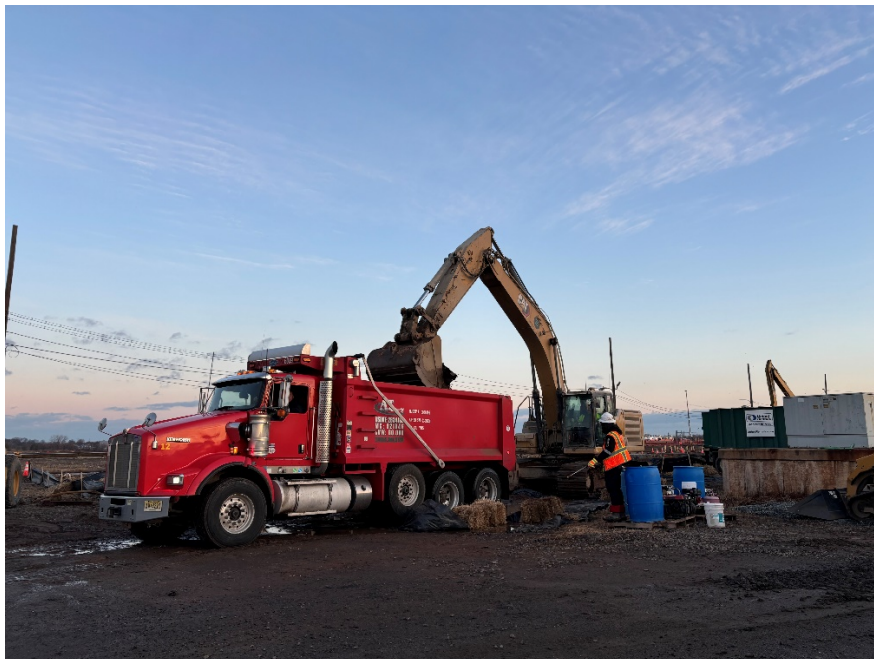
Photo 4: View of truck loadouts, IRM 1 Eastern Area, facing north.