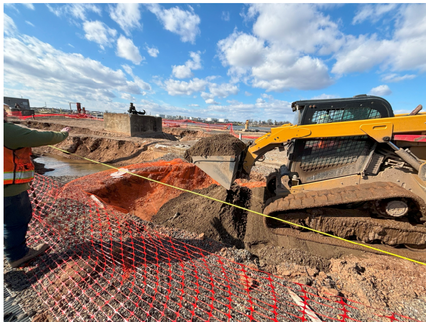
Photo 2: View of demarcation layer and backfilling at Excavation 3, IRM 1 Western Area, facing west.