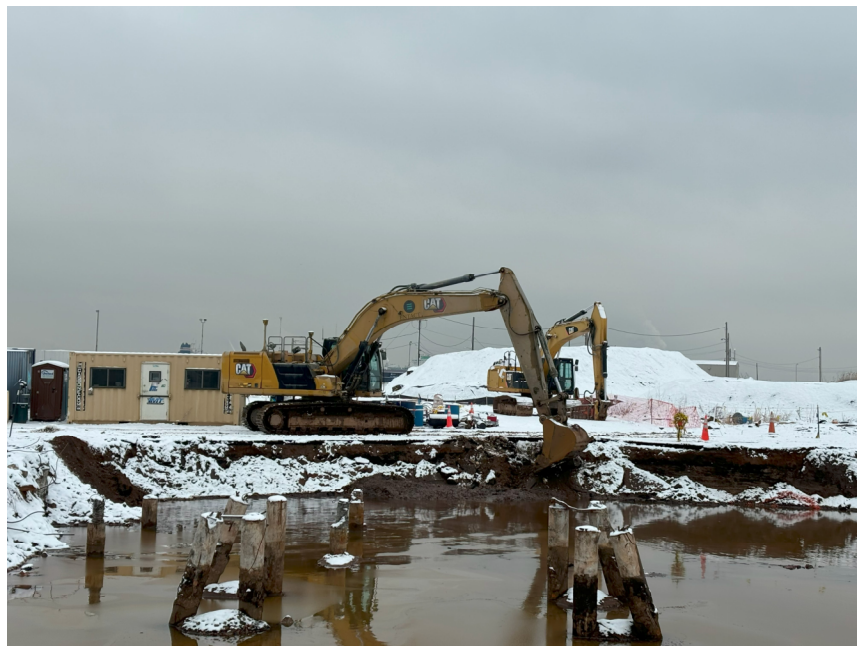
Photo 2: View of expansion of Excavation 11, IRM 1 Central Area, facing north.