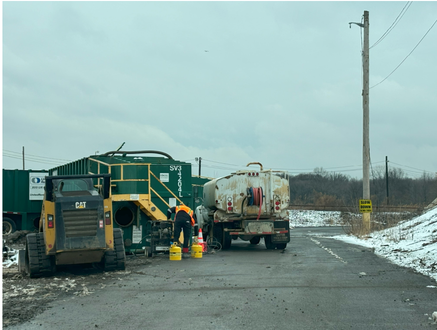
Photo 3: Cleaning of frac tanks for demobilization, IRM 1 Central Area, facing north