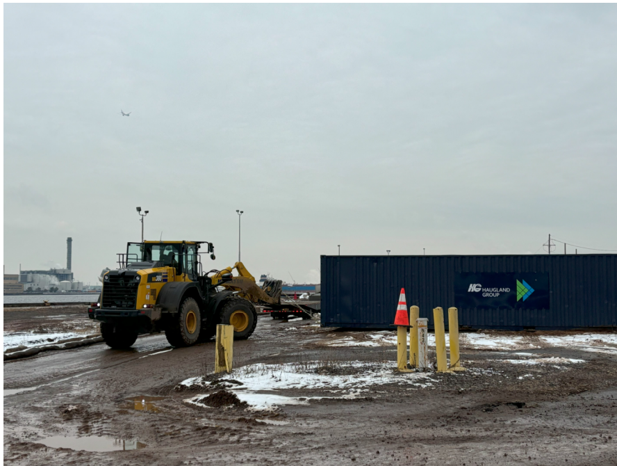
Photo 4: View of Entact assisting Haugland in moving staging area for Excavation 11 expansion, IRM 1 Central Area, facing northwest.