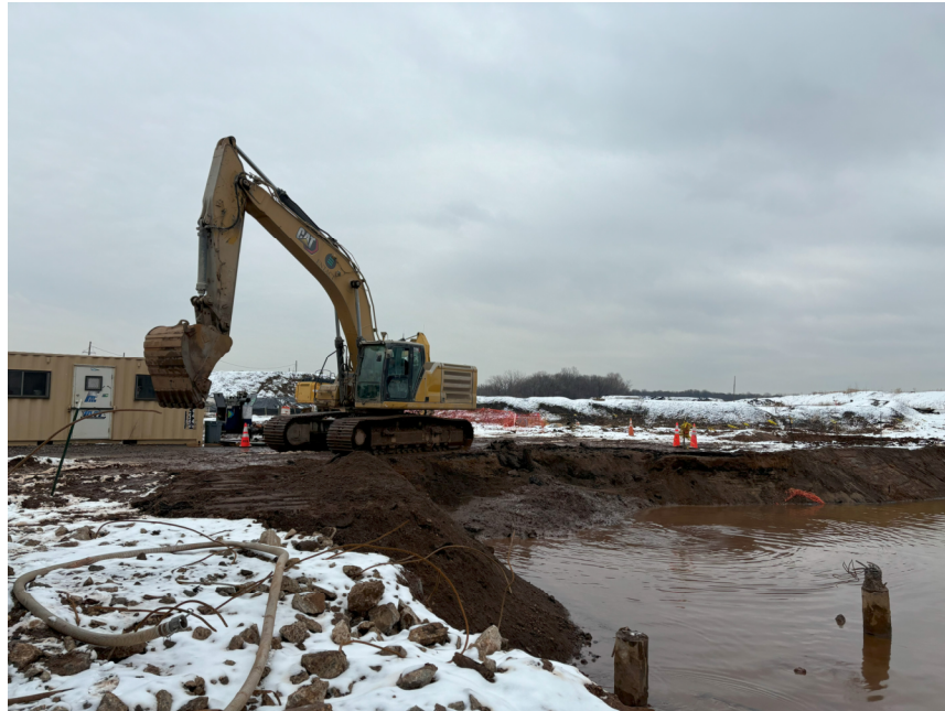
Photo 1: View of expansion of Excavation 11, IRM 1 Central Area, facing north.