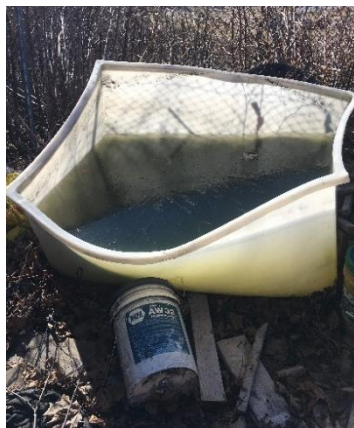
Figure 13: Container filled with fluid.