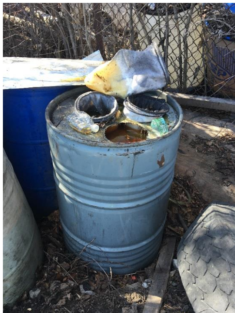
Figure 3: Location of Aqueous Sample D-1. Drum filled with some type of hydraulic oil.