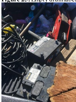
Figure 27: Car batteries.