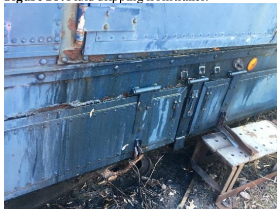
Figure 20: Additional area of trailer displaying fluid loss.