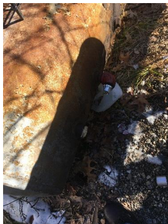
Figure 29: Fuel tank containing product, elevated PID reading.