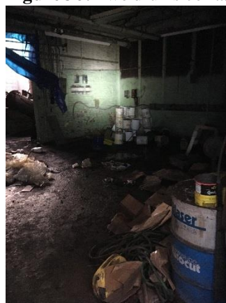
Figure 38: Various five-gallon buckets.