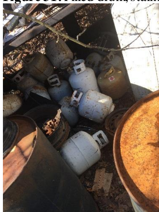
Figure 33: Propane tanks.