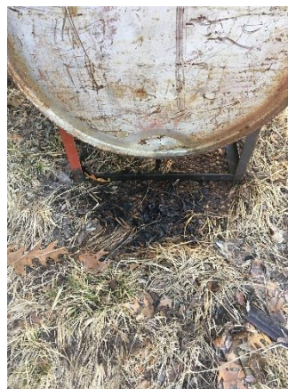
Figure 32: Staining observed on ground.