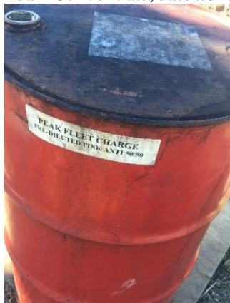
Figure 25: Empty drum labeled diluted anti-freeze.