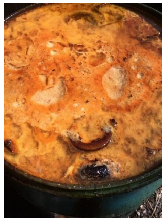
Figure 22: Top of filled drum.