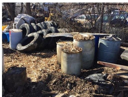
Figure 6: Location of Soil Sample S-1; filled drums.