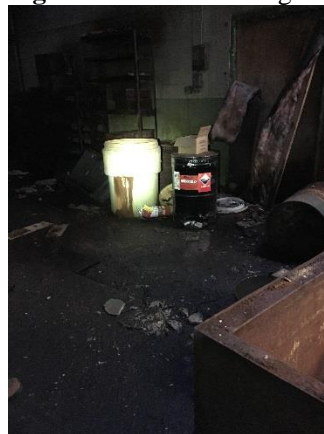
Figure 40: Drum labeled SteelKote.