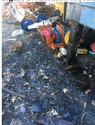
Figure 19: Product on ground surface.