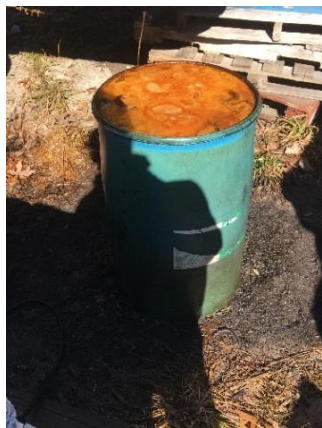
Figure 21: Location of Aqueous Sample D-2; filled drum.