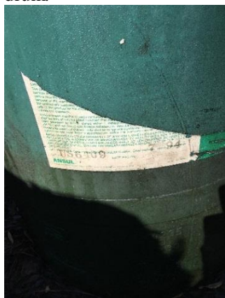
Figure 23: Full drum labeled: ANSUL SILV-EX Foam Concentrate, date 7/94.