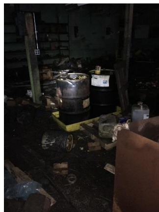
Figure 36: Two drums containing fluid.