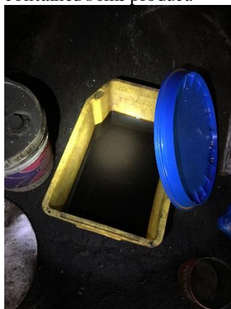
Figure 43: Bucket filled with black fluid.