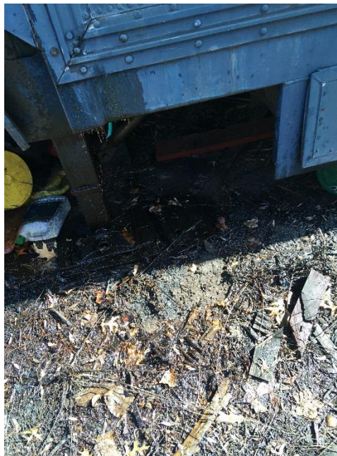
Figure 2: Location of Soil Sample S-2. Product appeared to be dripping from trailer. Product on ground surface was white gelatinous substance.