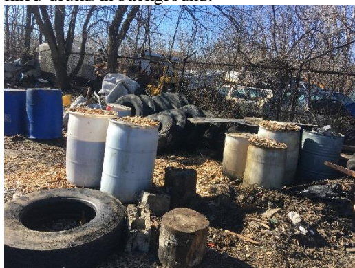
Figure 9: Filled drums, tires, and debris.