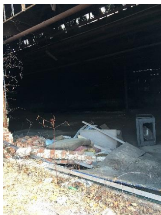
Figure 35: Heat Treatment Building.