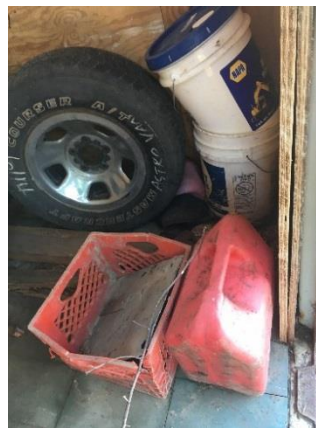
Figure 14: Tipped over gas can.