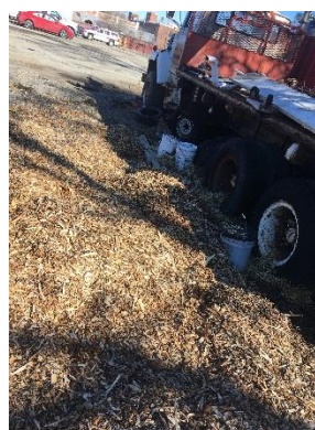
Figure 10: Woodchips.