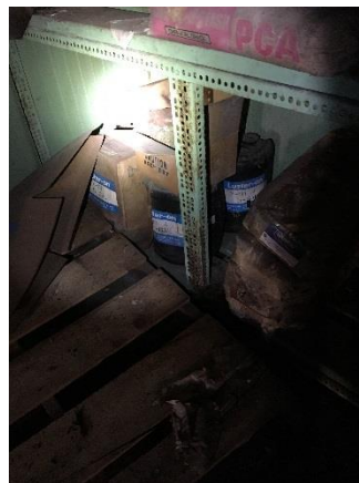
Figure 42: Full containers label Luster-on Z-30 and Z-31W