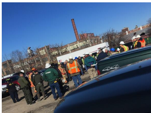
Figure 5: Pre-investigation meeting.

Images taken on the southern portion of the site.