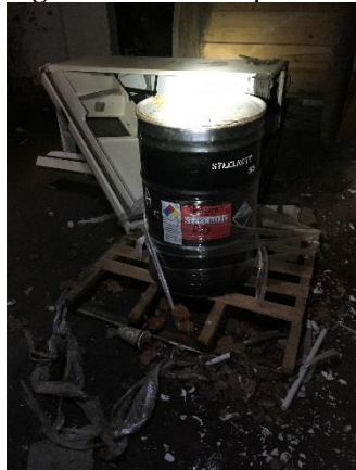
Figure 39: Drum labeled SteelKote.