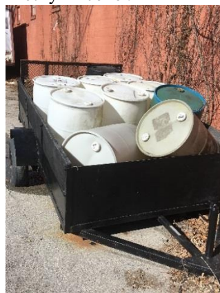
Figure 26: Empty drums.