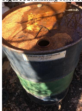
Figure 34: Empty anti-freeze drum.