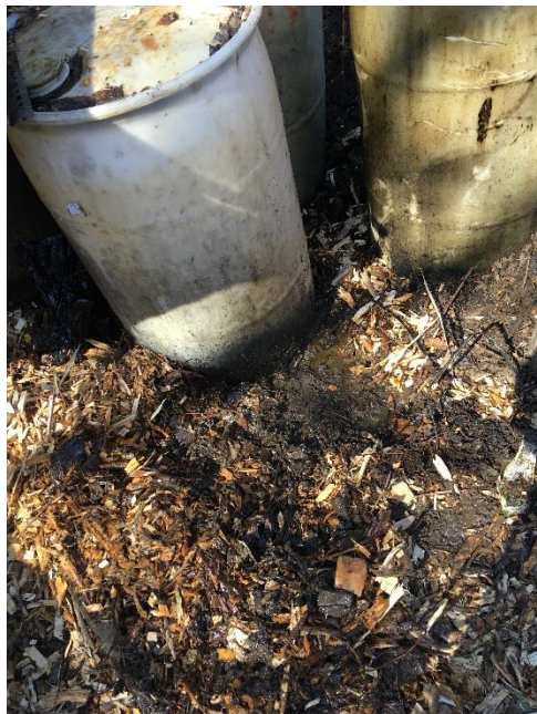
Figure 1: Location of Soil Sample S-1. Top layer of wood chips was removed and the sample was collected from the top layer of soil. Fluid within the soil appeared viscous.