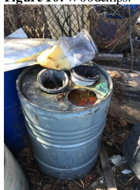
Figure 12: Location of Aqueous Sample D-1.