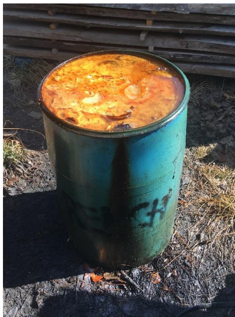
Figure 4: Location of Aqueous Sample D-2. Drum had pungent odor, much like a paint thinner. Cap on drum was not secured. Product that had overflowed and could be seen surrounding drum.