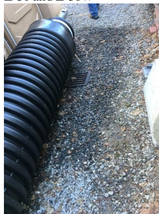
Figure 44: Staining around drain.