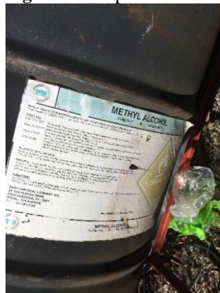
Figure 24: Empty drum labeled Methyl Alcohol.