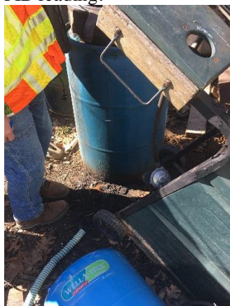
Figure 31: Filled drum, staining on ground.