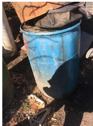
Figure 30: Filled drum, staining on ground.