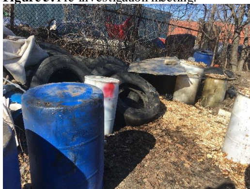
Figure 7: Oil saturated woodchips on ground and filled drums in background.