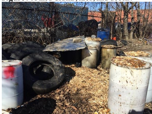
Figure 11: View of filled drums.