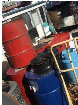
Figure 28: Empty drums, various labels.