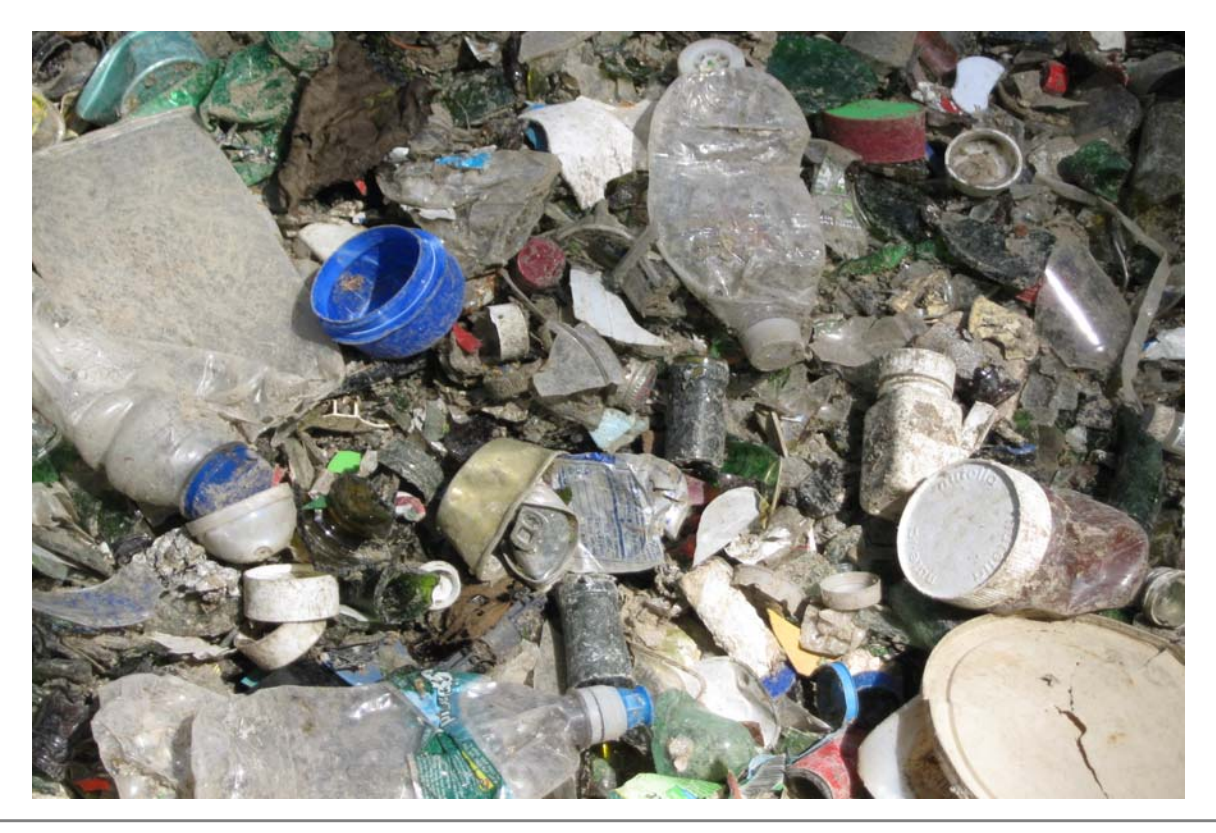
Plate \ 3: \quad Example \ of \ waste \ pile \ material-Little \ Falls \ Pond \ property.