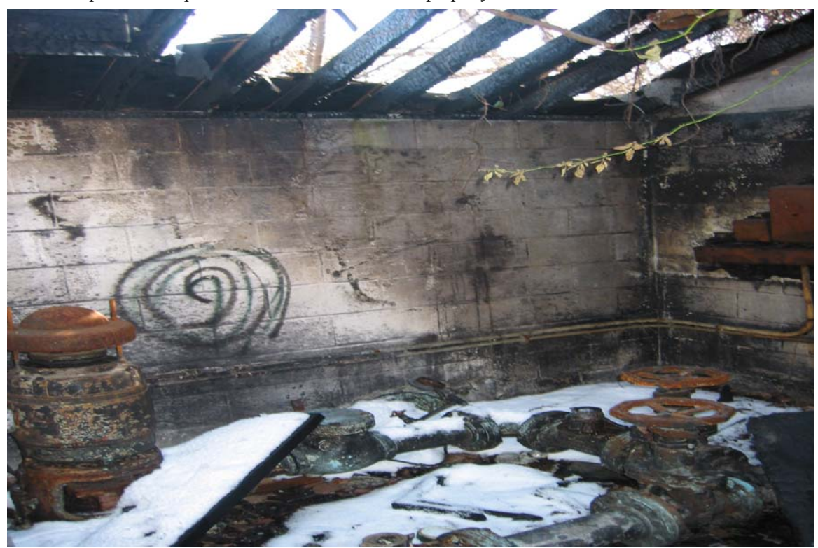
Plate 4 Condition of Former Town Pumping Well Building #1.