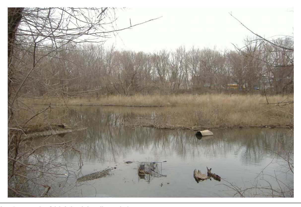
Plate 6: Example of debris in Little Falls Pond #2.