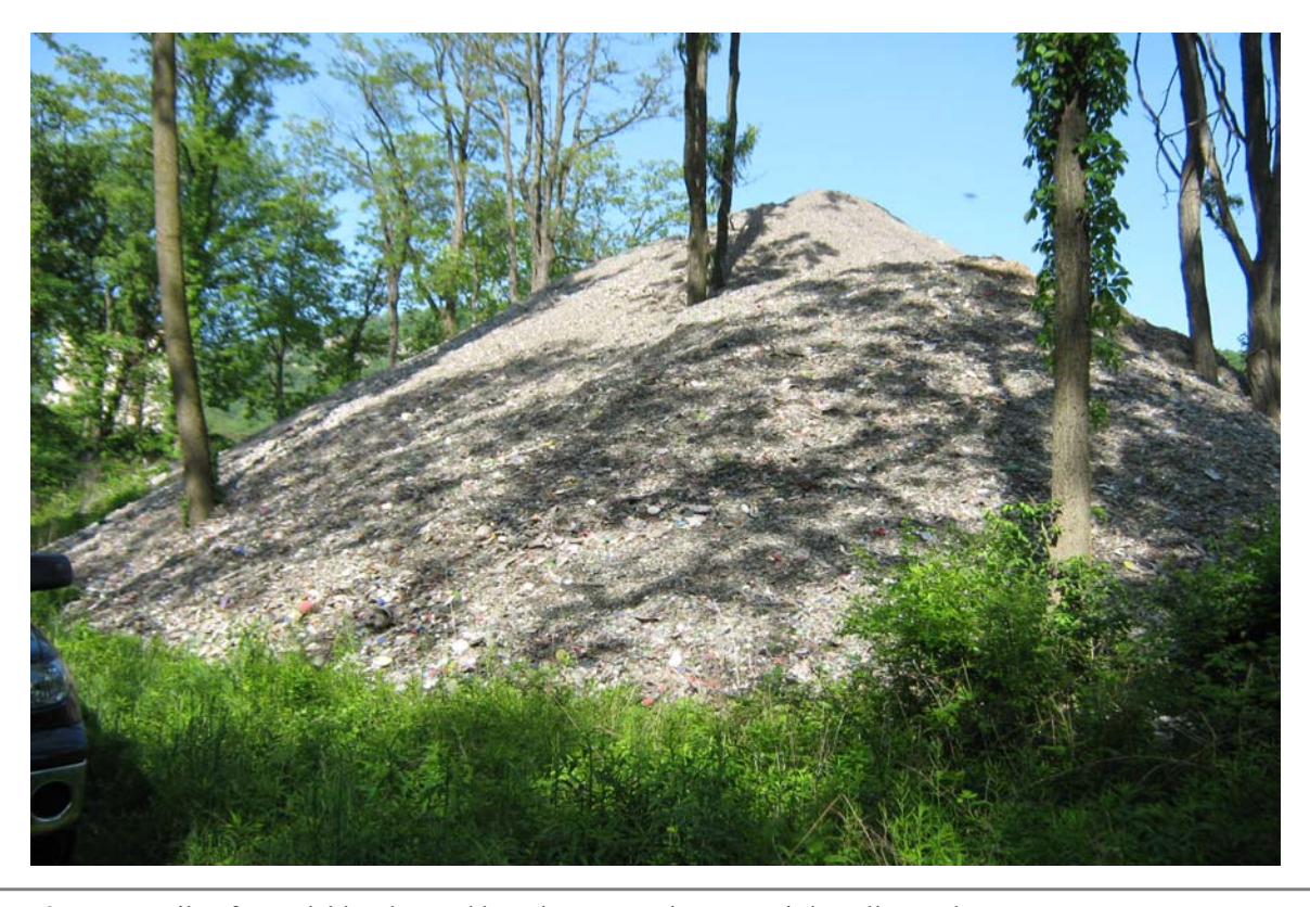
Plate 2: Waste pile of recyclables dumped by others around trees – Little Falls Pond Property