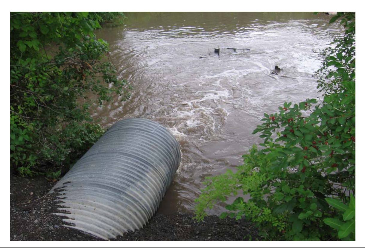
Plate 5: Culvert discharging into Little Falls Pond #2- shows waste refuse.