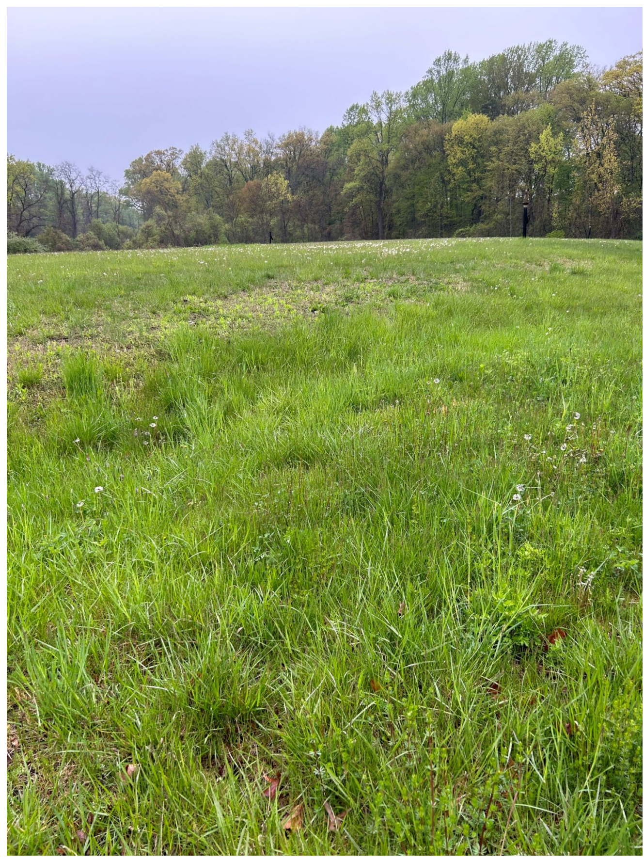
Photo 9: Grass on landfill cap cut to correct height (looking northeast).