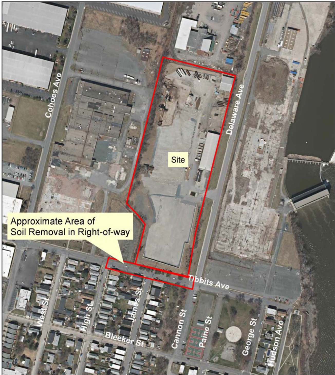
Figure 1 Site Location Map

R. Freedman & Son - Site No. 401033 Tibbits Avenue Village of Green Island, NY