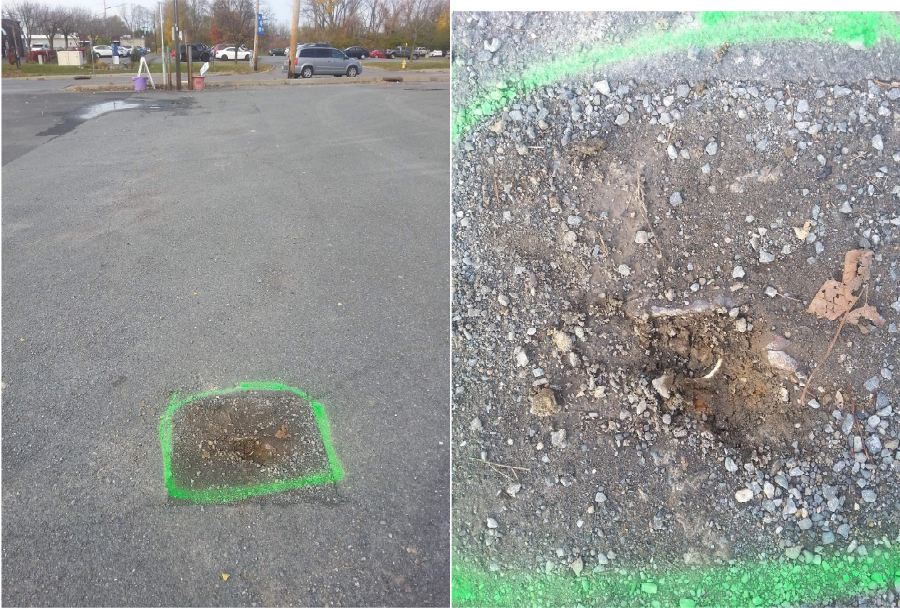
Photo 4: MW-04, looking north (left photo) and east (right photo). Road box and protective cap is missing. Close-up photo shows riser fully blocked with gravel and soil. CDM Smith recommends abandoning the existing well and installation of a replacement MW-04.