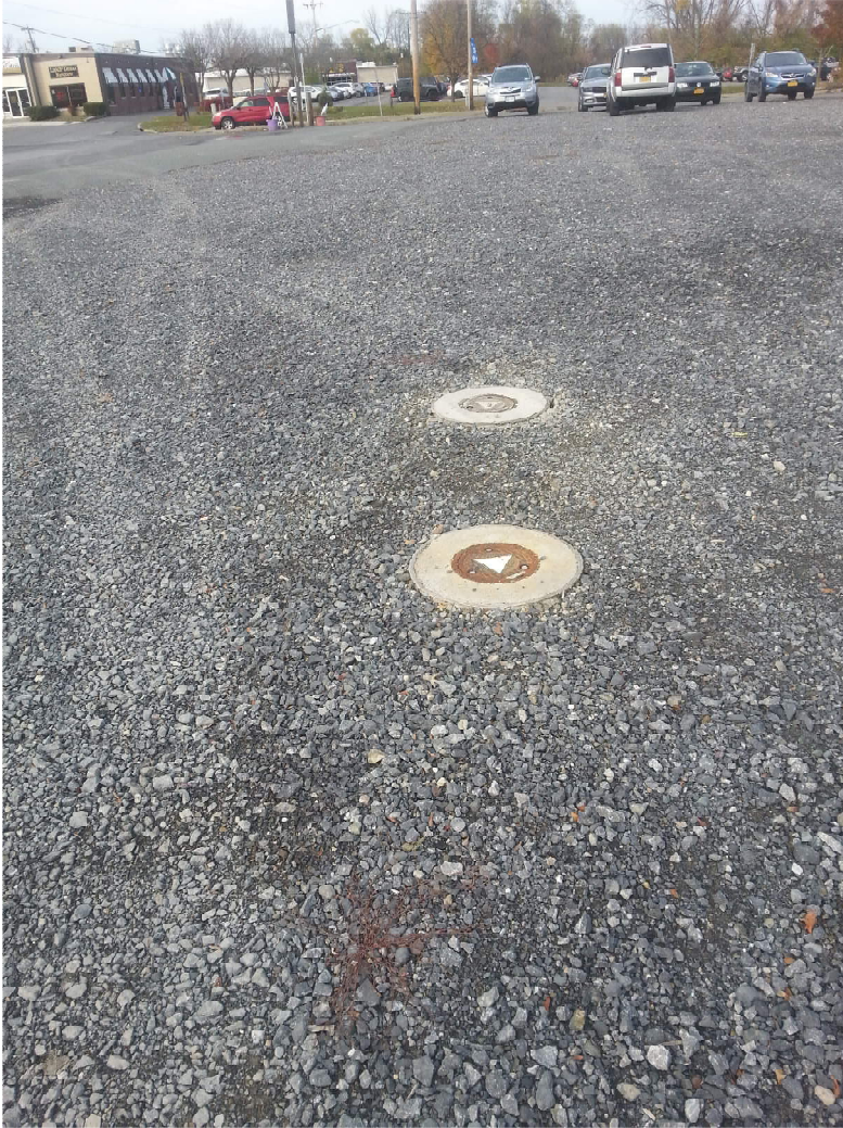
Photo 2: MW-2R and MW-2DR, looking north. Wells and road boxes do not require repairs.