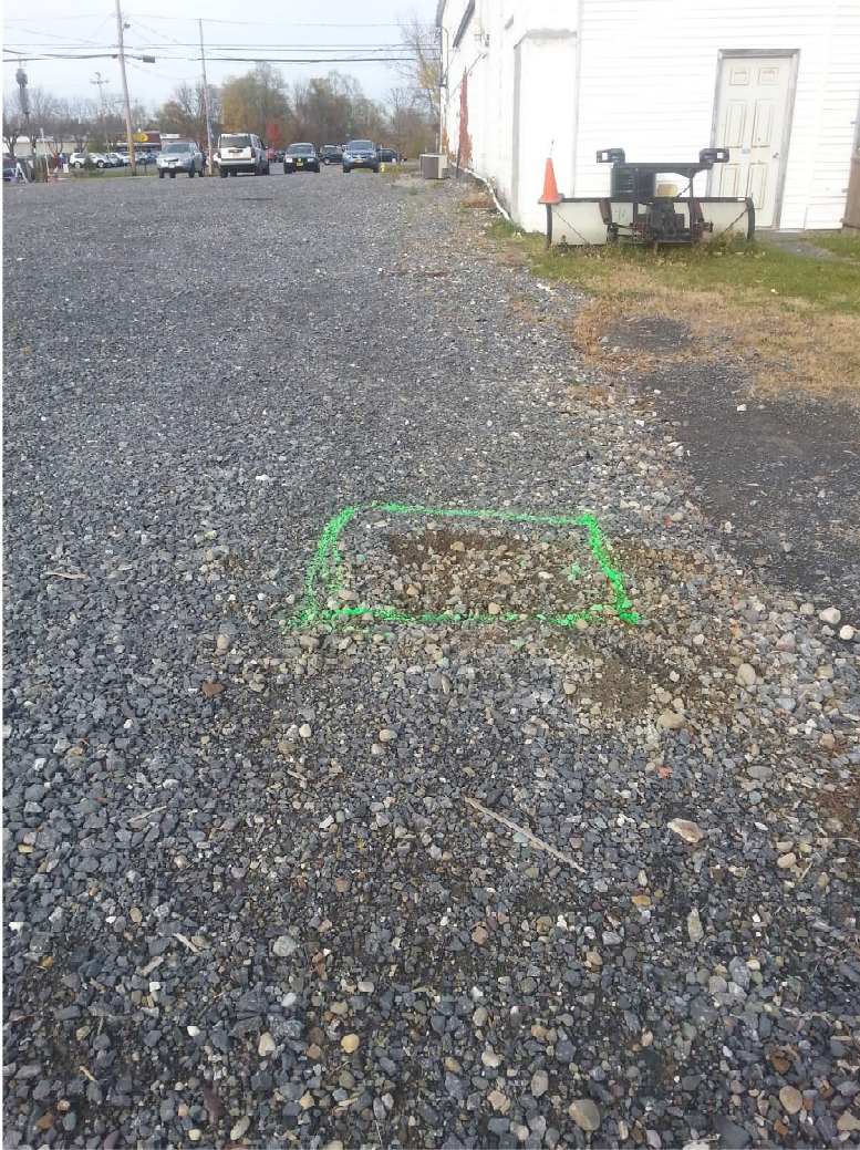
Photo 3: MW-03, looking north. Rough location was determined using measurements (shown in Site Map) and then pinpointed using metal detector. CDM Smith recommends removal of crushed stone and installation of a 12-inch riser and new road box to properly access MW-03.