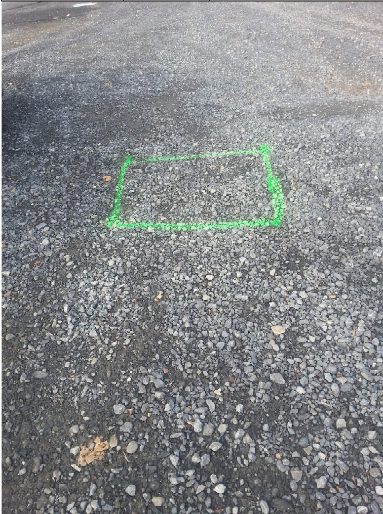
Photo 1: MW-01, looking north towards Delaware Avenue. Rough location was determined using measurements (shown in Site Map) and then pinpointed using metal detector. CDM Smith recommends removal of crushed stone and installation of a 12-inch riser and new road box to properly access MW-01.