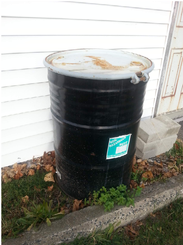
Photo 7: Non-Haz drum, located on southwest corner of Healthy Pet Center. Drum appears sound, no obvious leakage or buckling observed. CDM Smith recommends transport & disposal of drum.