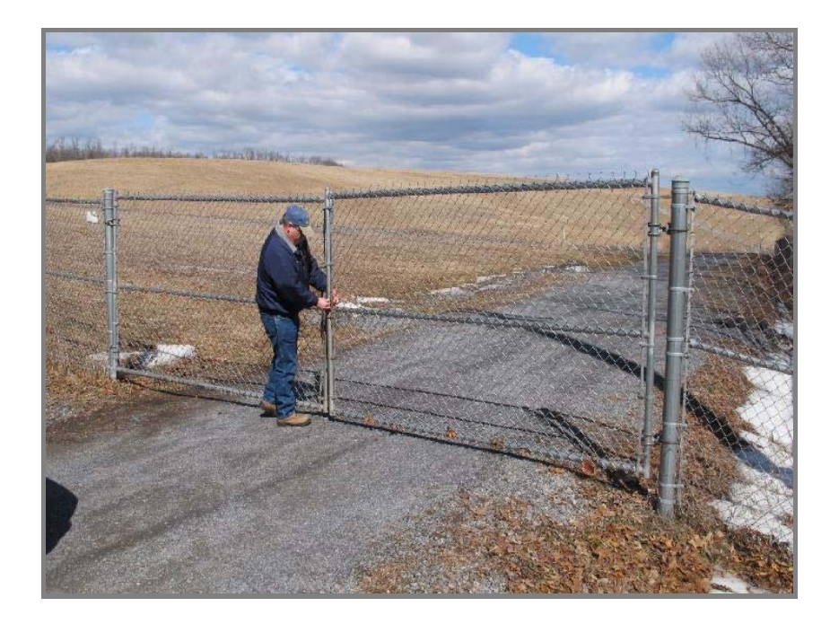
Payson at the gate