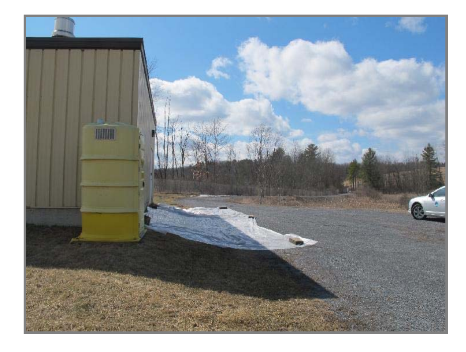
Back view of the equipment