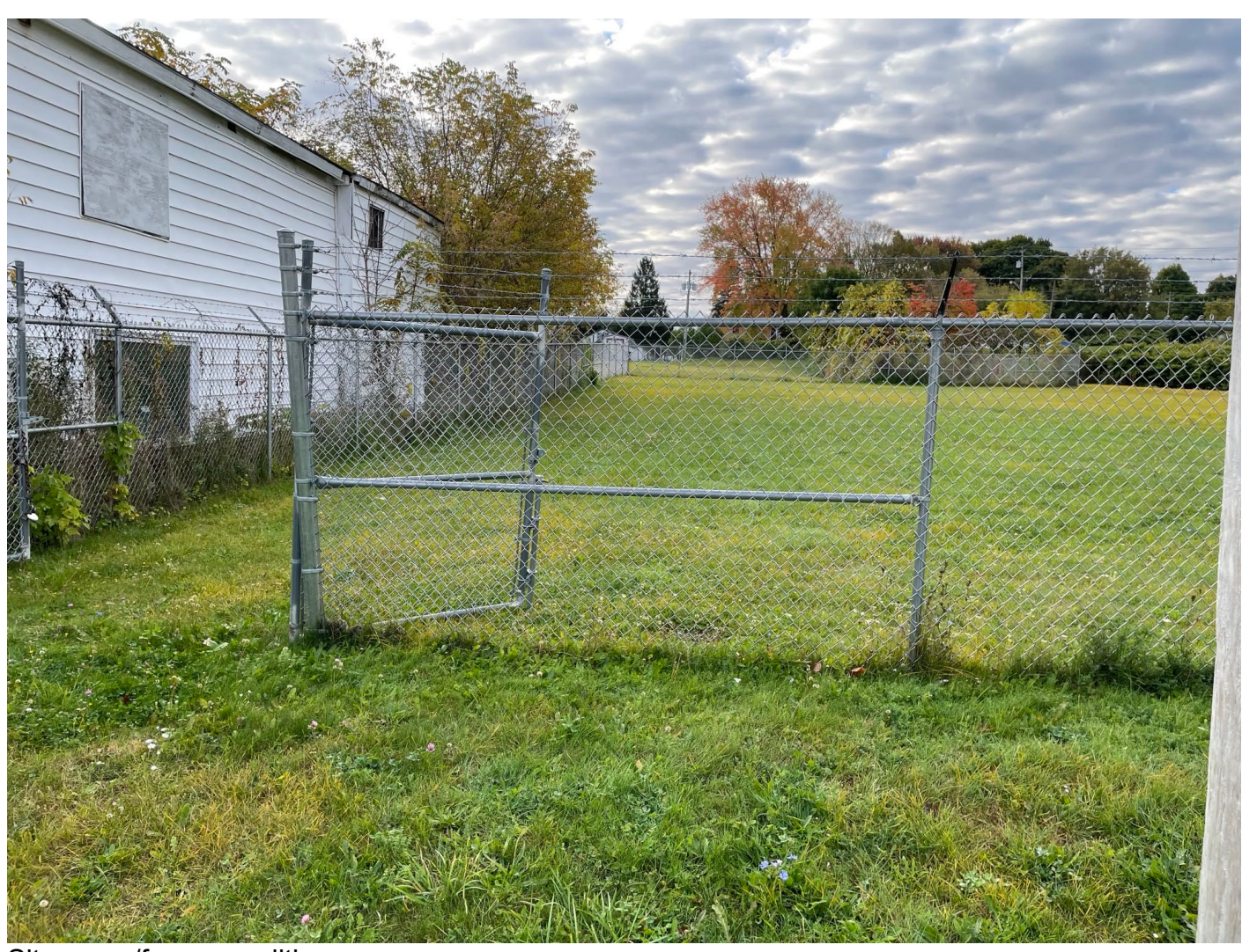
Site cover/fence conditions