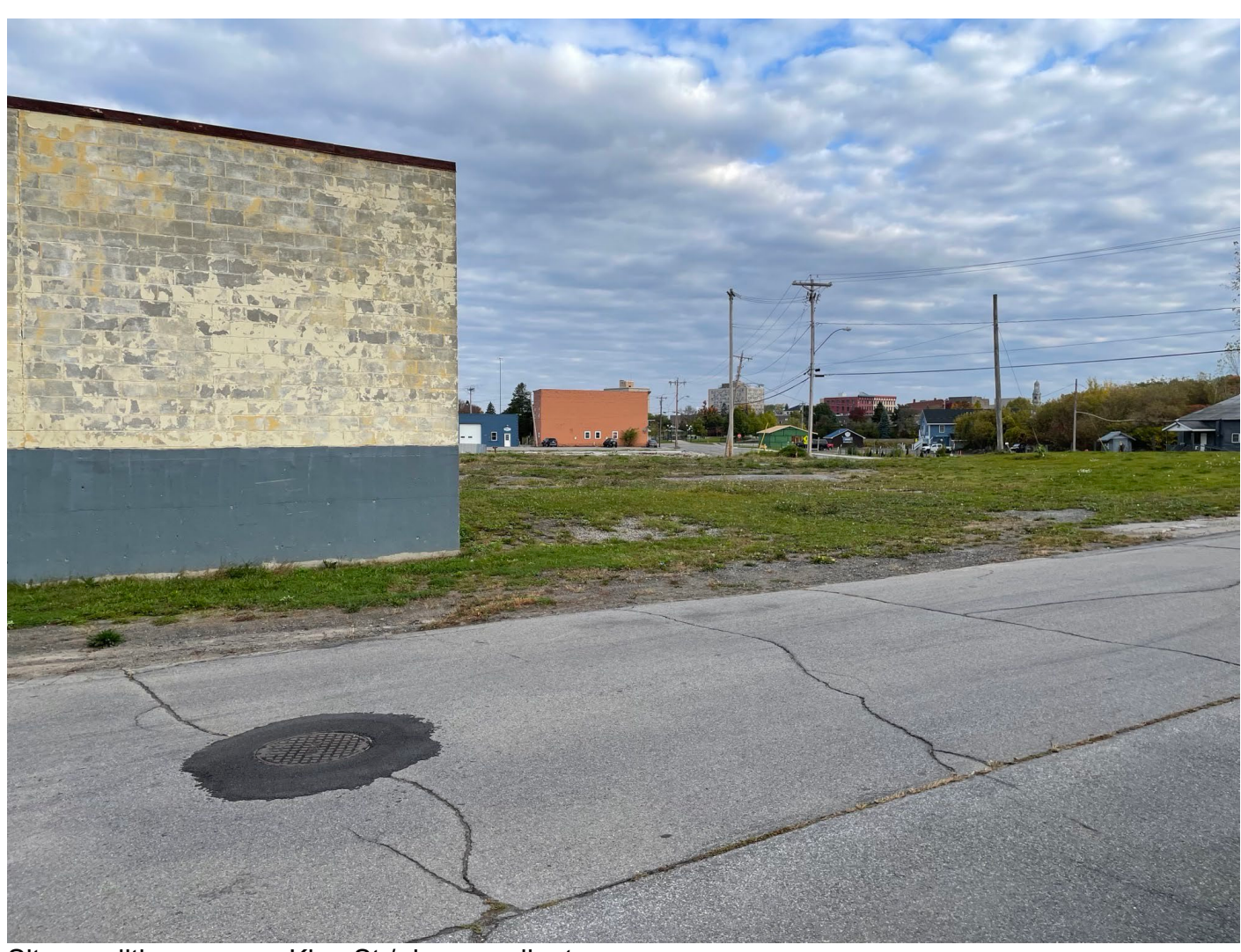
Site conditions across King St./ downgradient