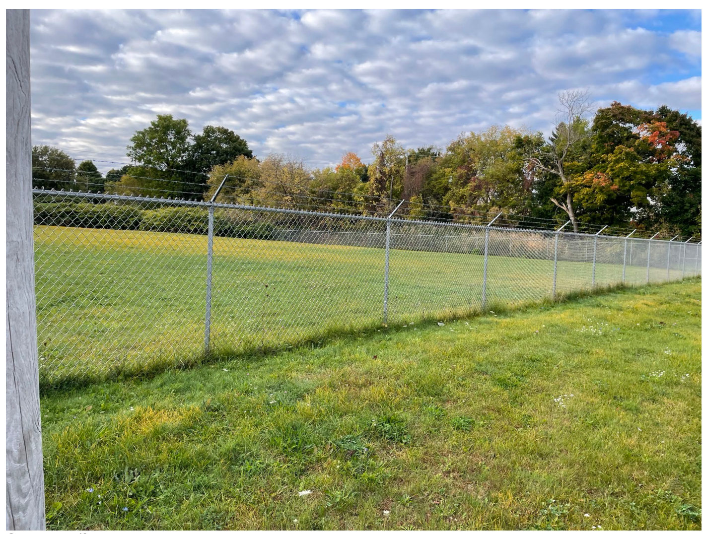
Site cover/fence conditions