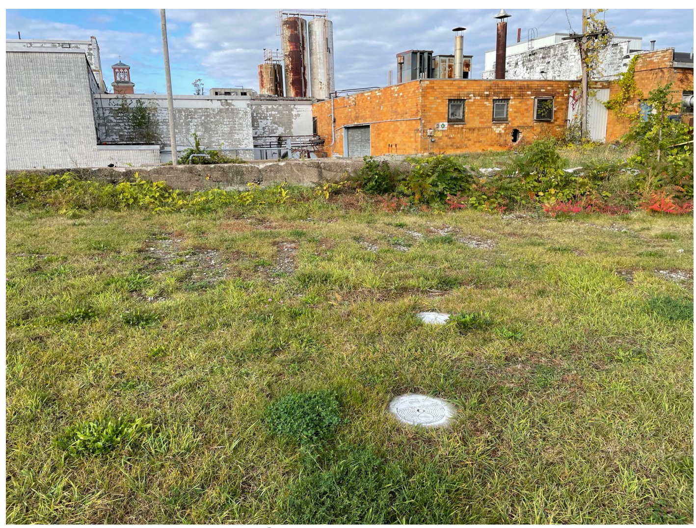
Monitoring wells MW15 and MW 15RS