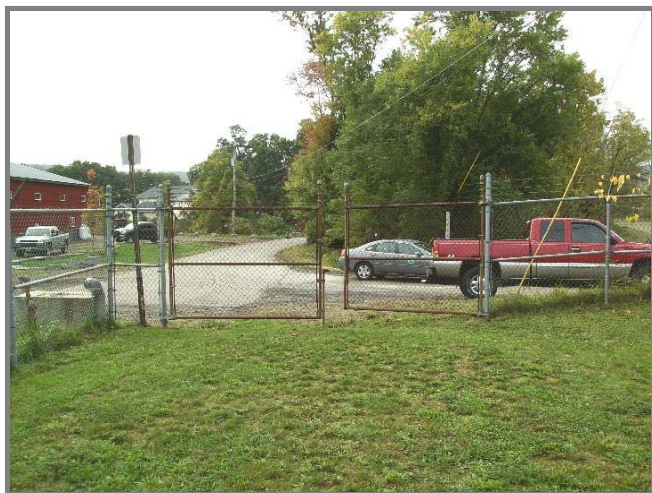
Front gate access