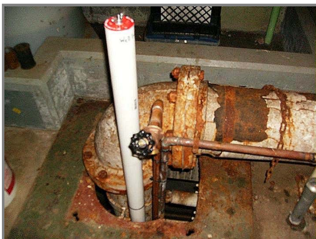
Well in the building.