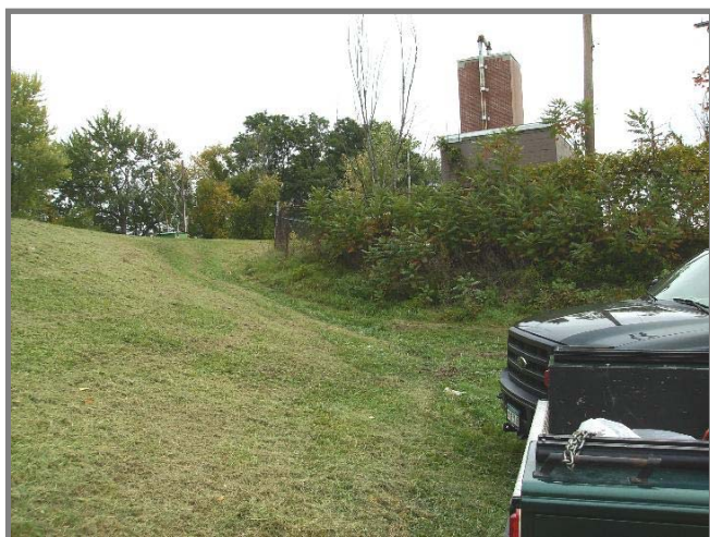
Access ramp would begin in the corner of the parking area here.