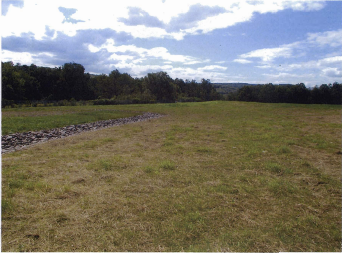
Repaired Settlement, picture taken on 8/26/10

In accordance with the NYSDEC approved Work Plan, Broome County successfully conducted landfill cap maintenance in the settlement area at the Colesville Landfill in August of 2010. On August 5, 2010 Broome County Landfill employees mobilized equipment to the site and installed silt fencing. From August 9 th through August 12 th the drainage channel was installed, the area around it was re-graded, then seeded and mulched. Heavy rain came through the area on August 23 rd and the site was checked on August 26 th . Everything was intact and there were no signs of erosion.