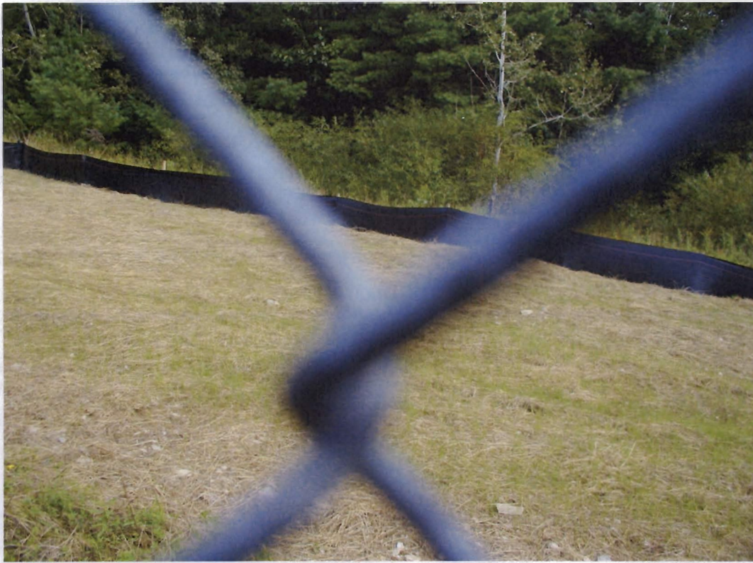
Haul road seeded and mulched, picture taken on 8/26/10

The following are pictures taken two weeks after the completion of work.