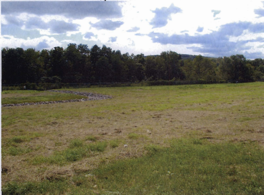
Ditch and graded area, pictured on 8/26/10