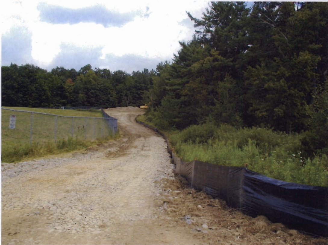
Temporary haul road to borrow area with silt fence