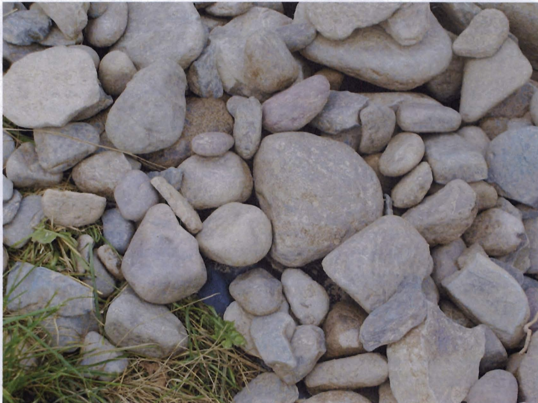
Rock over fabric in new ditch