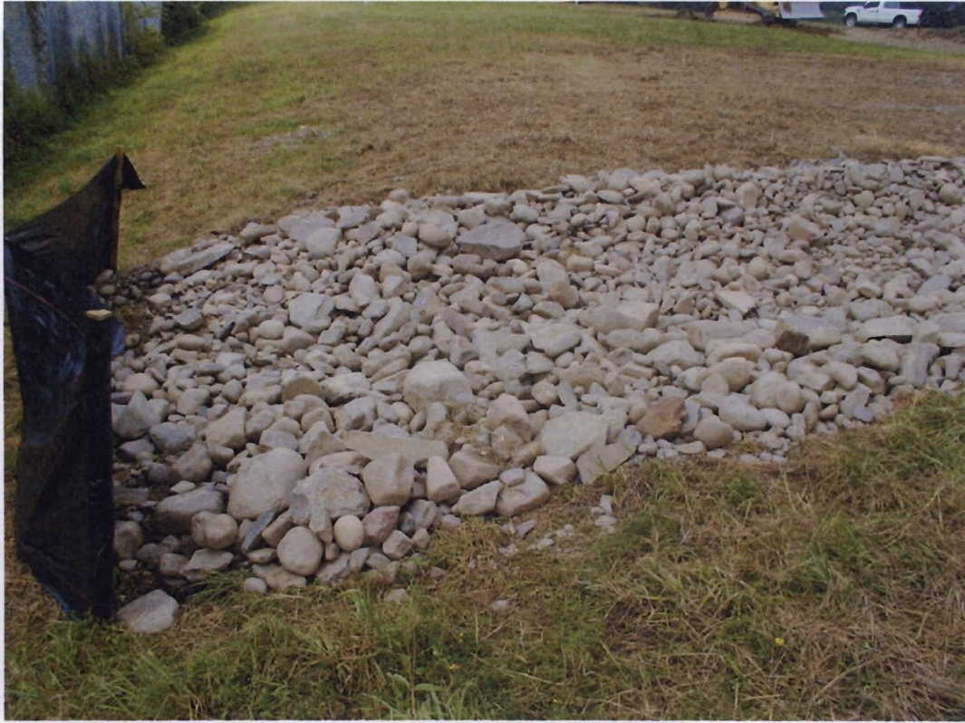
South End of Ditch