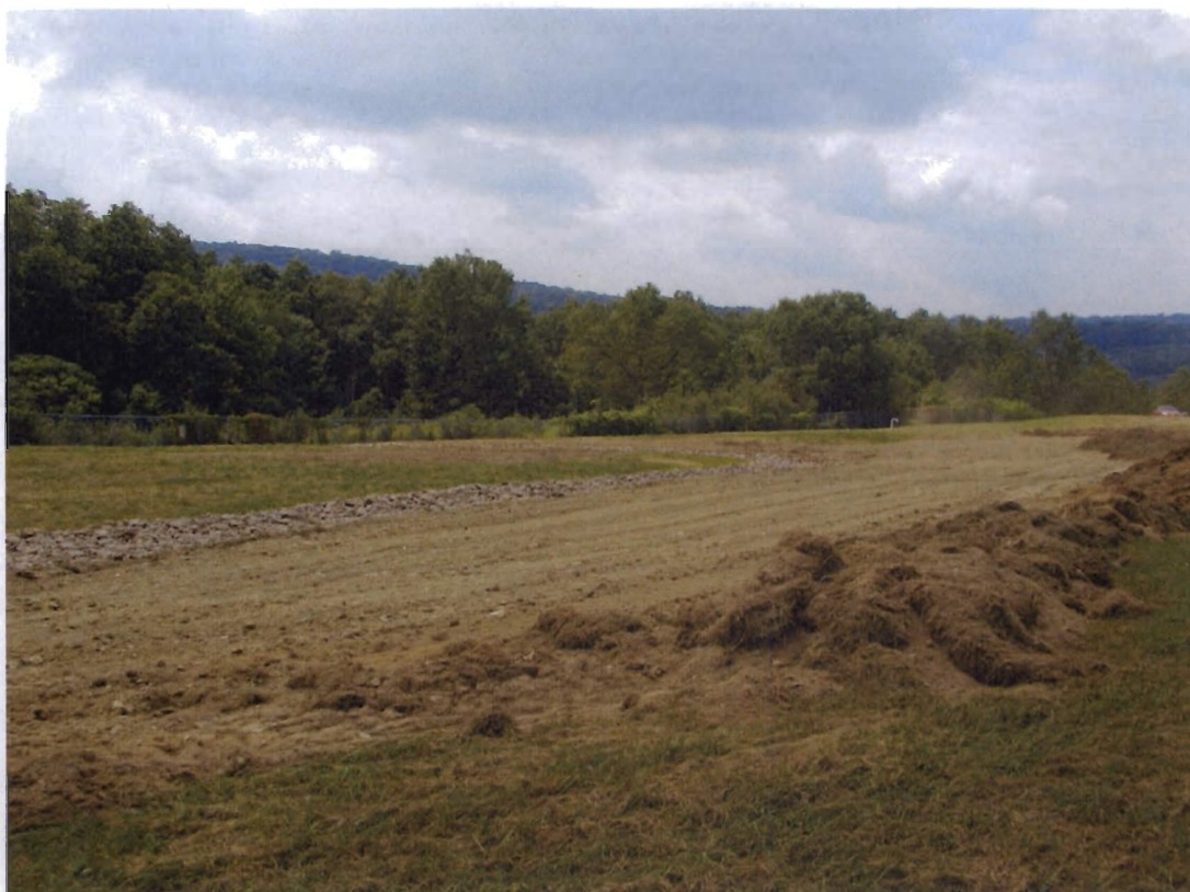
East end of drainage channel and grading in settlement area