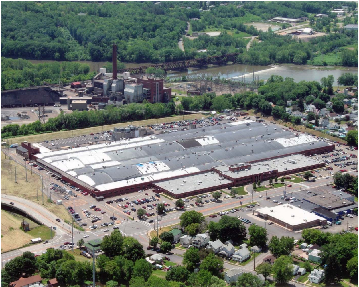
Appendix A: Site Location