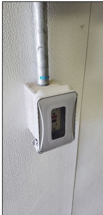
Description: Ground-fault circuit interrupter (GFCI) outlet.