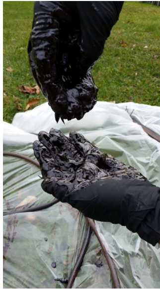
Figure 1 - NAPL From RW-09-07

NAPL recovery and monitoring will continue through the month of December.