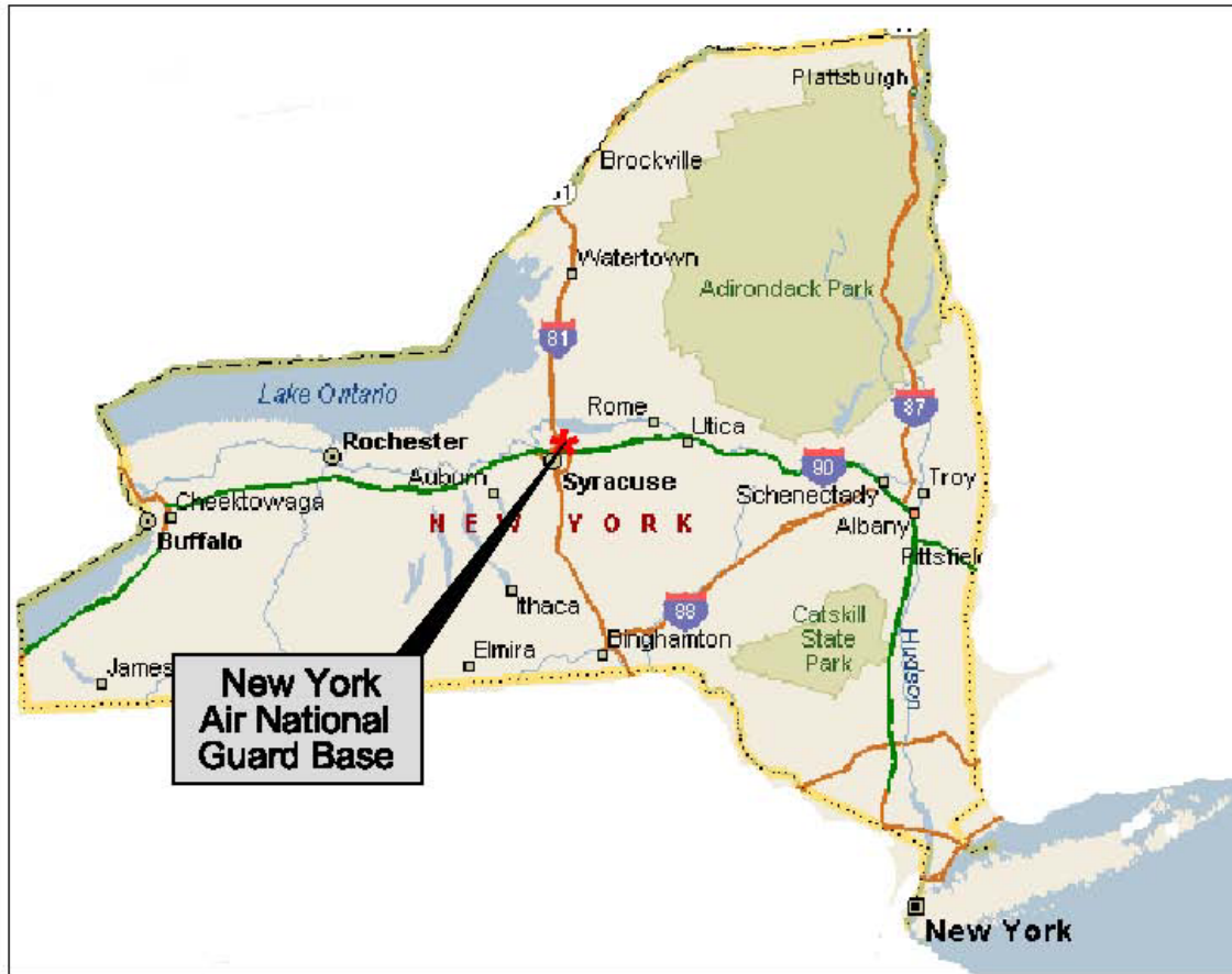
Figure 2. Location of the 174 th Fighter Wing within New York