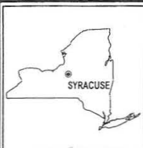
NEW YORK QUADRANGLE LOCATION