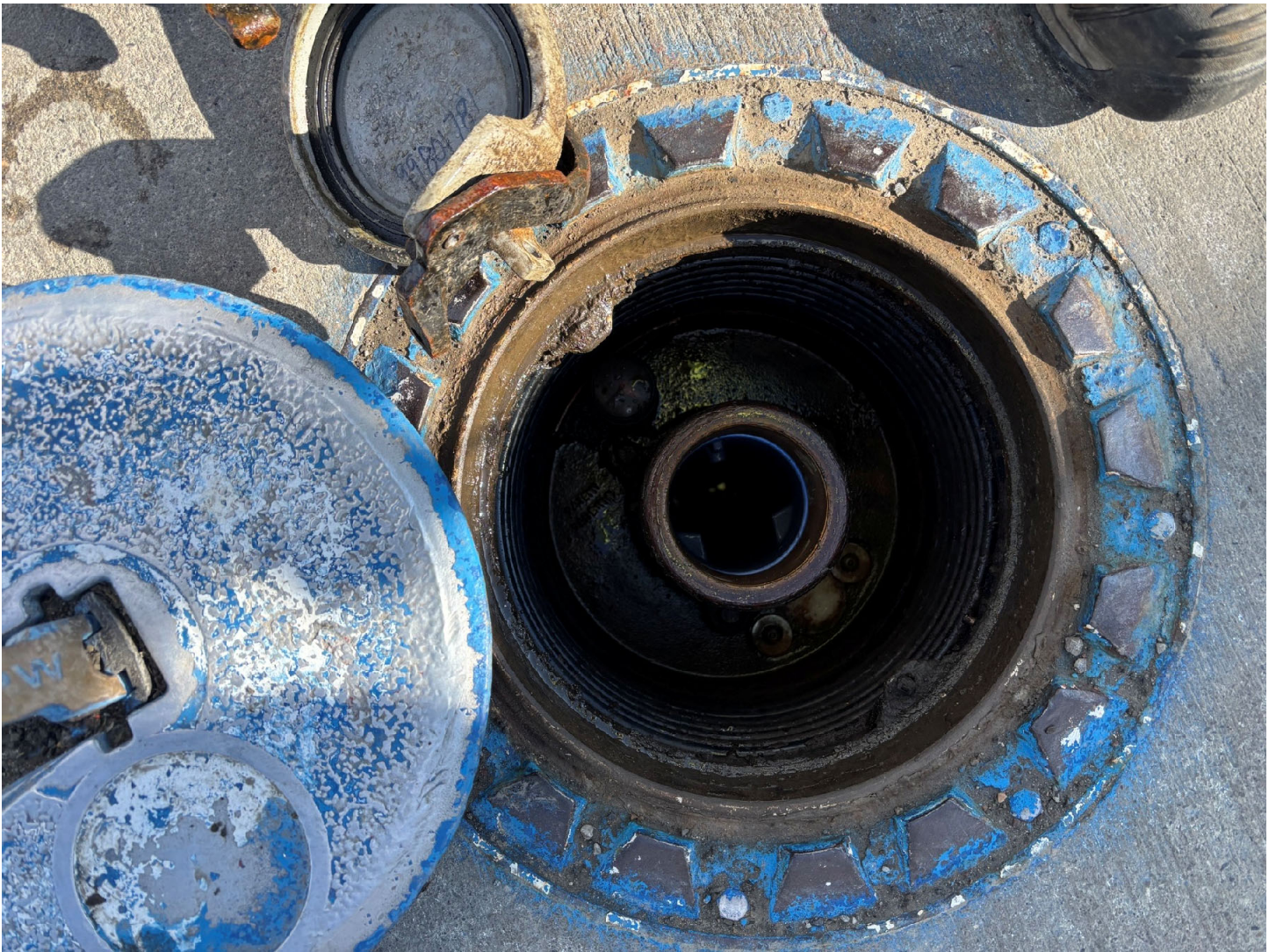
Tank 004B (7,000 gallon compartment storing 90 oct – ethanol free gasoline) – No tank ID tag at fill port.