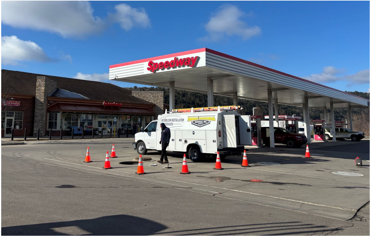
UST tank pad (Tanks 002, 003A/003B and 004A/004B) and dispensers 1-12.