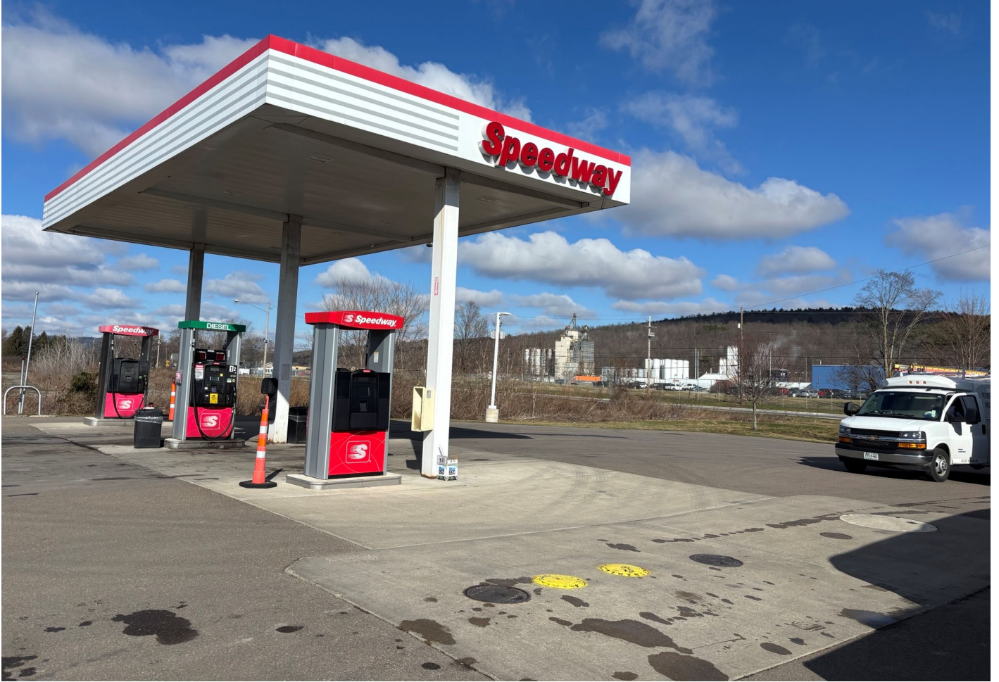
Diesel tank pad (tank ID# 001) tank pad and dispensers. Note: This tank has dual fill ports.