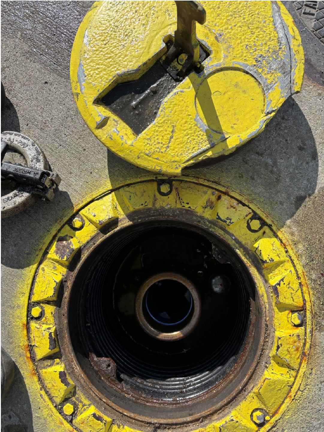
Tank 001 – Fill port with no tank ID tag.