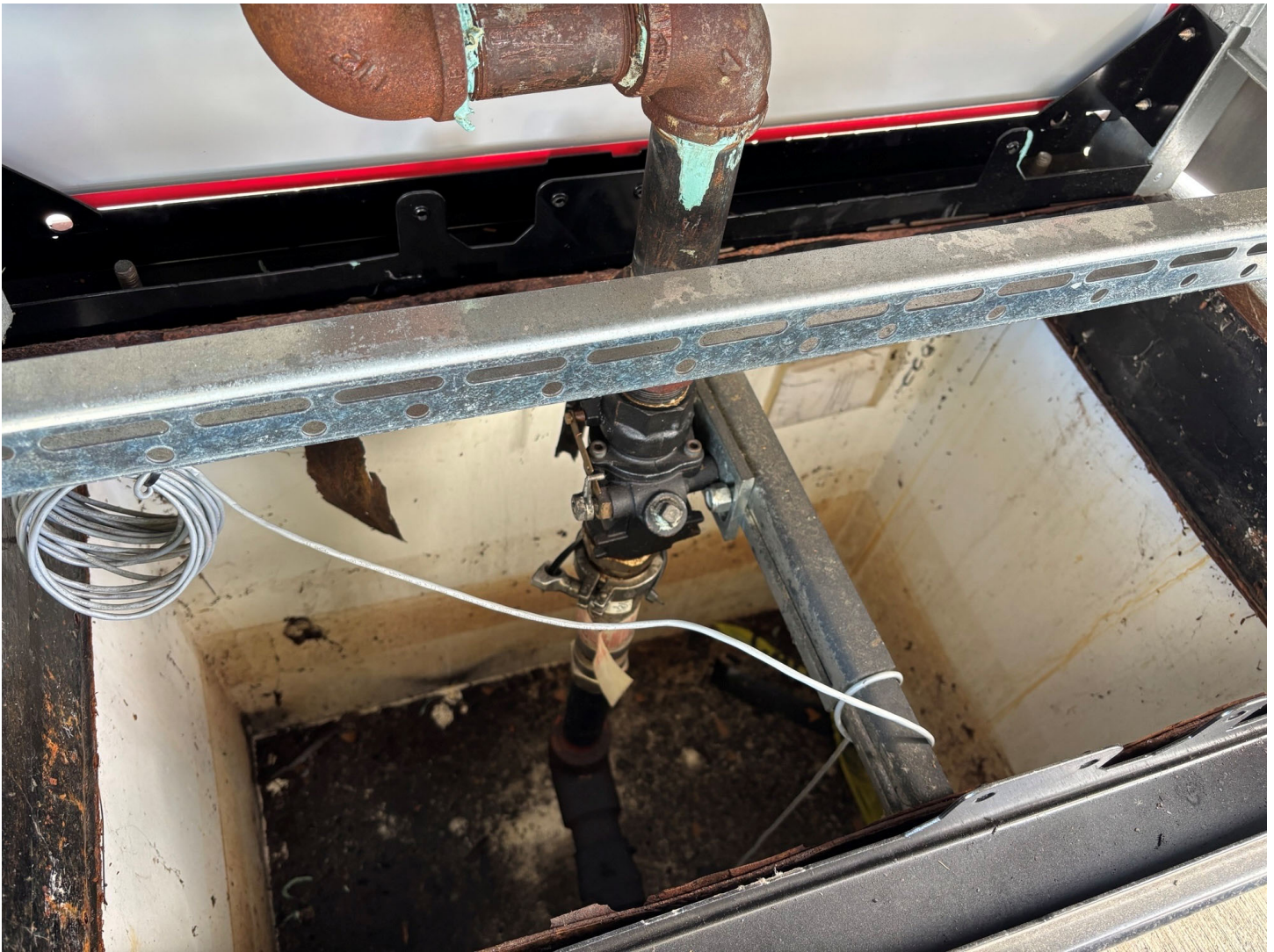
Under dispenser containment sump equipped with liquid sensor for electronic monitoring (typical) and shear valve for pressurized piping (typical)