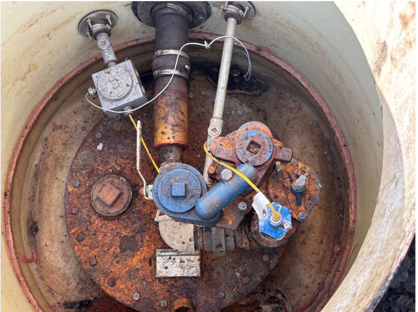
Tank Top Sump equipped with liquid sensor for electronic interstitial monitoring of the piping secondary containment (Typical).