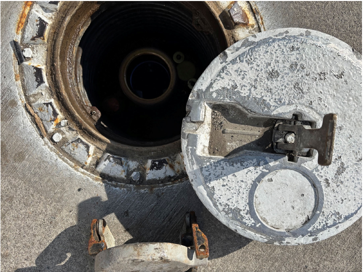
Tank 002 (20,000 gallon regular 87 with dual fill ports) – No tank ID tag at one of the two fill ports.