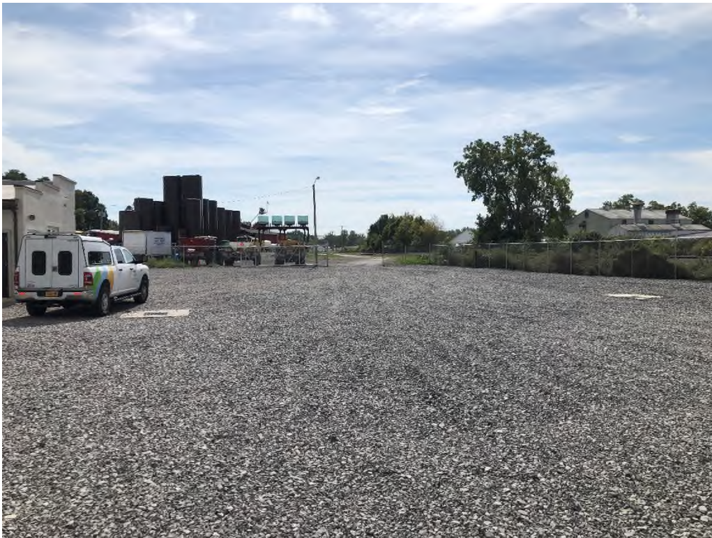
Western End of Office Building and Southwestern Portion of the Site - Viewing South