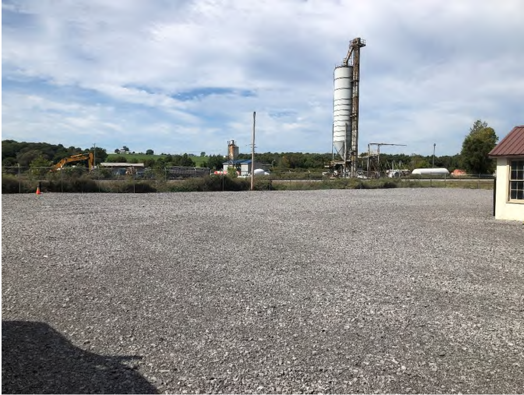
Northwestern Portion of the Site - Viewing Northwest