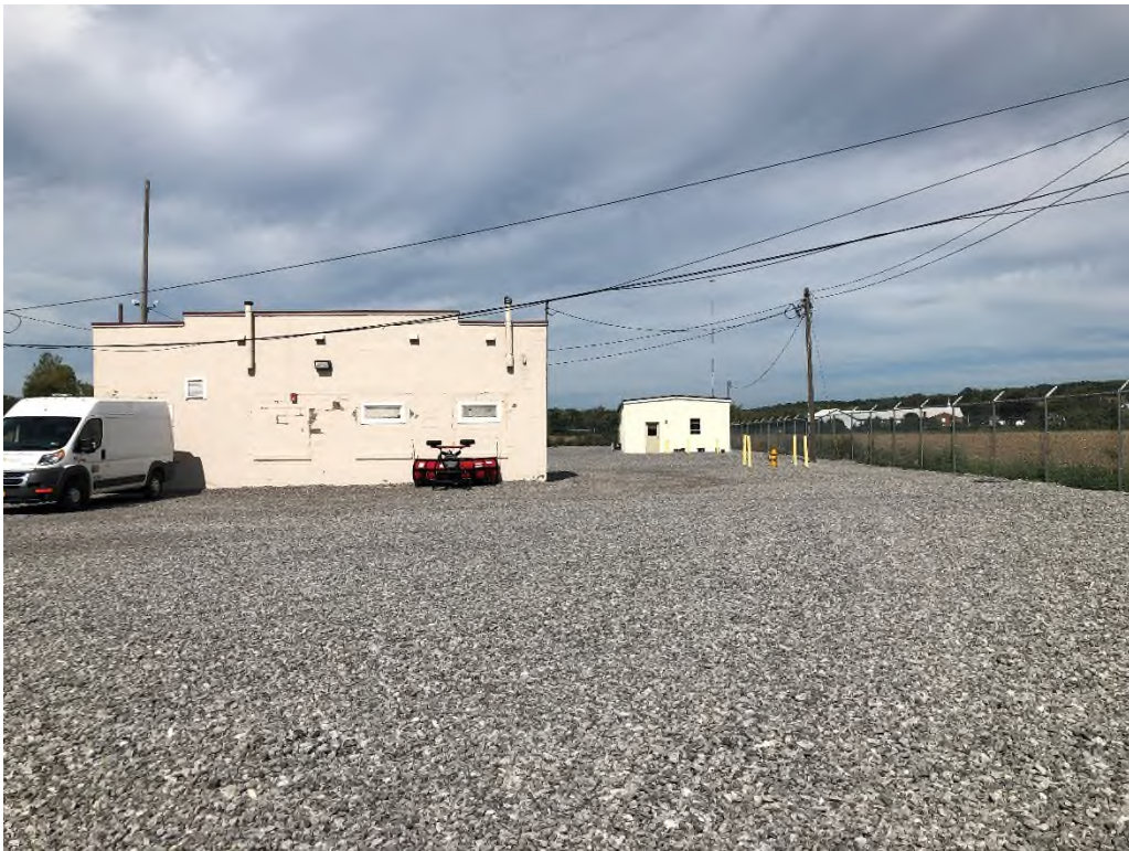
Southeastern Portion of the Site – Viewing Northeast