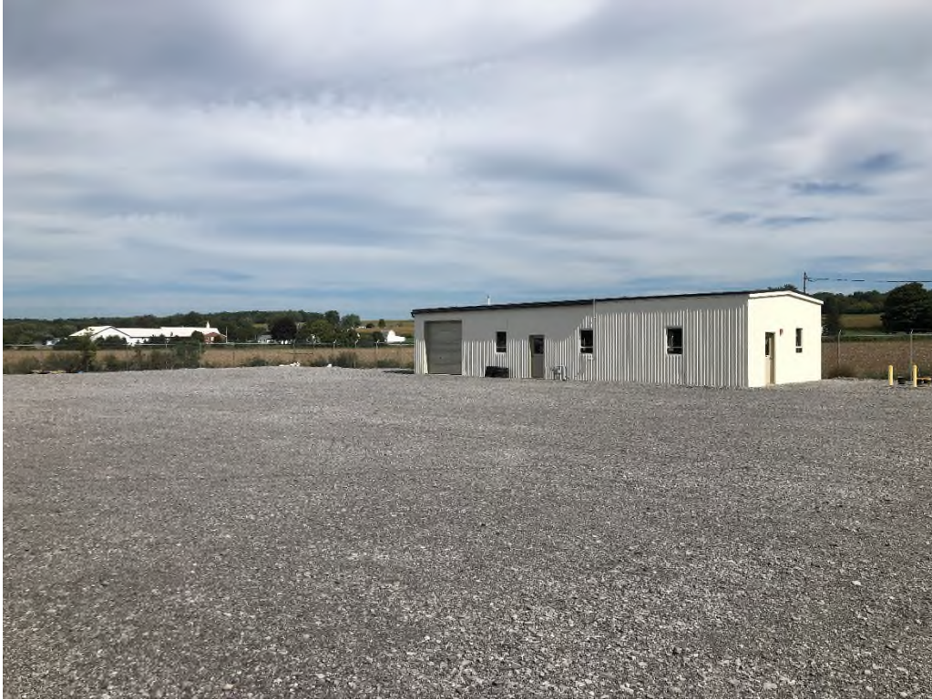
Training Building and the Northeastern Portion of the Site - Viewing Northeast