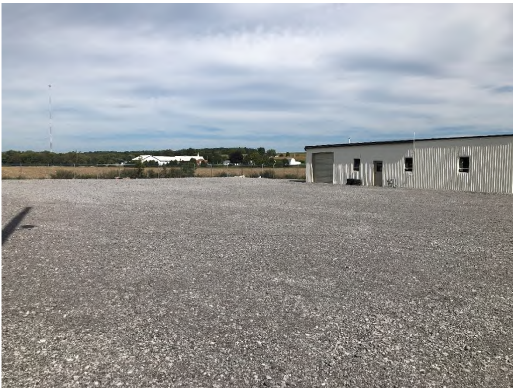
Northeastern Side of the Site - Viewing Northeast