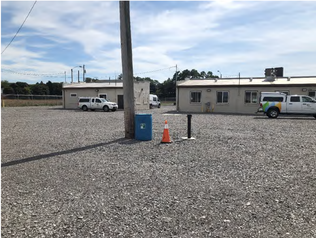
Locker Room Building, Eastern End of Office Building, and Plastic Drums Containing Purged Groundwater - Viewing Southeast