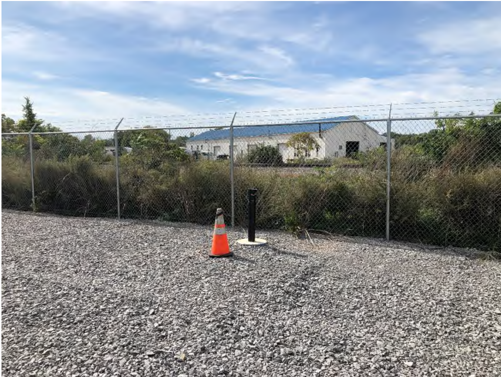
Typical “Stick Up” Groundwater Monitoring Well at the Site