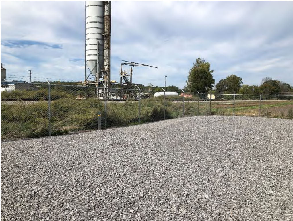
Northwestern Portion of the Site - Viewing North