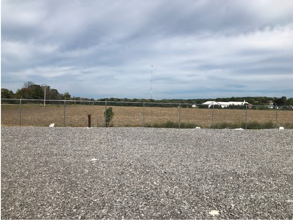
Northern Portion of the Site - Viewing North