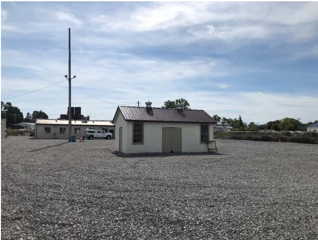
Gas Regulator Building and the Central Portion of the Site - Viewing South