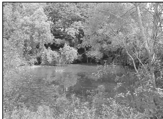
Area One Pond

The 18-inch influent pipe leading from the manufacturing plant to the lagoon and its