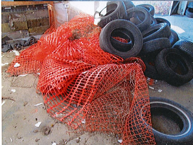
← Waste tires and orange plastic on south interior side of Building 9