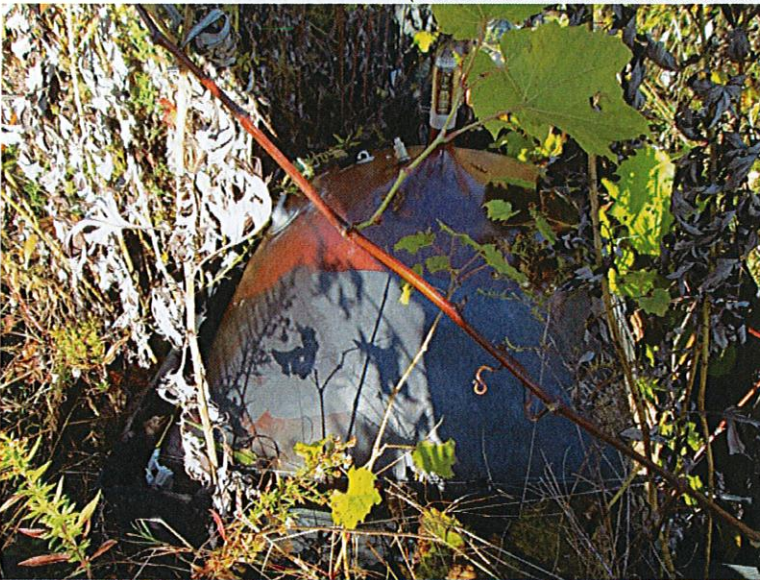
← CRT located in overgrown vegetation north of Building 2

Violations of Part 360 are Subject to Applicable Civil, Administrative, and Criminal Sanctions Set Forth in ECL Article 71 and as Appropriate, the Clean Water and Air Acts. Additional Violations May be noted on Sheet one of this inspection report. Provide site sketches, clarification, supplemental information, locations of photographs or samples and/or locations of violations (uncorrected violations must be described in detail and located on a sketch.)