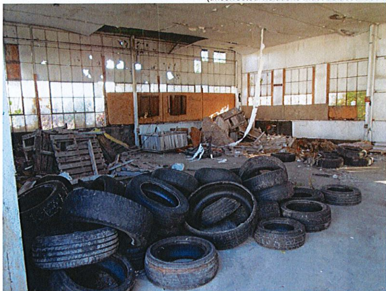
← Waste tires on north interior side of Building 9

Violations of Part 360 are Subject to Applicable Civil, Administrative, and Criminal Sanctions Set Forth in ECL Article 71 and as Appropriate, the Clean Water and Air Acts. Additional Violations May be noted on Sheet one of this inspection report. Provide site sketches, clarification, supplemental information, locations of photographs or samples and/or locations of violations (uncorrected violations must be described in detail and located on a sketch.)