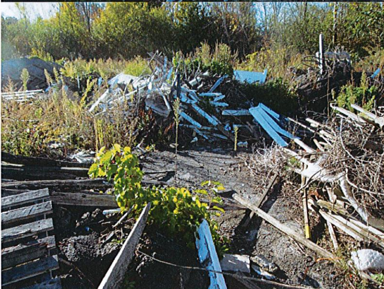
← Piles of C&D debris at south end of site