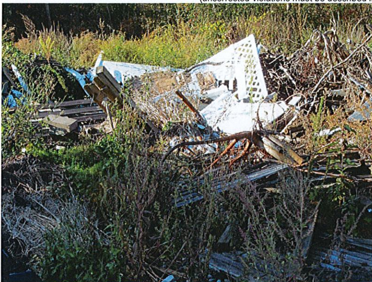
← Piles of C&D debris at south end of site

Provide site sketches, clarification, supplemental information, locations of photographs or samples and/or locations of violations (uncorrected violations must be described in detail and located on a sketch.)