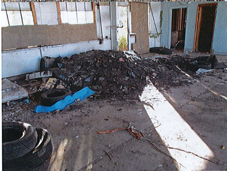
← Pile of asphalt shingles in Building 9