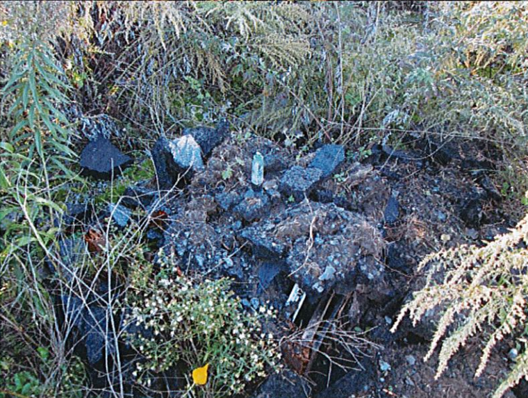
← CRT partially covered with asphalt pavement between Buildings 9 and 11