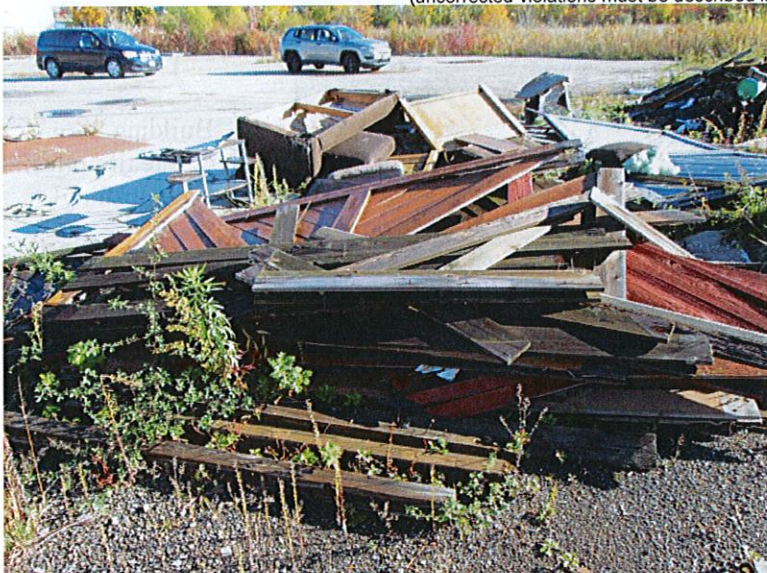
← Piles of C&D debris at south end of site

Violations of Part 360 are Subject to Applicable Civil, Administrative, and Criminal Sanctions Set Forth in ECL Article 71 and as Appropriate, the Clean Water and Air Acts. Additional Violations May be noted on Sheet one of this inspection report. Provide site sketches, clarification, supplemental information, locations of photographs or samples and/or locations of violations (uncorrected violations must be described in detail and located on a sketch.)