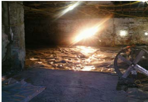
Inside building floor covered with poly after investigation