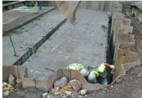
Crew rigging a float for removal from Keuka Lake Outlet