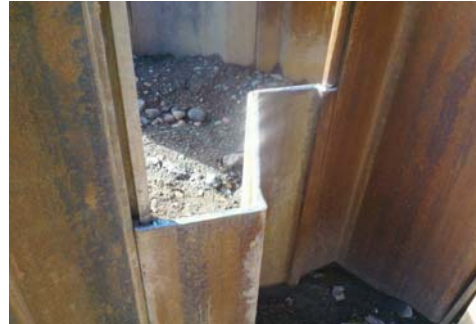
Sheet in grinding stage of preparation for splice weld