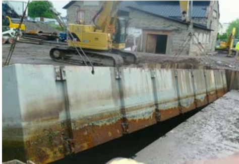
Crew removing work platform float