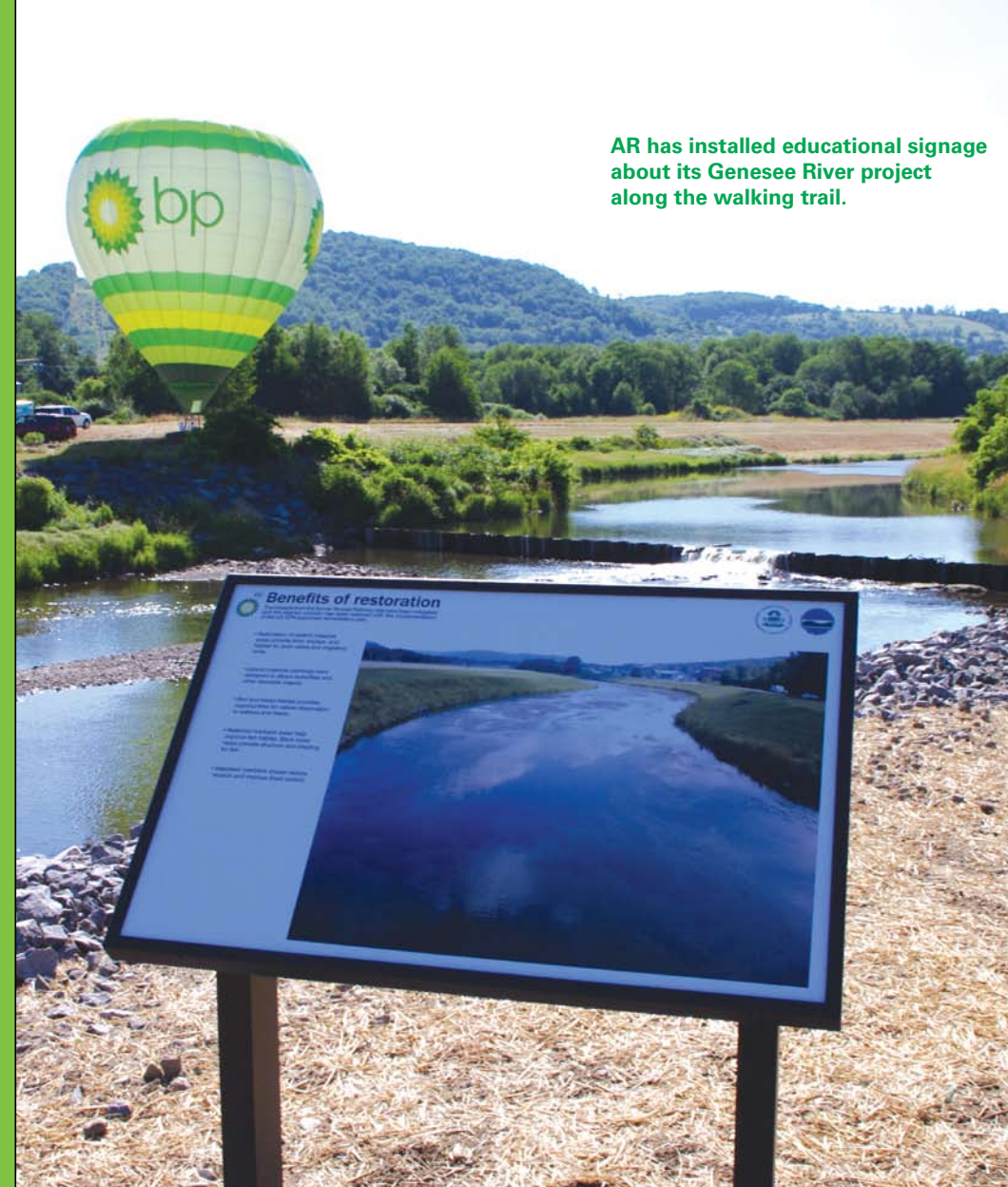
AR has installed educational signage about its Genesee River project along the walking trail.

As part of this overall project, AR also completed the excavation of portions of the River and the adjoining swale to remove historic contamination, and recapped an existing landfill on site.