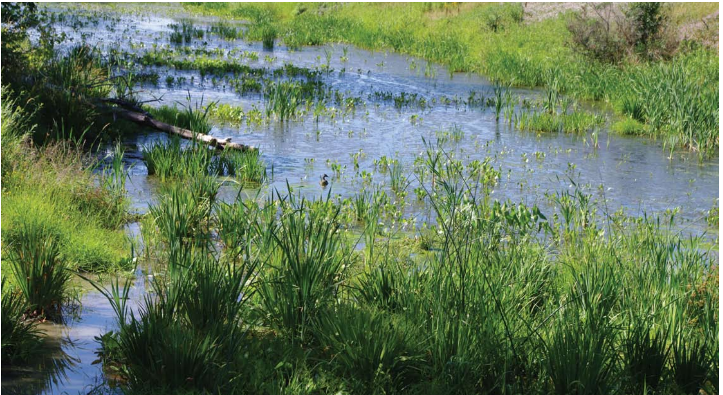
The restored Genesee River swale can be seen from the newly reopened walking trail.