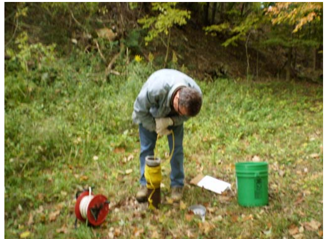
MW-113 Purge Start.JPG Page 1