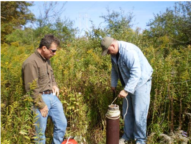
MW-102D Purge Start.JPG Patton's Busy Bee 100609 LTM