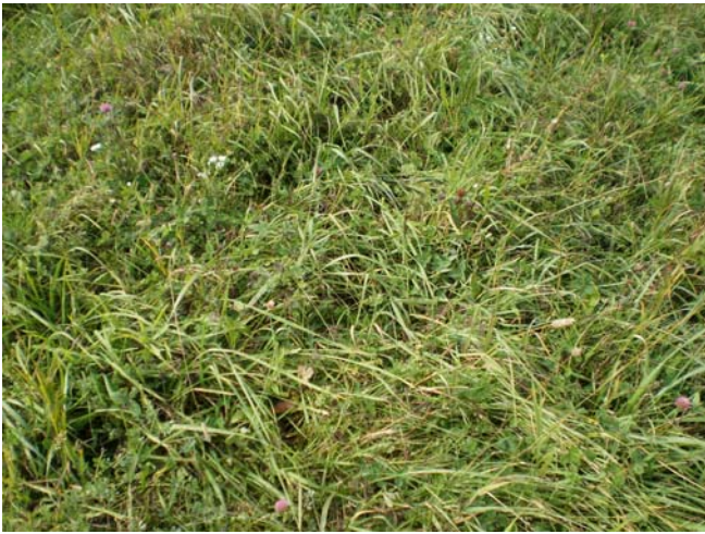
Cap Vegetation (typ).JPG