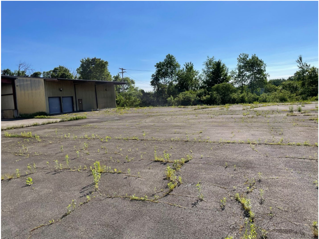
Site conditions facing E.