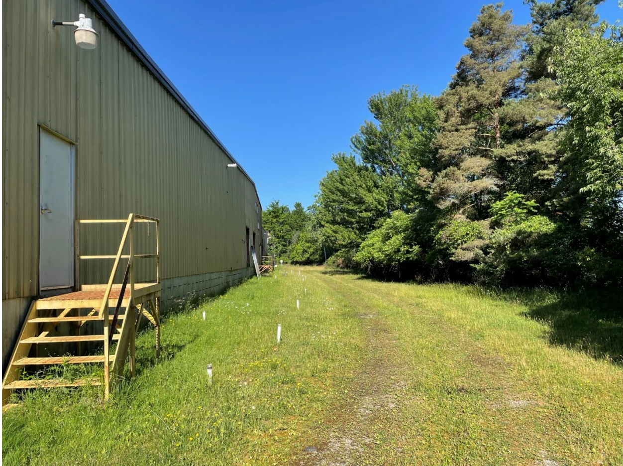
Site conditions/capped injections wells facing W.