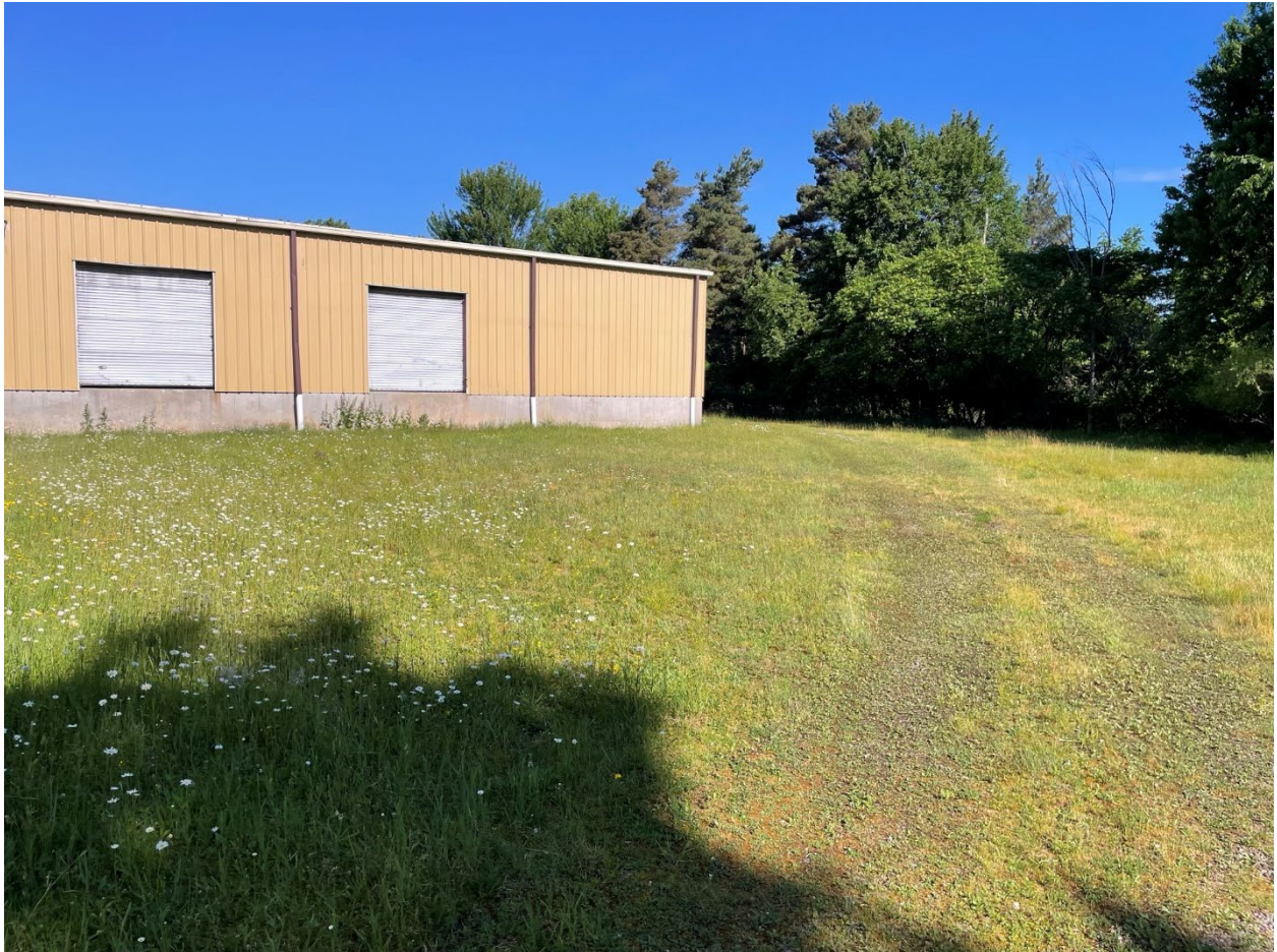
Site conditions facing NW.