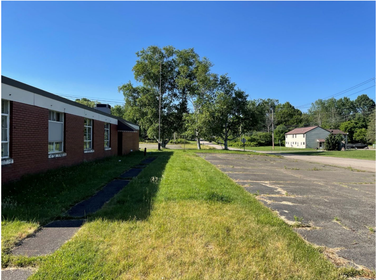
Site conditions facing S.