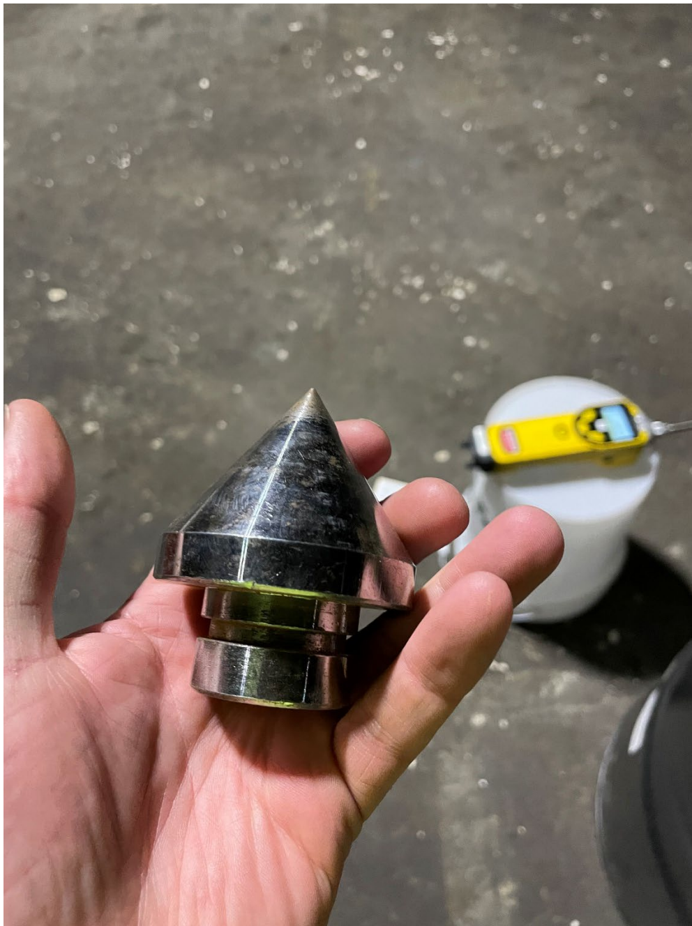
Point for direct push rod used.