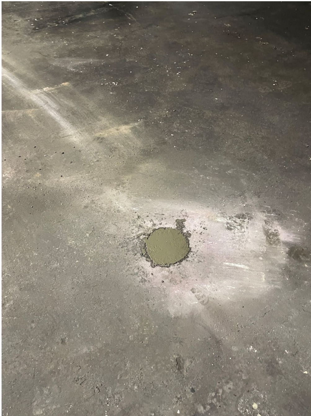
Sealed borehole/attempted injection well.