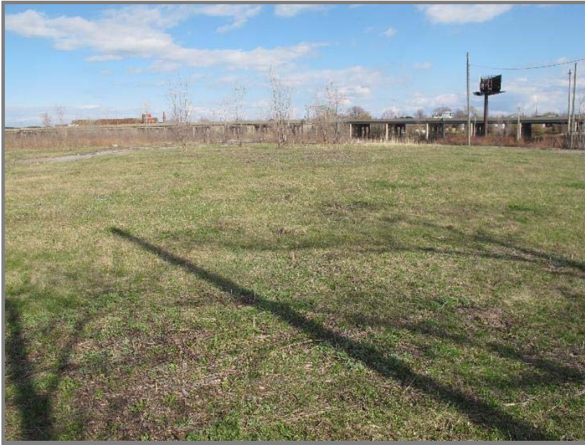
Holding the camera over the fence