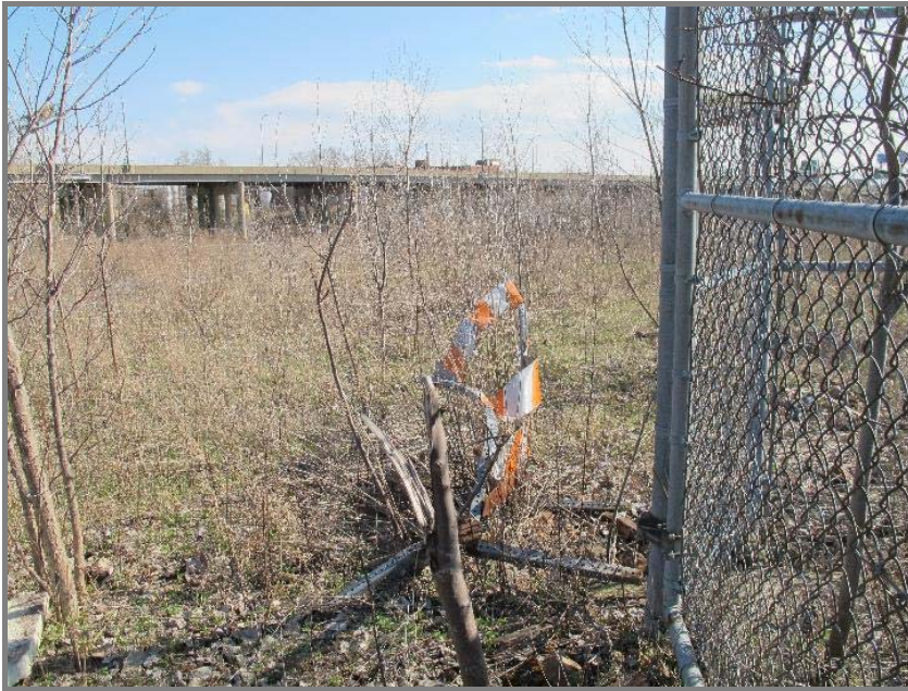
Near the distant fence corner. We entered briefly and then walked back the way we came.