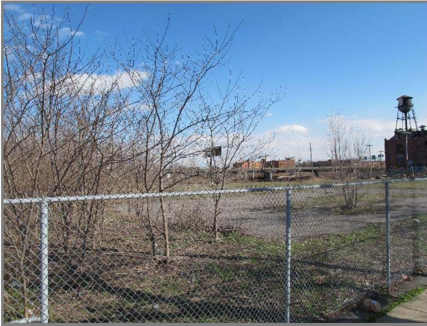
Telephoto shot, camera held above head