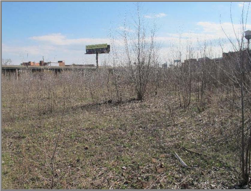
Camera held above the head, looking inside towards the south