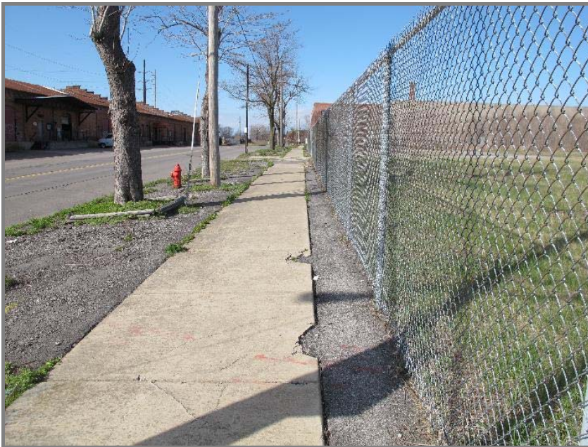
Carl and I walked along the Tonawanda Street sidewalk perimeter. Direction is looking north.