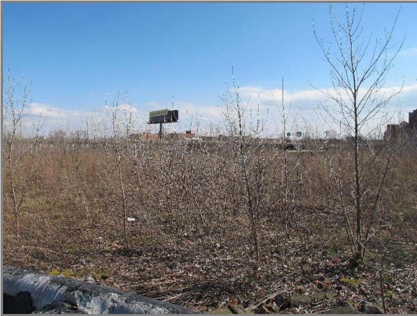
Camera held above the head, looking inside towards the south