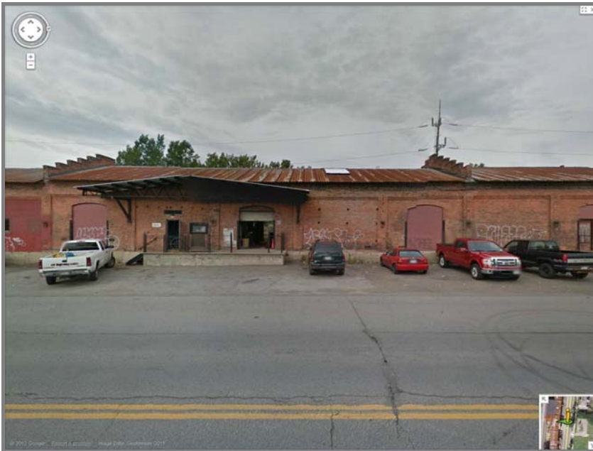
Google Maps Streetview, 66 Tonawanda Street.