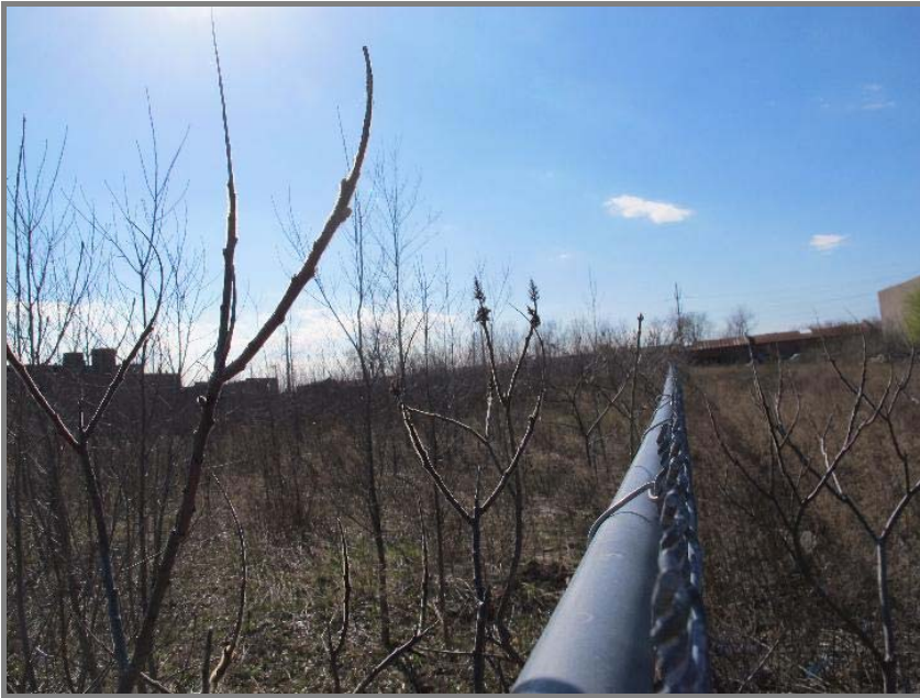
Panorama swinging south to east, over the top of the fence on the northern boundary.