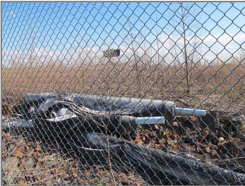
We continued walking around the fenced perimeter. We turned the corner to the right, heading east. We could see rolls inside the fence.