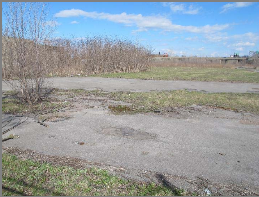
Panorama shot, panning left towards the north