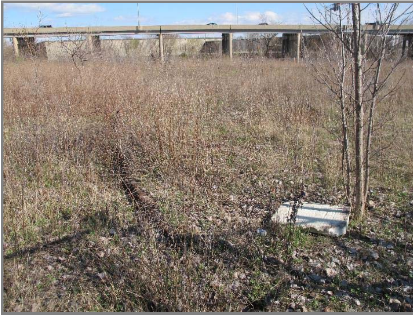
Near the distant fence corner. We entered briefly and then walked back the way we came.