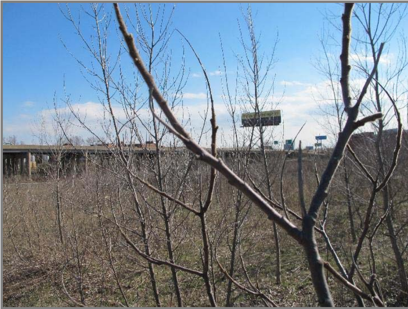
Panorama swinging south to east, over the top of the fence on the northern boundary.