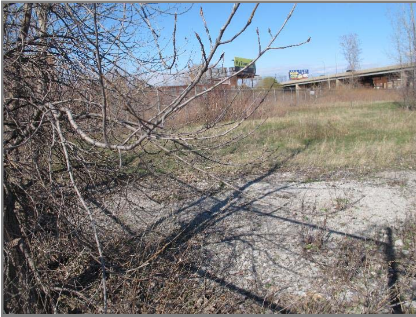
Panorama swinging south to east, over the top of the fence on the northern boundary.