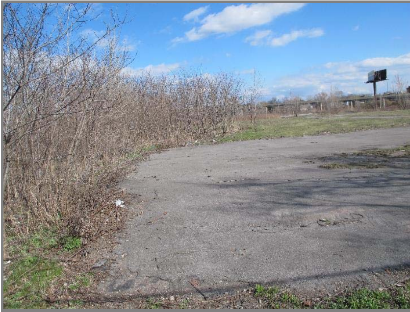
Panorama shot, panning left towards the north