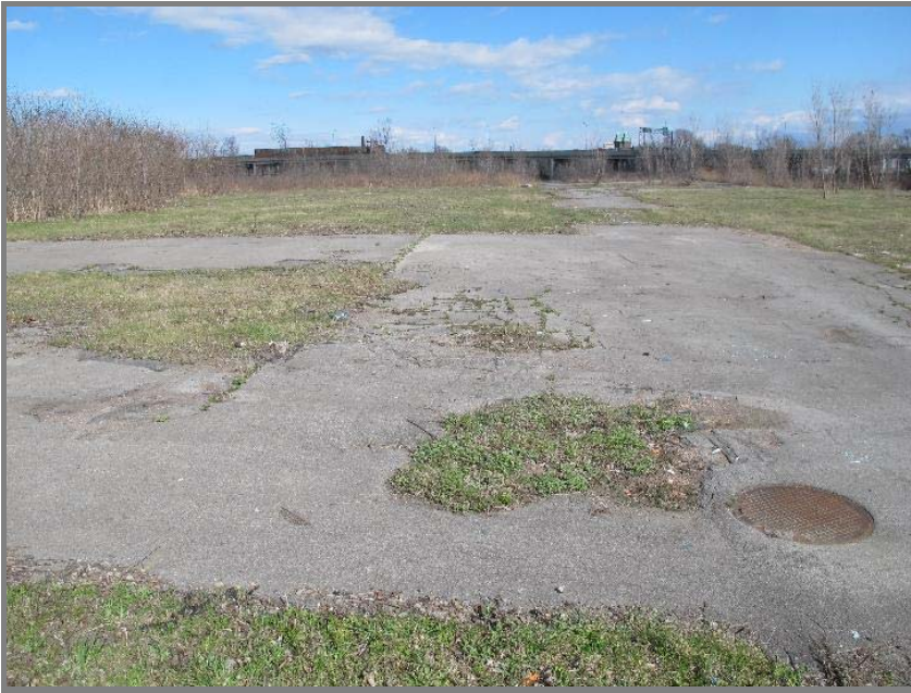
Panorama shot, panning left towards the north