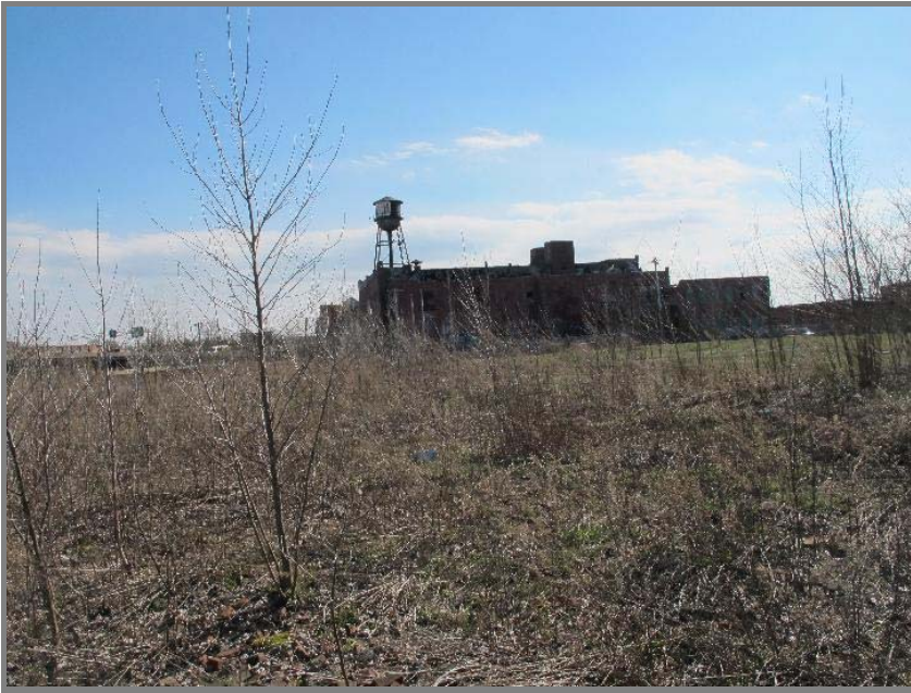
Camera held above the head, looking inside towards the south