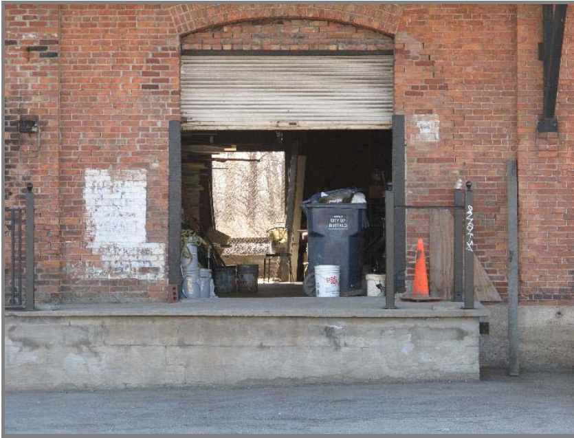
Telephoto looking at the industrial building loading entrance across the street (66 Tonawanda Street).