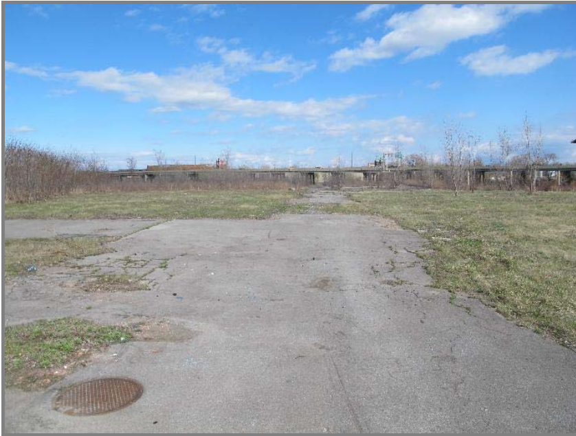
Panorama shot, panning left towards the north