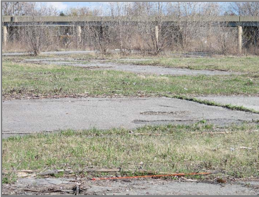
Photo of the interior from the sidewalk along Tonawanda Street. Camera held above head.