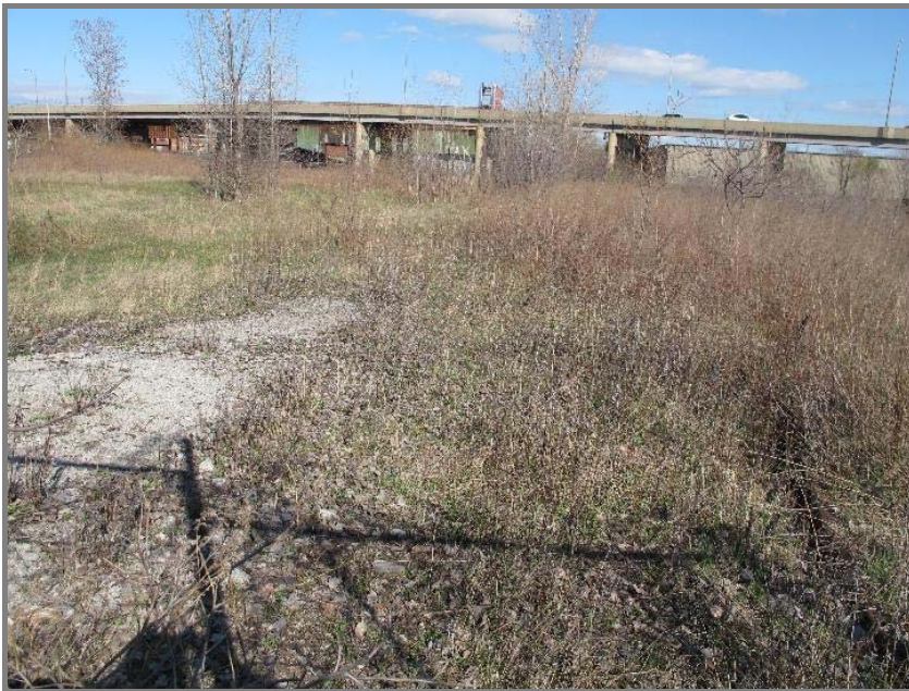
Near the distant fence corner. We entered briefly and then walked back the way we came.