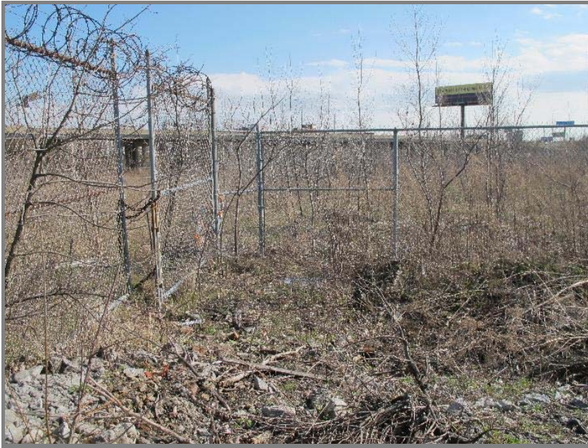
Near the distant fence corner. We entered briefly and then walked back the way we came.