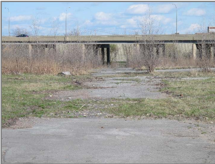
Photo of the interior from the sidewalk along Tonawanda Street. Camera held above head.