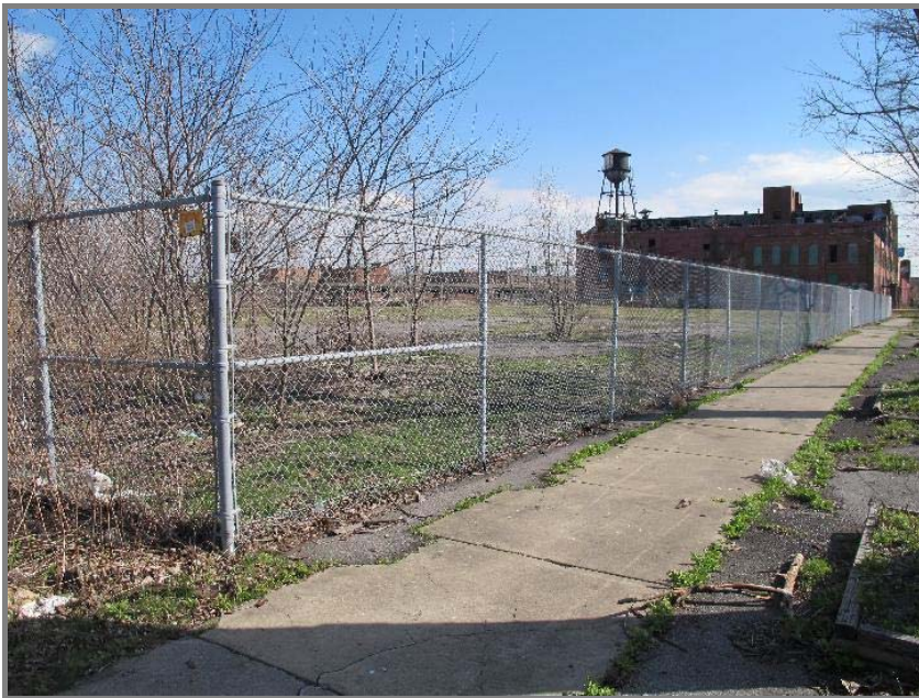
Looking back from the fence corner.