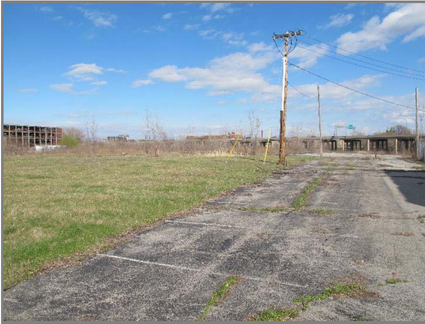
Panning more to the left which is to the north.