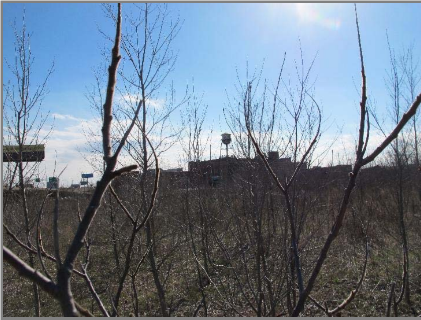
Panorama swinging south to east, over the top of the fence on the northern boundary.