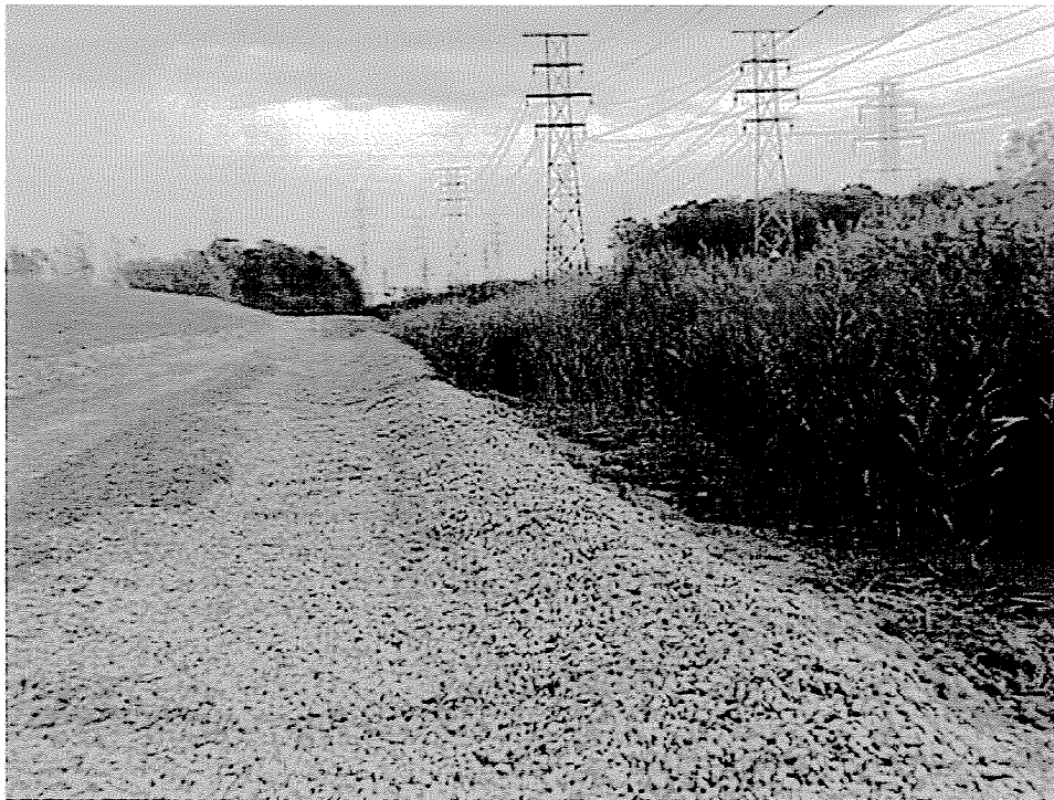
Photo 10. View west along new perimeter road and drainage swale at same location as Photo 9 above; Phragmites re-established in drainage swale.