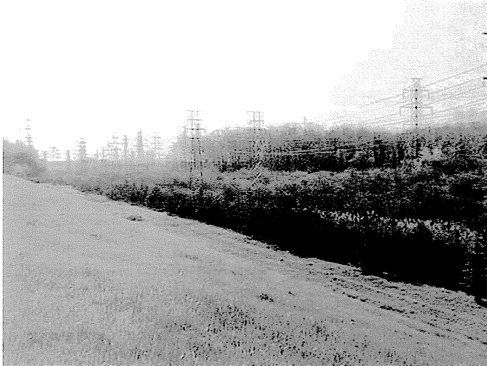
Photo 11. Pre-closure view from top of landfill east along old road and drainage swale at south fence line on AIRCO property.