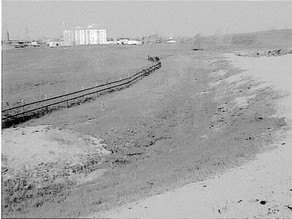
Photo 15. Pre-closure view west along new drainage swale at southwest fence line of AIRCO property.