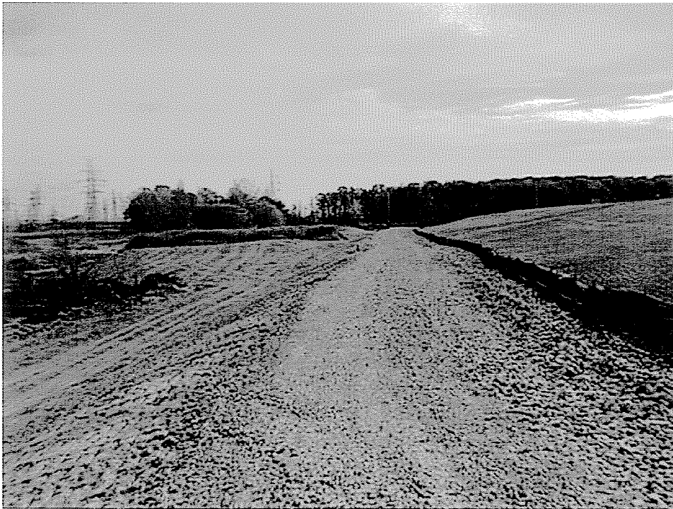
Photo 4. View south along new perimeter road; swale and Phragmites -dominated emergent wetland to left in background; landfill cap and erosion fence to right.