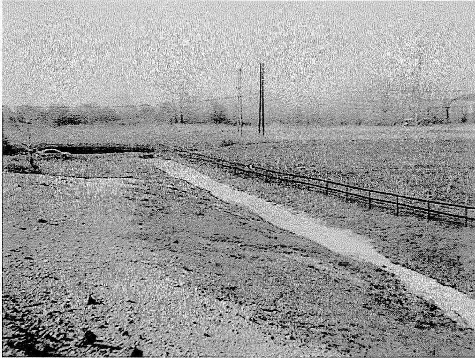
Photo 13. Pre-closure view south along new drainage swale at southwest fence line of AIRCO property.