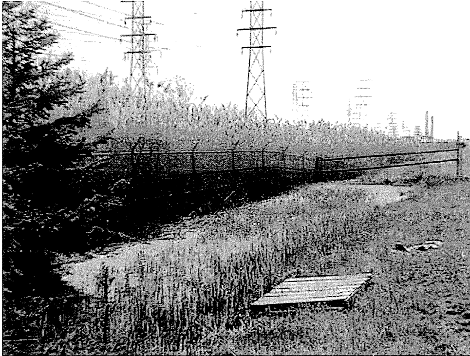
Photo 7. Pre-closure view west along drainage swale at south fence line near old entrance gate onto AIRCO property.