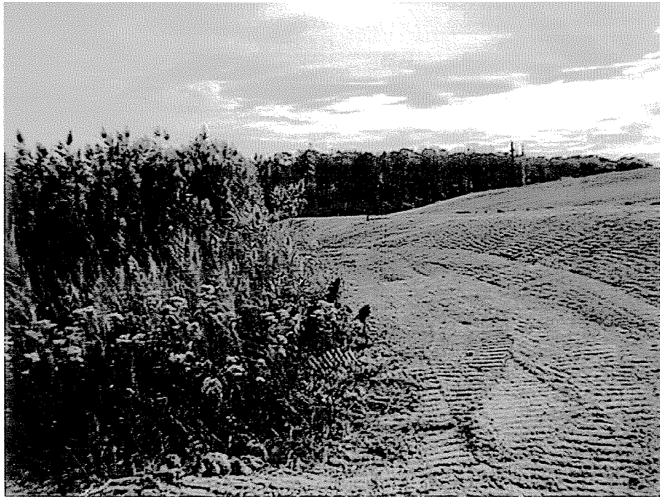
Photo 2. View south at same Phragmites -dominated emergent wetland following regrading and installation of cap, perimeter road, and drainage swale.