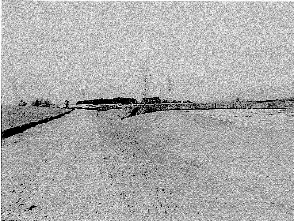
Photo 6. View north along new perimeter road toward Phragmites -dominated emergent wetland near east side of AIRCO property; new drainage swale to right.