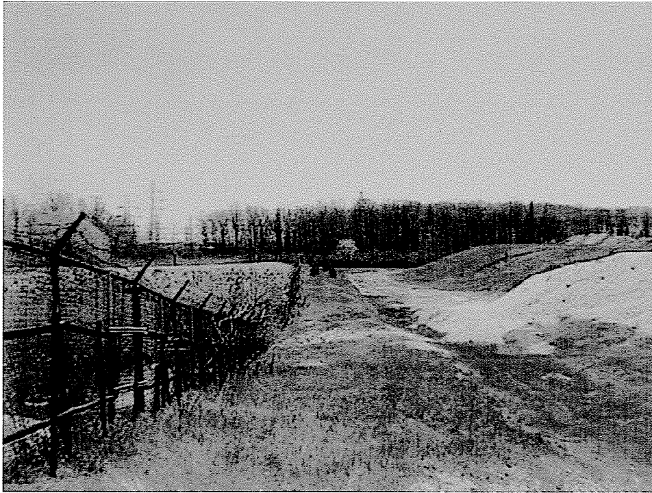
Photo 3. Pre-closure view toward south; Phragmites -dominated emergent wetland on NMPC property to left of fence, old drainage swale to right.