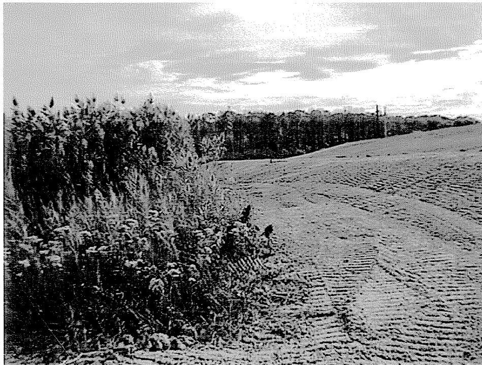
Photo 2. View south at same Phragmites -dominated emergent wetland following regrading and installation of cap, perimeter road, and drainage swale.