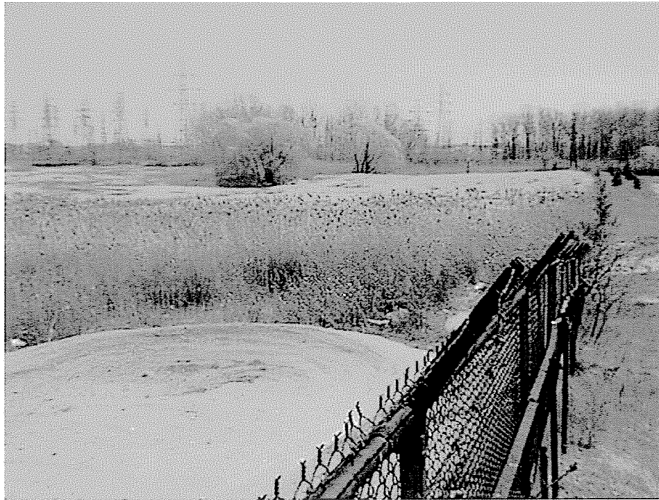
Photo 1. Pre-closure view where drainage from Phragmites -dominated emergent wetland on NMPC property crossed east fence line into swale on AIRCO property.