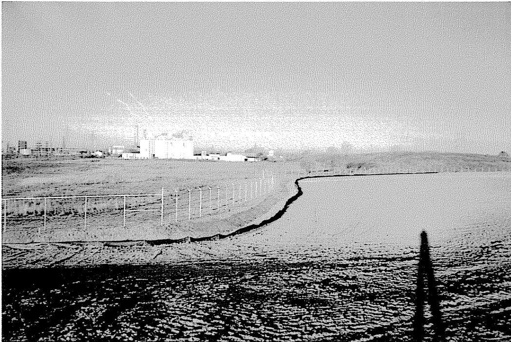
Photo 16. Post-closure view west along new drainage swale at southwest fence line of AIRCO property.