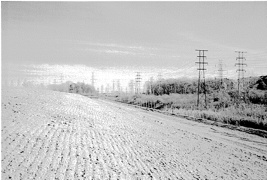
Photo 12. Post-closure view from top of landfill east along new perimeter road and drainage swale at south fence line on AIRCO property.