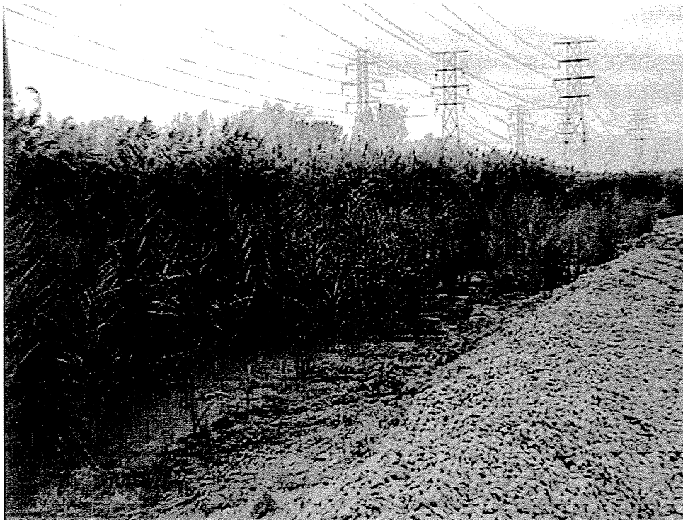
Photo 8. Post-closure view west along drainage swale near location of old south fence line; Phragmites becoming re-established in swale following regrading.