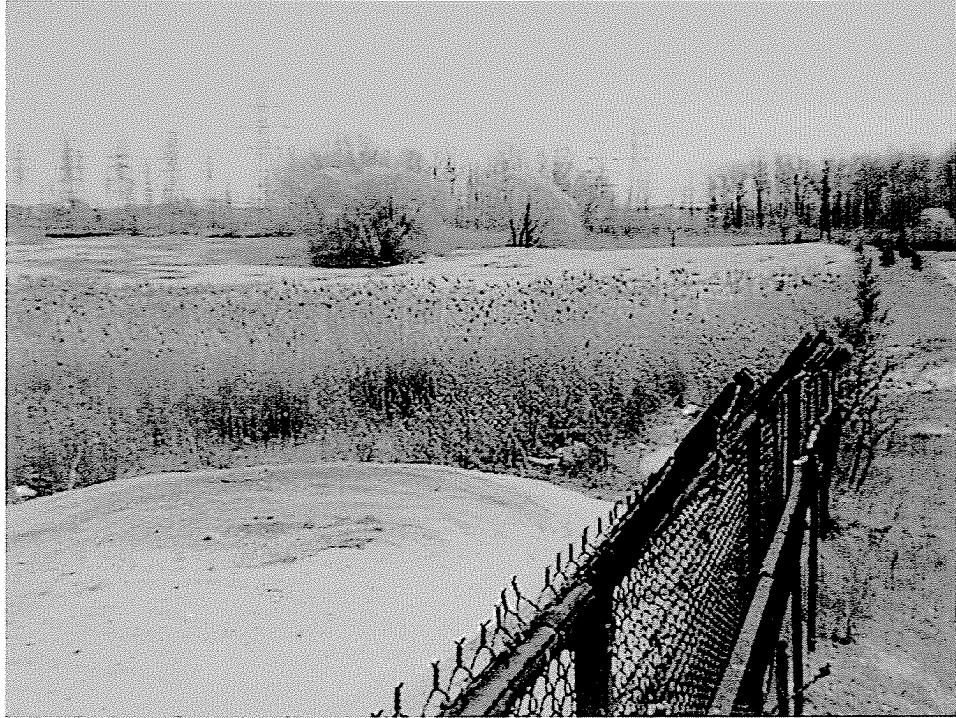
Photo 1. Pre-closure view where drainage from Phragmites -dominated emergent wetland on NMPC property crossed east fence line into swale on AIRCO property.