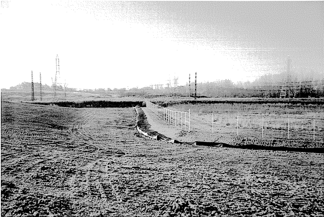
Photo 14. Post-closure view south along new drainage swale at southwest fence line of AIRCO property.