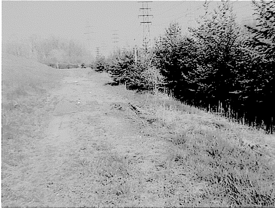
Photo 9. Pre-closure view east at seep along drainage swale at south fence line on AIRCO property.