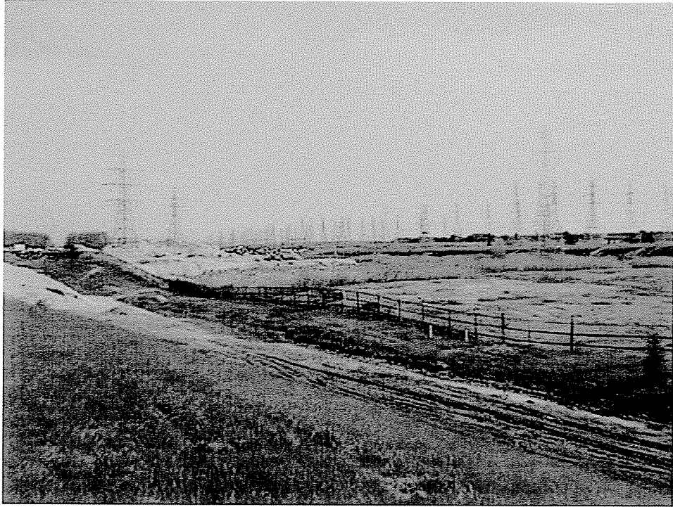
Photo 5. Pre-closure view northeast toward Phragmites -dominated emergent wetland on NMPC property from previous closure on AIRCO property.