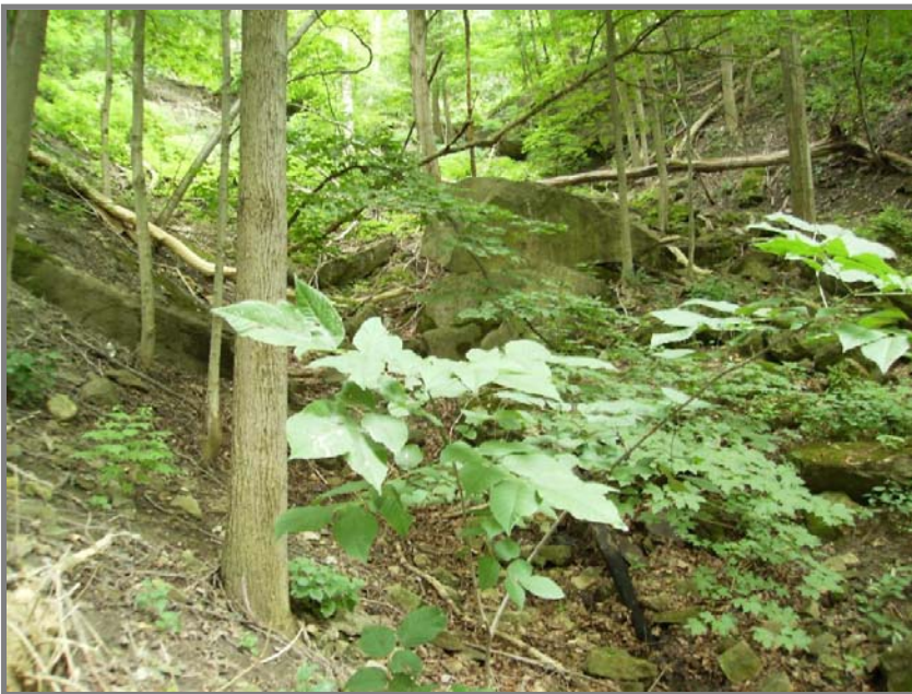
Minor flow beneath the rocks and vegetation not very visible here.