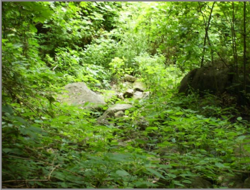
Minor flow beneath the rocks and vegetation not very visible here.