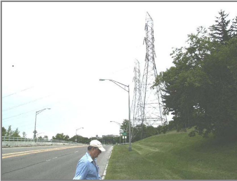
Crossing the Robert Moses Parkway at the end of the inspection walk