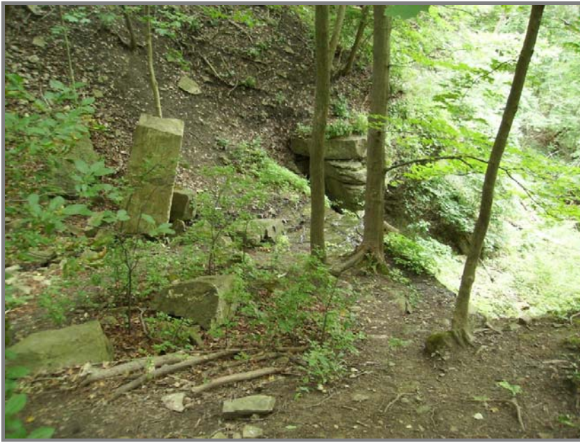
Walking on the Niagara River path