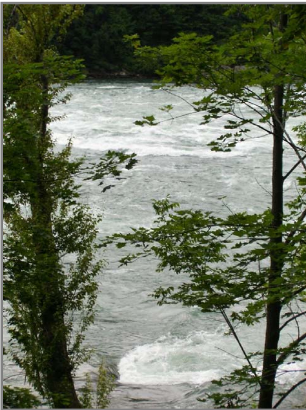
Telephoto shot of the Niagara River.