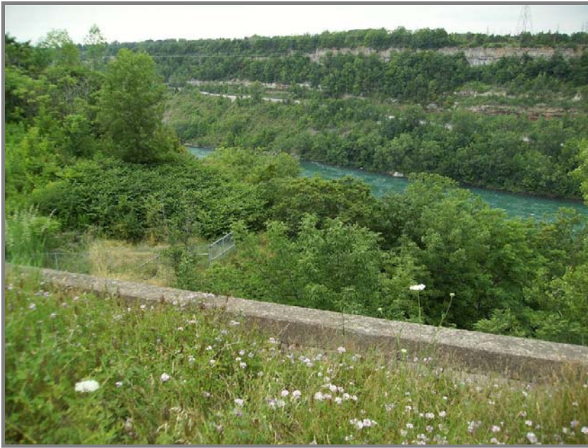
Overlook from the Robert Moses, unused lanes