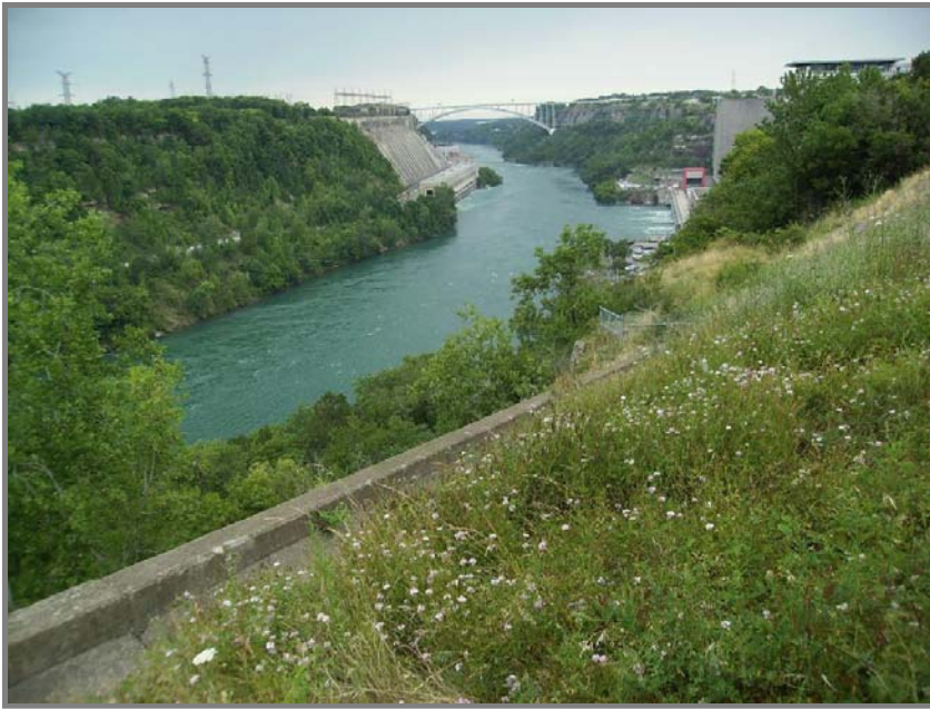
Overlook from the Robert Moses, unused lanes