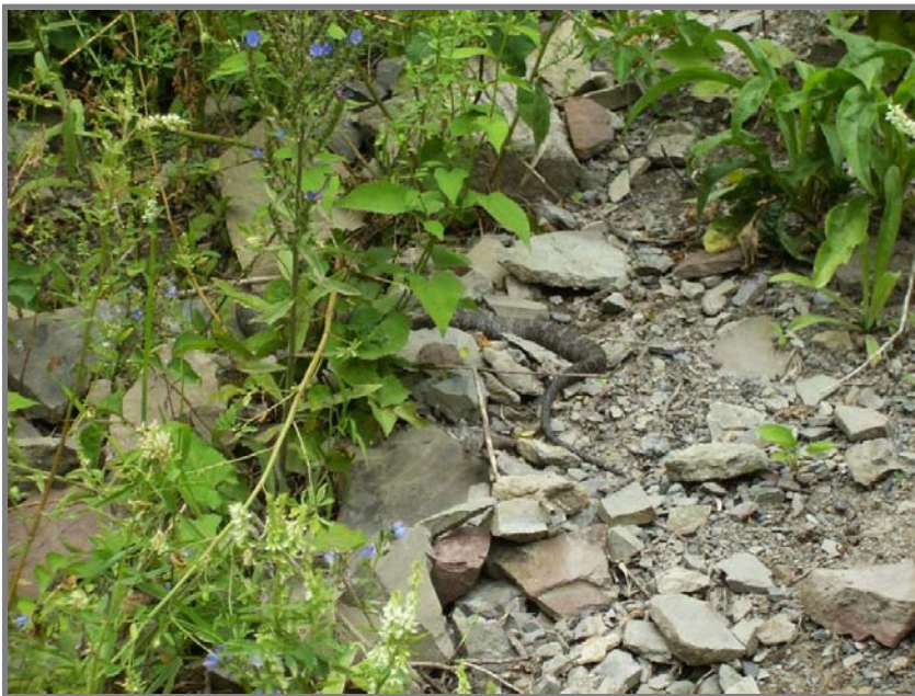
Snake in the grass at Garfield outfall