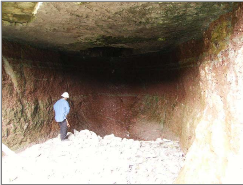
Cave at Garfield Avenue outfall