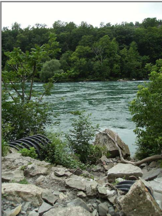
The Garfield Avenue sewer outfall at the river edge