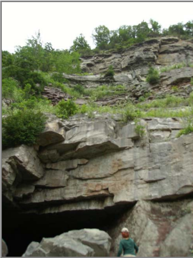
Outcrop above the outfall