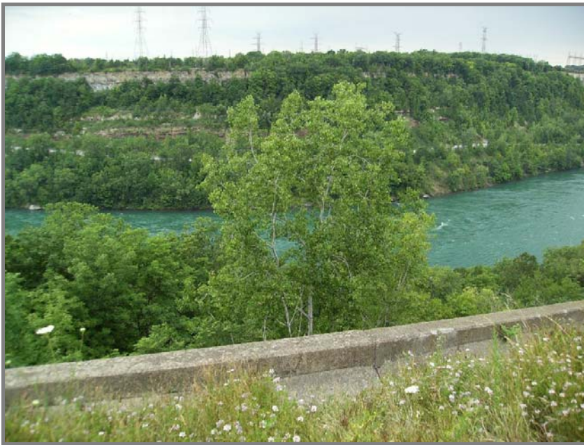
Overlook from the Robert Moses, unused lanes