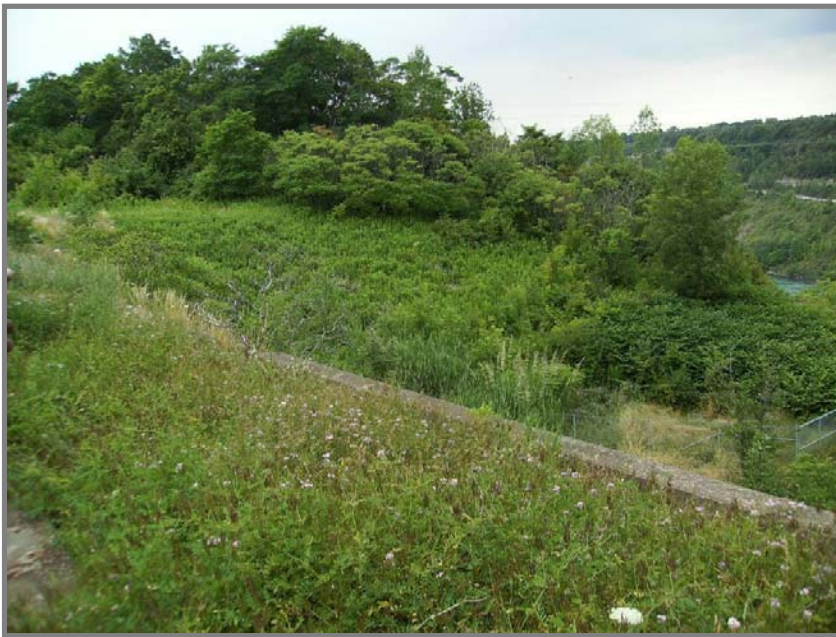
Overlook from the Robert Moses, unused lanes