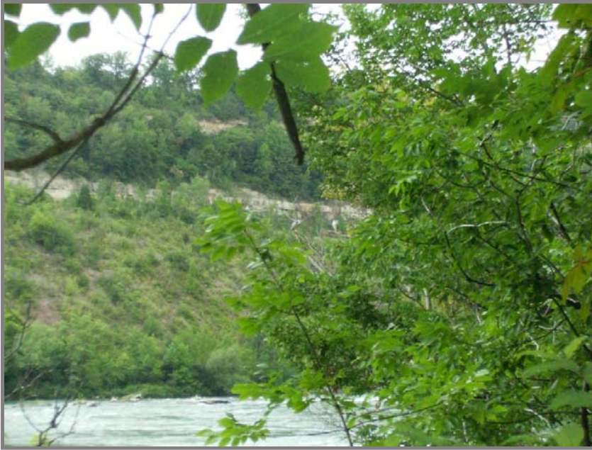
Opposite side, canada