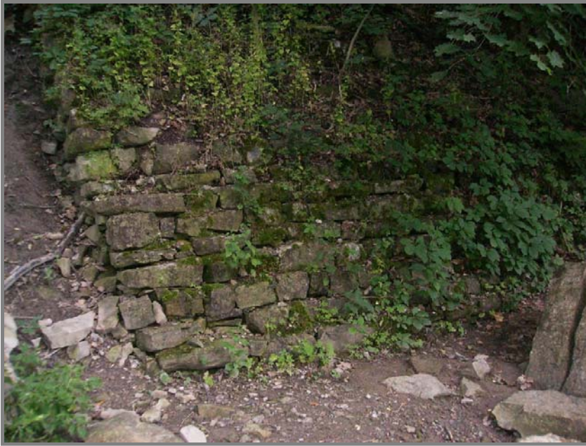
Laid up stone from the short-lived railroad alignment