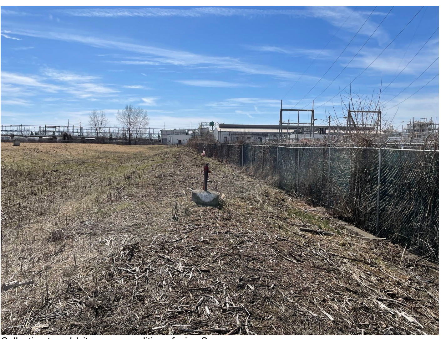
Collection trench/site cover conditions facing S.