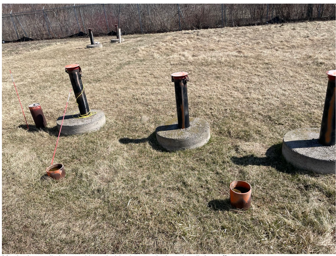
Monitoring well cluster with probable decommissioned wells/cut off casings.