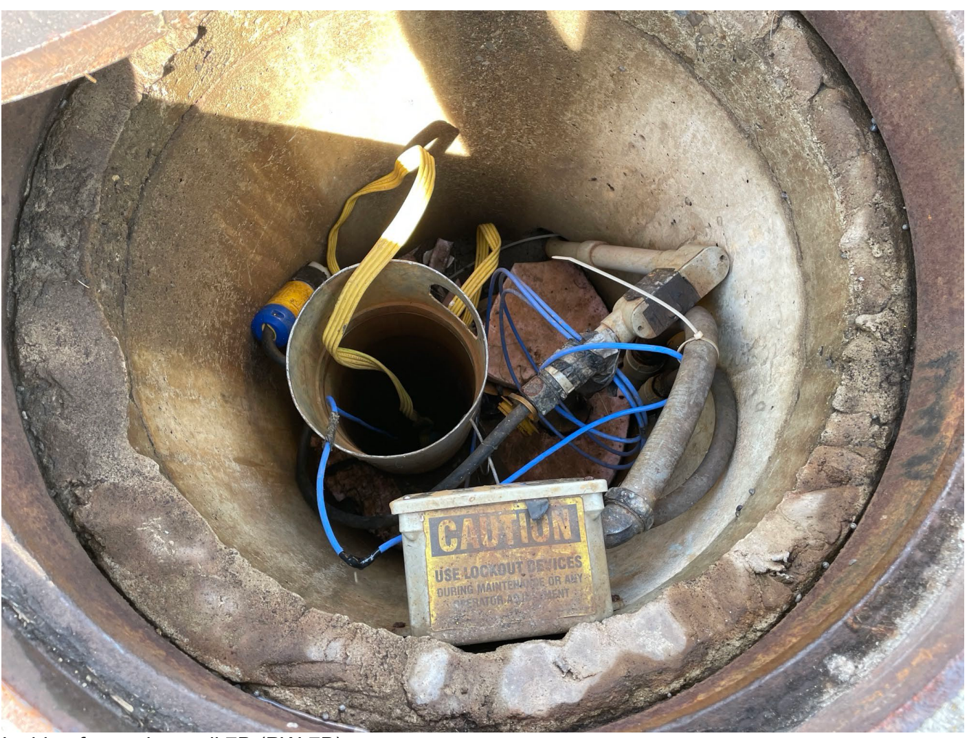
Inside of pumping well 7B (PW-7B).