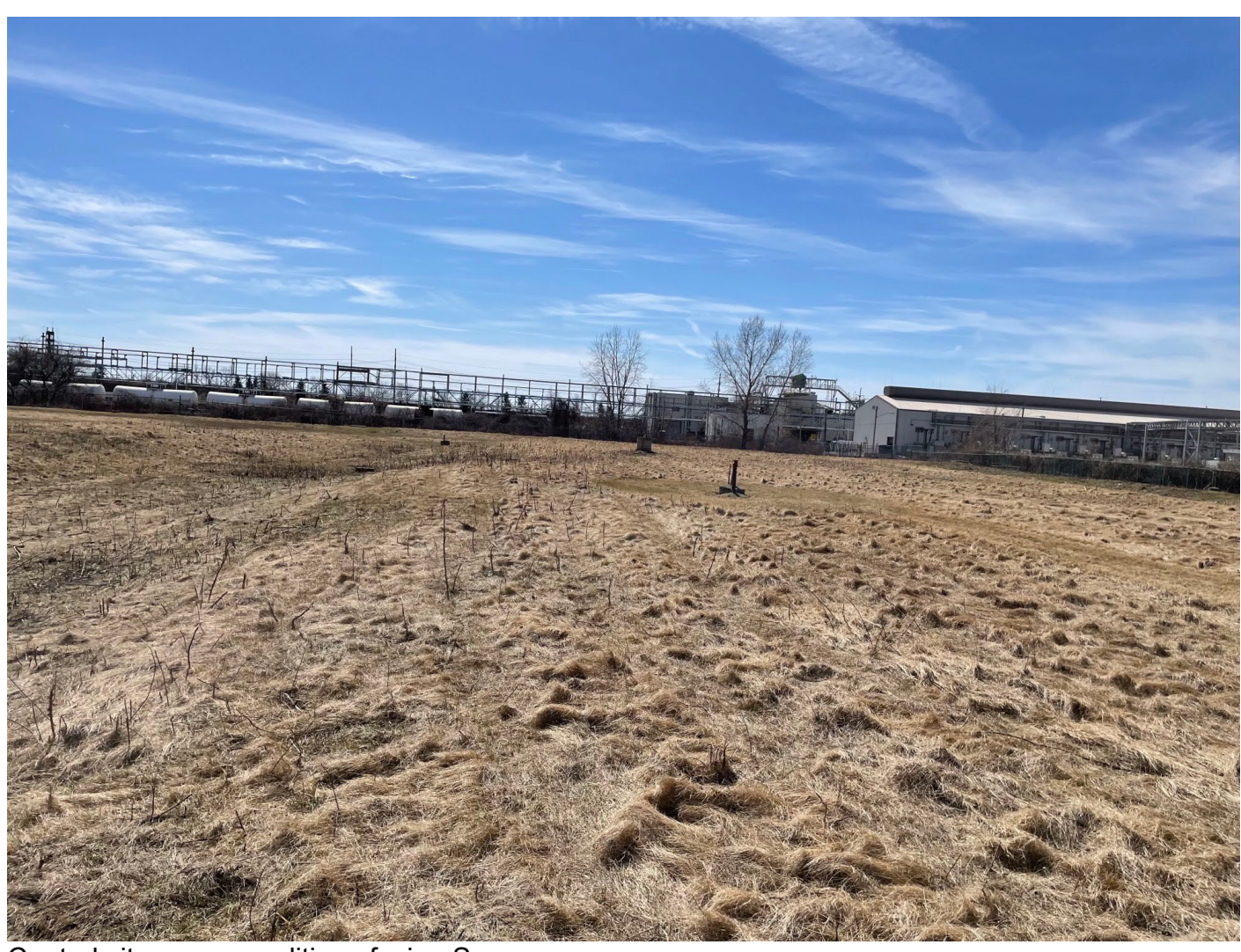
Central site cover conditions facing S.