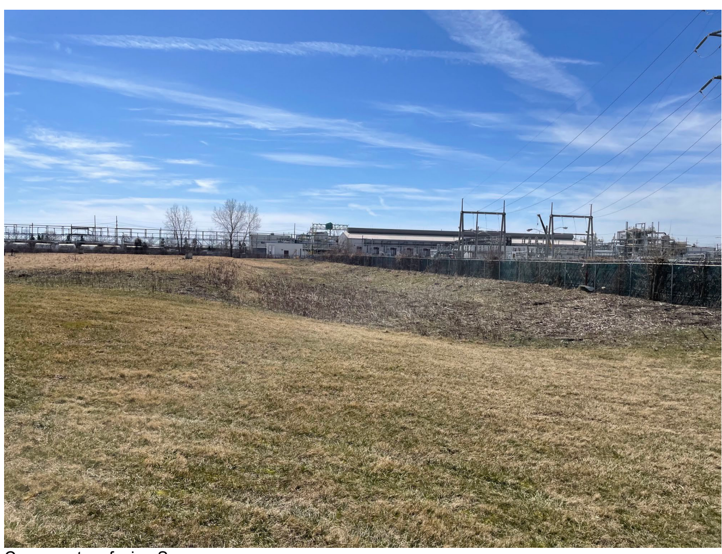
Cover system facing S.