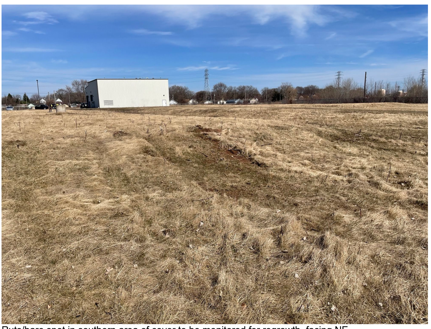
Ruts/bare spot in southern area of cover to be monitored for regrowth, facing NE.