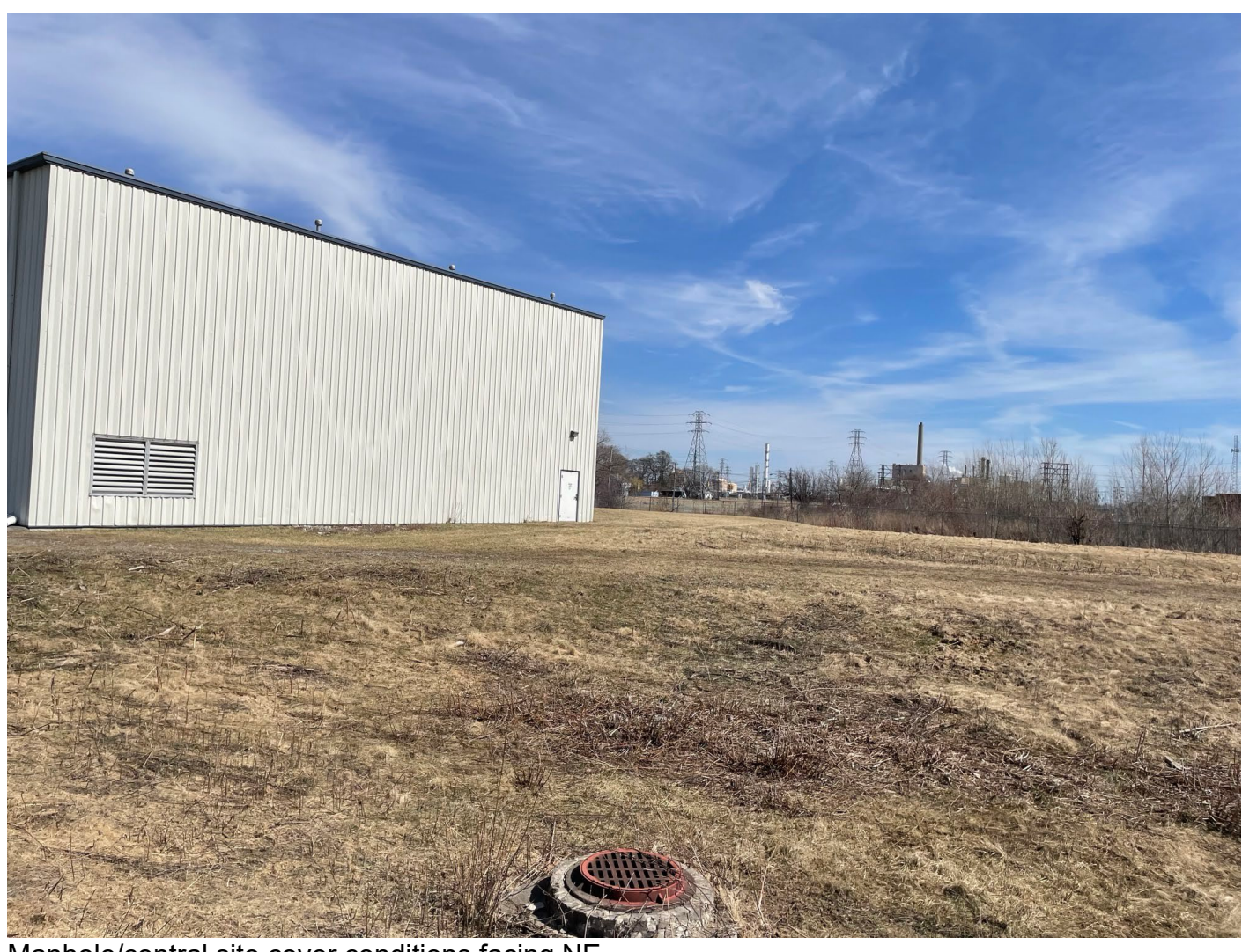
Manhole/central site cover conditions facing NE.