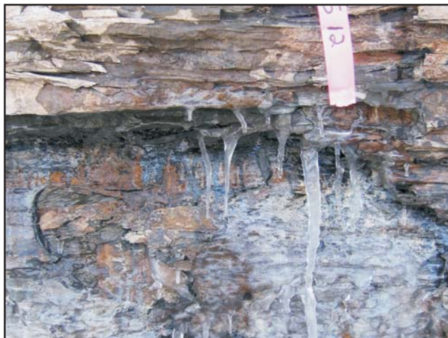
Seep 12: Image taken 3/17/08. Note black staining on rock face.