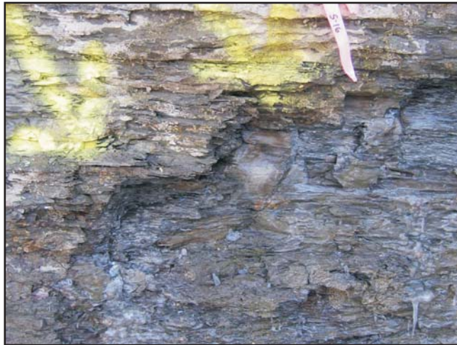
Seep 16: Image taken after cleanup of rock face on 3/17/08.