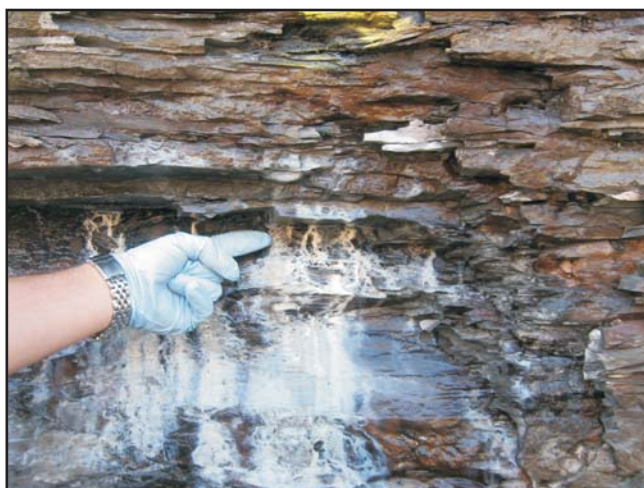
Seep 12: White film developing. Note black staining and tar globules. Image taken on 4/10/08.