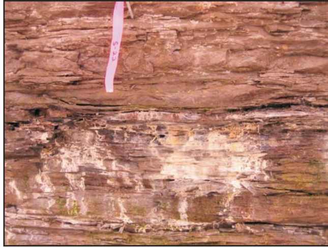
Seep 22: Image taken 3/17/08. Black staining and white film noted on rock face. (Note: Rock face was not cleaned at this seep).