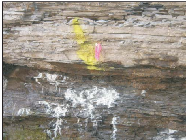
Seep 2: Slight white film developing upon inspection (4/10/08).