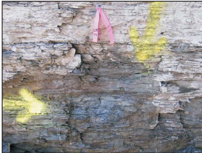
Seep 5: Image taken after cleanup of rock face on 3/17/08.