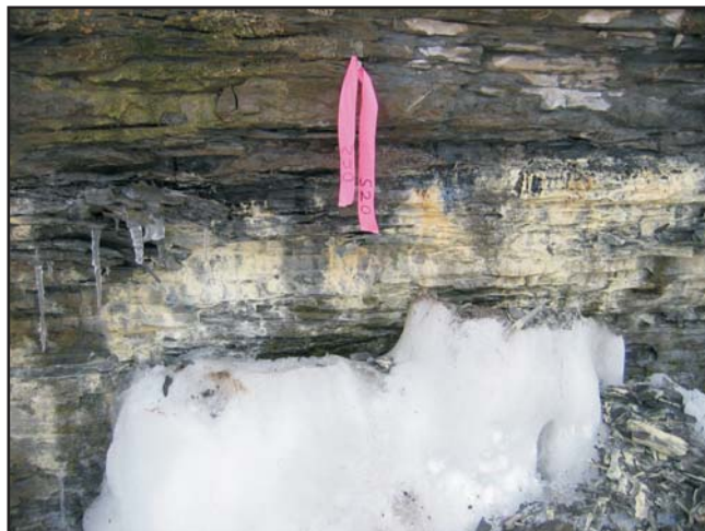
Seep 20: Image taken 3/17/08. Note black staining and white film on rock face. (Note: Rock face was not cleaned at this seep)