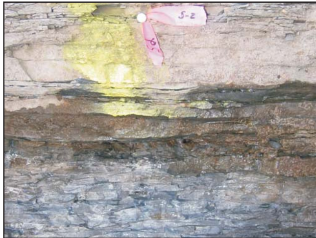
Seep 2: Image taken after cleanup of rock face on 3/17/08.