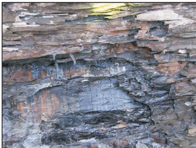
Seep 12: Image taken after cleanup of rock face on 3/17/08.