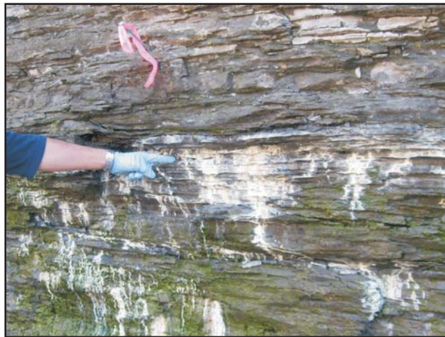
Seep 22: White film and black tar globules noted on rock face during inspection on 4/10/08.