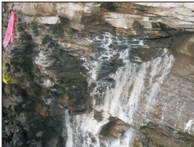
Seep 3: Slight white film, tar globules, and sheen noted during inspection on 4/10/08.