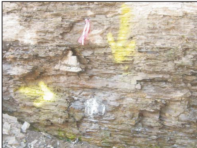
Seep 5: Slight white film developing and rust discoloration noted during inspection on 4/10/08.