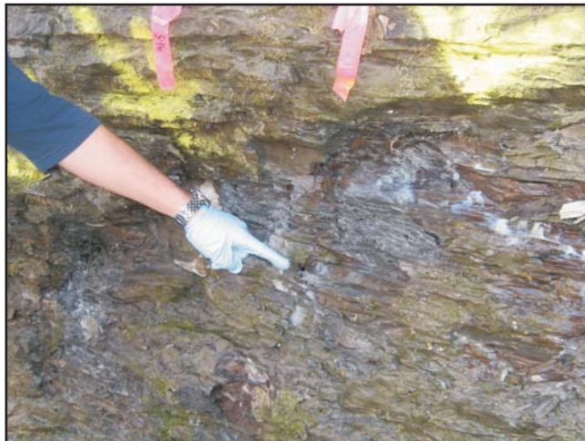
Seep 16: Slight white film developing. Note black staining and tar globules. Slight odor observed during inspection on 4/10/08.