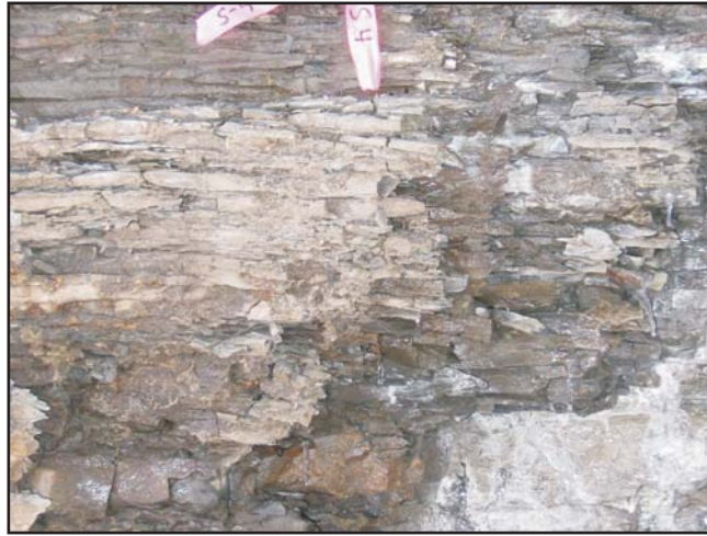
Seep 4: Image taken 3/17/08. Note slight black staining on rock surface.