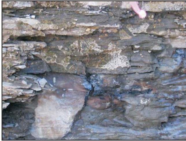
Seep 16: Image taken 3/17/08. Note black staining and slight sheen on rock face.