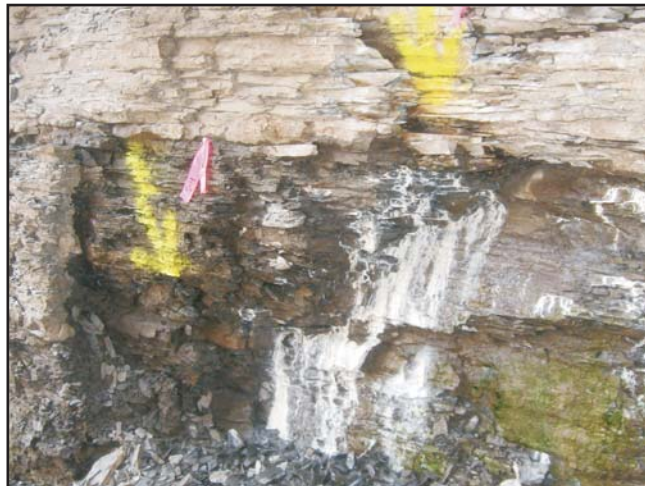
Seep 4: Slight white film developing on Seep 4, noted by the yellow arrow on the left. Image taken on 4/10/08.