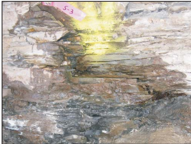
Seep 3: Image taken after cleanup of rock face on 3/17/08.