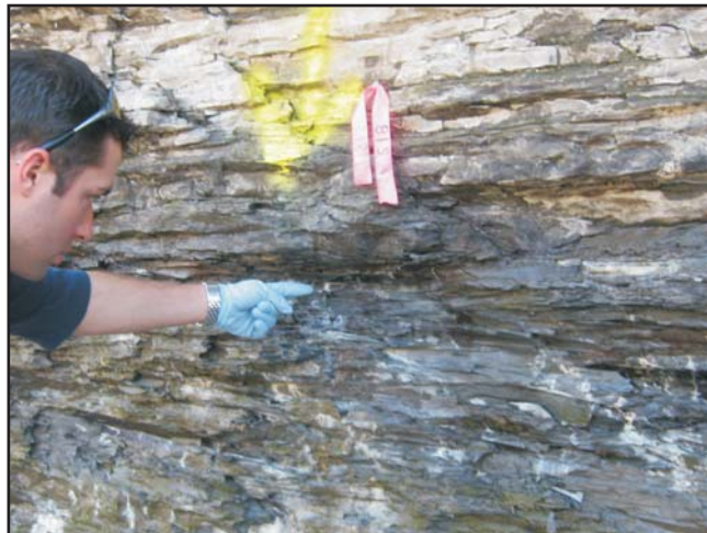
Seep 18: Slight white film developing, slight sheen observed. Note black staining. Image taken during inspection on 4/10/08.