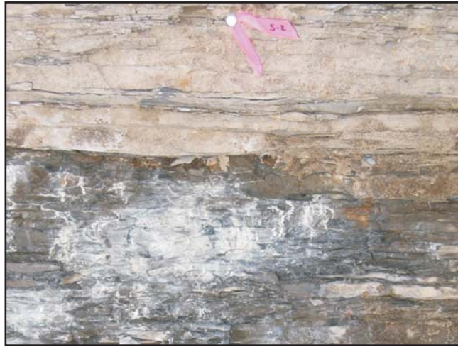
Seep 2: Image taken 3/17/08. Note black staining on rock face.