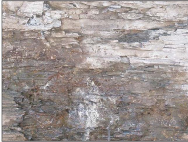
Seep 5: Image taken 3/17/08. Note slight black staining and white film.