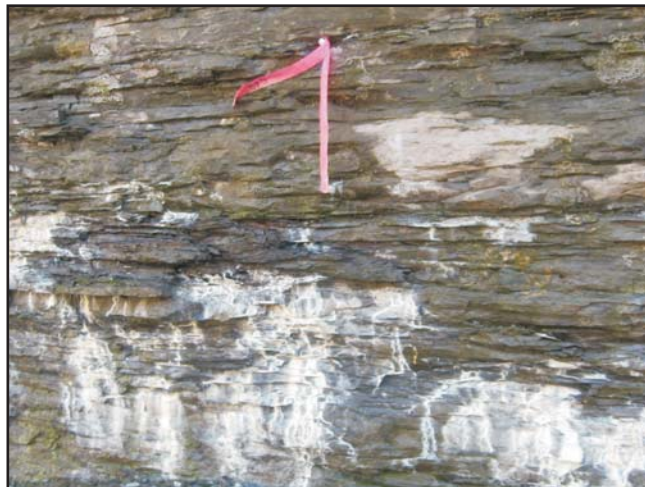
Seep 19: White film and black staining noted during inspection on 4/10/08.