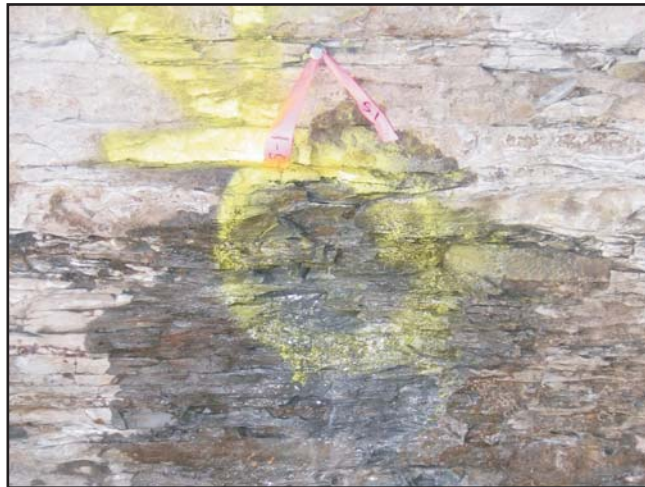
Seep 1: After cleanup of rock face (3/17/08).