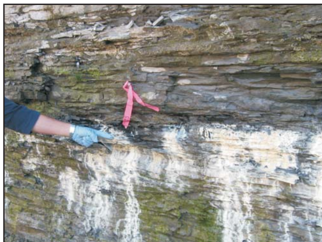
Seep 20: Black staining, tar globules, and odor during inspection on 4/10/08.