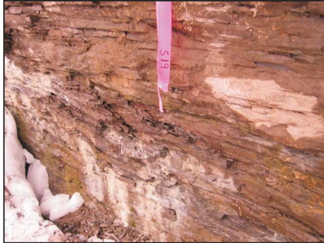
Seep 19: Image taken 3/17/08. Note black staining and white film on rock face. (Note: Rock face was not cleaned at this seep).