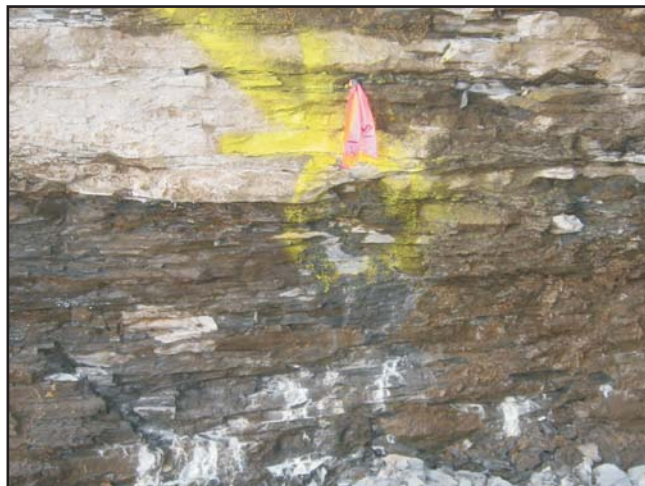
Seep 1: No noticable seep activity (4/10/08).