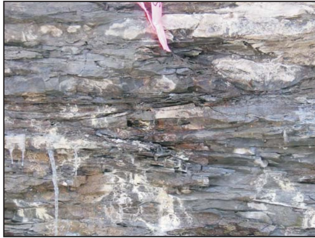
Seep 18: Image taken 3/17/08. Note black staining and white film on rock face.