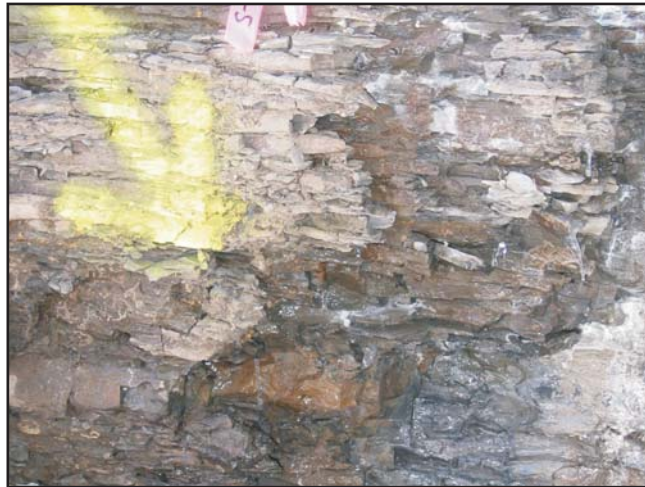
Seep 4: Image taken after cleanup of rock face on 3/17/08.