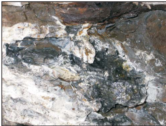
Seep 3: Image taken 3/17/08. Note black staining and NAPL globules.