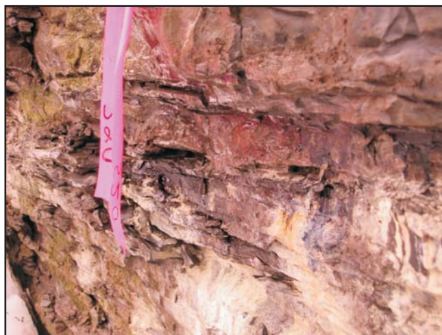
Seep 20: Closeup image taken on 3/17/08. Note black tar stains.