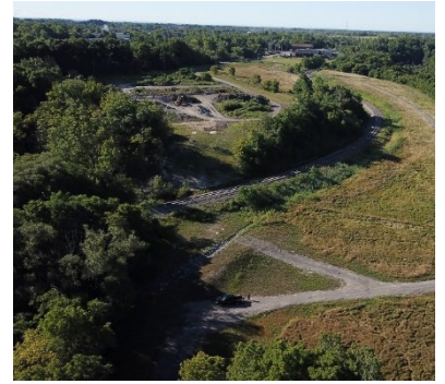
Restored surfaces along completed sewer alignment, access road left in place for future use

Construction of the relocated Gulf Interceptor Sewer began in August 2021 and concluded in September 2022 at the Old Upper Mountain Road site. The new sewer connects the existing line at Old Upper Mountain Road to the north end of the site at Niagara Street, bypassing the site. Figure 1 details the historical sewer path, the newly constructed sewer path, and the limits of the site operable units, limits of waste removal, and footprint of proposed on-site and off-site disposal containment cells. The off-site containment cell will be located in the Lockport City Landfill, an adjacent state superfund site (Site No. 932010).