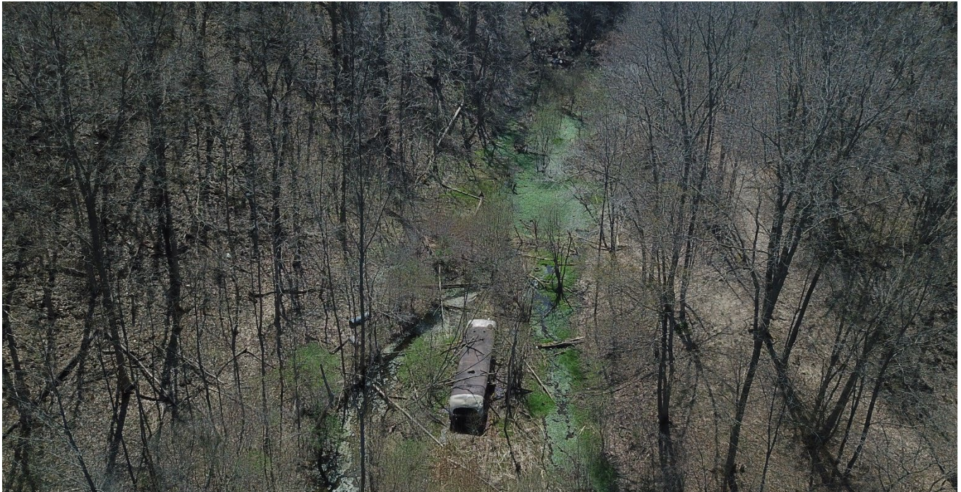
Portion of Old Upper Mountain Road Site OU-2 to be remediated and restored during the remedial construction phase at the site.

Cleanup activities in these areas will include excavation of contaminated soil and sediment, solidification, and consolidation of excavated soil in on- and off-site areas that will be fully covered and contained by an engineered cover.