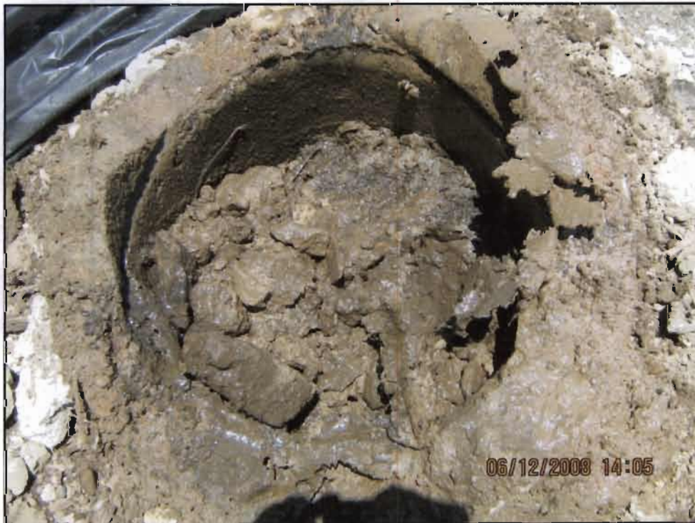
An inside view of a metal container (approximately 55-gallon capacity) encased within concrete was uncovered during the excavation of the contaminated soil.