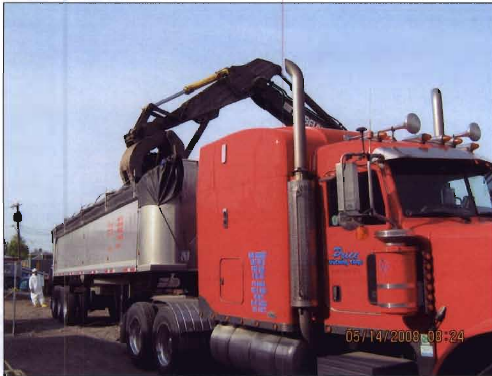
Loading demolition debris for removal and off-site disposal.