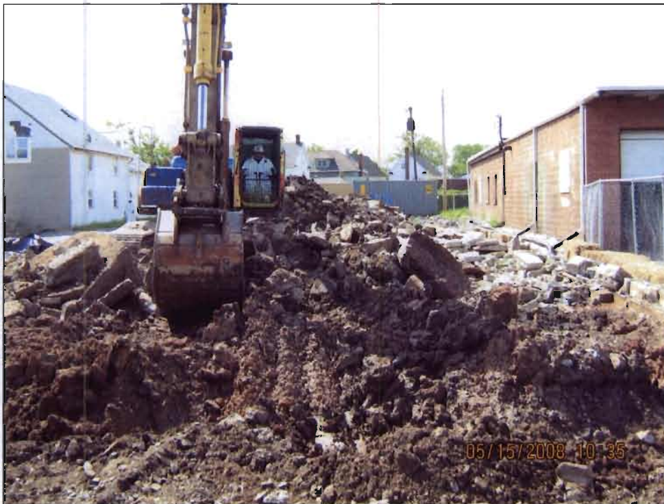
WRS removing concrete flooring and footers of the former MRS Plating Shop building.