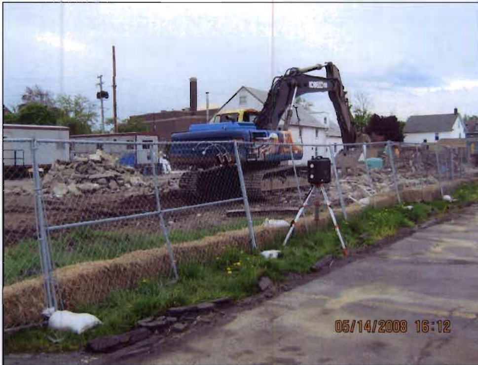
WRS removing concrete flooring and footers of the former MRS Plating Shop building. Air Monitoring Station #1 is shown in the foreground.