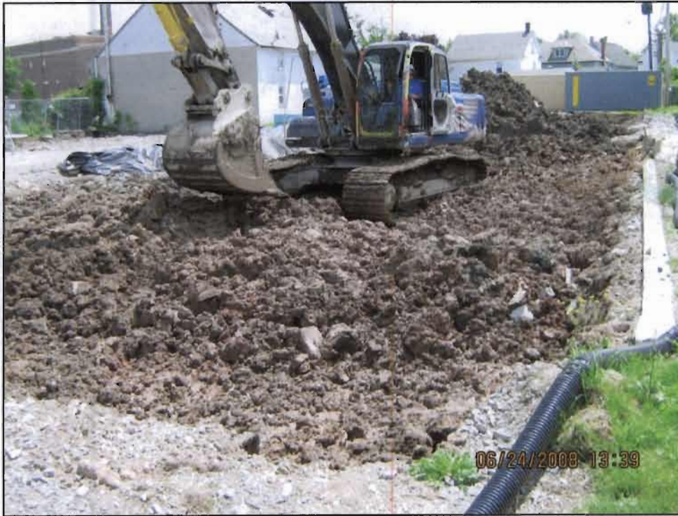
WRS personnel treating contaminated soil with cement to facilitate drying and reduce the TCE vapors for off-site disposal at Michigan Disposal facility, Belleville, MI.