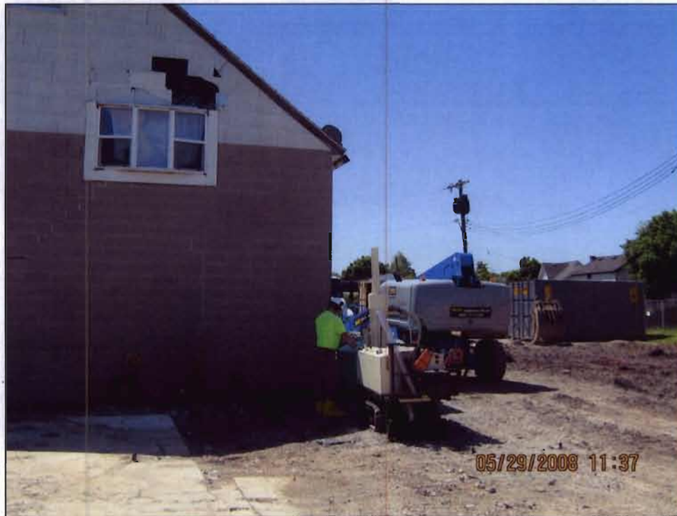
View toward south showing Geoprobe ® setup. Soil boring and sampling performed at the former MRS Plating Office building area and north of the private residential property.