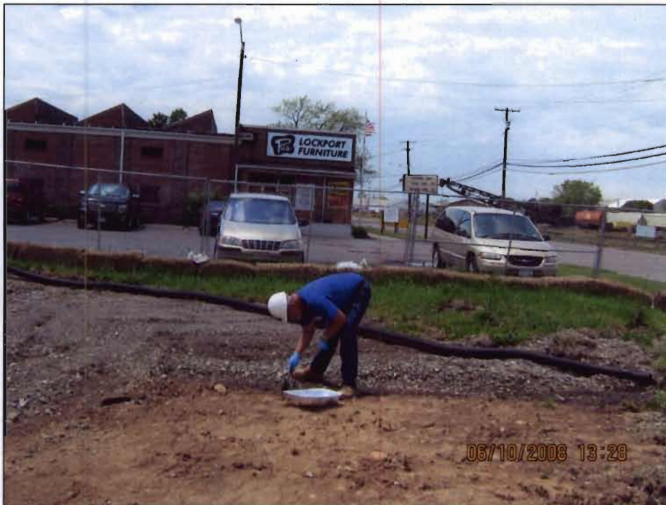
WRS personnel collecting non-hazardous soil samples from the area located north of the former Plating Shop Building and along the Park Avenue.