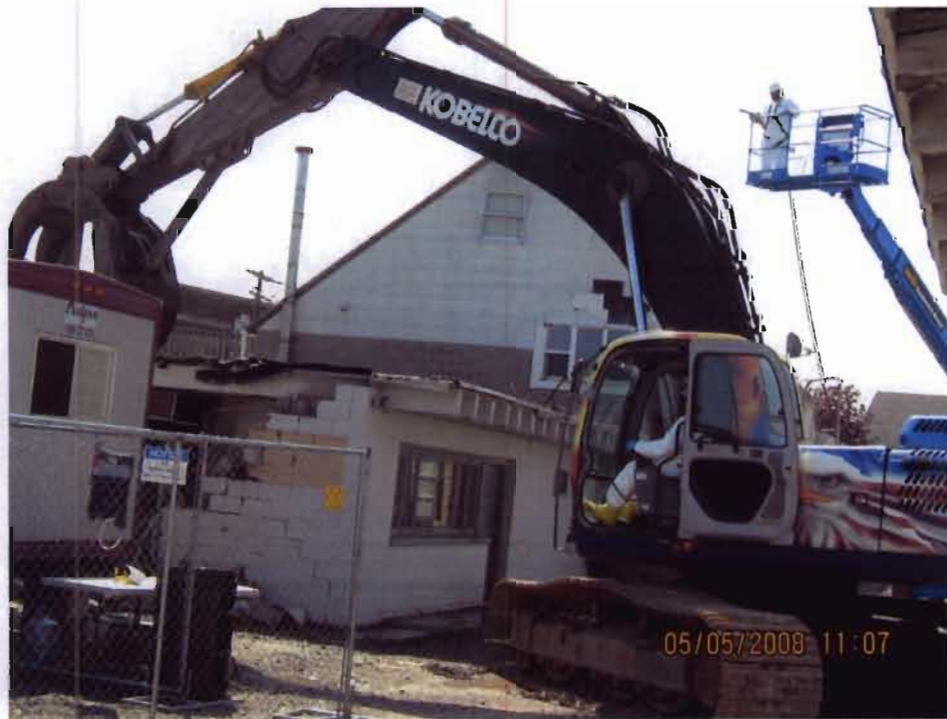
Demolition of the MRS Plating Office.