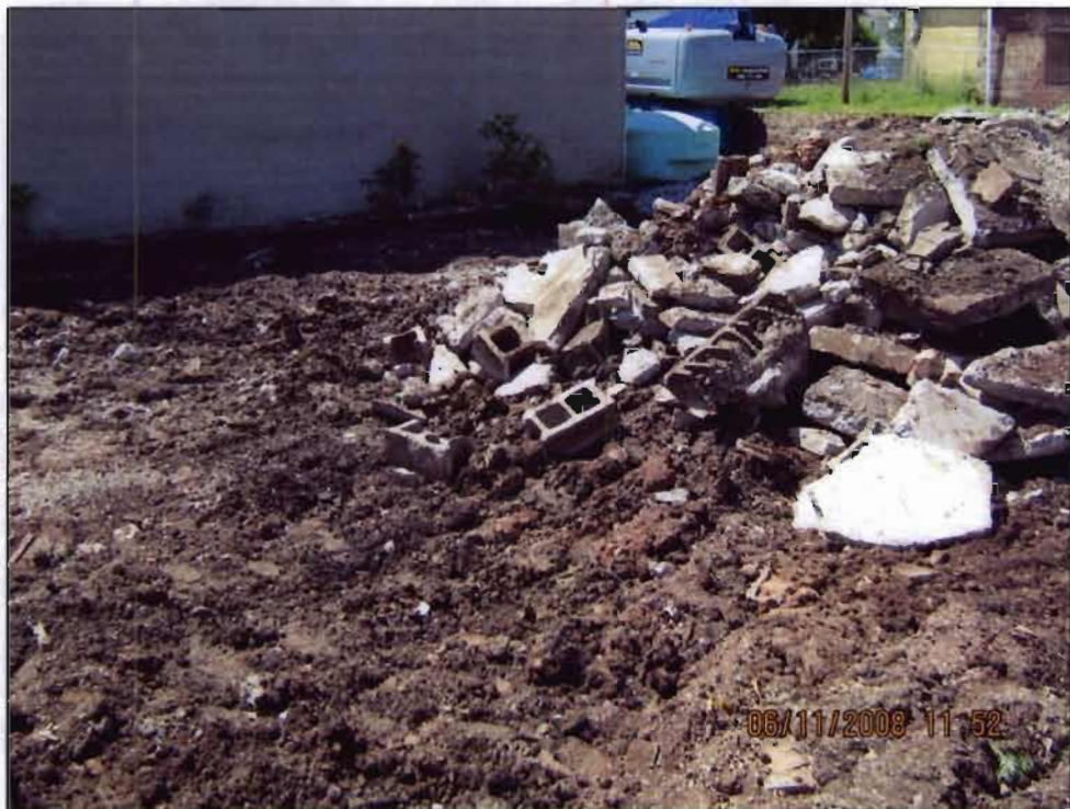
WRS removing the concrete floors and footers, view of the former office building location.