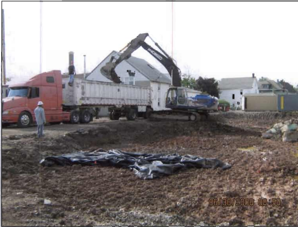
Loading of the contaminated soils, removed from the former MRS Plating Shop building area for the off-site treatment and disposal at Michigan Disposal facility, Belleville, MI.