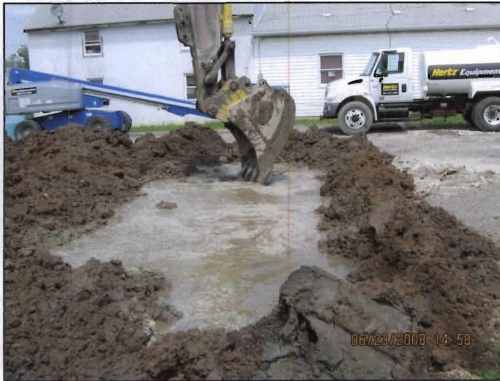
WRS personnel treating contaminated soil with cement to facilitate drying for off-site shipment for the disposal at Michigan Disposal facility, Belleville, MI.