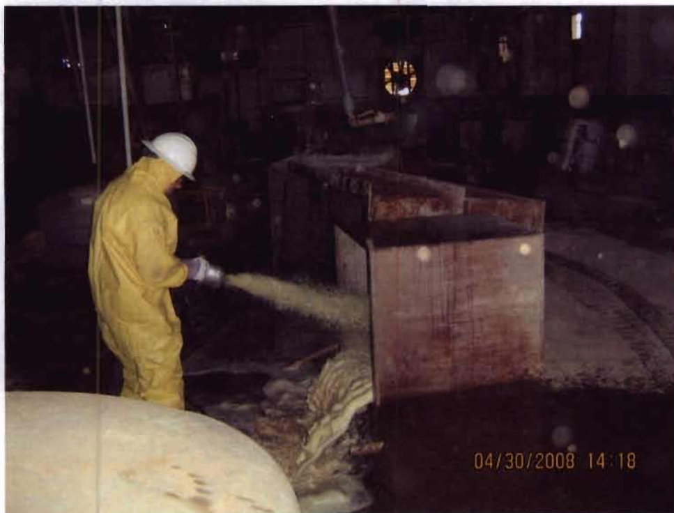
ERRS employee working inside the MRS Plating Shop cleaning a vat.