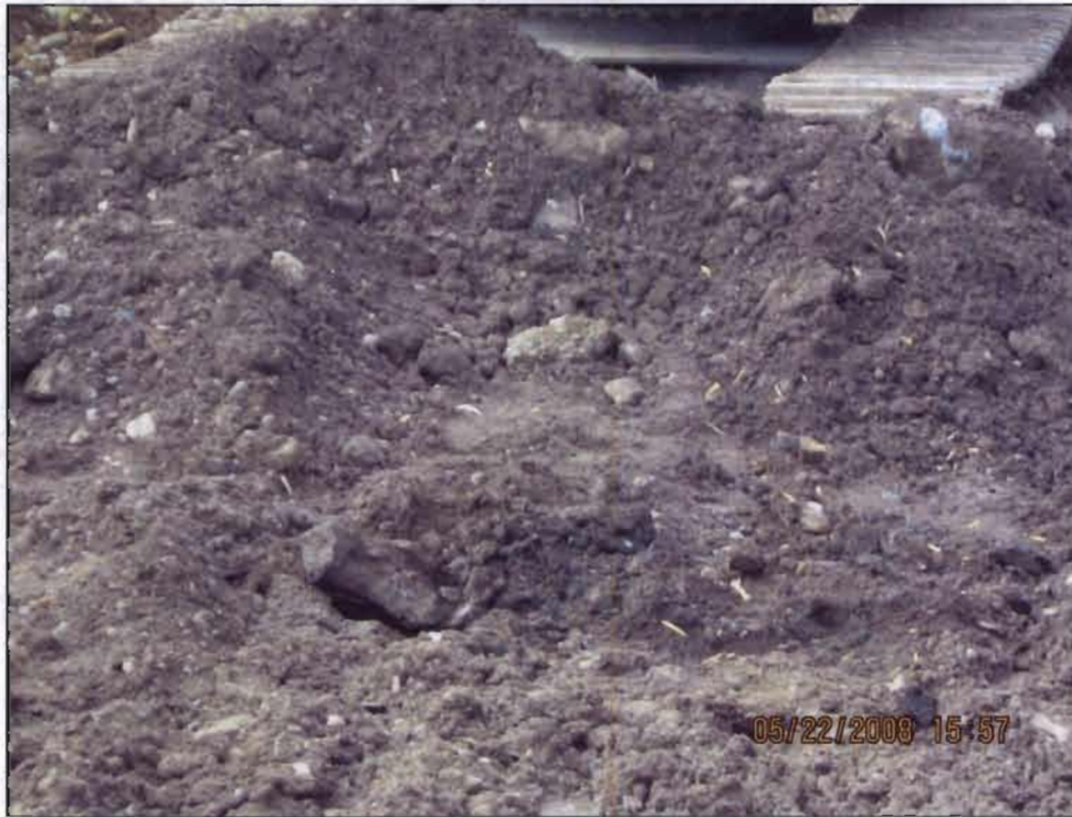
A view of the scattered plastic capsules uncovered during the MRS Plating Shop building's southern end floors removal. These plastic capsules found to be empty.