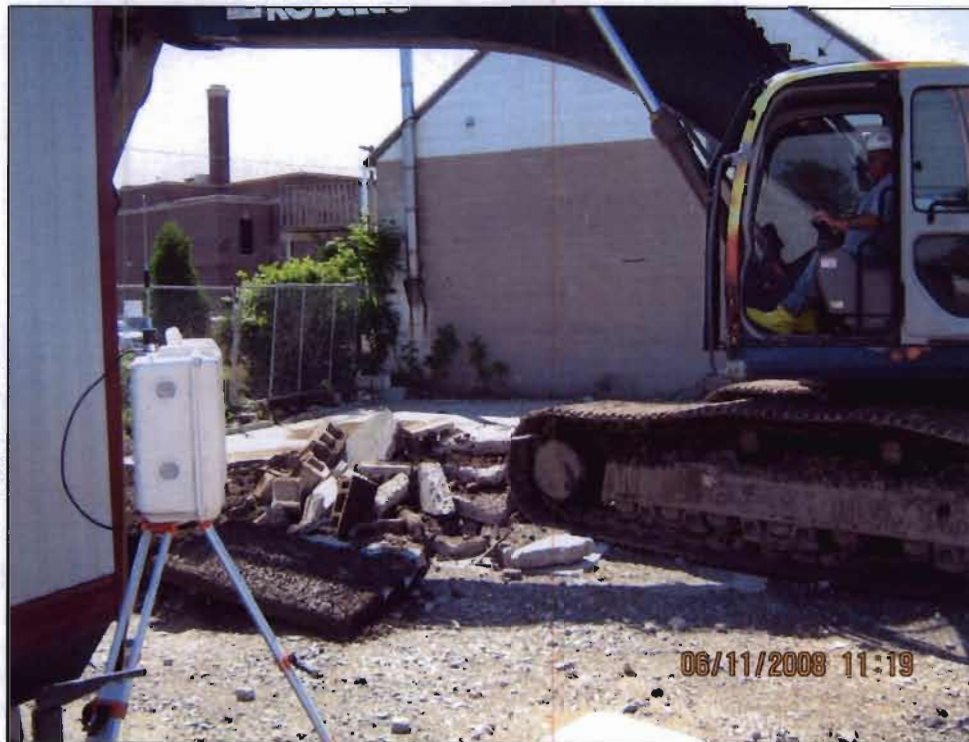
WRS removing the concrete floors and footers, view of the former office building location. Air Monitoring Station #2, picture displays AreaRAE in foreground.