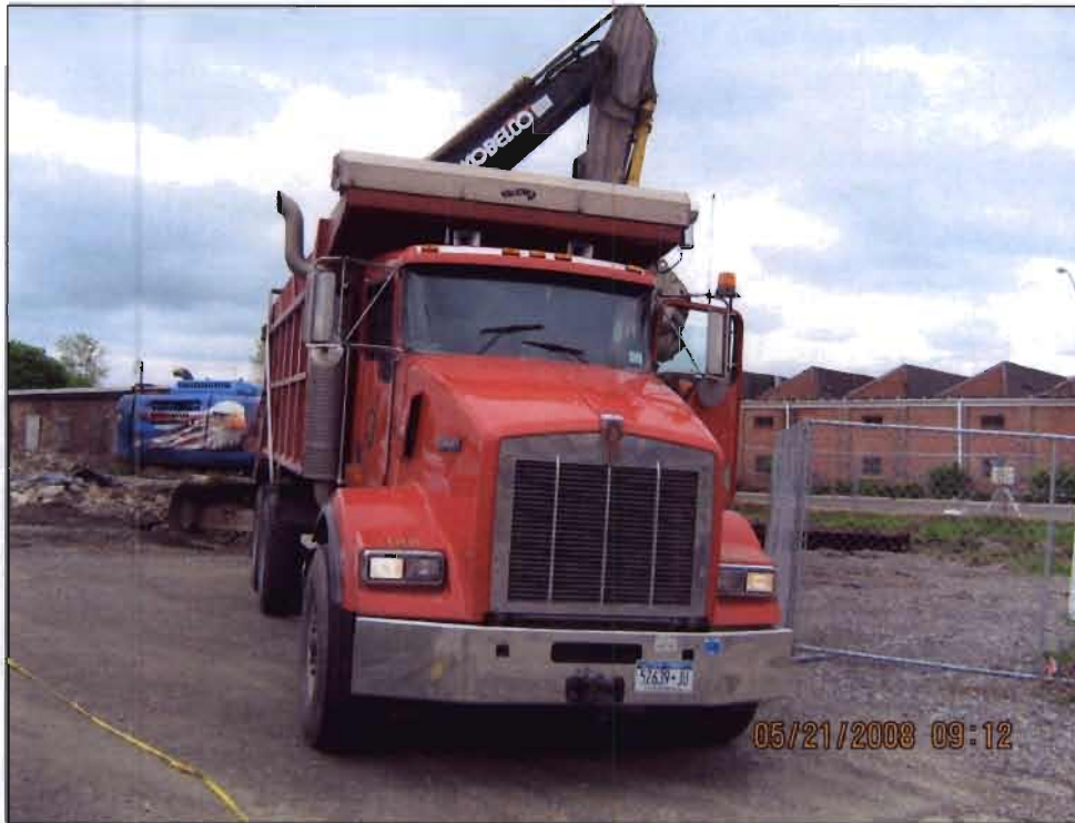
Loading of concrete debris removed from the MRS Plating Shop building floors and footers for removal.