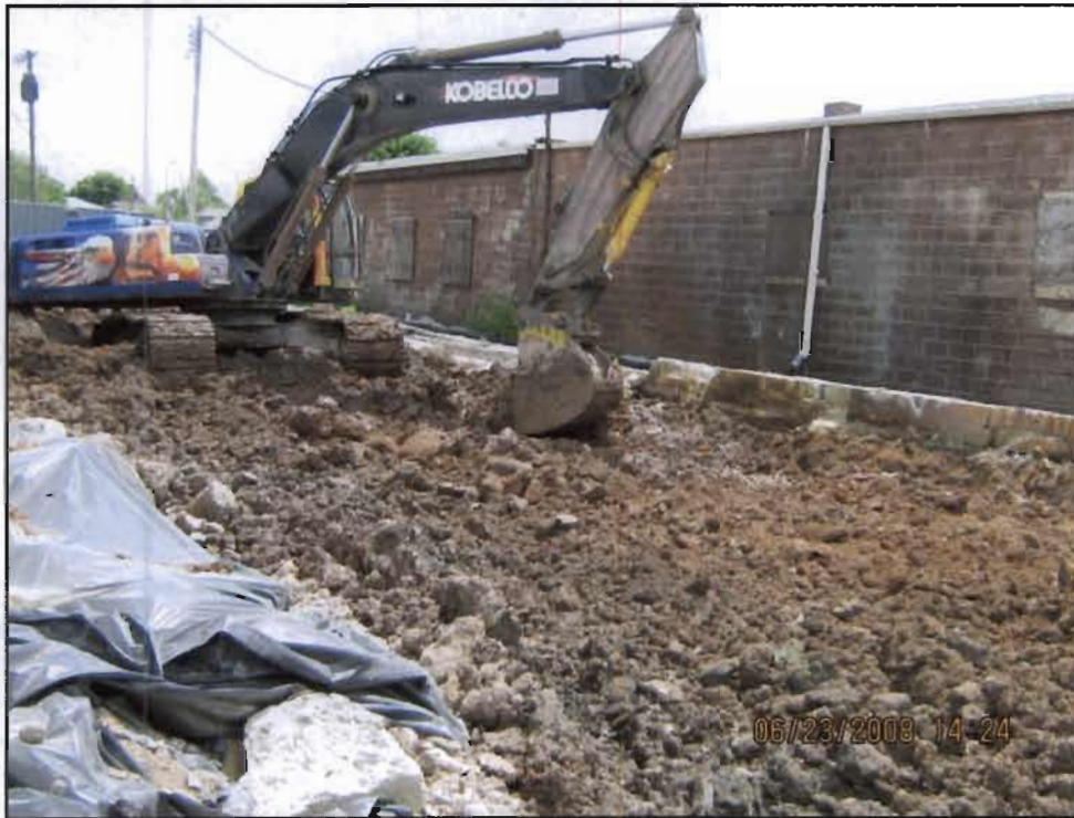
WRS personnel removing contaminated soil from the former plating shop building area and staging on site for off-site treatment and disposal.