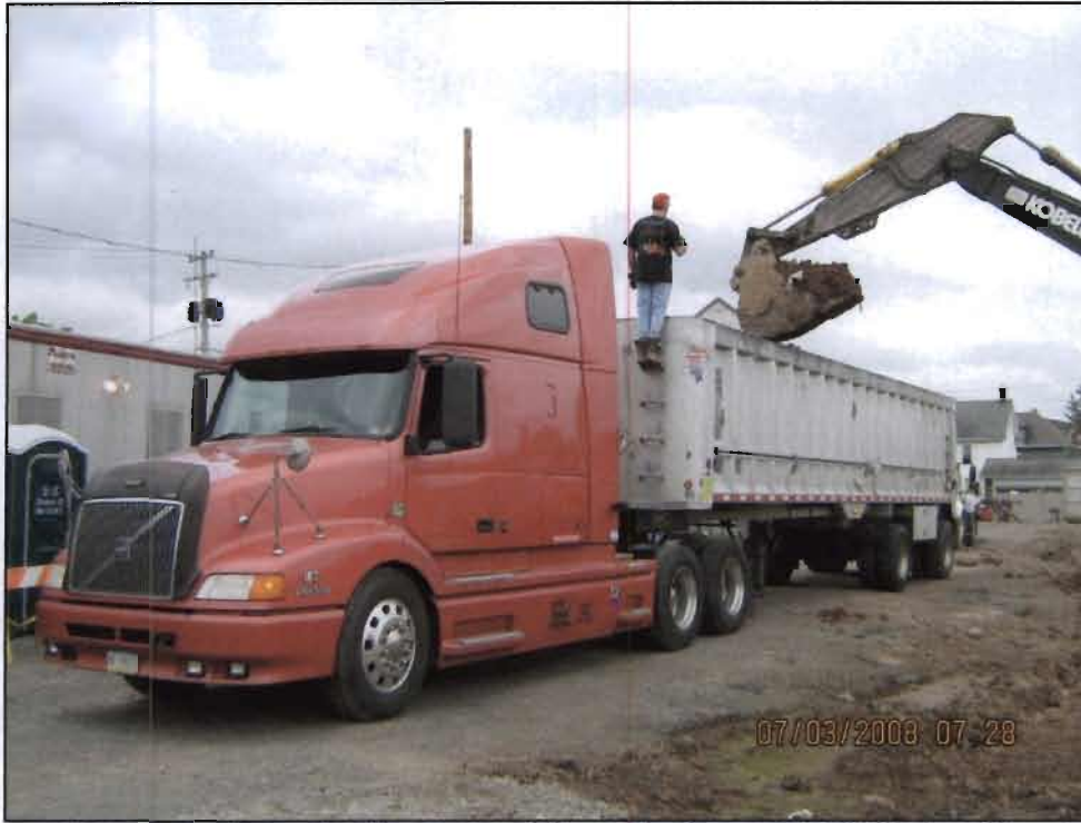
Loading of the contaminated soils, removed from the former MRS Plating Shop building area for the off-site treatment and disposal at Michigan Disposal facility, Belleville, MI.