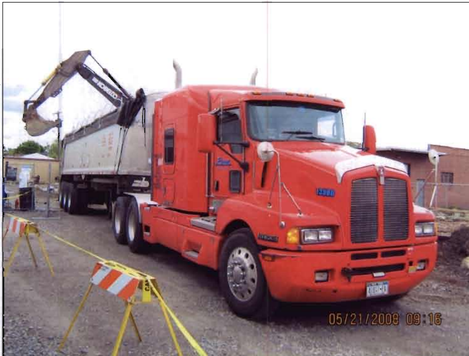
Loading of concrete debris removed from the MRS Plating Shop building floors and footers for removal.