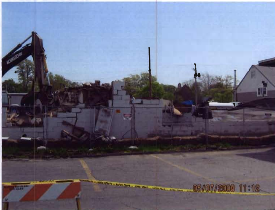
Demolition of the MRS Plating Shop, view from the furniture store parking lot.