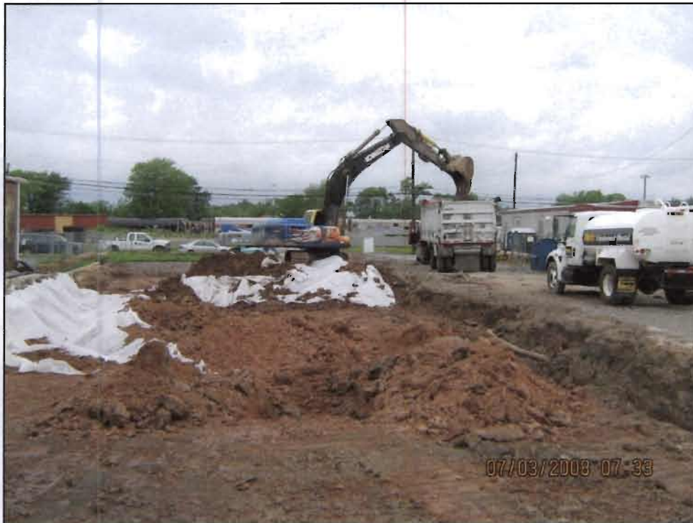
Loading of the contaminated soils, removed from the former MRS Plating Shop building area for the off-site treatment and disposal at Michigan Disposal facility, Belleville, MI.