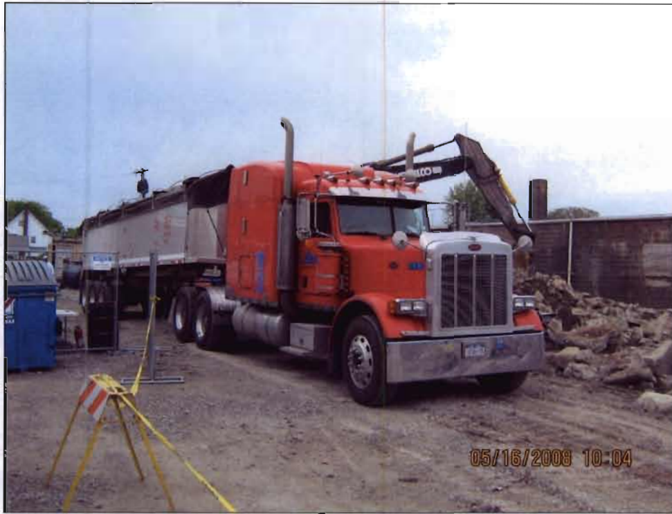
Loading of concrete debris removed from the MRS Plating Shop building floors and footers for removal.