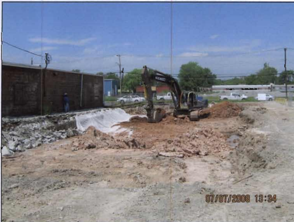
View of the facility, looking north, towards Park Avenue. Stockpiling soils, removed from the former MRS Plating Shop building area for the off-site treatment and disposal.