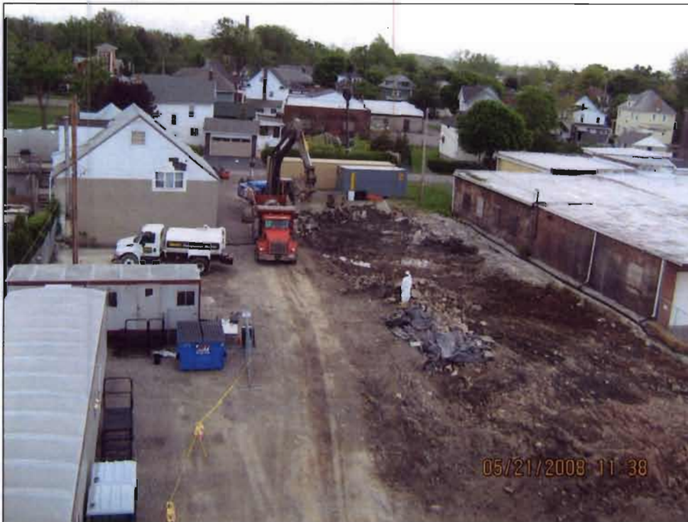
Overview of the MRS Plating Facility looking towards Rene Place. Loading of concrete debris removed from the MRS Plating Shop building floors and footers for removal.