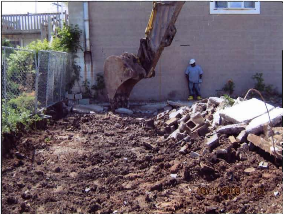
WRS removing the concrete floors and footers, view of the former office building location.