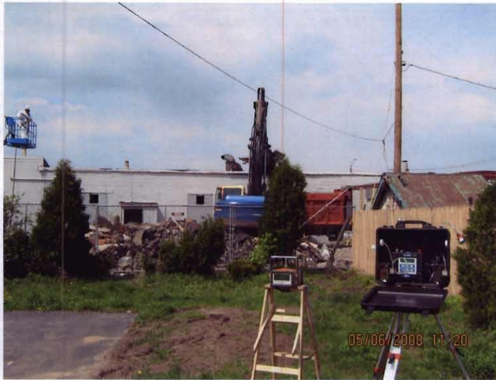
Demolition of the MRS Plating Office from Monitoring Station #2.