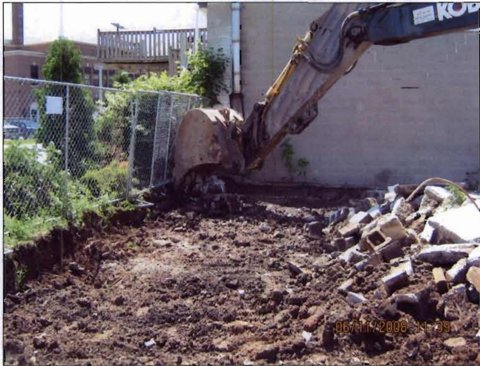
WRS removing the concrete floors and footers, view of the former office building location.