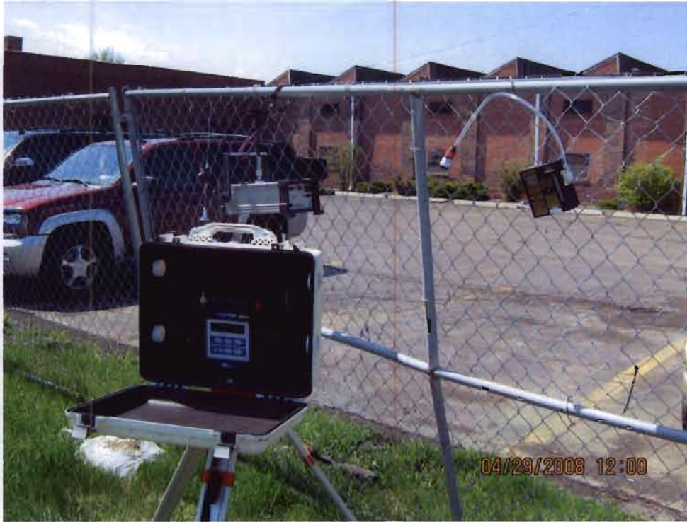
Air Monitoring Station #1. The Furniture Store Parking Lot is located in the distance.