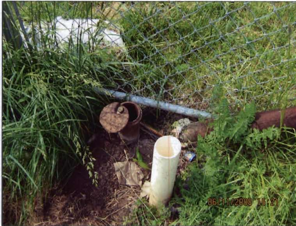
View of the MRS Plating facility's sewer discharge vent pipe located along the Park Avenue.