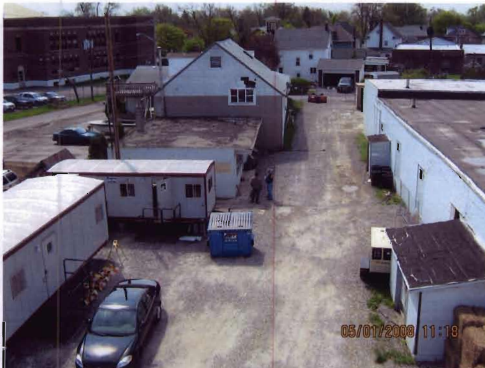
MRS Plating looking towards Rene Place.