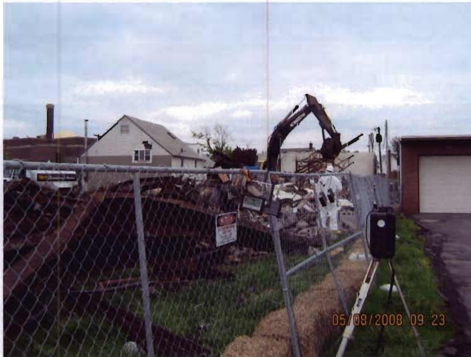
Demolition of the rear of the MRS Plating Shop.