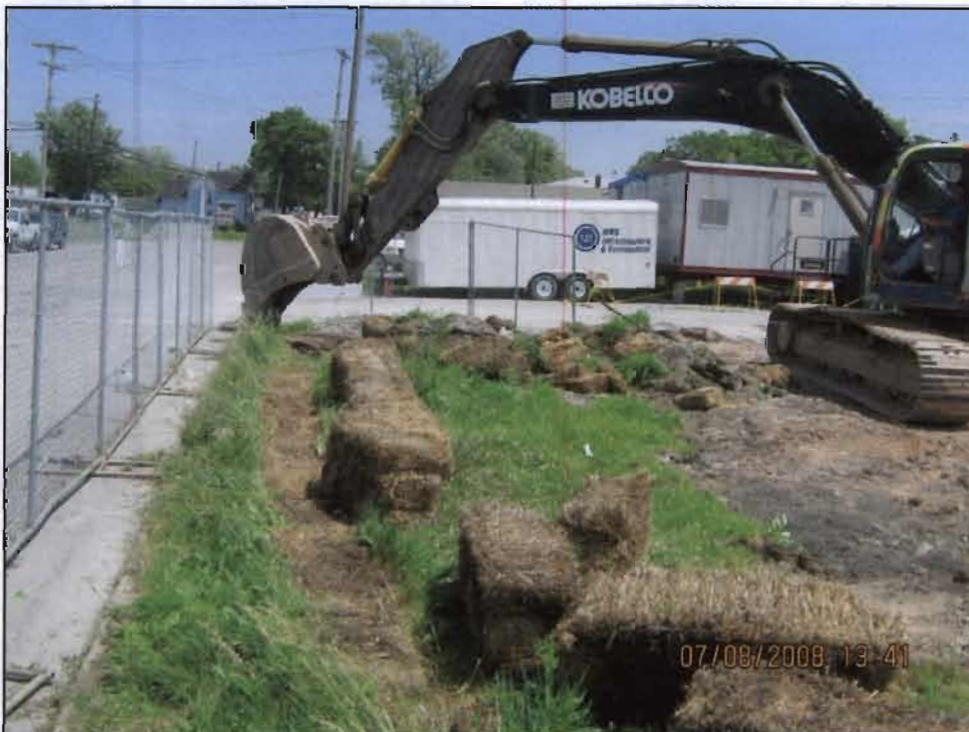
WRS removing top soils (approximately 6 inches) from the northern property area along the Park Avenue for the purpose of grading and replacement with clean fill.