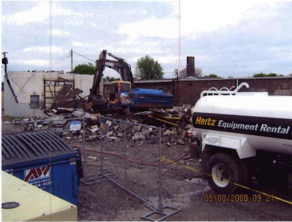
Demolition of the rear of the MRS Plating Shop.