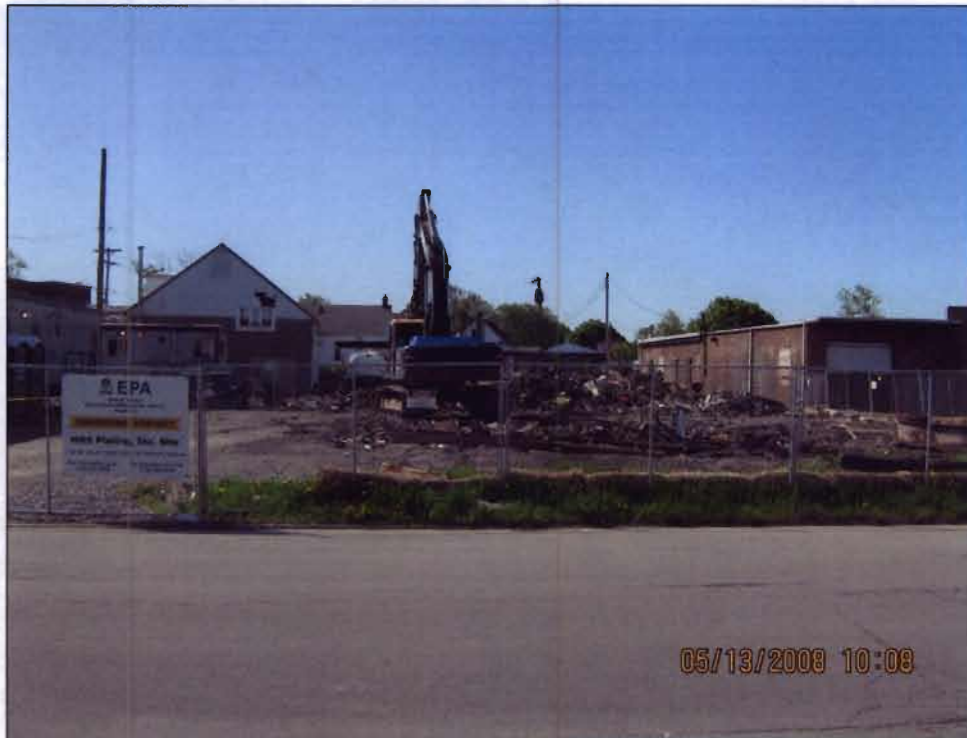
WRS segregates demolition debris of the MRS Plating Shop building materials.