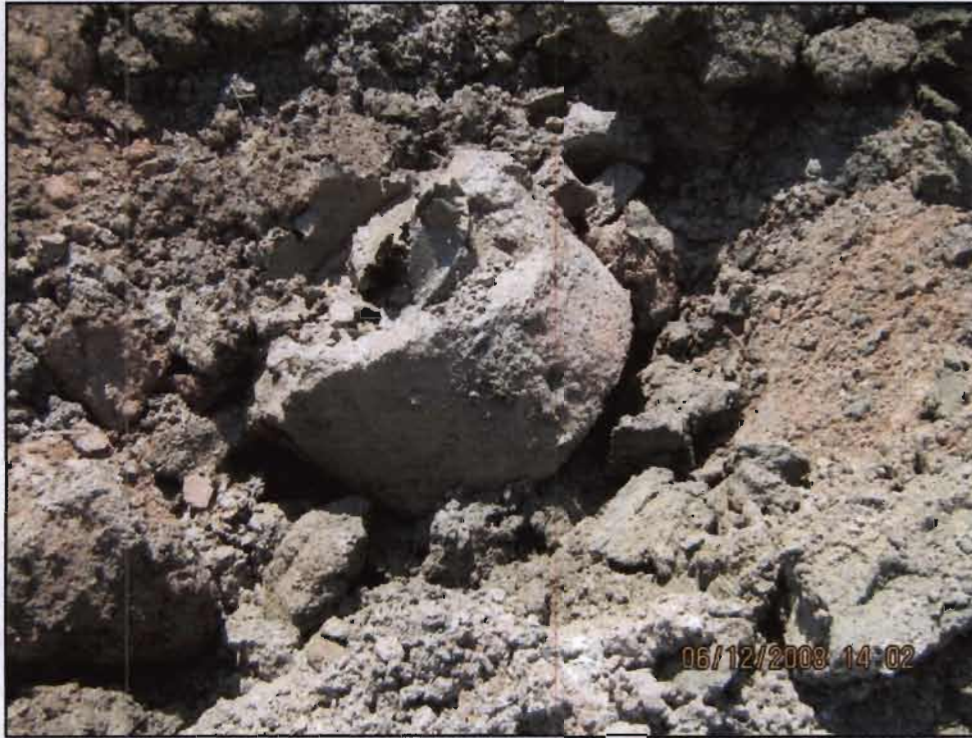
View of a tank (55-gallon) encased within concrete was uncovered during the excavation of the contaminated soil.