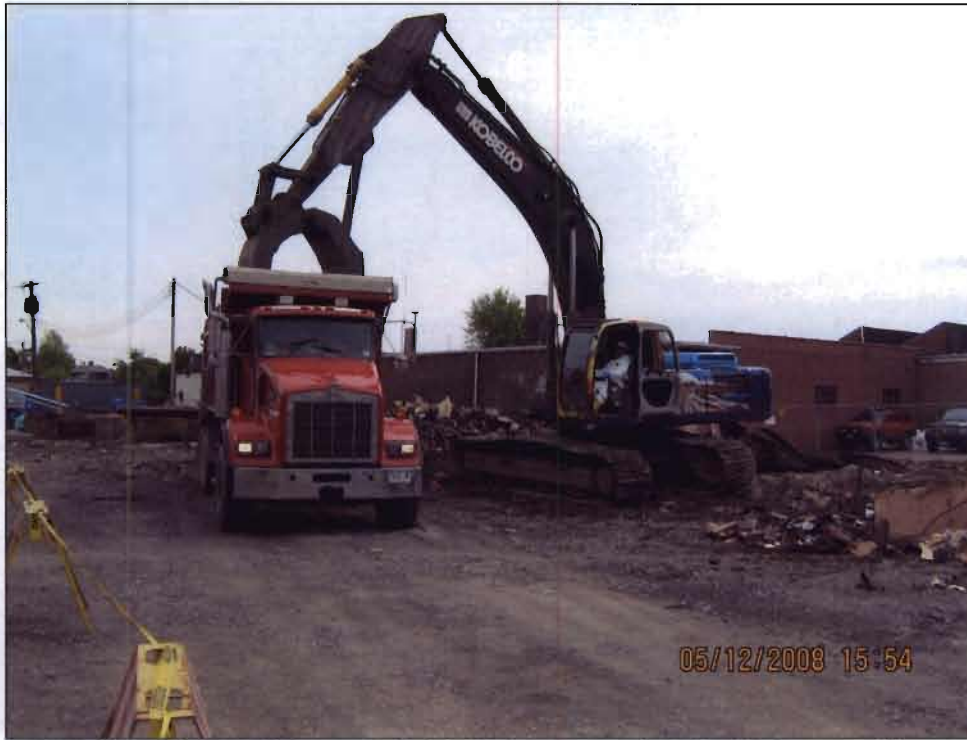
Loading of demolition metal debris for removal and off-site recycling.