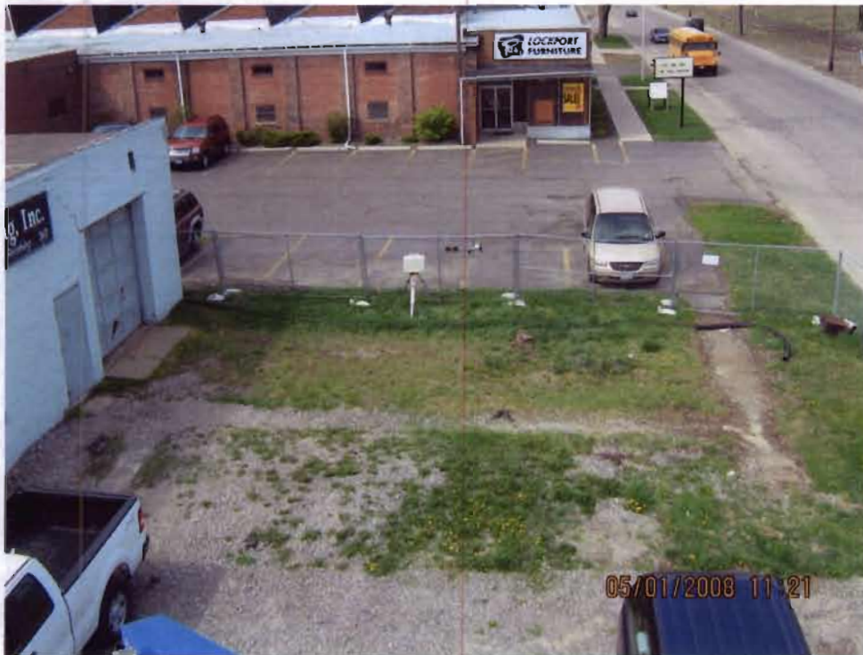
Front of the MRS Plating Shop. The Furniture Store is located in the background