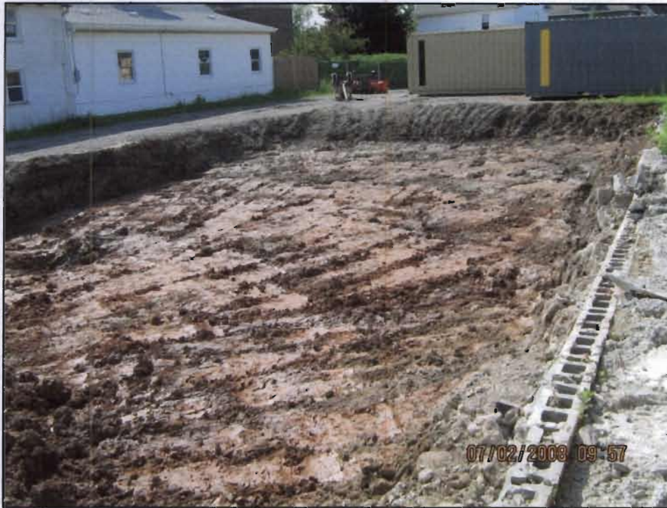
View of the southern half excavation at the former Plating Shop building location after the removal of the contaminated soils. Looking southeast towards Rene Place.