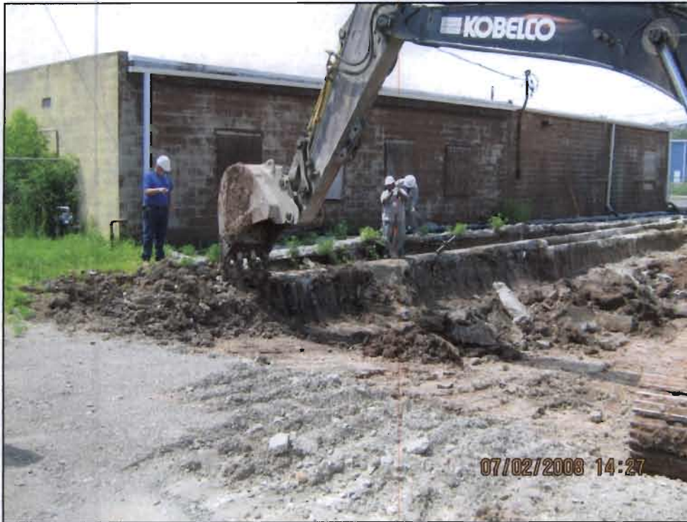
WRS removing soils at the former Plating Shop building foundation located along the adjacent furniture store building (located west) for off-site shipment and disposal.