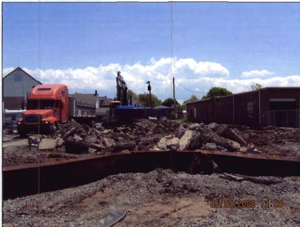
Loading of concrete debris removed from the MRS Plating Shop building floors and footers for removal.