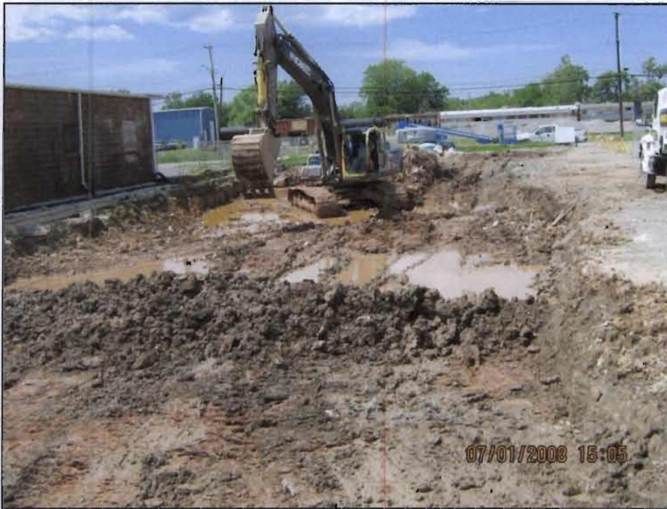
WRS removing soils at the former Plating Shop building location along the adjacent furniture store building (located west) for off-site shipment and disposal.