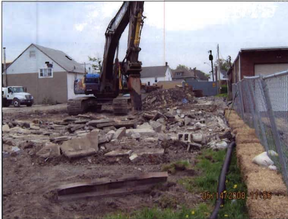
WRS removing concrete flooring and footers of the former MRS Plating Shop building.