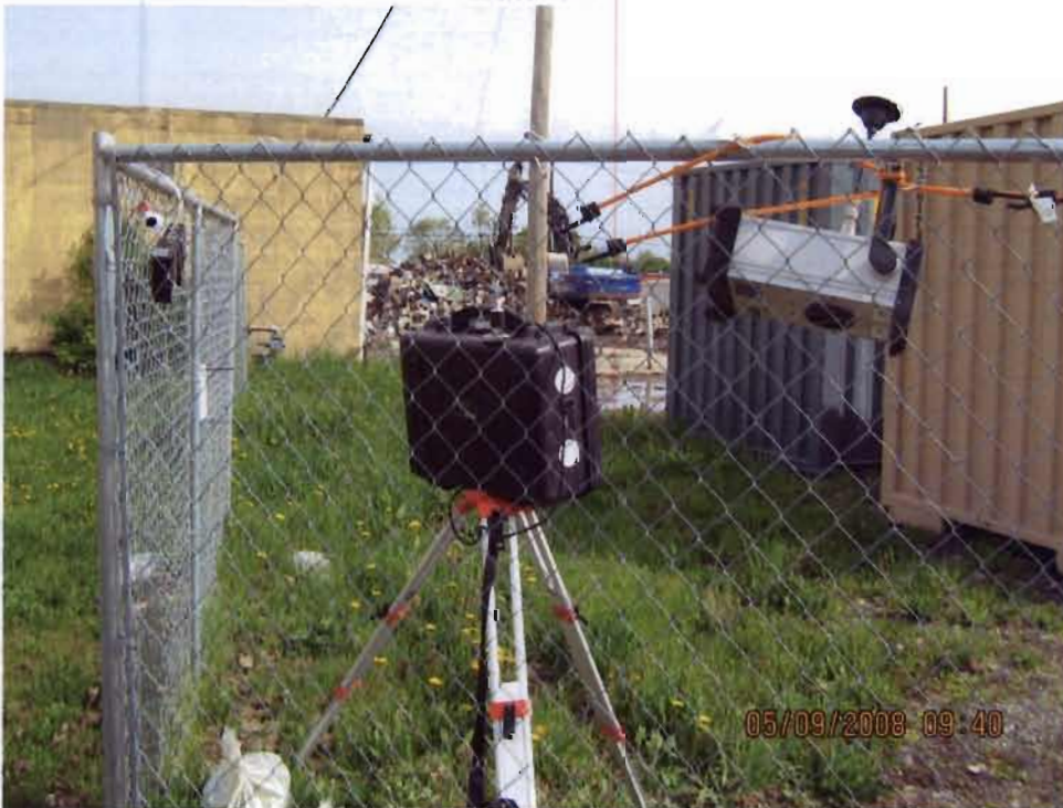
Air Monitoring Station #4, Picture displays Area-RAE, SKC Pumps and Data-RAM Monitor.