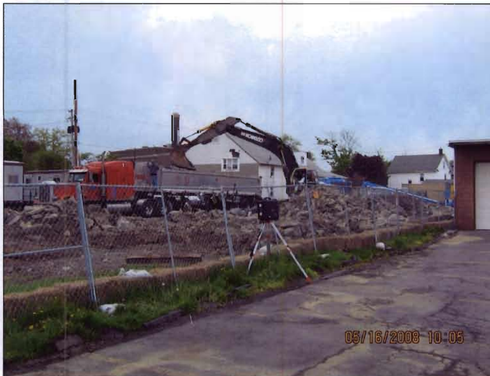
Loading of concrete debris removed from the MRS Plating Shop building floors and footers for removal. Air Monitoring Station #1 is shown in the foreground.