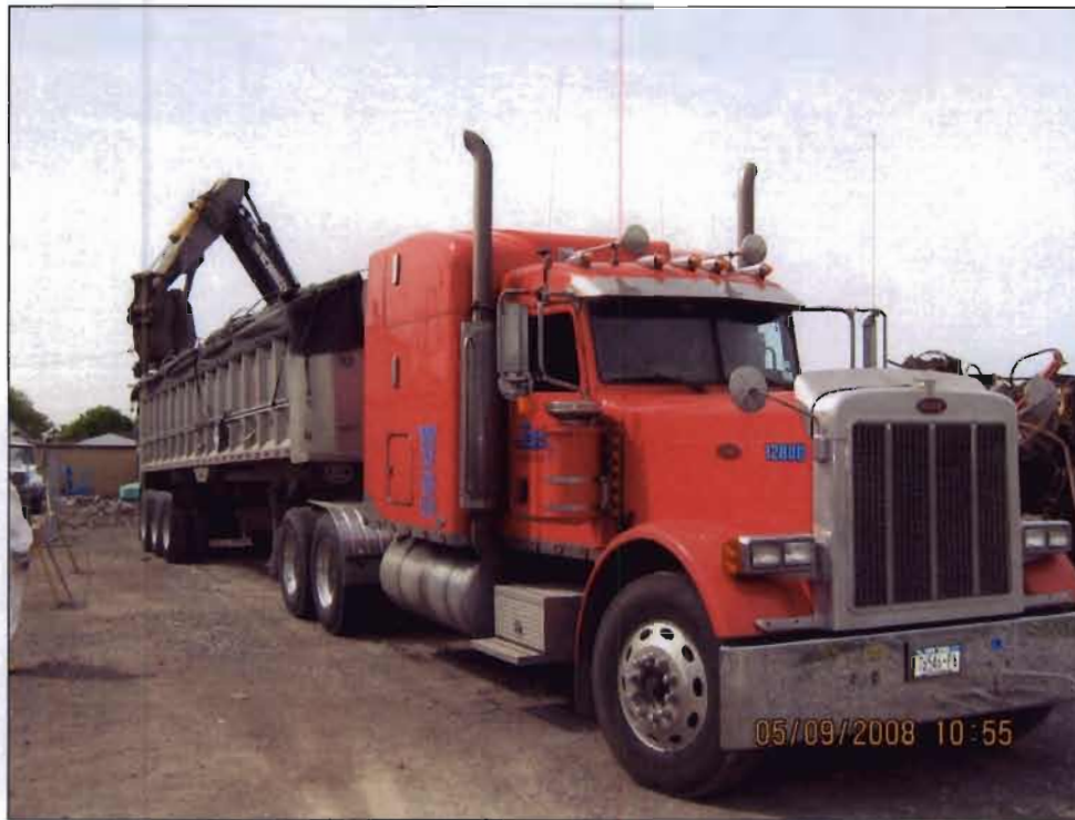
Loading of demolition debris for removal and off-site disposal.