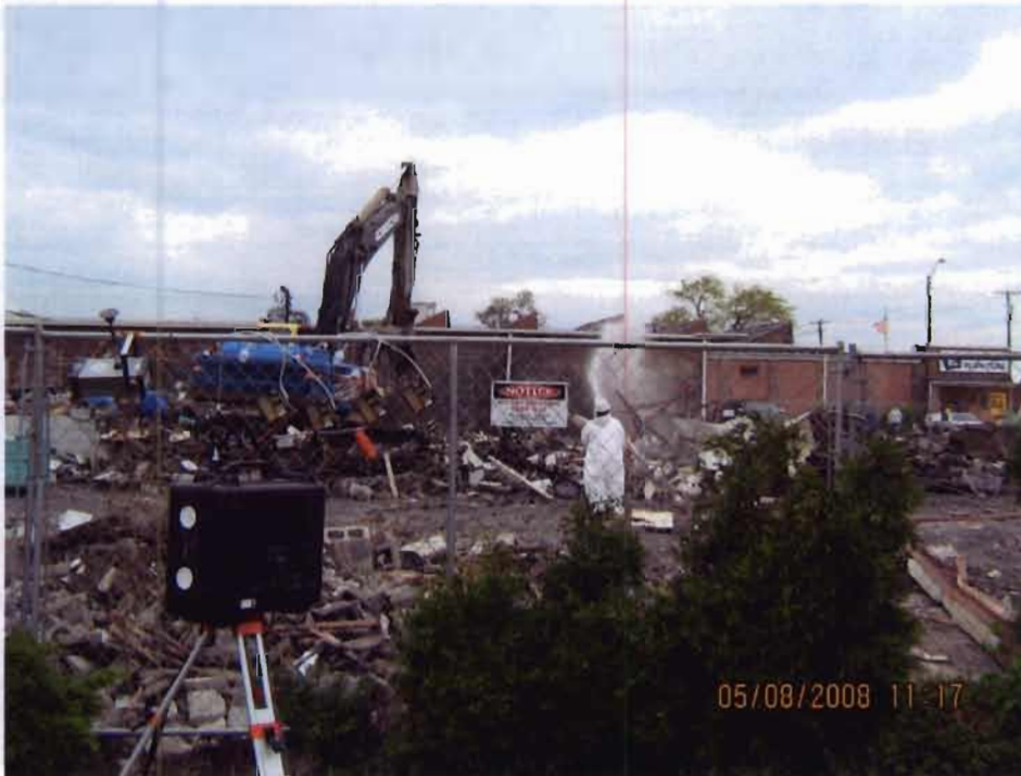
WRS Personnel conducting dust suppression during the demolition of the MRS Plating Shop.