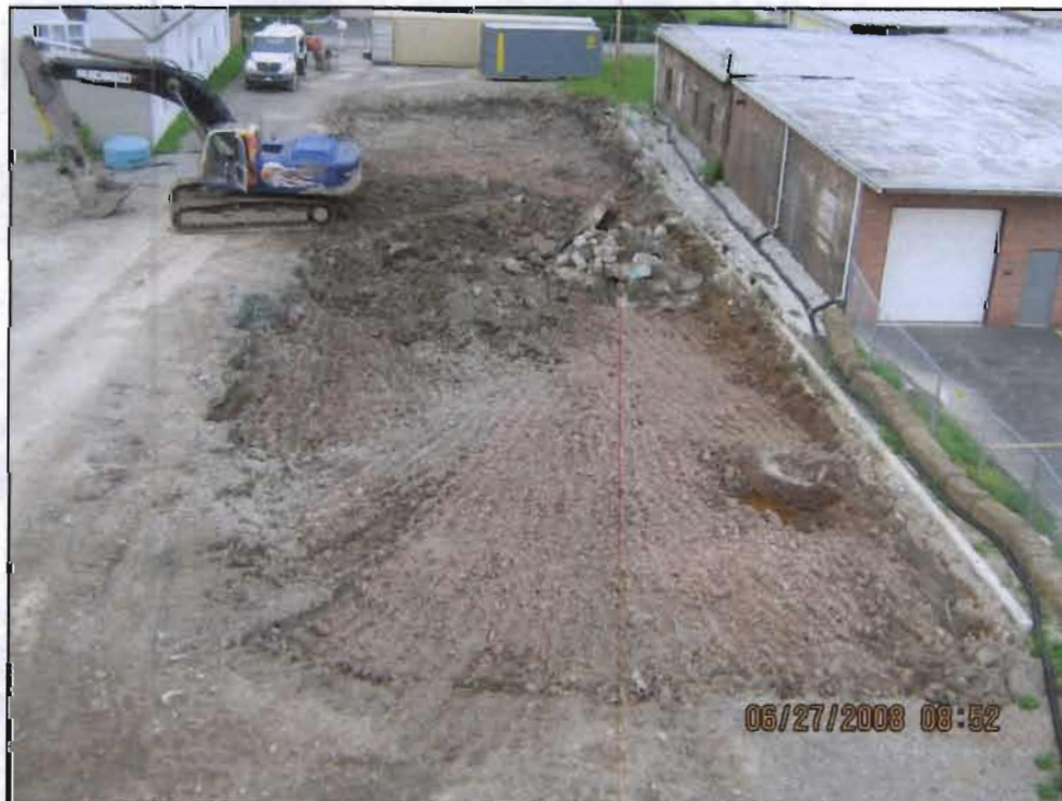
Overview of the facility looking towards (South) Rene Place. The adjacent private residence to east and the furniture store building to the west are in the background.