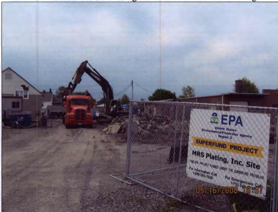
Loading of concrete debris removed from the MRS Plating Shop building floors and footers for removal.