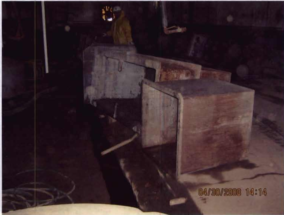
Empty vats inside the MRS Plating Shop.