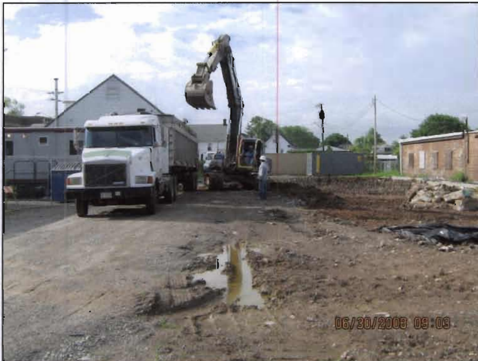
Loading of the contaminated soils, removed from the former MRS Plating Shop building area for the off-site treatment and disposal at Michigan Disposal facility, Belleville, MI.