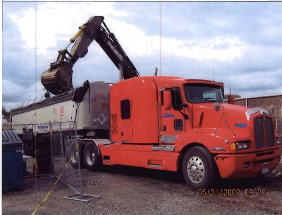
Loading of concrete debris removed from the MRS Plating Shop building floors and footers for removal.