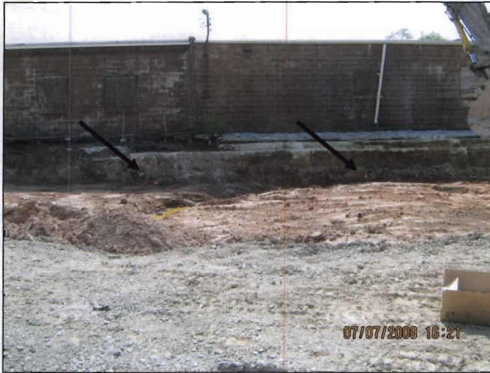
View of the excavation at the former plating shop building location. Note locations (red flags) of the two confirmation/post-excavation soil samples, looking west.