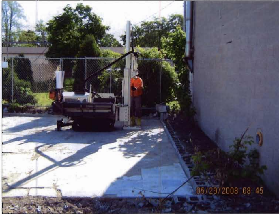
View toward east showing Geoprobe® setup. Soil boring and sampling performed at the former MRS Plating Office building area and north of the private residential property.