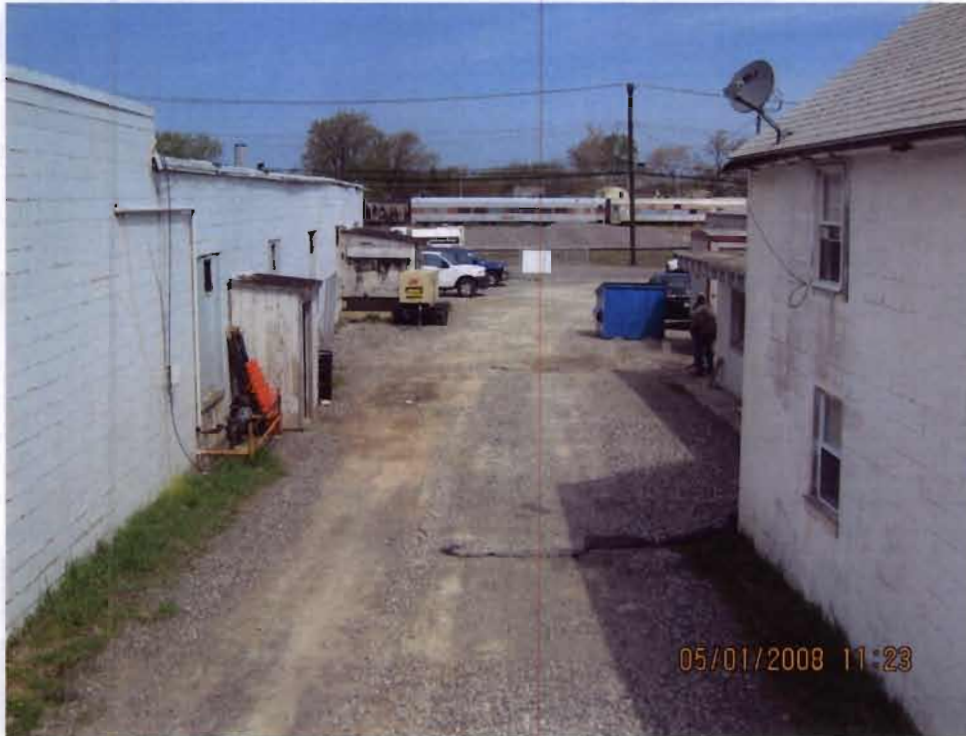
Gravel road separating the MRS Plating Shop and a Residential Home.