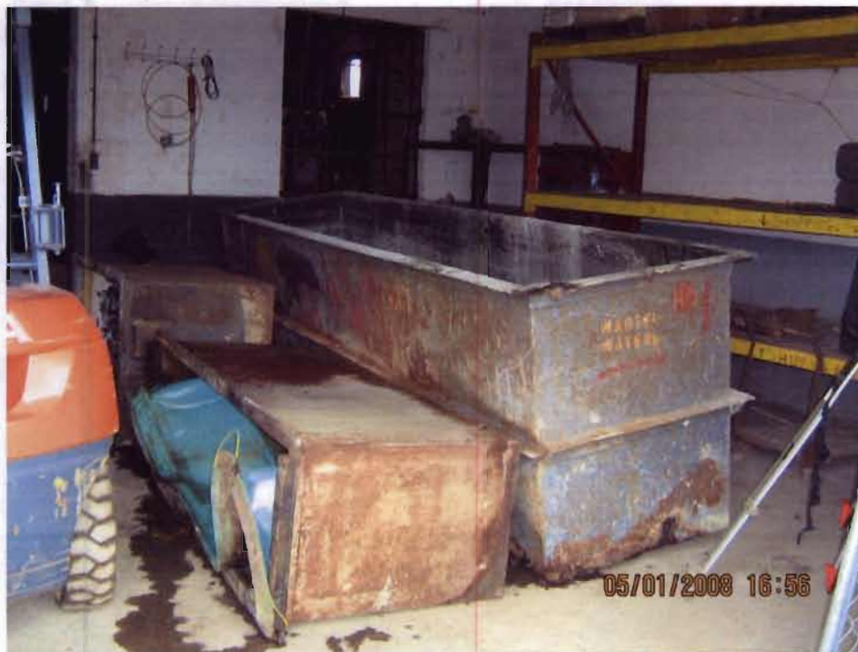
Wastewater storage vats located inside of the MRS Plating Facility.