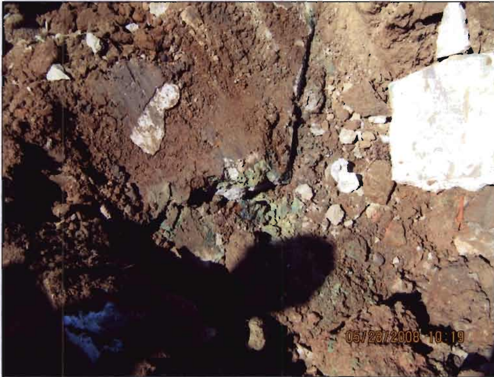
A view of the discolored soils noted during the test pit excavation at the former MRS Plating Shop building area.