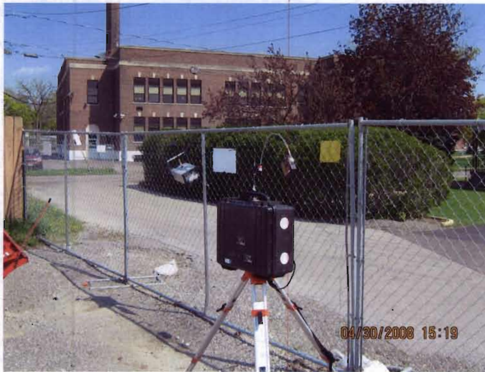
Air Monitoring Station#3. The Elementary School is located in the background.