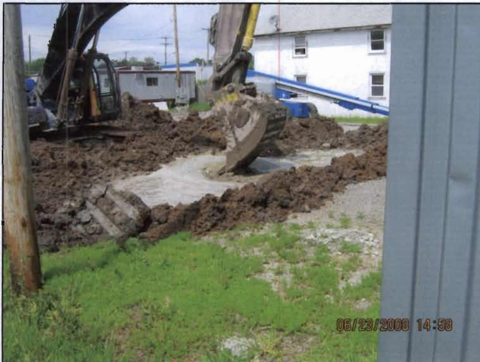
WRS personnel treating contaminated soil with cement to facilitate drying and reduce the TCE vapors for off-site disposal at Michigan Disposal facility, Belleville, MI.