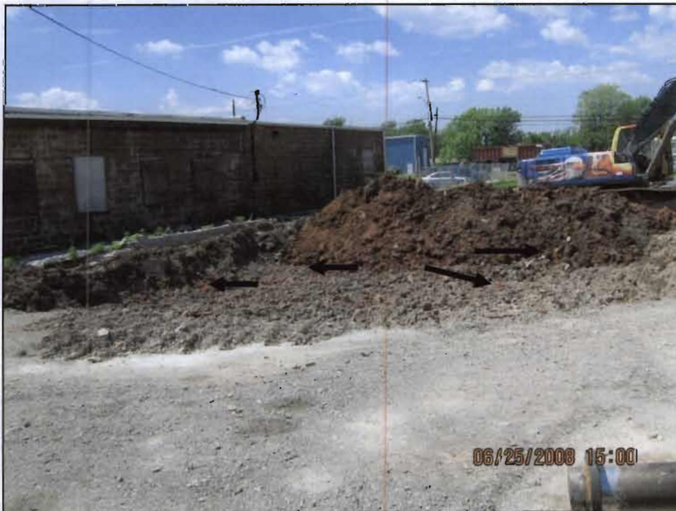
View of the southern section of the excavation along the Rene Place. Locations of the four Confirmation (post-excitation) soil sample collected for laboratory analysis.