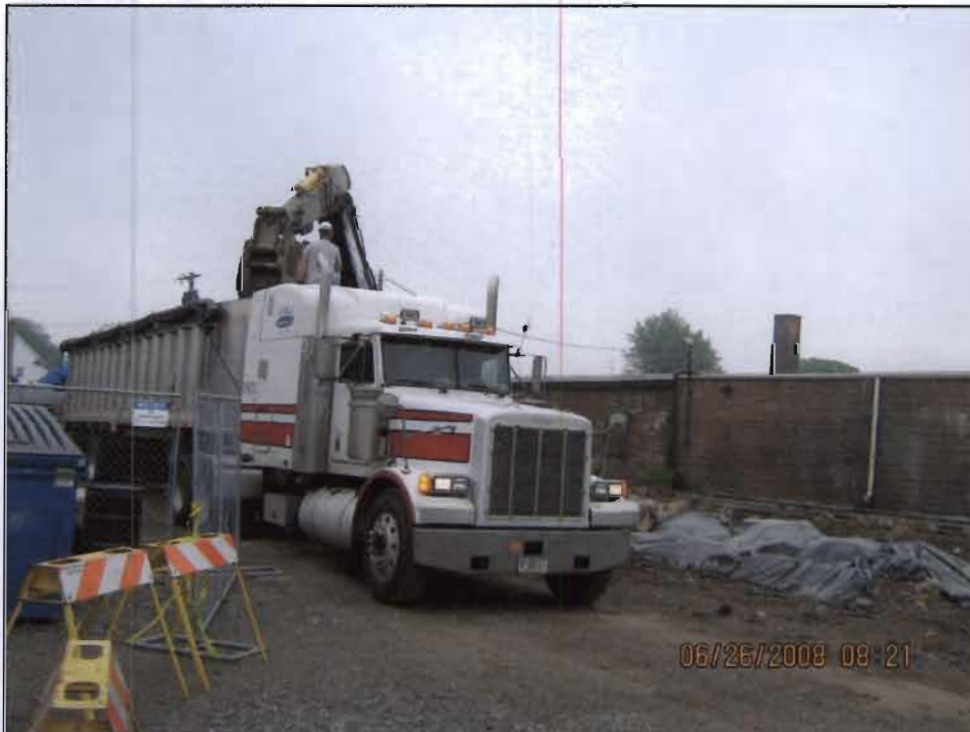
Loading of the contaminated soils, removed from the former MRS Plating Shop building area for the off-site treatment and disposal at Michigan Disposal facility, Belleville, MI.