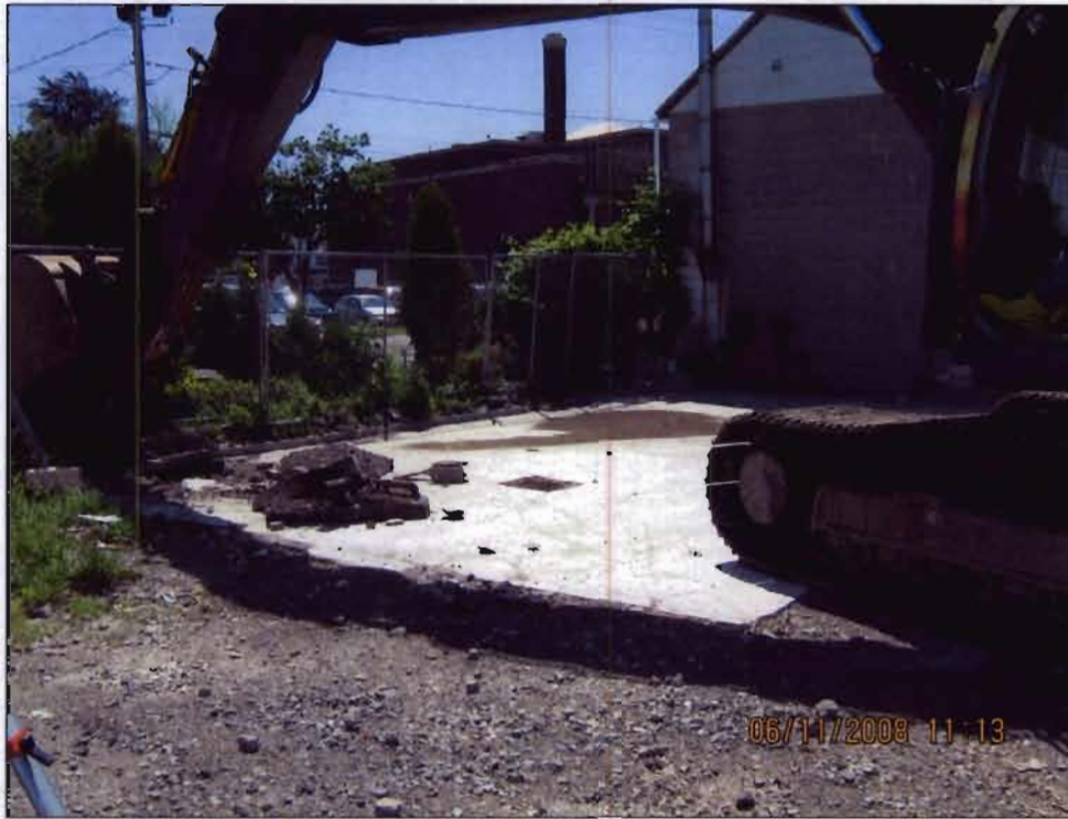
WRS removing the concrete floors and footers, view of the former office building location.