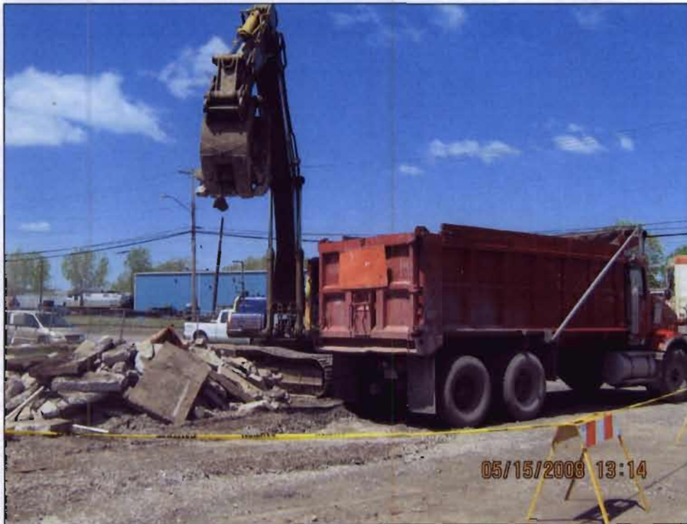
Loading of concrete debris removed from the MRS Plating Shop building floors and footers for removal.