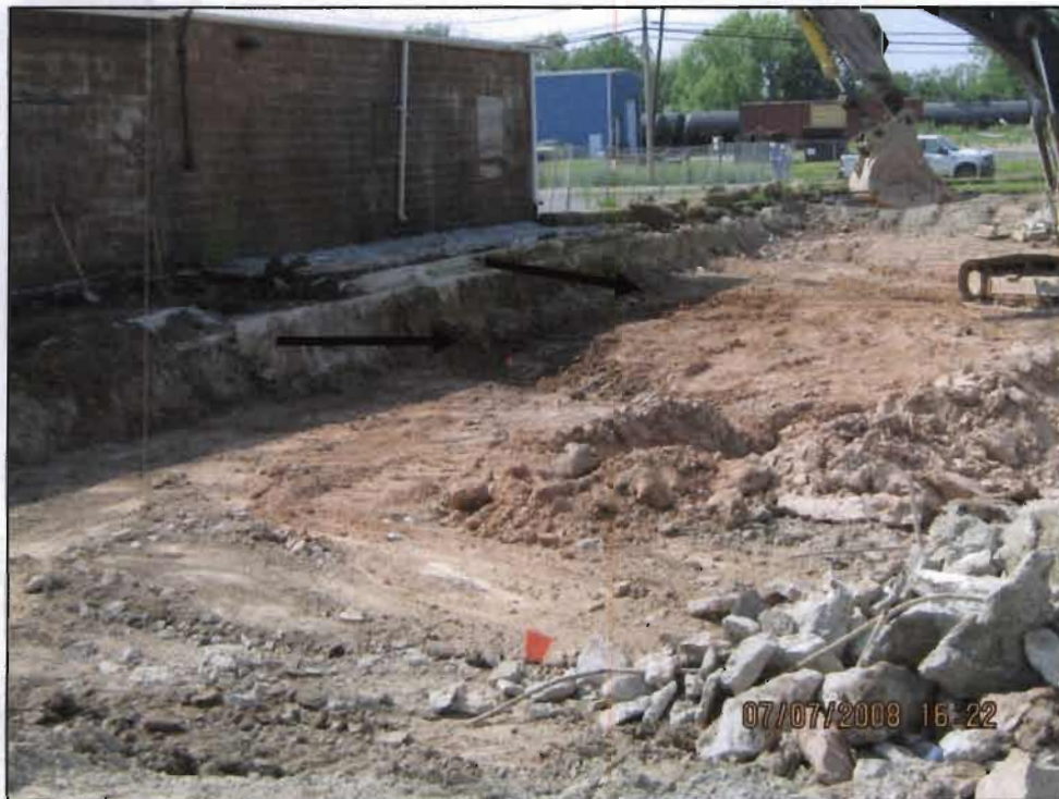
View of the excavation at the former plating shop building location. Note locations (red flags) of the two confirmation/post-excavation soil samples, looking northwest.