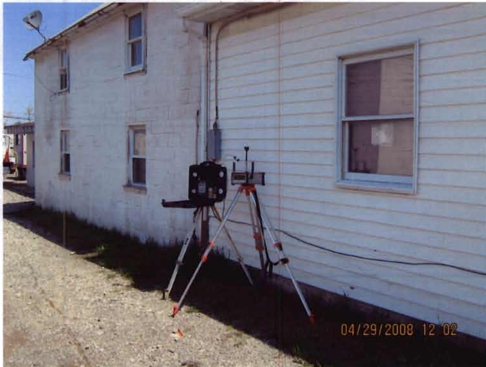
Air Monitoring Station #2, located on site next to a Residential Property.