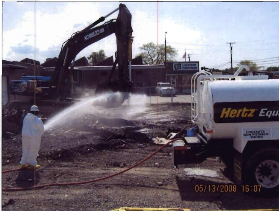
WRS Personnel conducting dust suppression during the MRS Plating Shop building's demolition debris segregation.