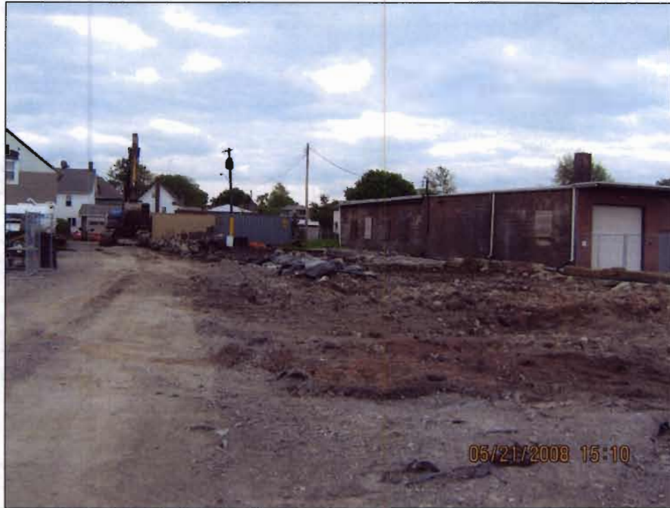
A view of the MRS Plating Facility looking towards Rene Place during the removal activities.