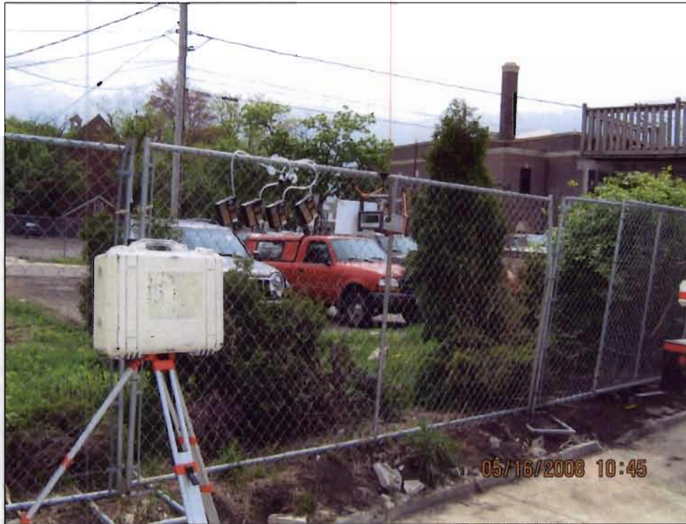
Air Monitoring Station #2 located at eastern facility fence next to a Residential Property.