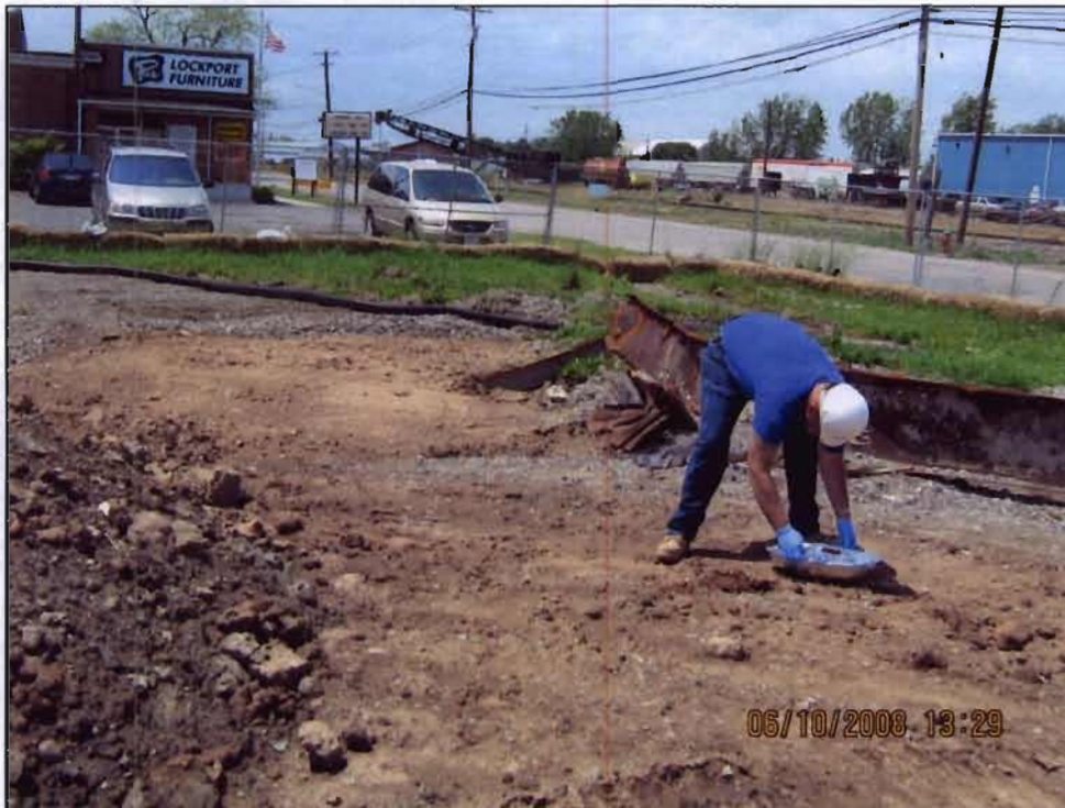
WRS personnel collecting non-hazardous soil samples from the area located north of the former Plating Shop Building and along the Park Avenue.