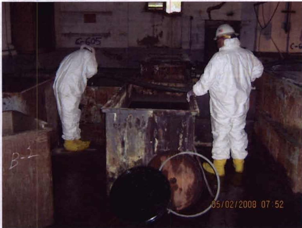
ERRS personnel cleaning vats.