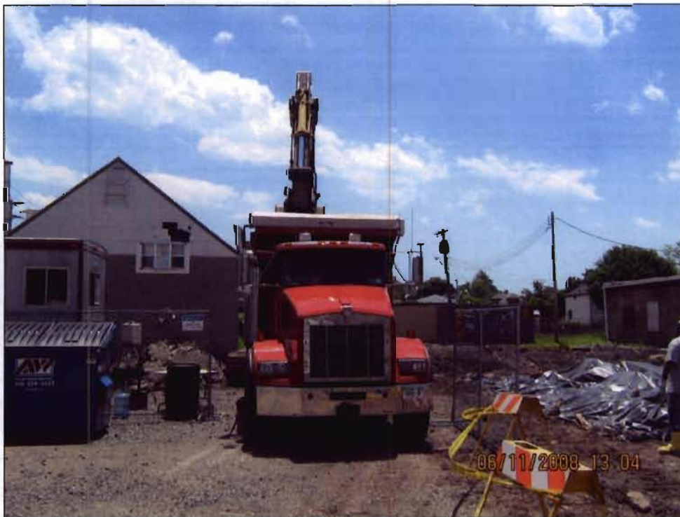
WRS loading concrete debris removal, generated during the removal of floors and footers of the former office building.