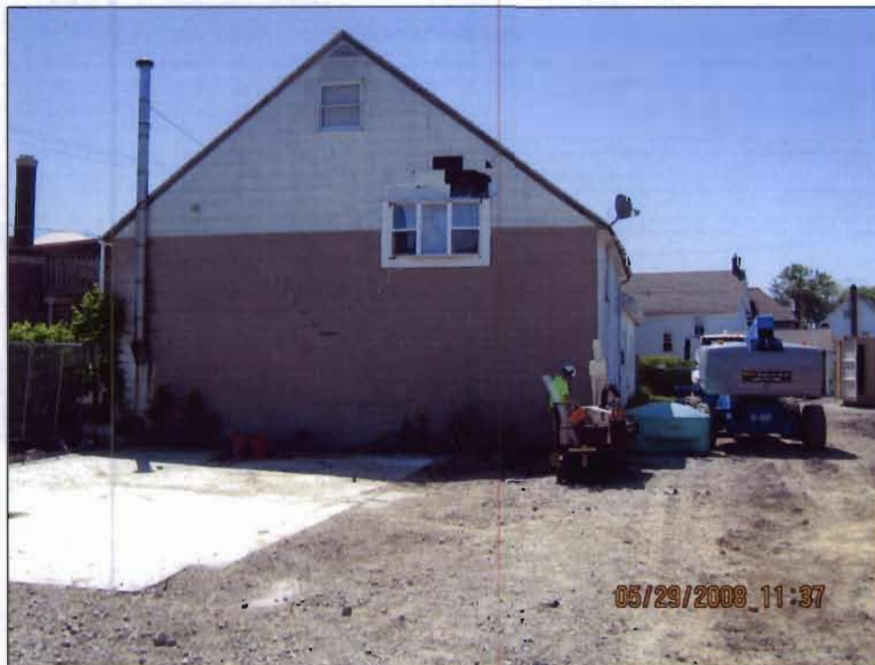
View toward south showing Geoprobe ® setup. Soil boring and sampling performed at the former MRS Plating Office building area and north of the private residential property.