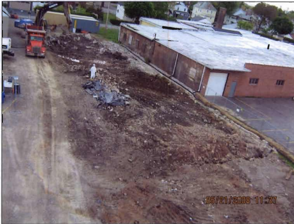
Overview of the MRS Plating Facility looking towards Rene Place. Loading of concrete debris removed from the MRS Plating Shop building floors and footers for removal.