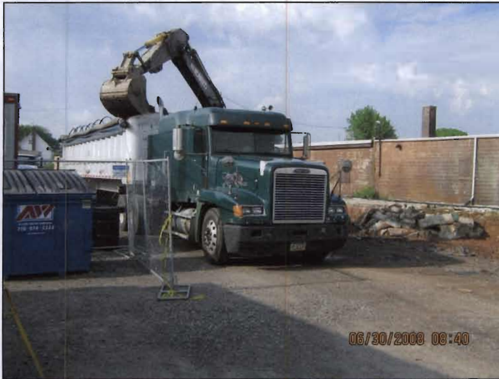
Loading of the contaminated soils, removed from the former MRS Plating Shop building area for the off-site treatment and disposal at Michigan Disposal facility, Belleville, MI.