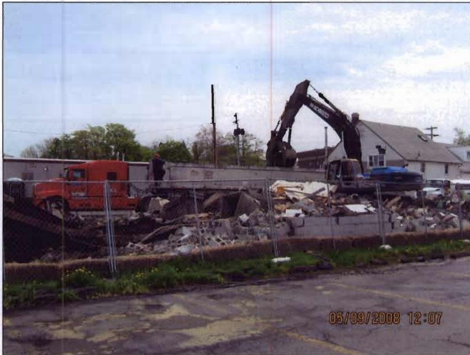
Loading of demolition debris for removal and off-site disposal.