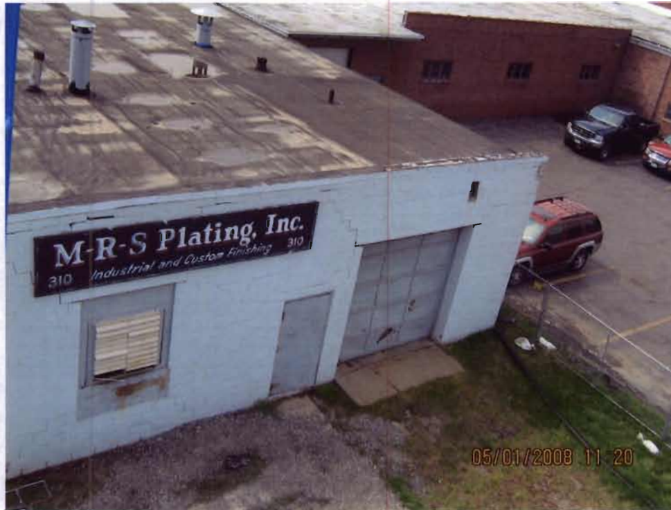
Front of the MRS Plating Shop.