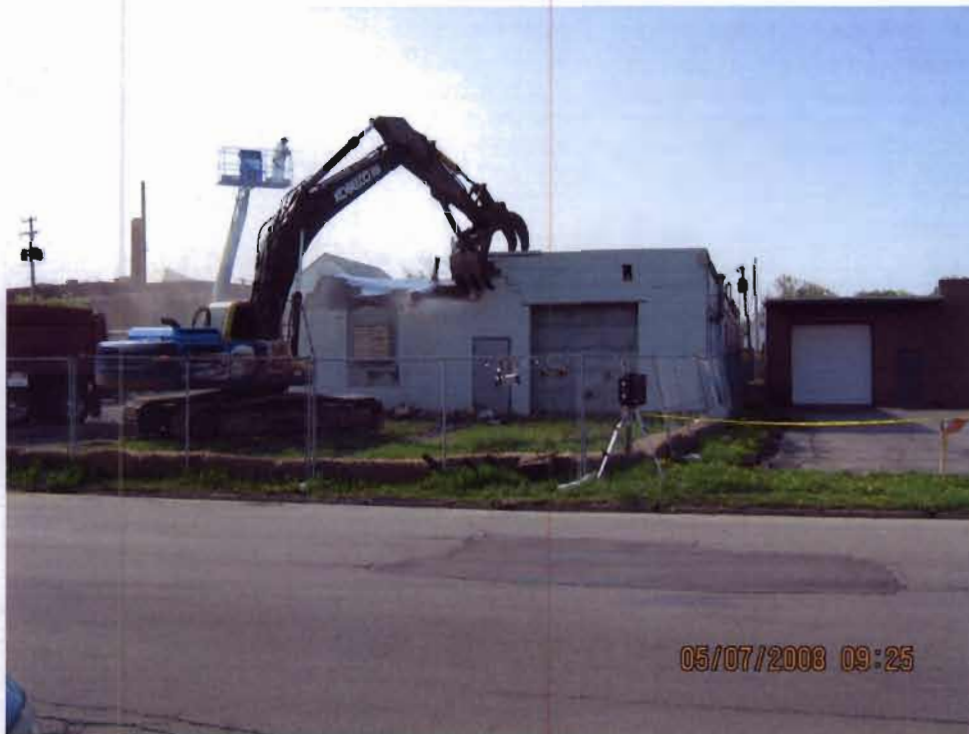
The beginning stages of demolition to the MRS Plating Shop.