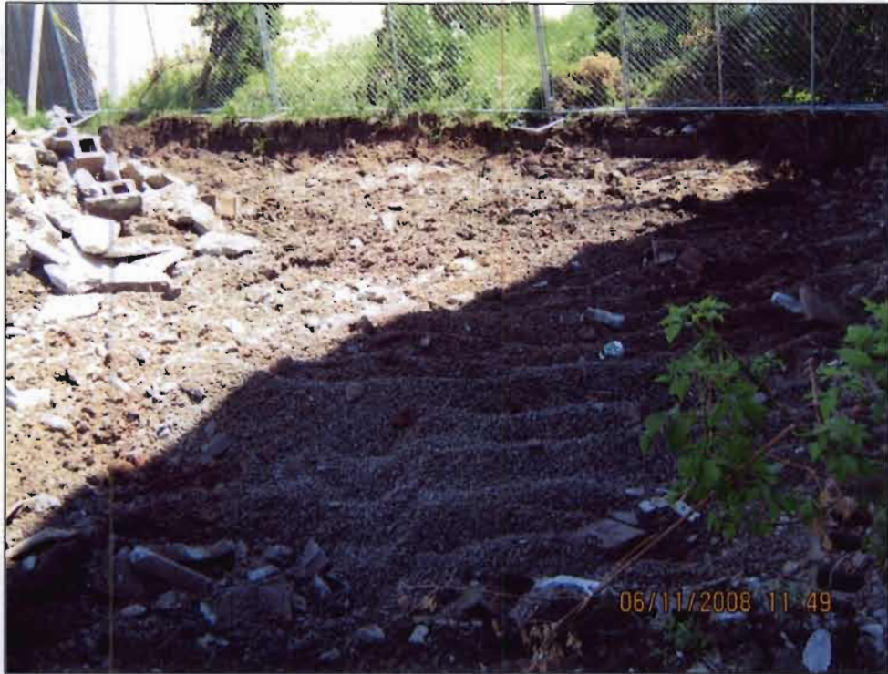
WRS removing the concrete floors and footers, view of the former office building location.