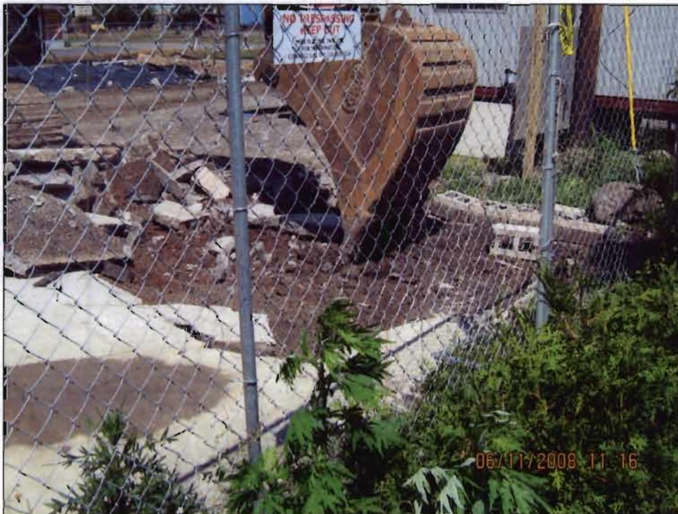
WRS removing the concrete floors and footers, view of the former office building location.