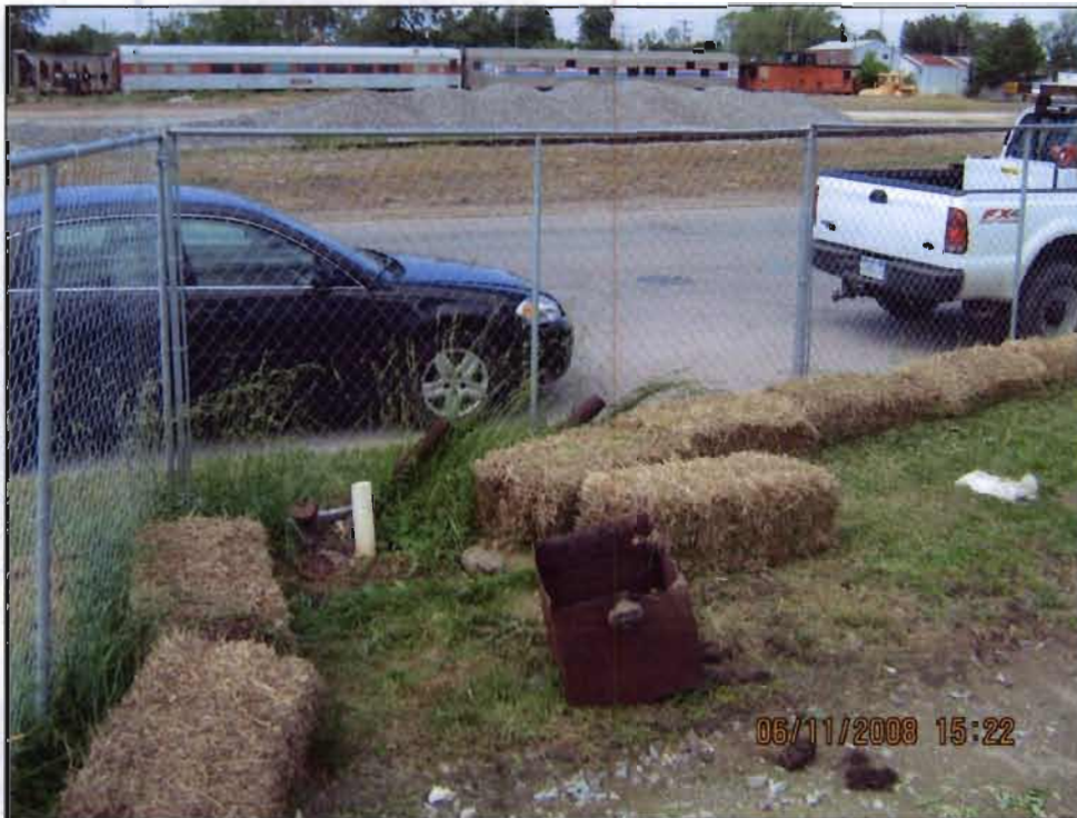
View of the MRS Plating facility's sewer discharge vent pipe located along the Park Avenue. Also, visible the city sewer manhole cover in the middle of the street.