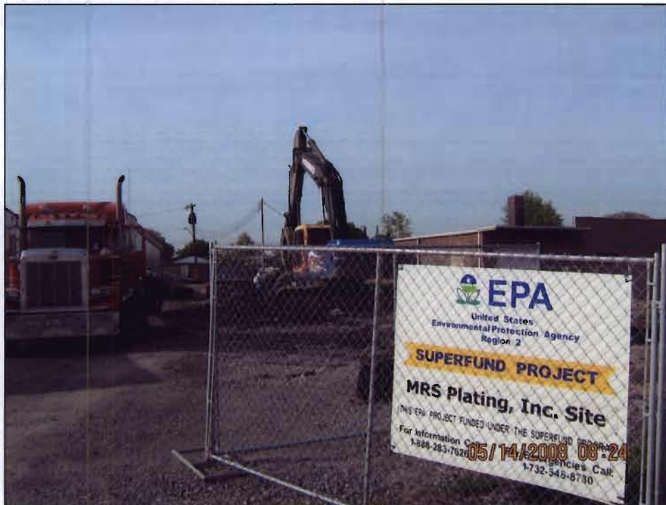
Loading demolition debris for removal and off-site disposal.