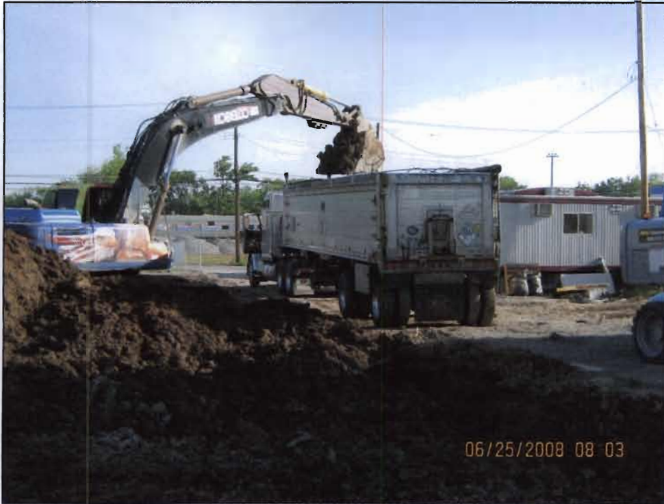
Loading of the contaminated soils, removed from the former MRS Plating Shop building area for the off-site treatment and disposal at Michigan Disposal facility, Belleville, MI.