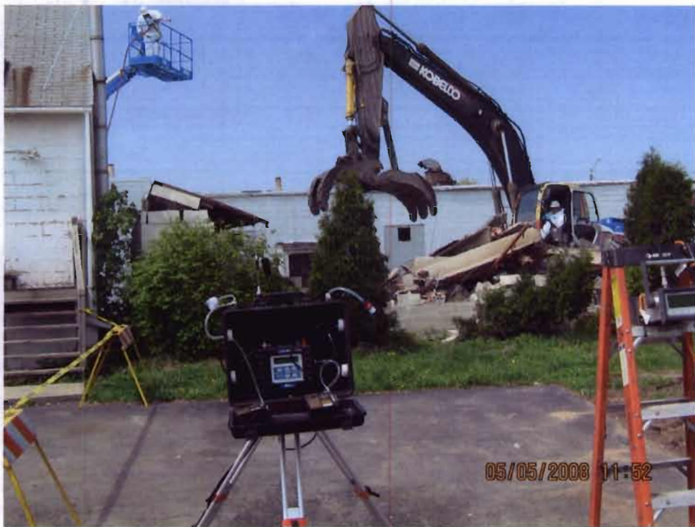
Demolition of the MRS Plating Office occurring behind Air Monitoring Station #2.