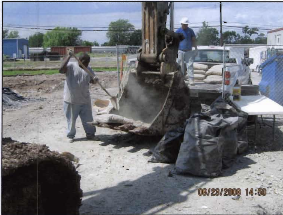
WRS personnel adding cement to the TCE contaminated soil. The on-site treatment is being done to facilitate drying and reduce the TCE vapors for off-site shipment.