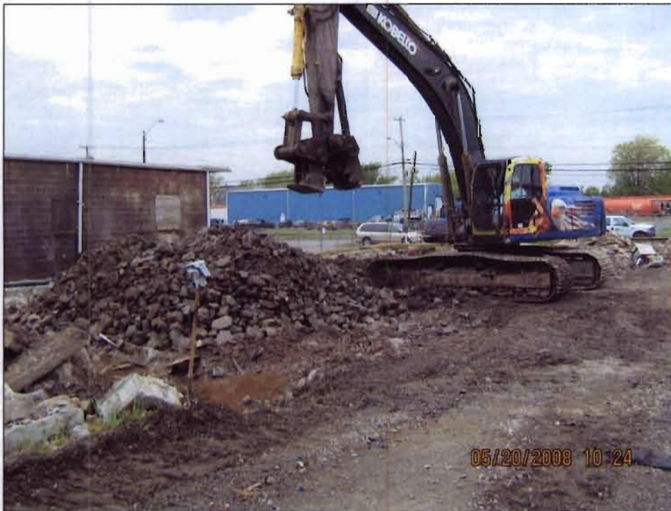
WRS continued to crush large concrete pieces into manageable small pieces for load out.