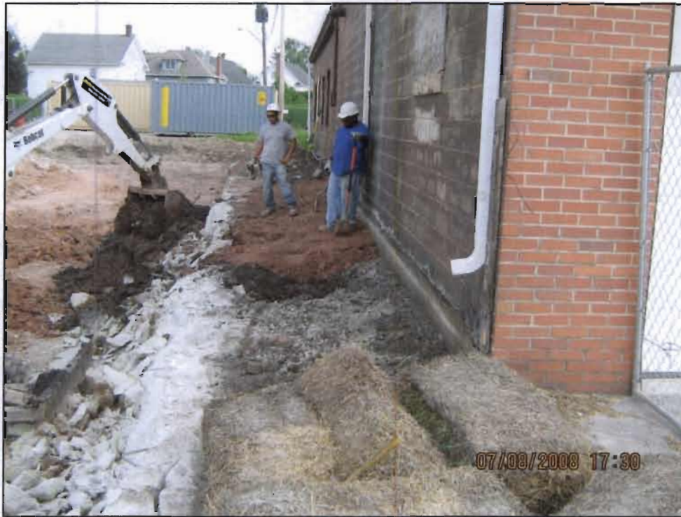
WRS placing clean fill area between the remaining western foundation wall of the former plating shop building and adjacent furniture store building along the west.