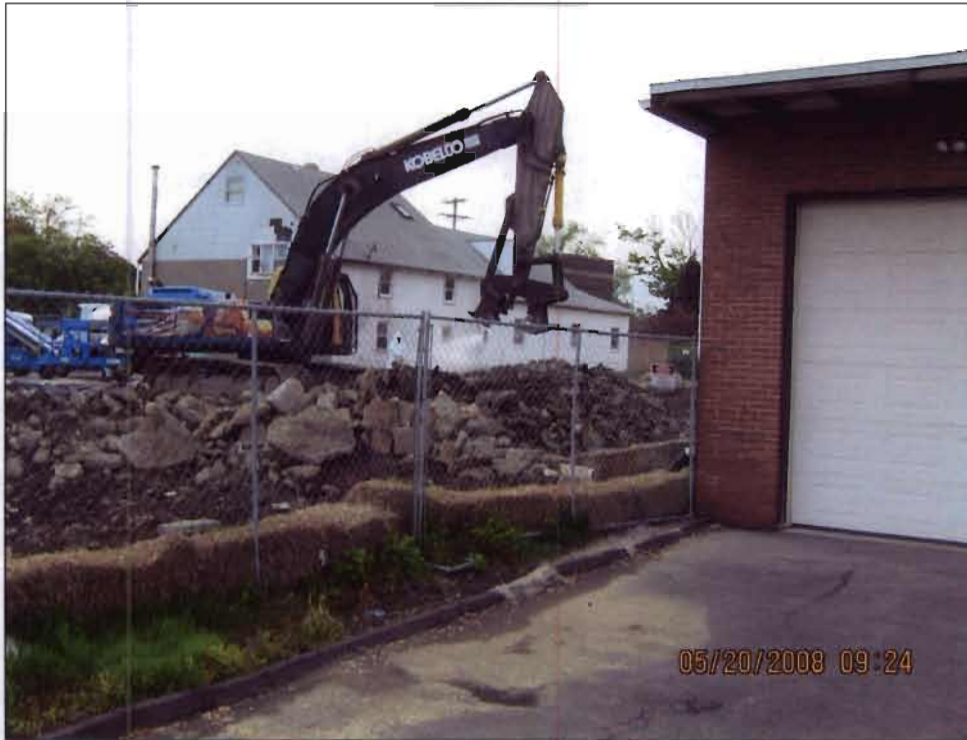
WRS crushing large concrete pieces into manageable small pieces for load out.