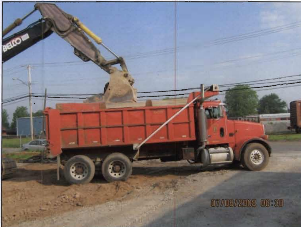
Loading of the non-hazardous soils, removed from the former MRS Plating Shop building area for the off-site treatment and disposal at Allied Waste facility.