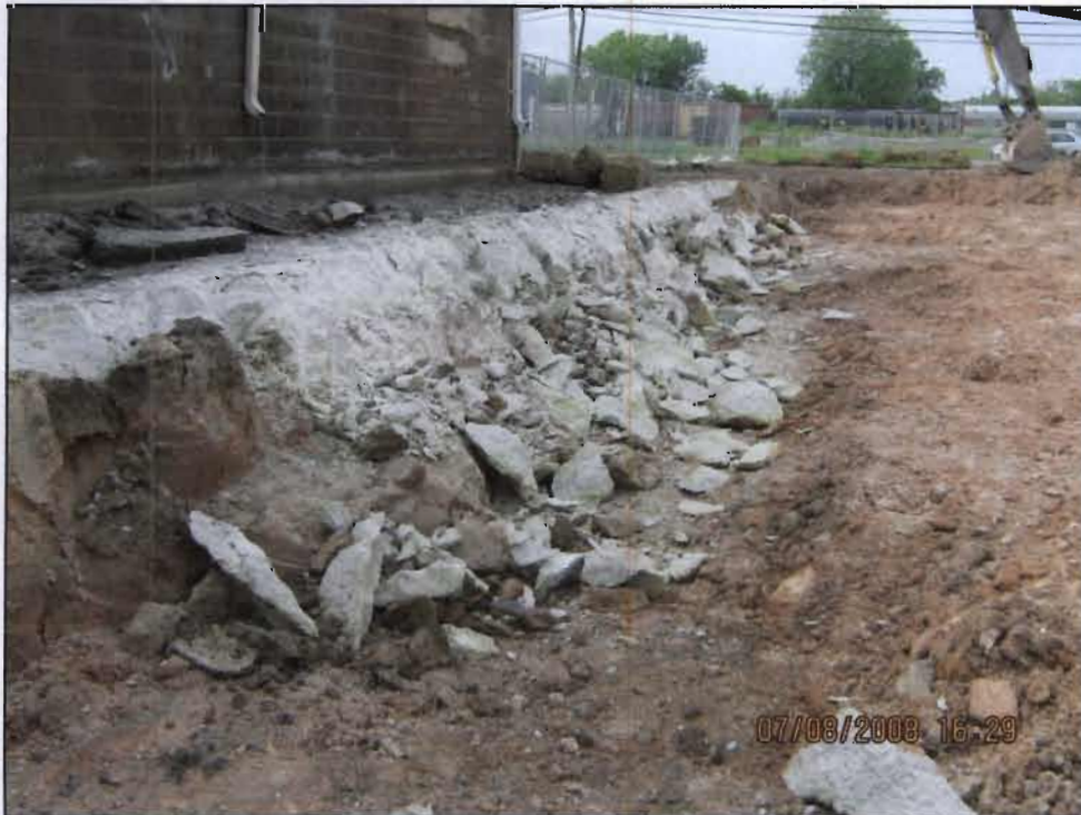
WRS removed top concrete (mostly discolored) layers from the remaining western foundation wall of the former plating shop building prior to filling area with the clean fill.