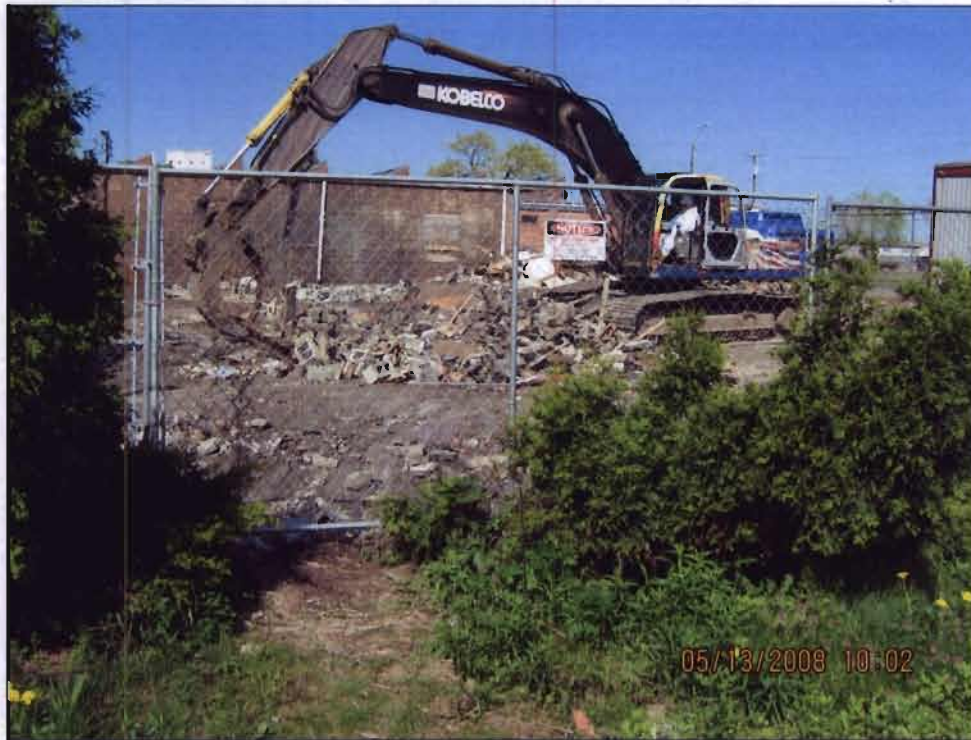
WRS segregates demolition debris of the MRS Plating Shop building materials.