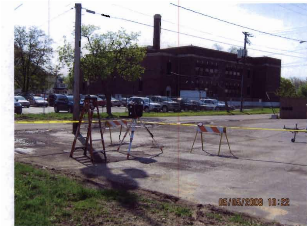
Air Monitoring Station #2. The Elementary School is located in the background.