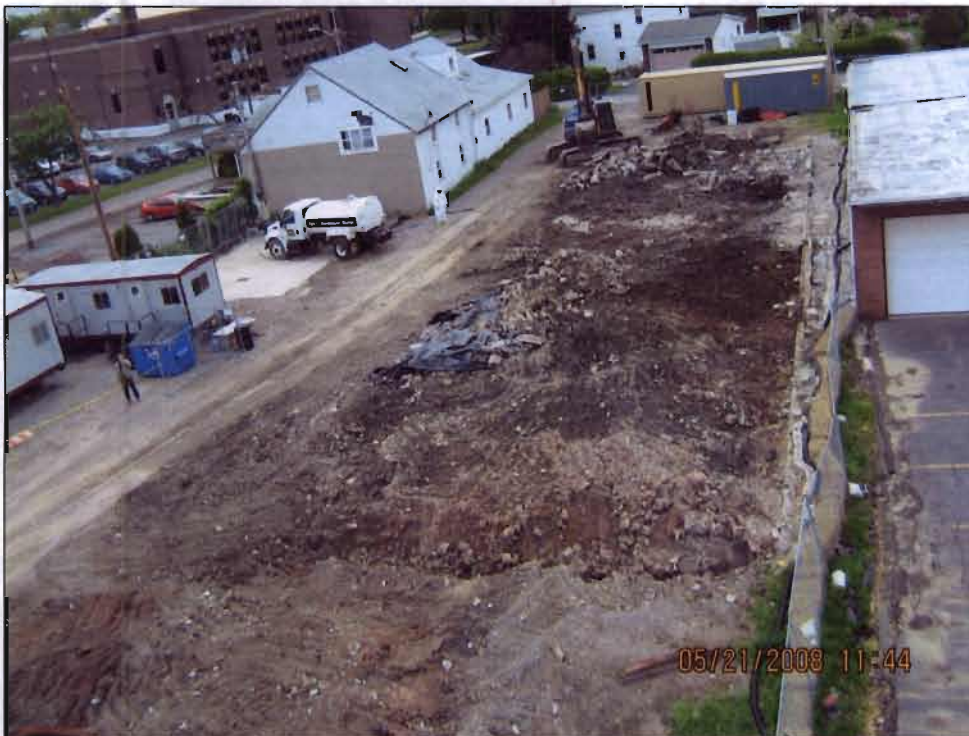
Another overview of the MRS Plating Facility looking southeast. The private residences and the Elementary School are located in the background.