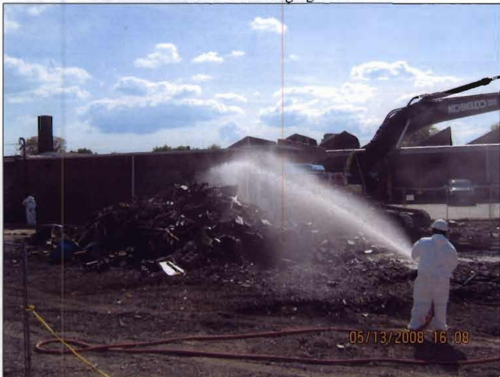
WRS Personnel conducting dust suppression during the MRS Plating Shop building's demolition debris segregation.