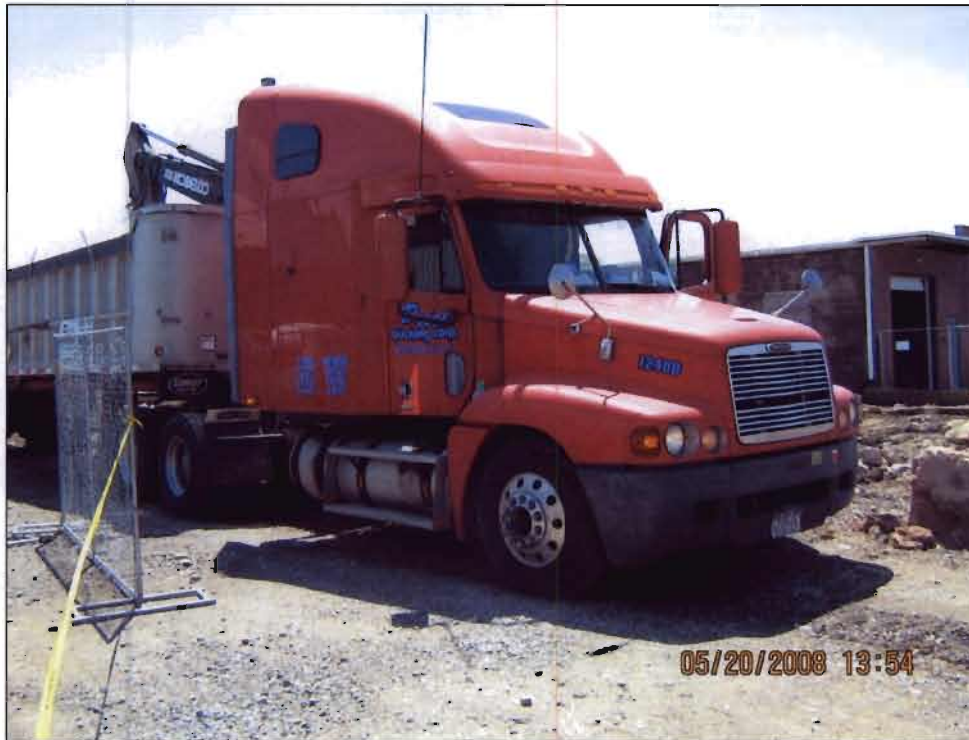
Loading of concrete debris removed from the MRS Plating Shop building floors and footers for removal.