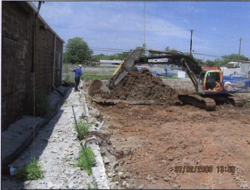
WRS removing soils at the former Plating Shop building location along the adjacent furniture store building (located west) for off-site shipment and disposal.