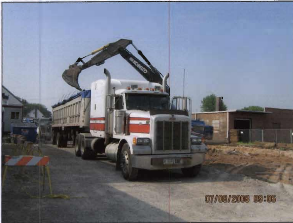
Loading of the contaminated soils, removed from the former MRS Plating Shop building area for the off-site treatment and disposal at Michigan Disposal facility, Belleville, MI.