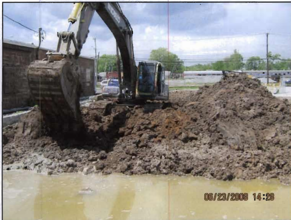
WRS personnel removing contaminated soil from the former Plating shop building area for off-site treatment and disposal. Also, showing rain water accumulation in excavation.