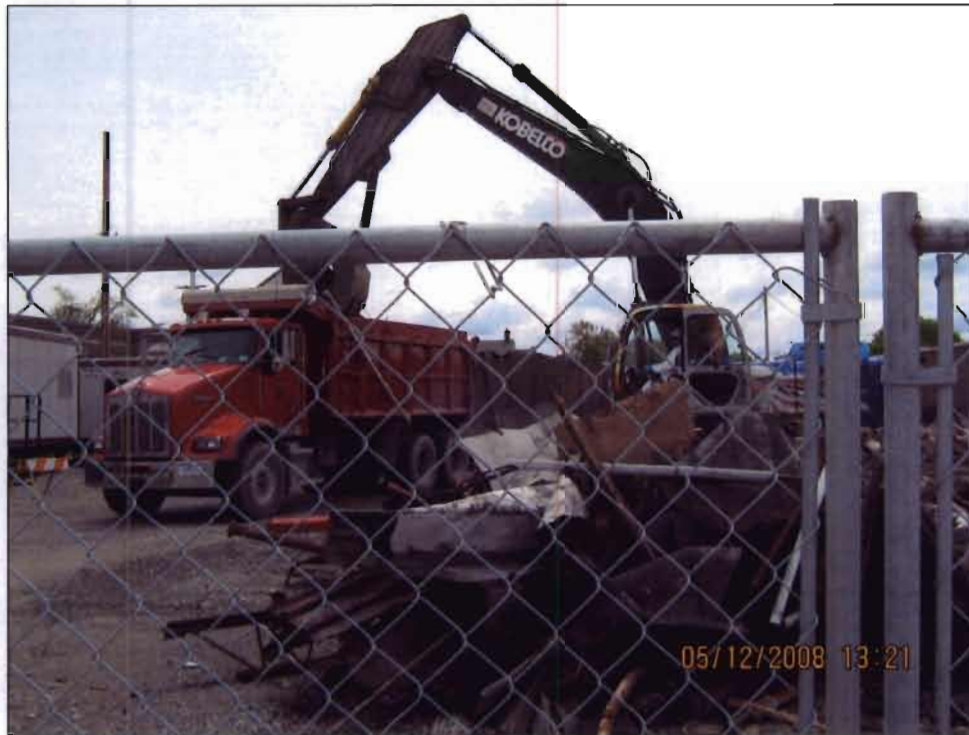
Loading of demolition metal debris for removal and off-site recycling.