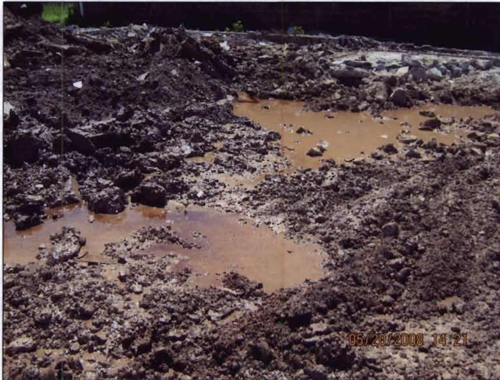
Perched/rain water with the fuel oil sheen noted underneath the floor during the removal and demolition activities at the MRS Plating Shop building.