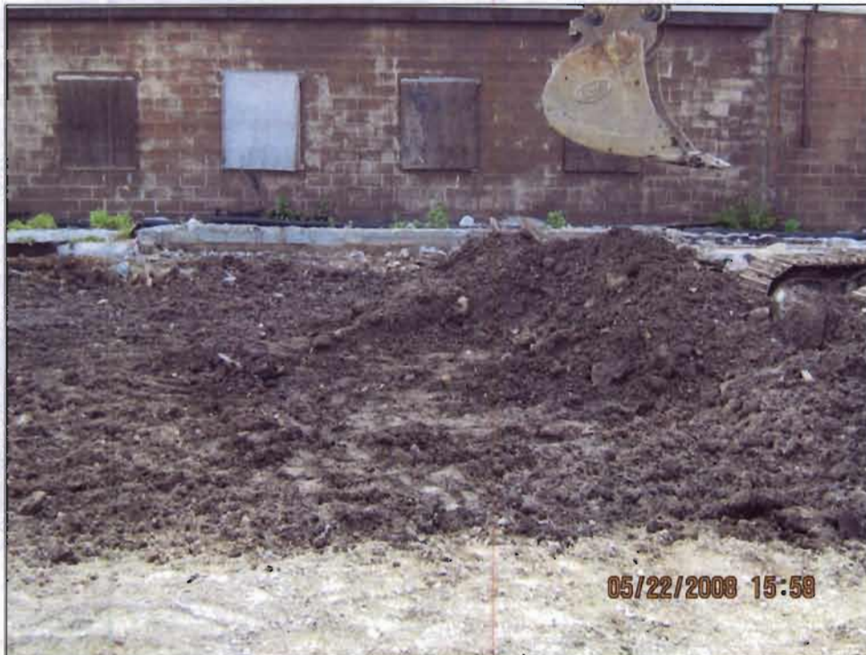
A view of the scattered plastic capsules uncovered during the MRS Plating Shop building's southern end floors removal. These plastic capsules found to be empty.