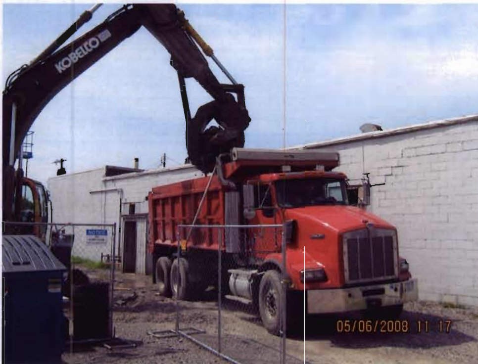
Loading of demolition debris for removal.