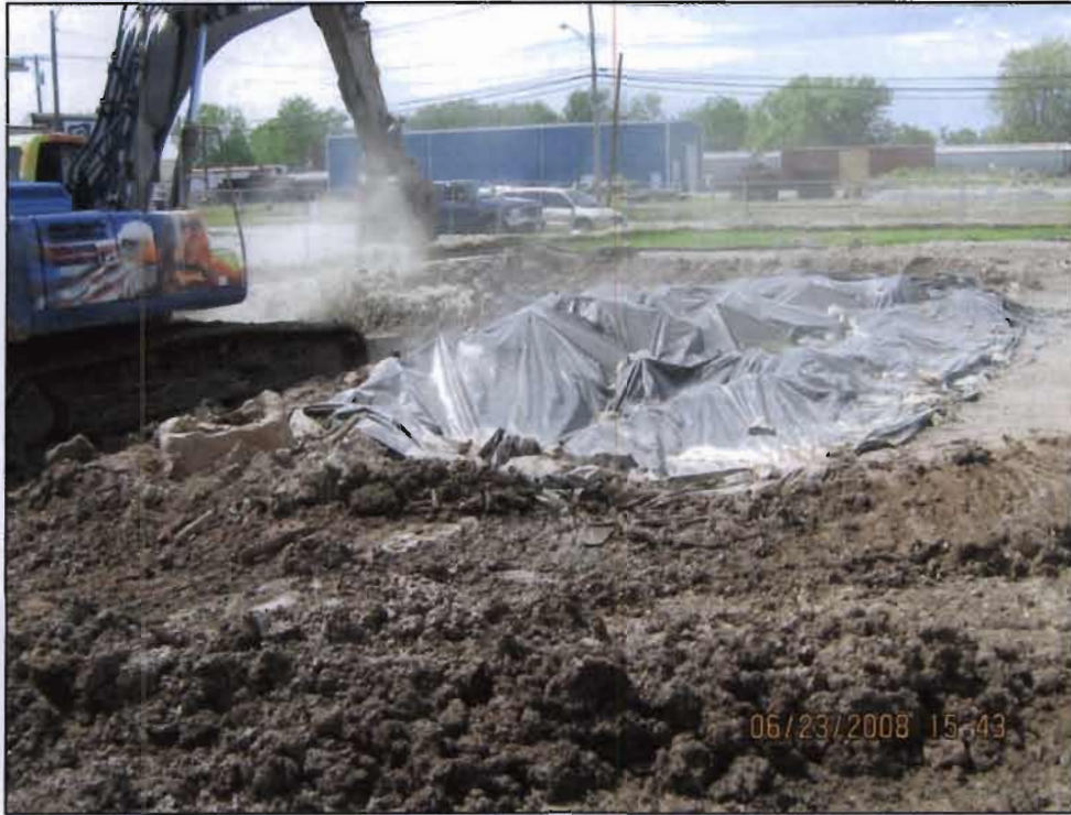
WRS personnel treating contaminated soil with cement to facilitate drying and reduce the TCE vapors for off-site disposal at Michigan Disposal facility, Belleville, MI.