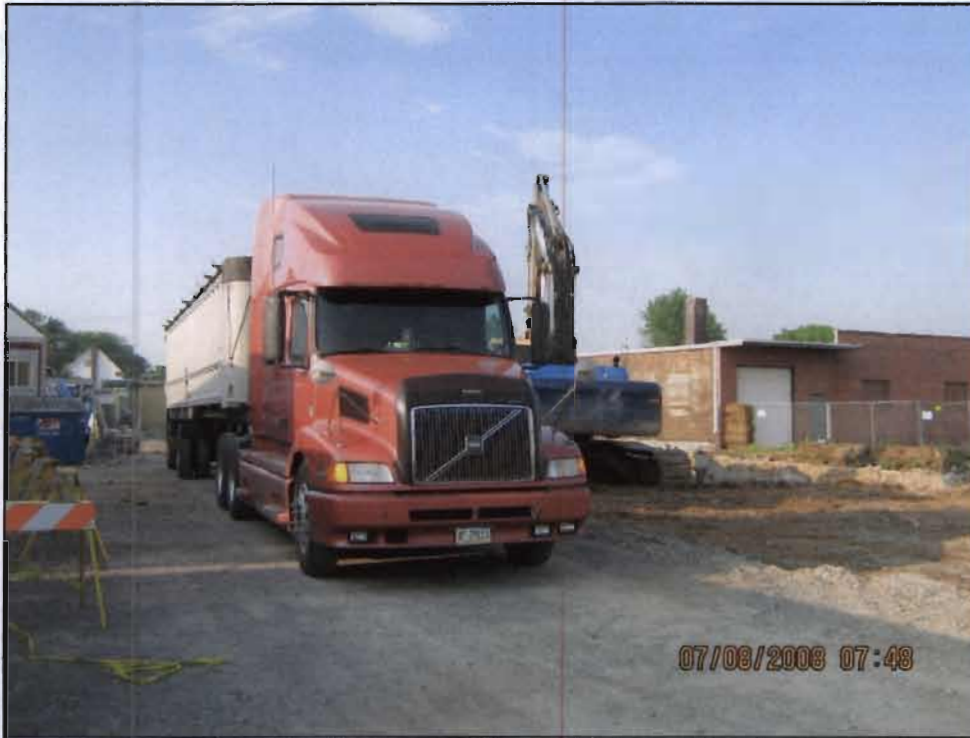
Loading of the contaminated soils, removed from the former MRS Plating Shop building area for the off-site treatment and disposal at Michigan Disposal facility, Belleville, MI.