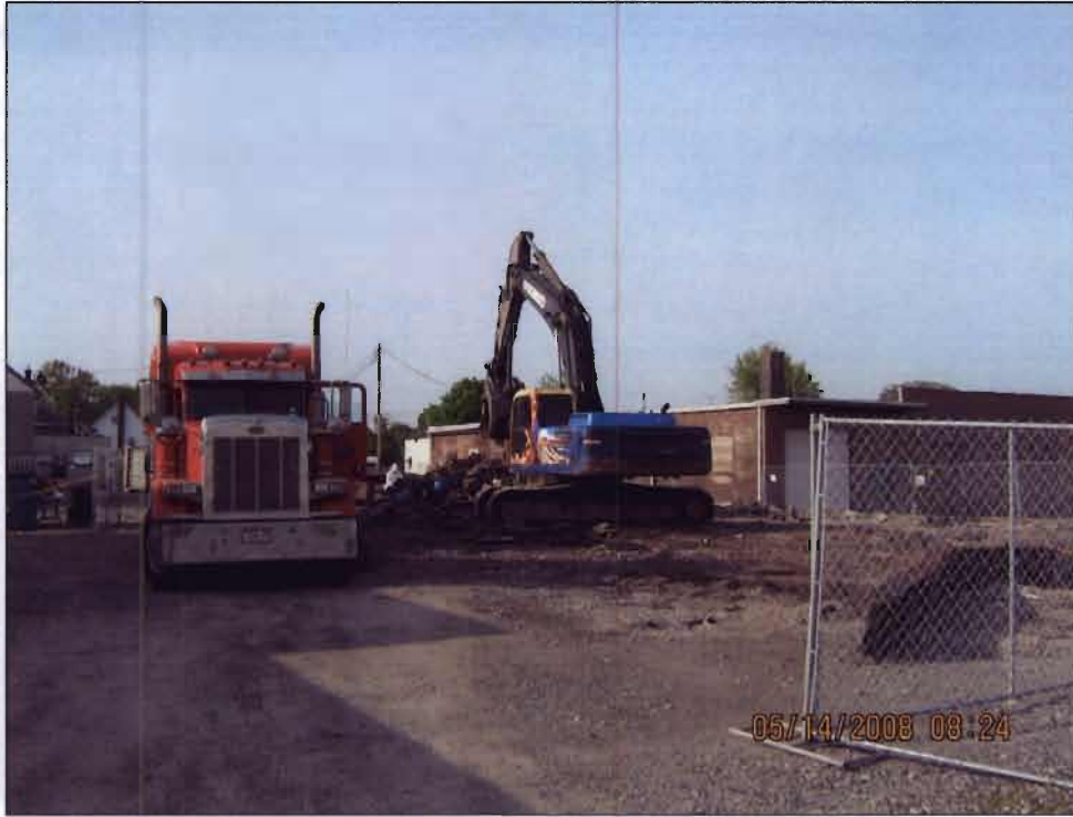
Loading demolition debris for removal and off-site disposal.