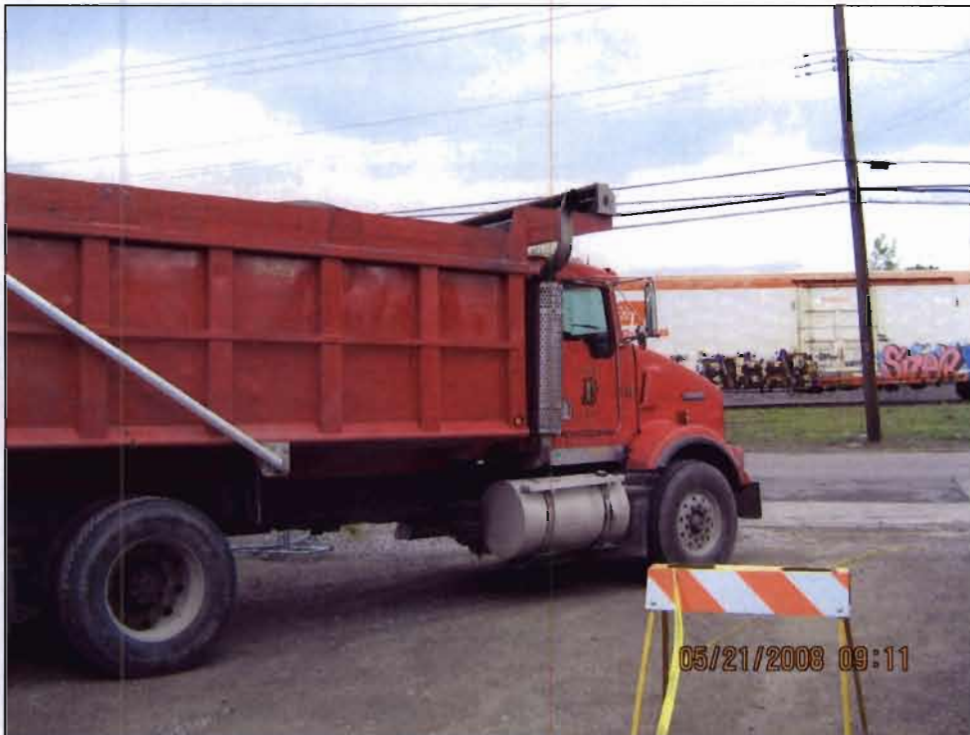
Loading of concrete debris removed from the MRS Plating Shop building floors and footers for removal.