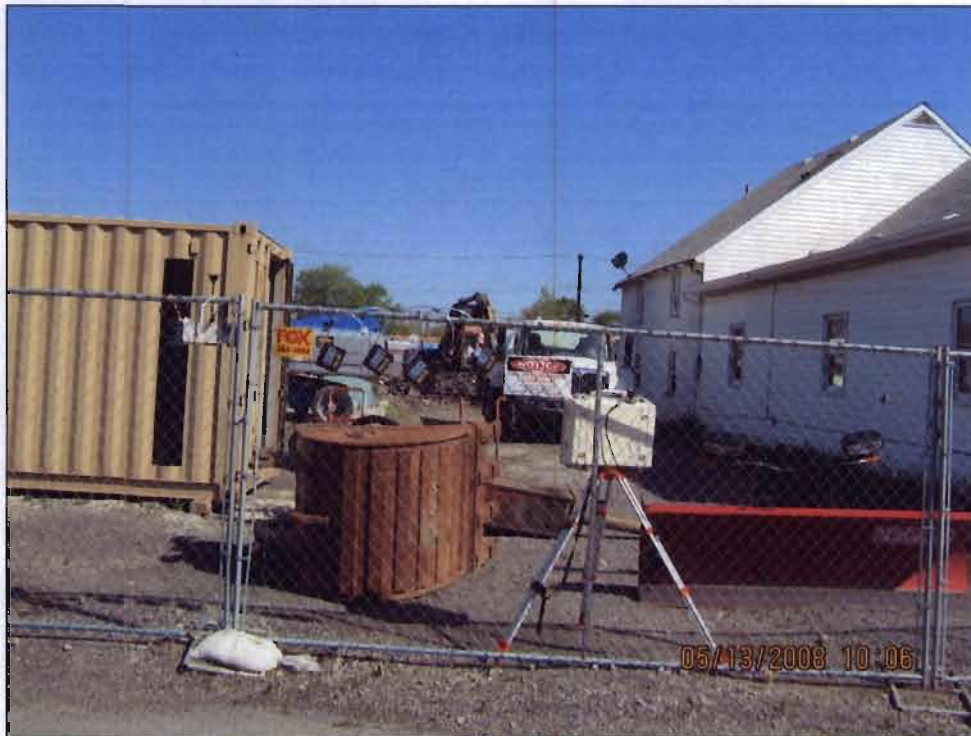
Air Monitoring Station #3 located at southern facility fence along the Rene Place road.