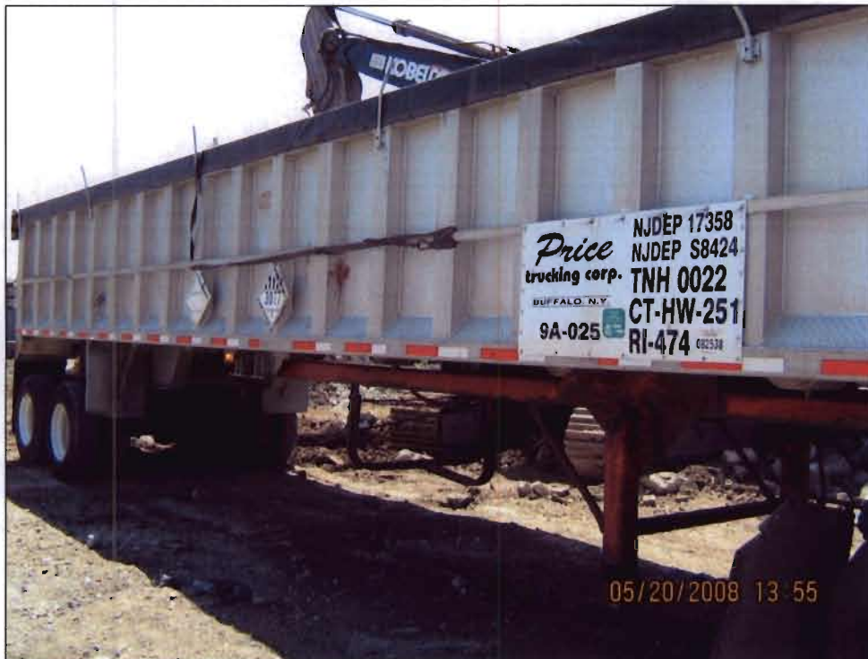
Loading of concrete debris removed from the MRS Plating Shop building floors and footers for removal.