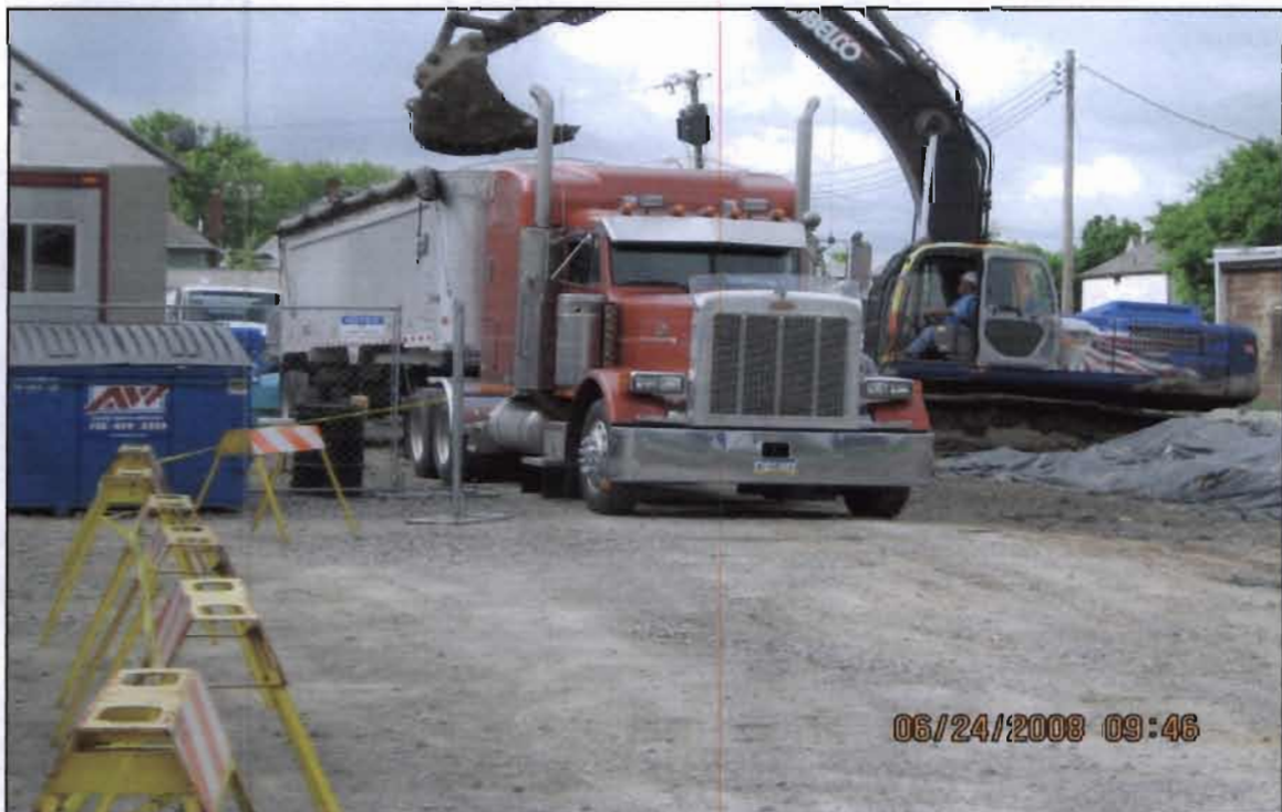
Loading of the contaminated soils, removed from the former MRS Plating Shop building area for the off-site treatment and disposal at Michigan Disposal facility, Belleville, MI.