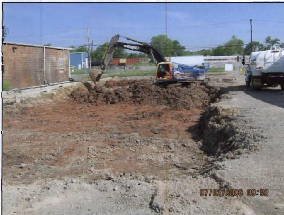
View of the excavation at the former Plating Shop building location during the removal of the contaminated soils. Looking north towards Park Avenue.