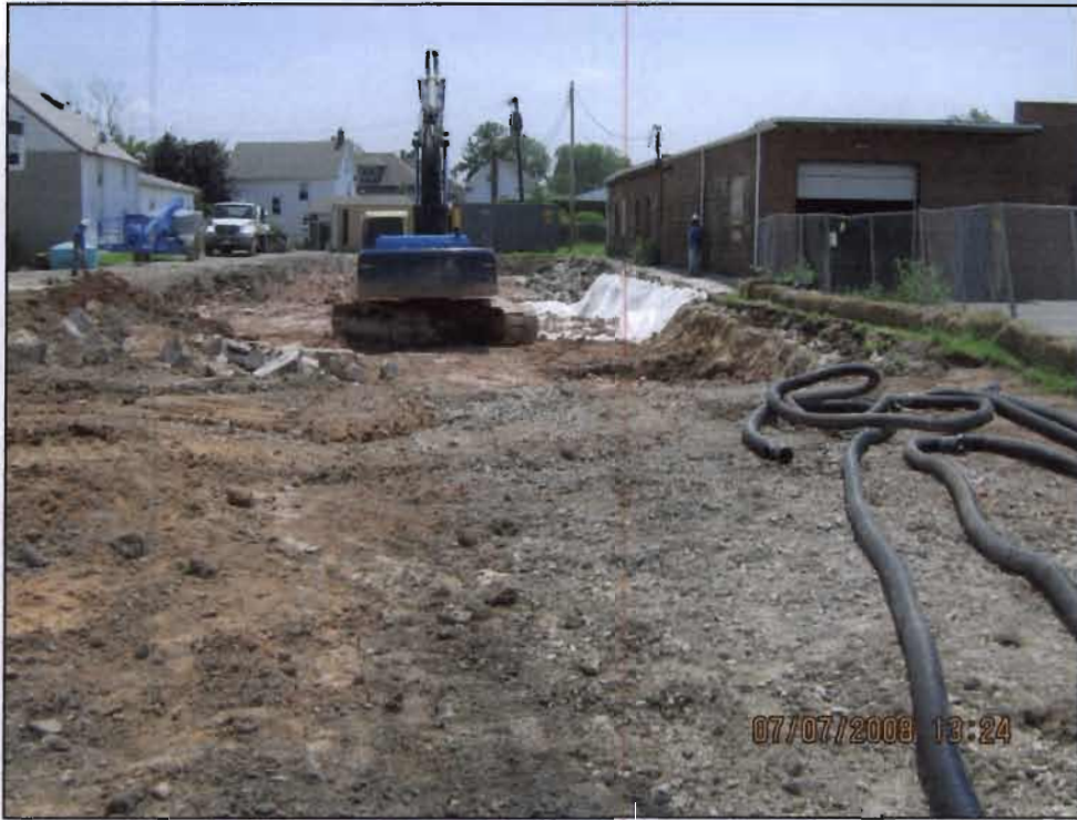
View of the facility, looking south, towards Rene Place. The adjacent private residence to the south and east and the furniture store building to the west are in the background.