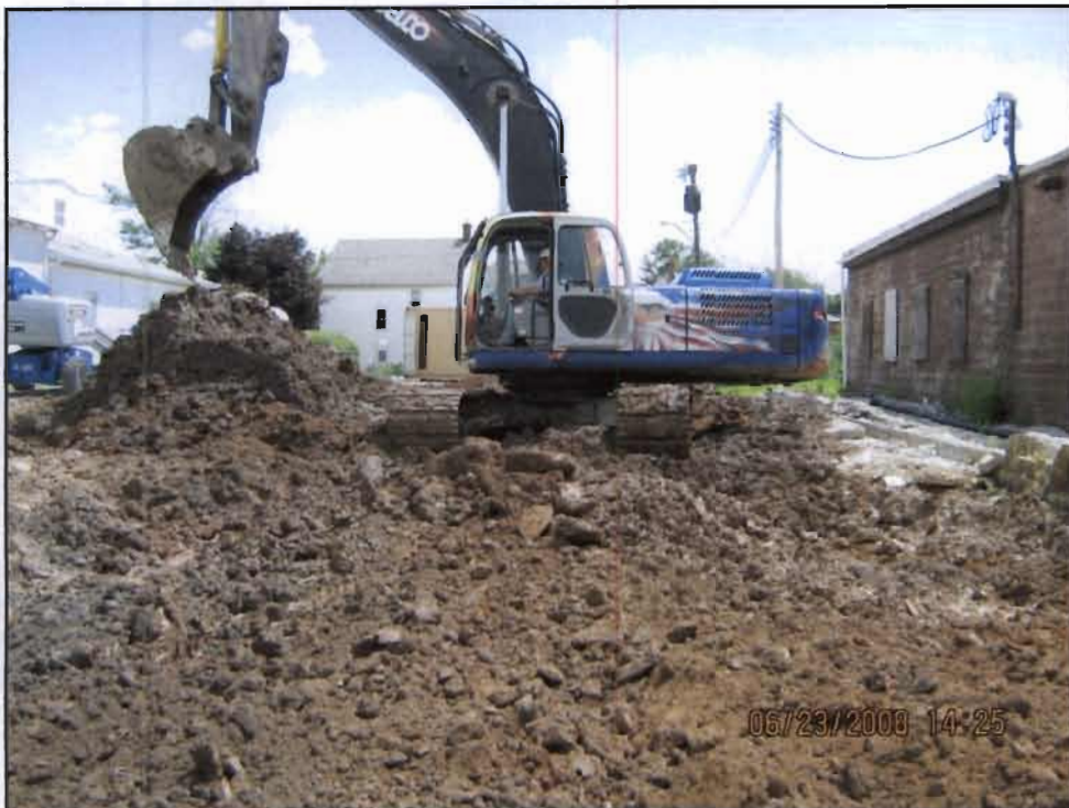
WRS personnel removing contaminated soil from the former plating shop building area and staging on site for off-site treatment and disposal.