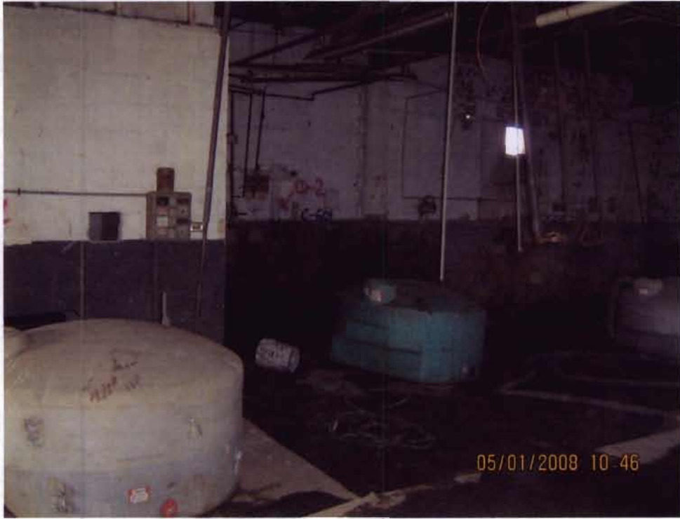
Inside of the MRS Plating Shop.