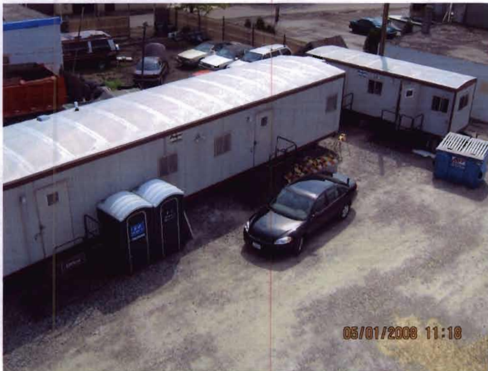
MRS Site Office Trailer.