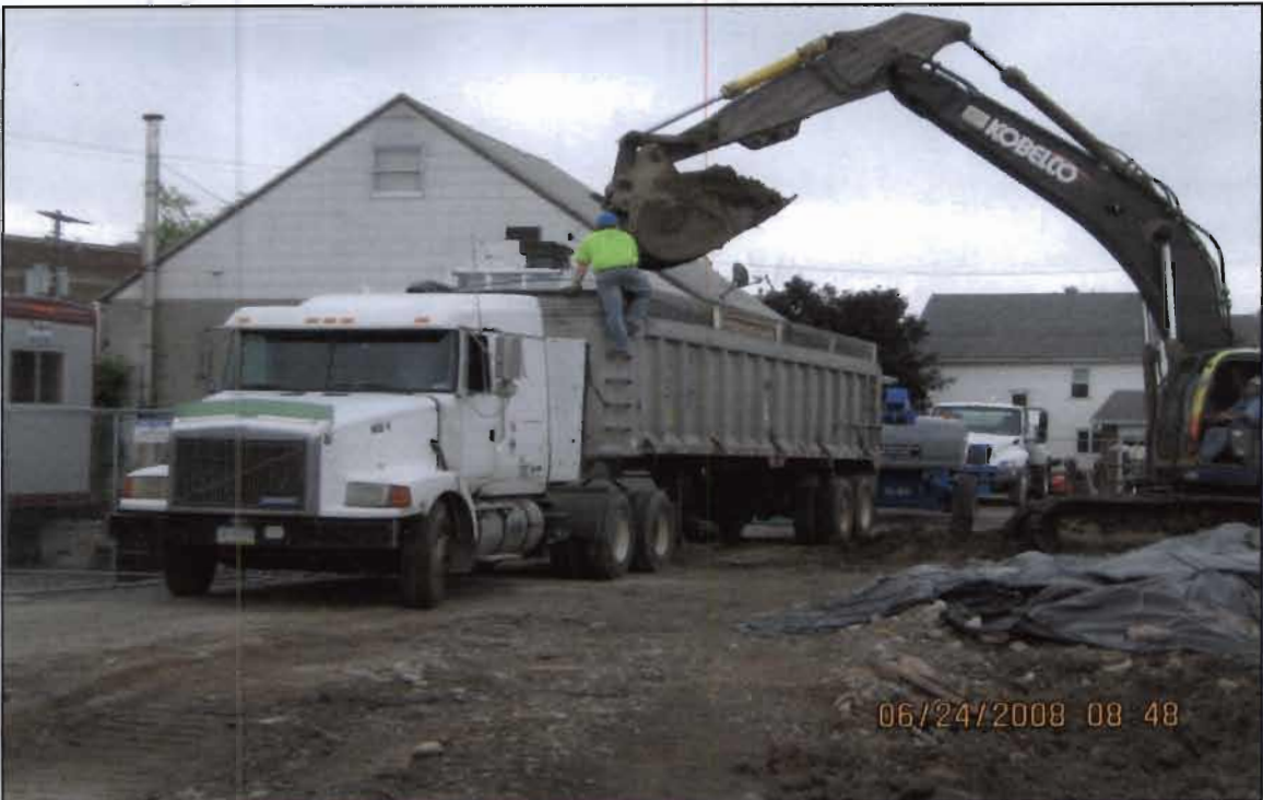
Loading of the contaminated soils, removed from the former MRS Plating Shop building area for the off-site treatment and disposal at Michigan Disposal facility, Belleville, MI.