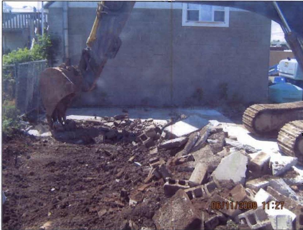
WRS removing the concrete floors and footers, view of the former office building location.