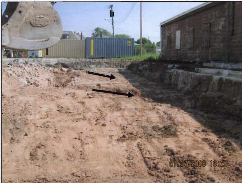
View of the excavation at the former plating shop building location. Note locations (red flags) of the two confirmation/post-excitation soil samples.