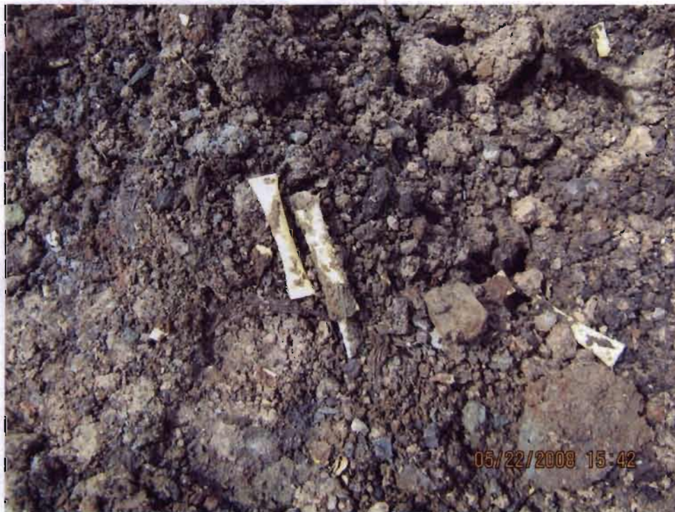
Plastic capsules uncovered during the MRS Plating Shop southern end floors removal. These plastic capsules were broken open and found empty.