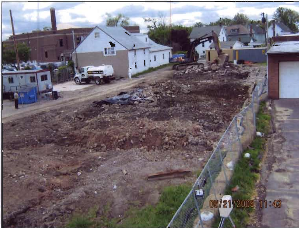
Overview of the MRS Plating Facility looking towards Rene Place. The private residences and the Elementary School are located in the background.