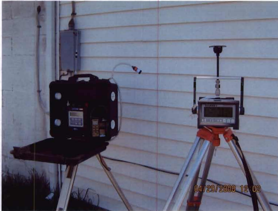
Air Monitoring Station #2, Picture displays Area-RAE, SKC Pump and Data-RAM Monitor.