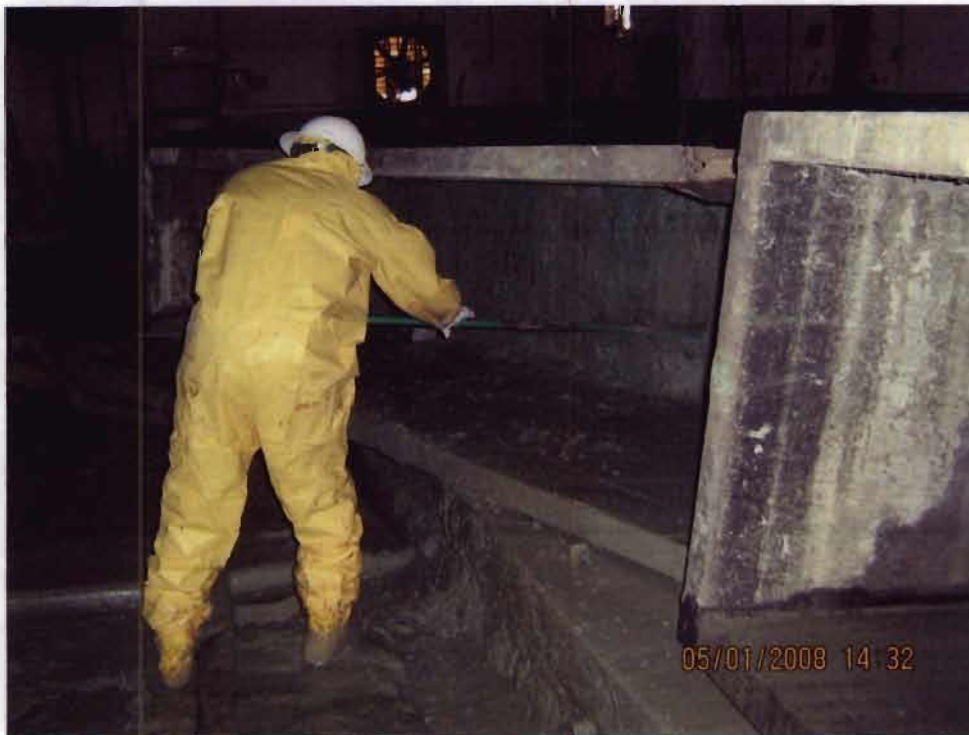
ERRS employee cleaning a vat.