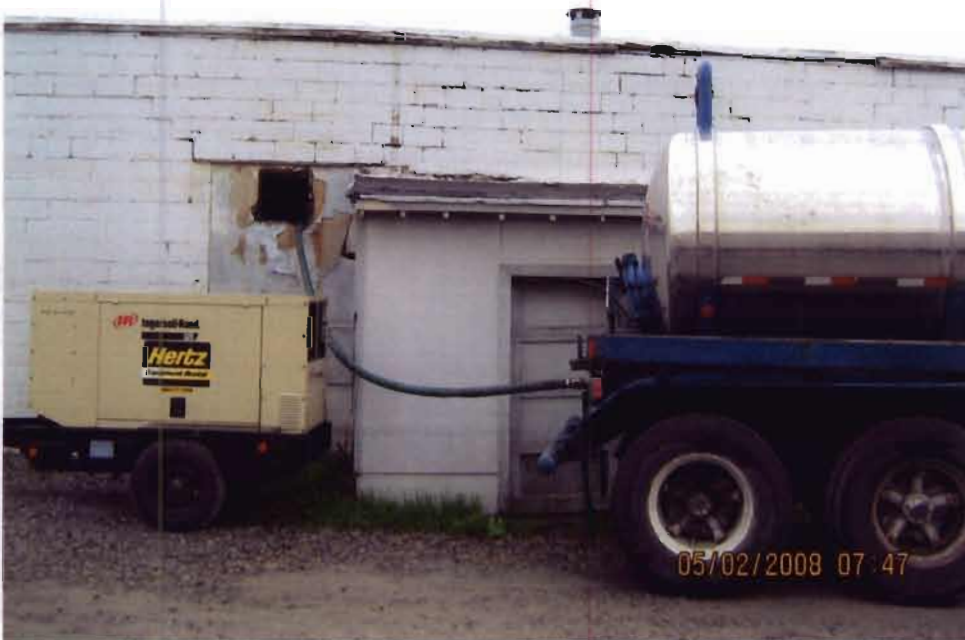
Extracting water from vats inside of the MRS Plating Shop.