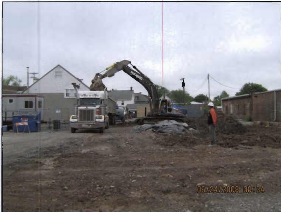
Loading of the contaminated soils, removed from the former MRS Plating Shop building area for the off-site treatment and disposal at Michigan Disposal facility, Belleville, MI.