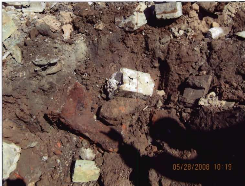
View of a large drain metal manhole piece uncovered during the test pit excavation at the former MRS Plating Shop building area.