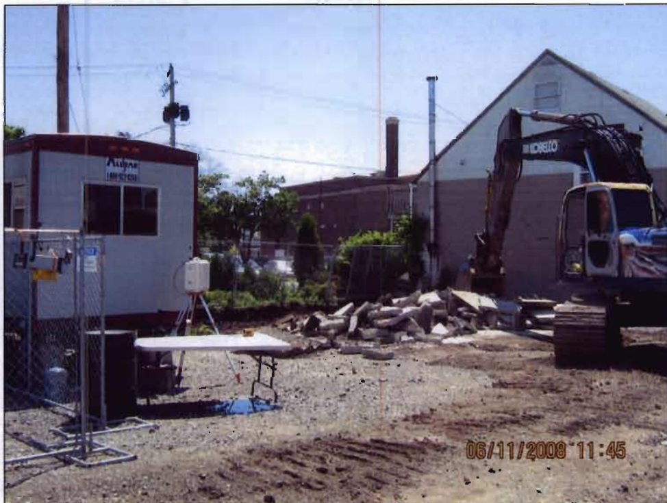
WRS removing the concrete floors and footers, view of the former office building location. Air Monitoring Station #2, picture displays AreaRAE, SKC Pumps and DataRAM Monitor.