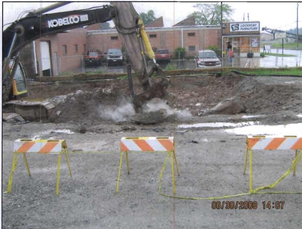
WRS crushing large concrete pieces into manageable small pieces for load out for off-site shipment, recycling and disposal at the Allied Waste facility.