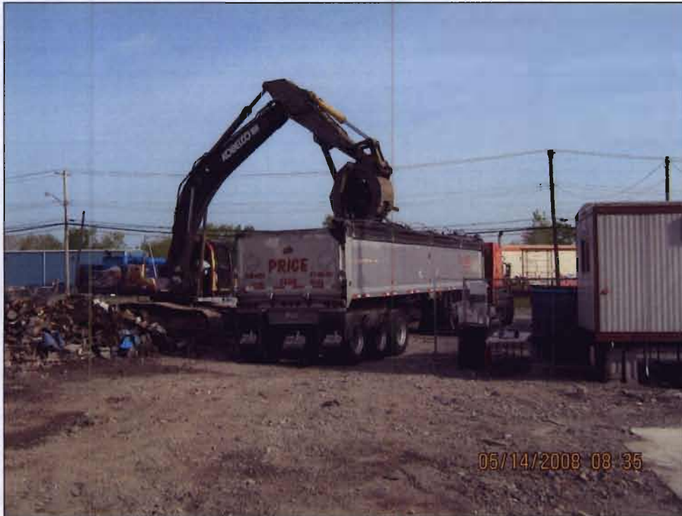
Loading demolition debris for removal and off-site disposal.