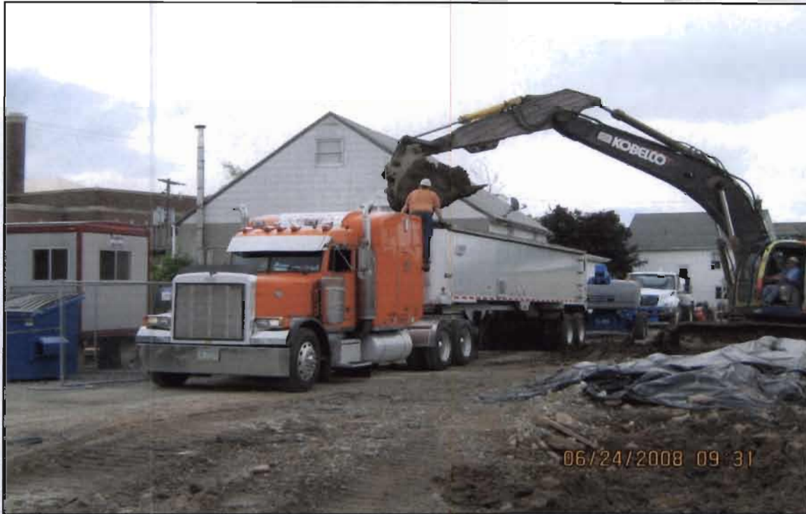
Loading of the contaminated soils, removed from the former MRS Plating Shop building area for the off-site treatment and disposal at Michigan Disposal facility, Belleville, MI.