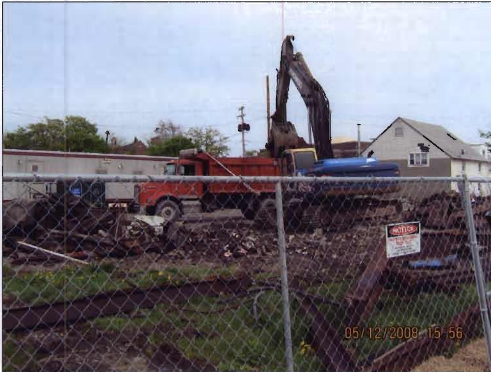
Loading of demolition metal debris for removal and off-site recycling.