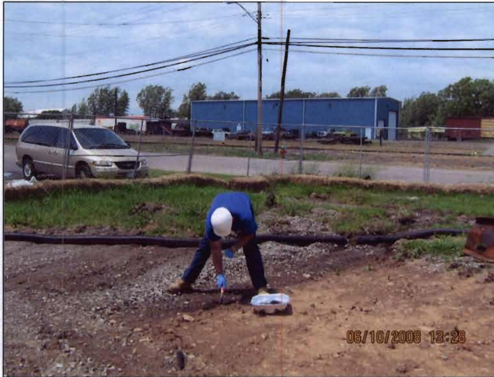
WRS personnel collecting non-hazardous soil samples from the area located north of the former Plating Shop Building and along the Park Avenue.