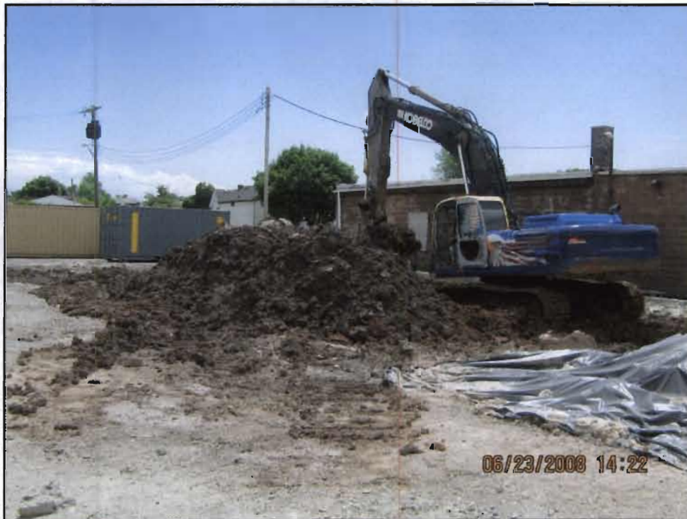
WRS personnel staging contaminated soil on site, removed from the area of the former plating shop building for off-site treatment and disposal.