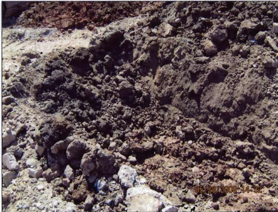
A view of the discolored soils noted during the test pit excavation at the former MRS Plating Shop building area.