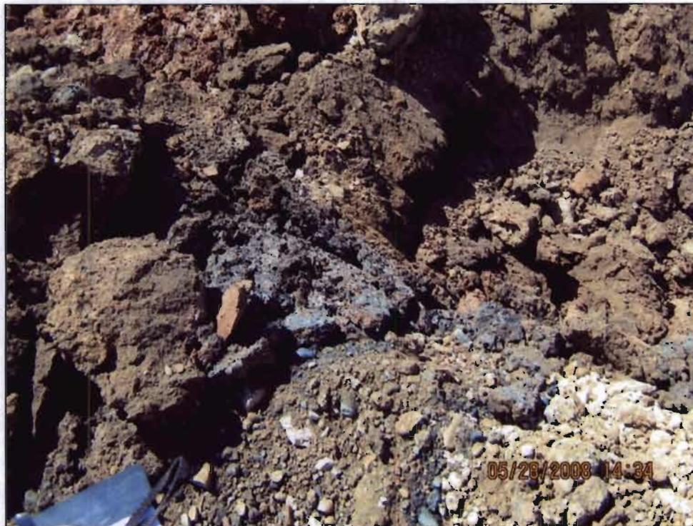
A view of the discolored soils noted during the test pit excavation at the former MRS Plating Shop building area.