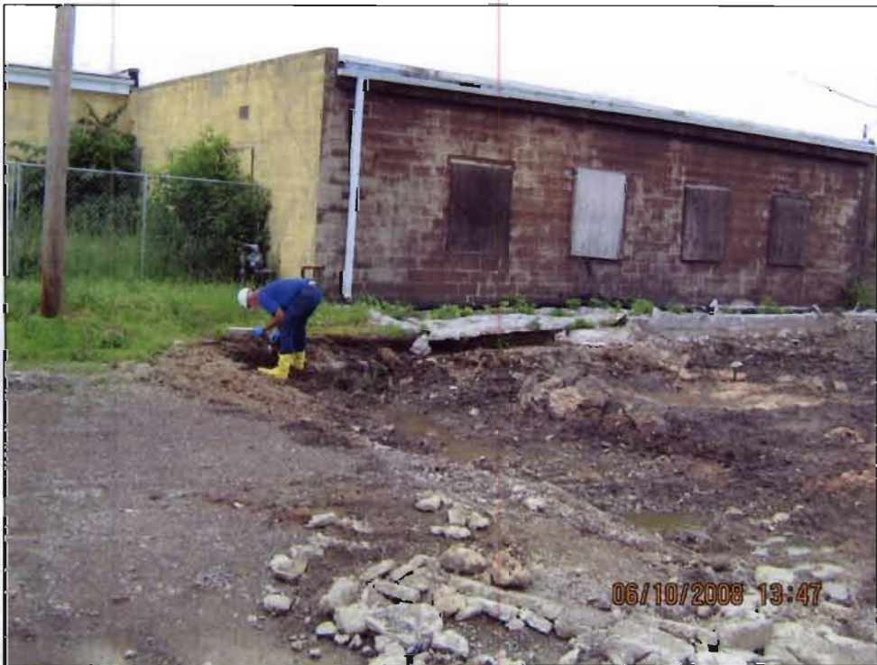
WRS personnel collecting non-hazardous soil samples from the area located between south of the former Plating Shop Building and the Rene Place.