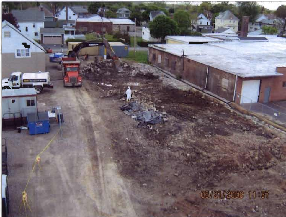
Overview of the MRS Plating Facility looking towards Rene Place. Loading of concrete debris removed from the MRS Plating Shop building floors and footers for removal.