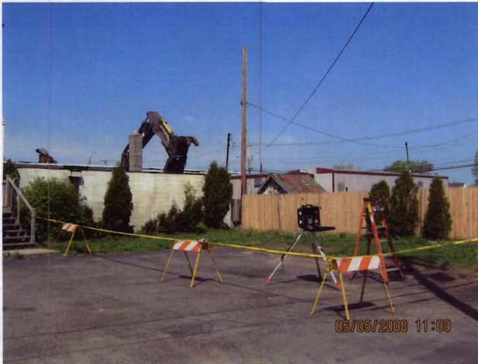
Demolition of the MRS Plating Office.