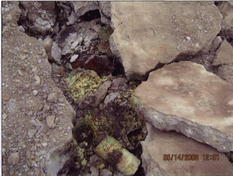
A view of discolored concrete floor removed from the MRS Plating Shop building area.