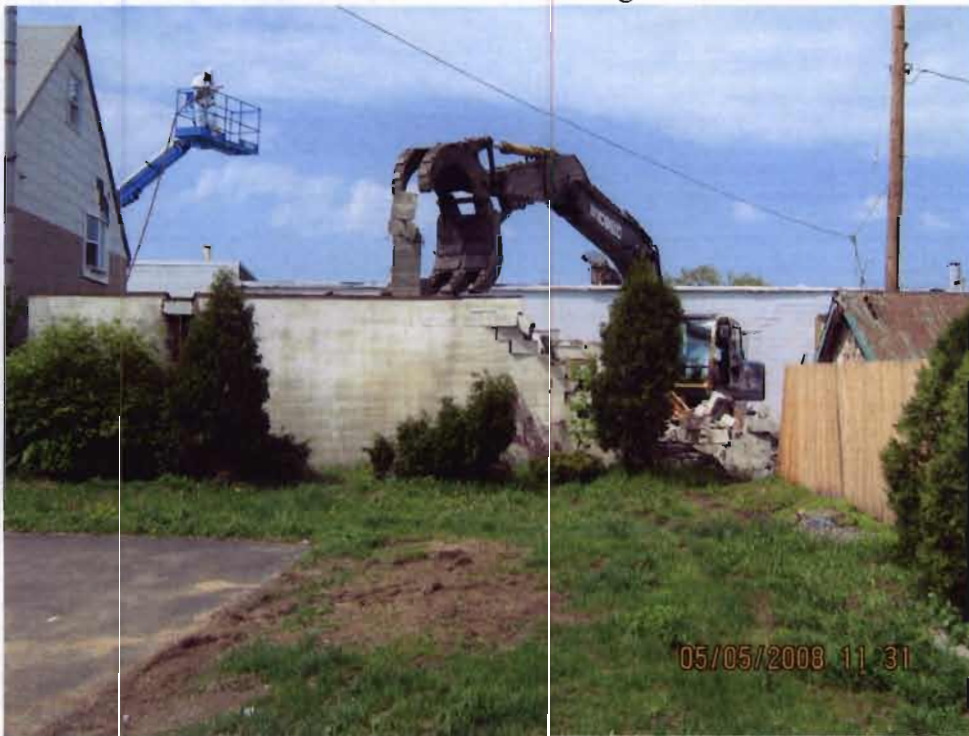
Demolition of the MRS Plating Office.