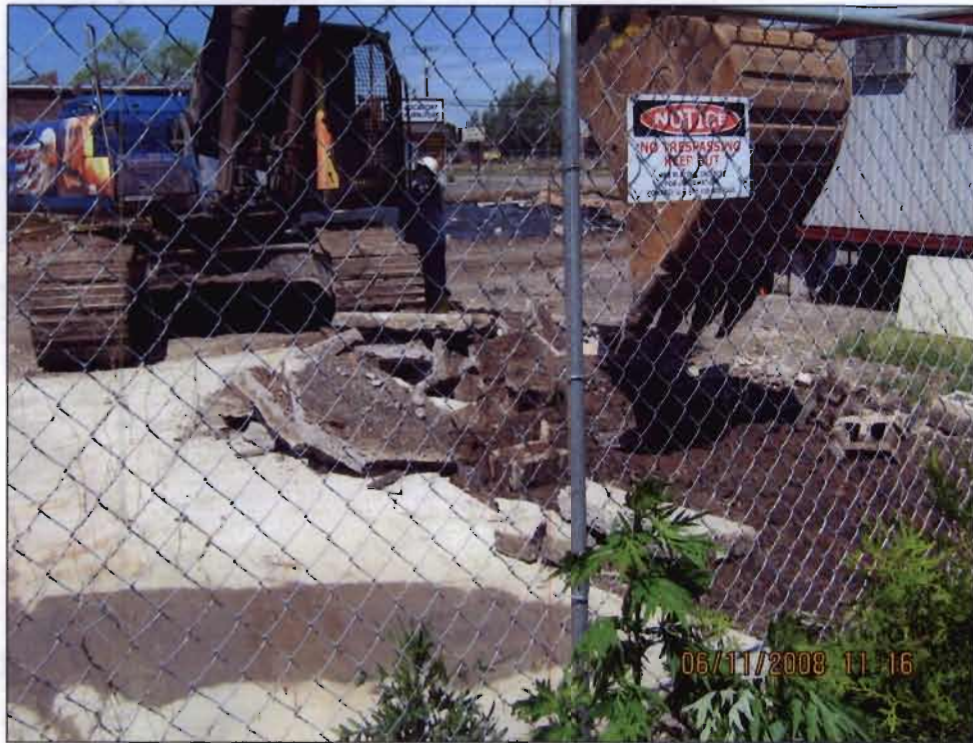
WRS removing the concrete floors and footers, view of the former office building location.