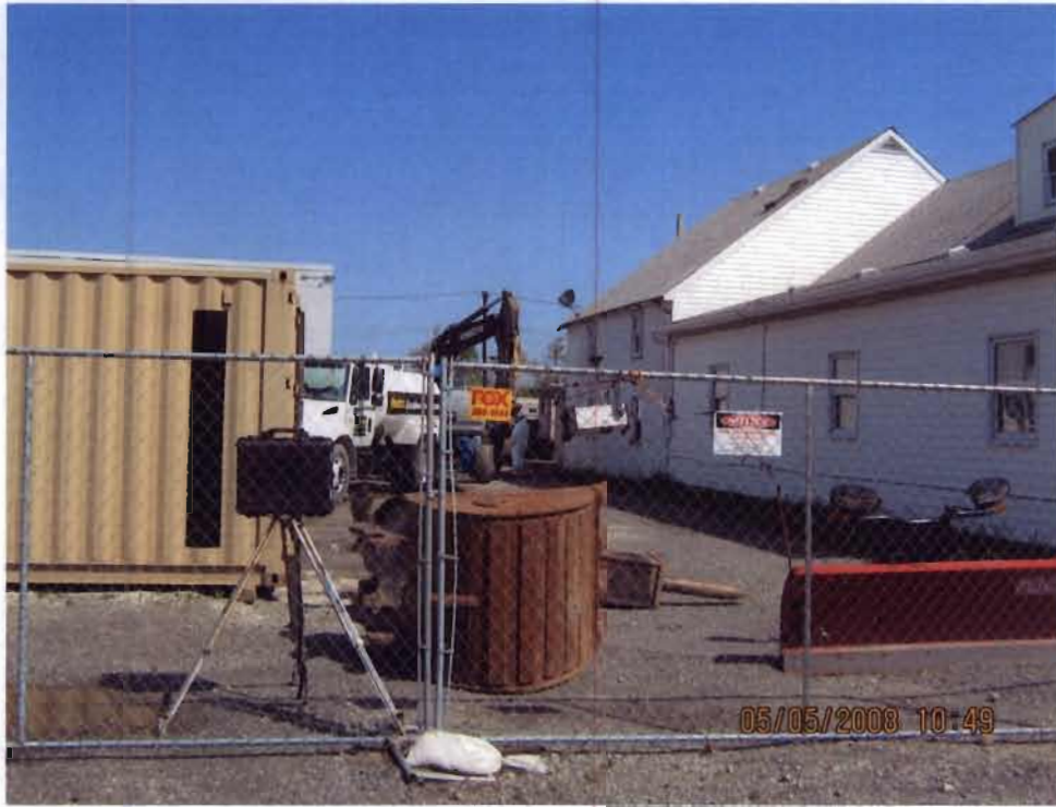
Air Monitoring Station #3 located near Rene Place.