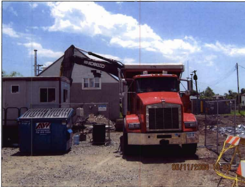
WRS loading concrete debris removal, generated during the removal of floors and footers of the former office building.