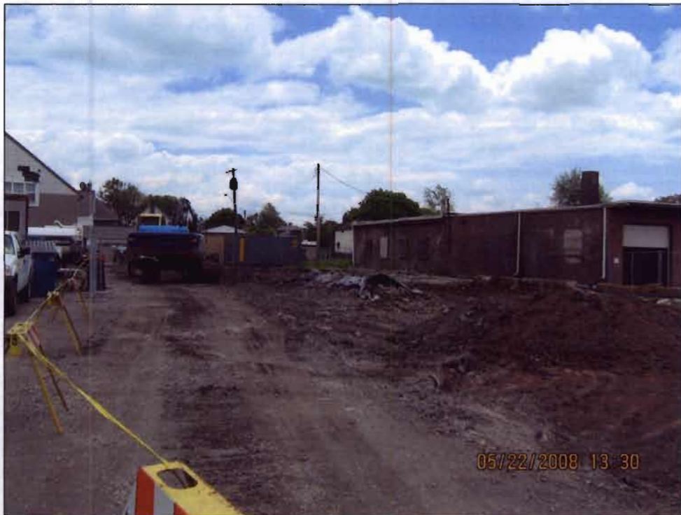
A view of the MRS Plating Facility looking towards Rene Place during the removal activities.