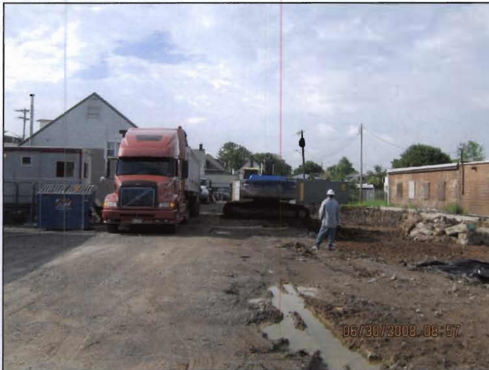
Loading of the contaminated soils, removed from the former MRS Plating Shop building area for the off-site treatment and disposal at Michigan Disposal facility, Belleville, MI.