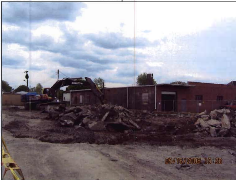
WRS crushing large concrete pieces into manageable small for load out.