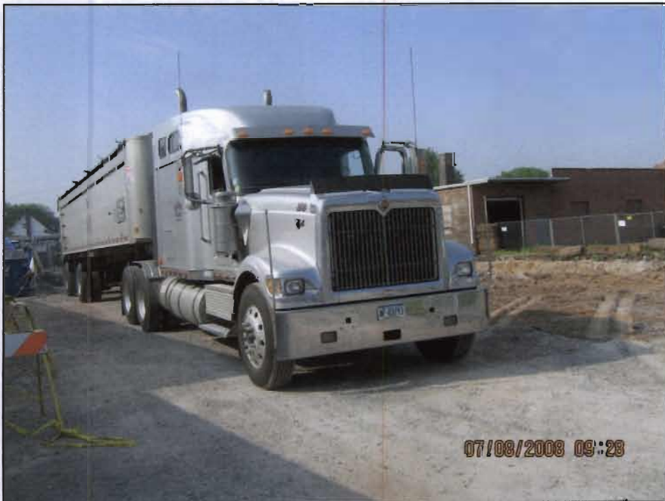
Loading of the contaminated soils, removed from the former MRS Plating Shop building area for the off-site treatment and disposal at Michigan Disposal facility, Belleville, MI.