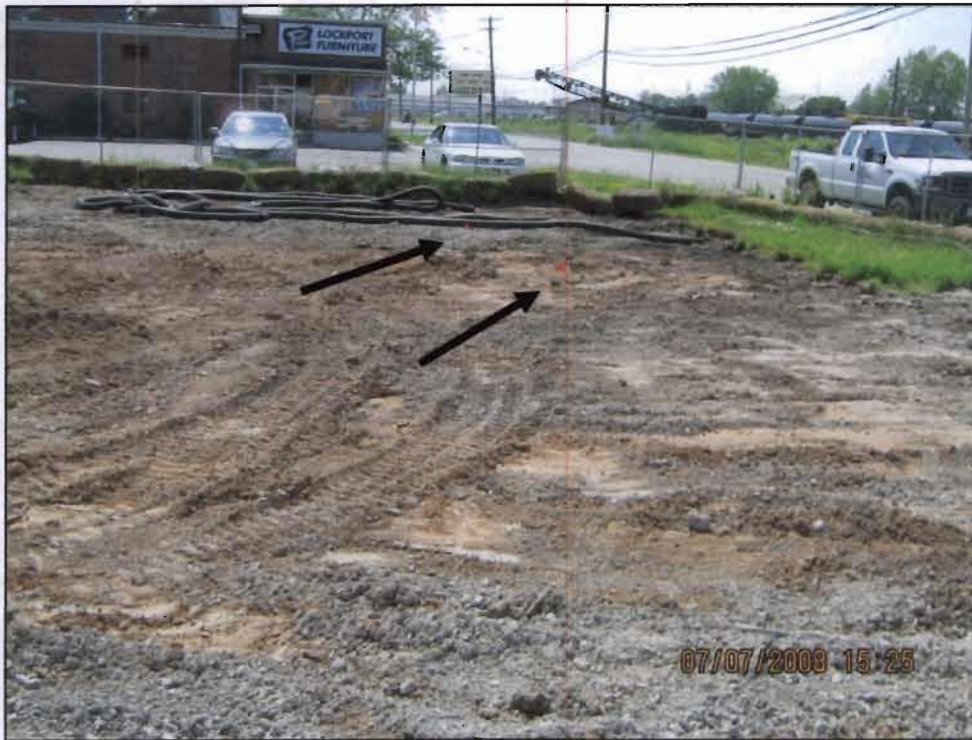
View of the area located between the former plating shop building and Park Avenue. Note locations (red flags) of the two confirmation/post-excitation soil samples.