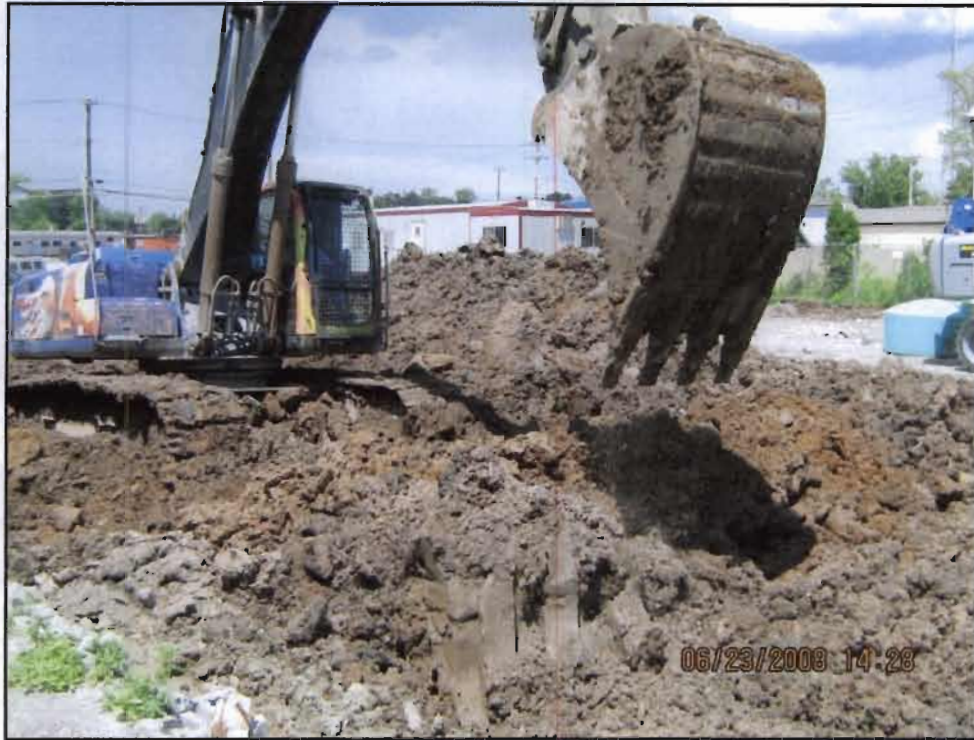
WRS personnel removing contaminated soil from the former plating shop building area and staging on site for off-site treatment and disposal.