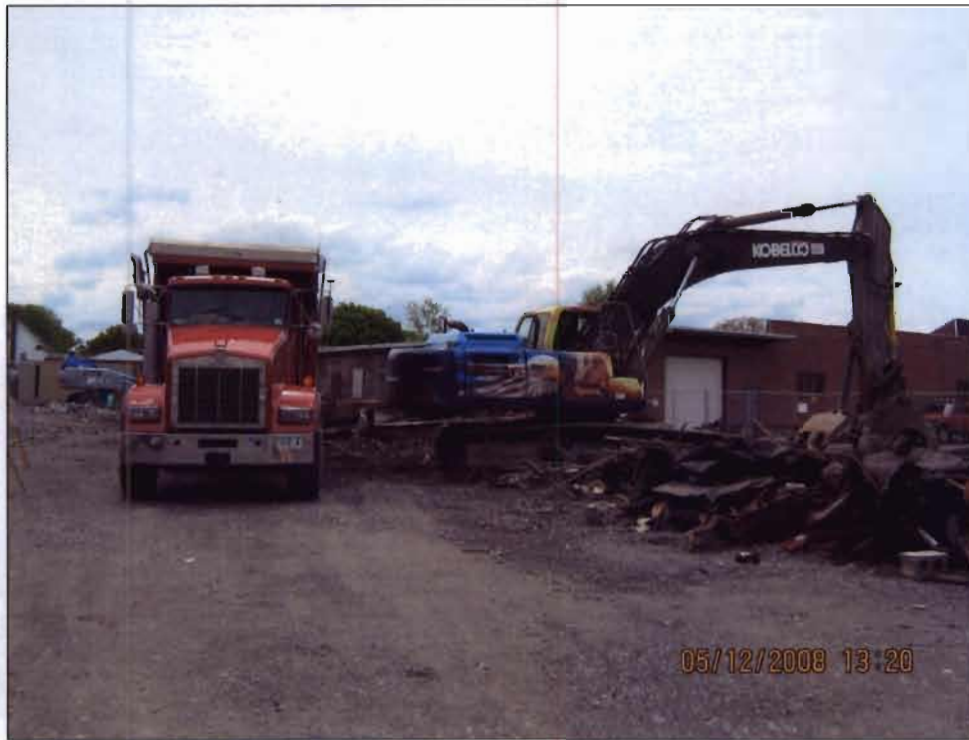
Loading of demolition metal debris for removal.