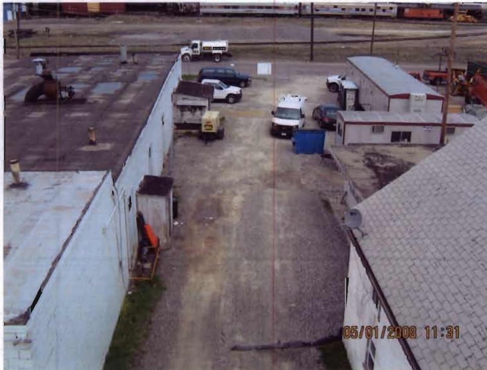
Overview of the MRS Plating Facility looking towards Park Ave.