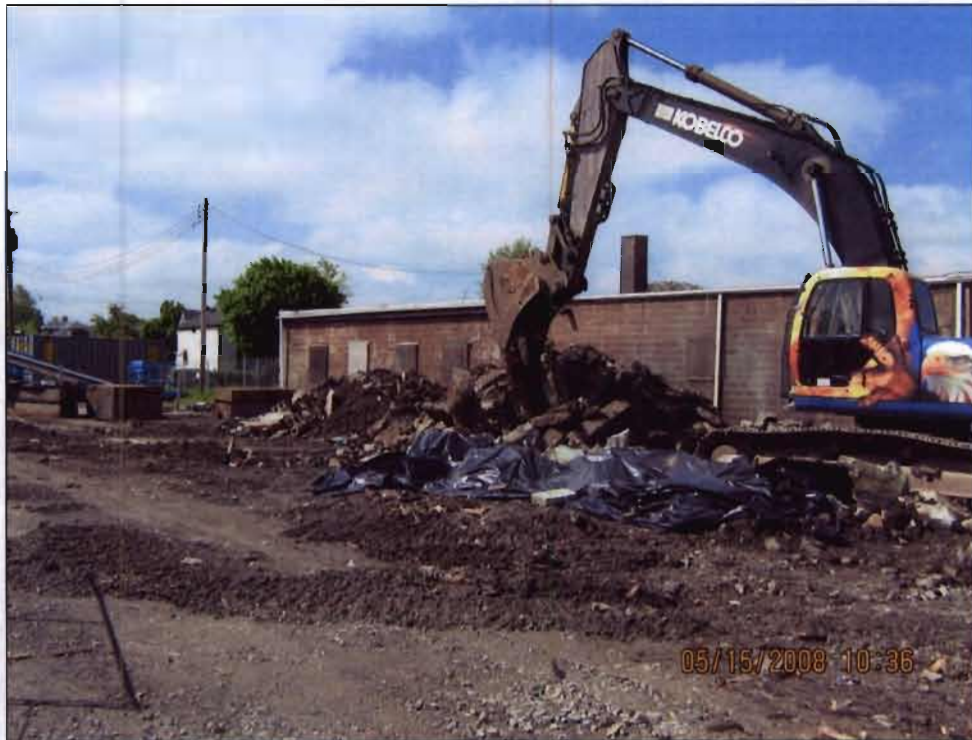
WRS segregating debris of the concrete flooring and concrete footers removed from the demolished MRS Plating Shop building.