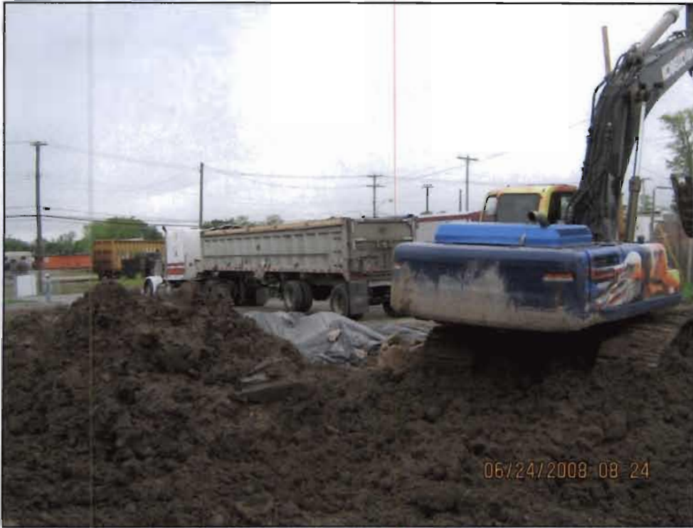
Loading of the contaminated soils, removed from the former MRS Plating Shop building area for the off-site treatment and disposal at Michigan Disposal facility, Belleville, MI.