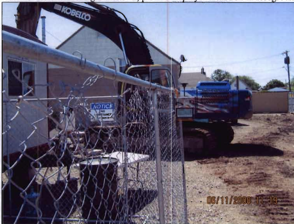
WRS removing the concrete floors and footers, view of the former office building location. Air Monitoring Station #2, picture displays AreaRAE, SKC Pumps and DataRAM Monitor.