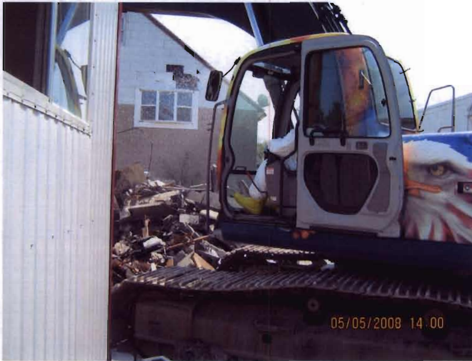
Close up of the Demolition grapple.