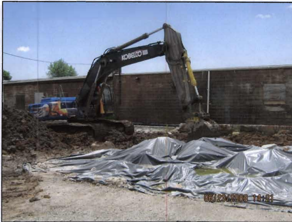
WRS personnel removing contaminated soil at the former plating shop area for off-site treatment and disposal.