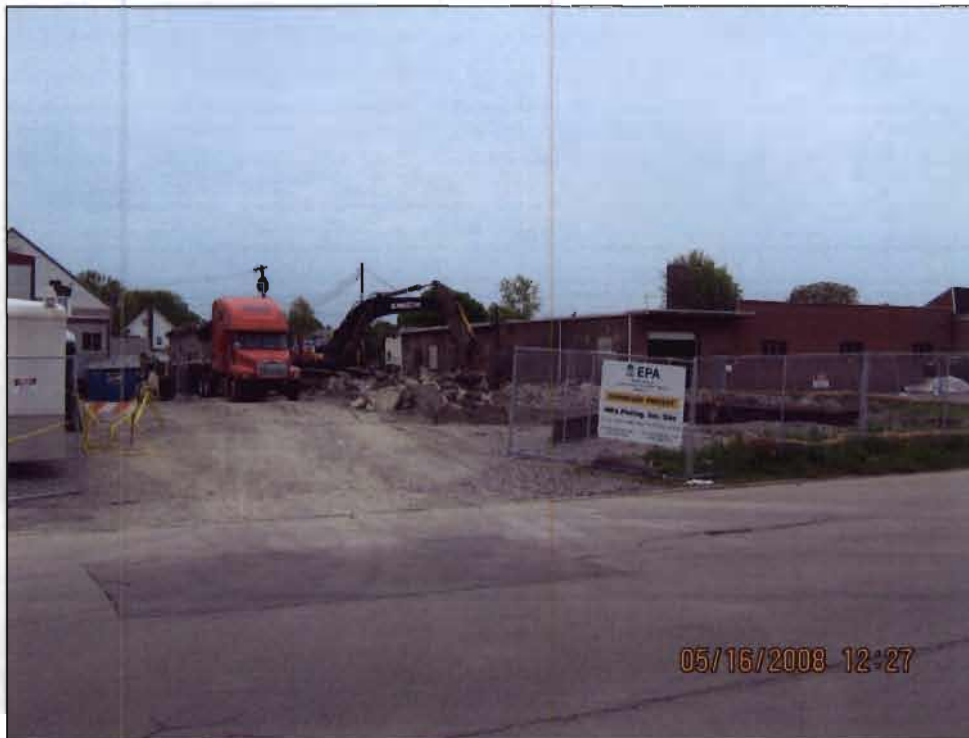
Loading of concrete debris removed from the MRS Plating Shop building floors and footers for removal.