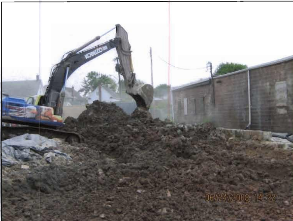
WRS personnel treating contaminated soil with cement to facilitate drying and reduce the TCE vapors for off-site disposal at Michigan Disposal facility, Belleville, MI.