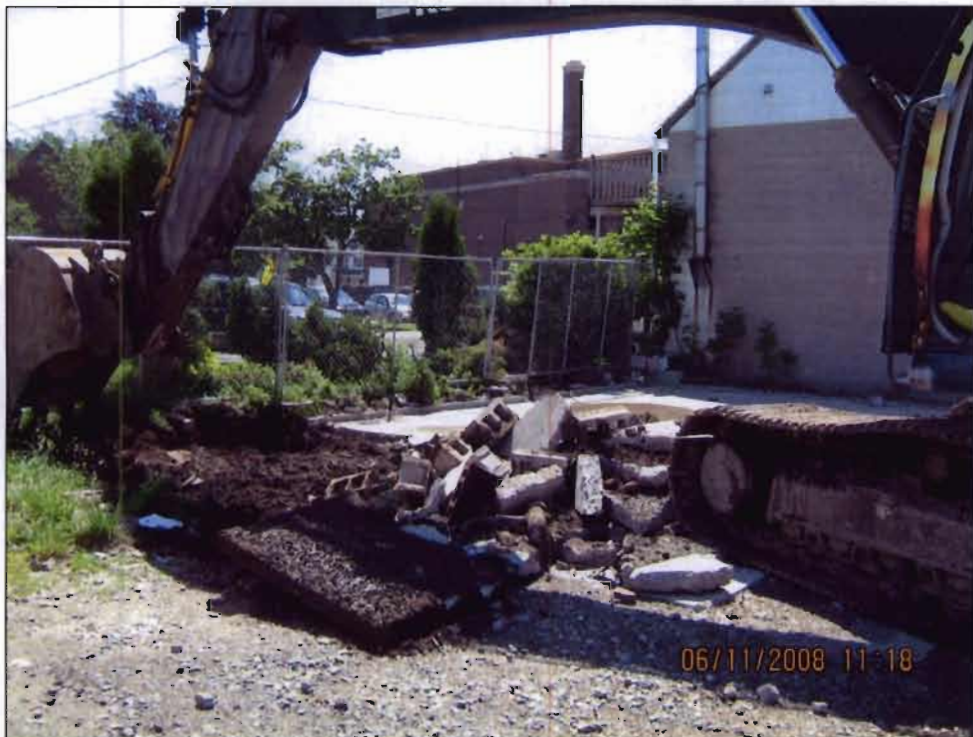
WRS removing the concrete floors and footers, view of the former office building location.