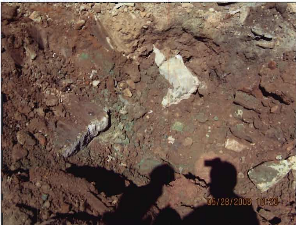
A view of the discolored soils noted during the test pit excavation at the former MRS Plating Shop building area.