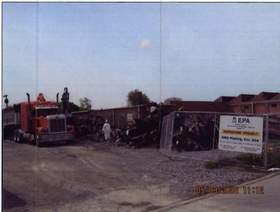
Loading of demolition debris for removal and off-site disposal.