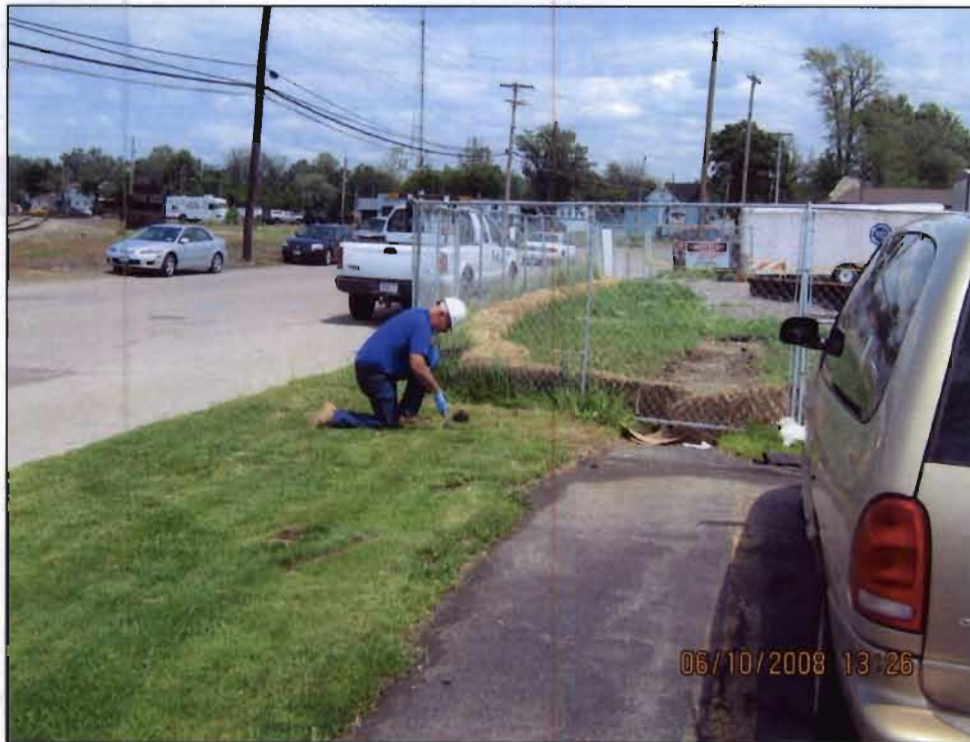
WRS personnel collecting non-hazardous soil samples along the Park Avenue and on the adjacent property located west of the MRS Plating Site.