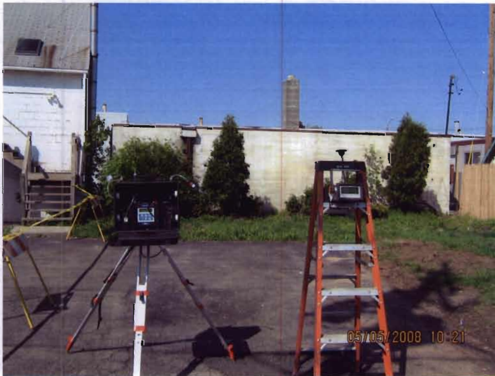
Air Monitoring Station #3