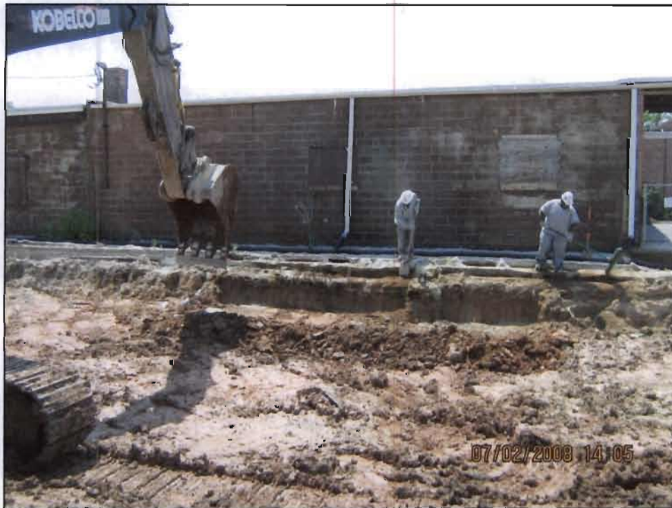
WRS removing soils at the former Plating Shop building foundation located along the adjacent furniture store building (located west) for off-site shipment and disposal.