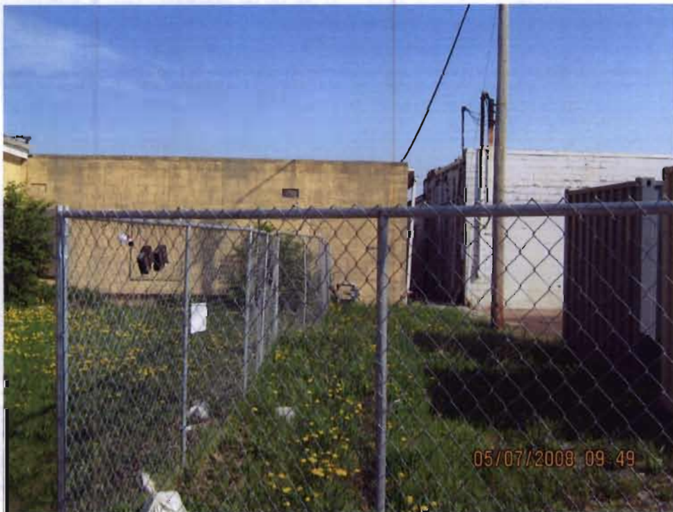
Air Monitoring Station #4.