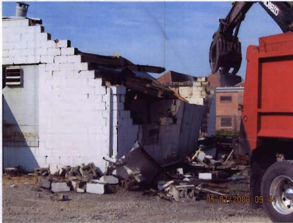
The demolition to the MRS Plating Shop.