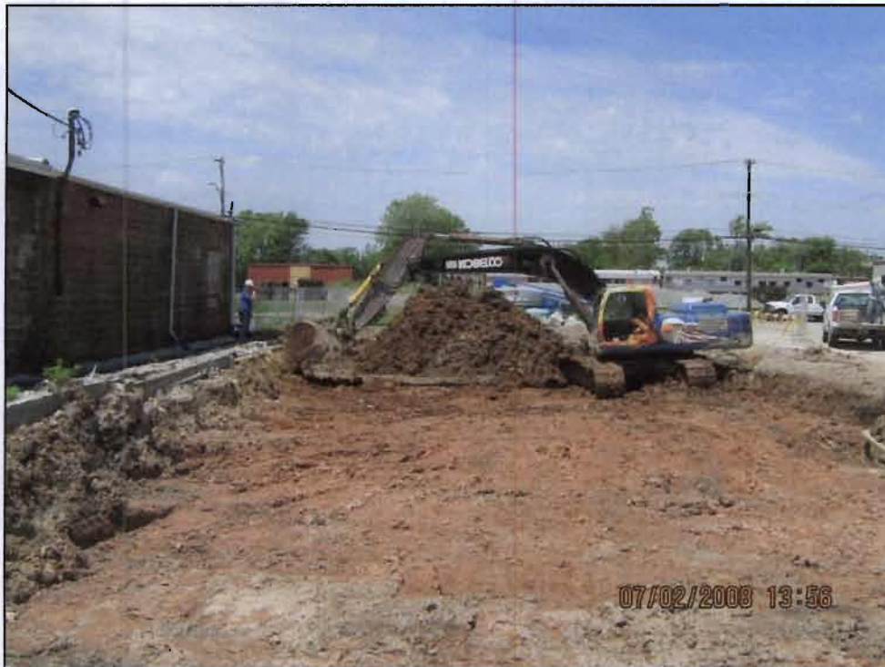
WRS removing soils at the former Plating Shop building location along the adjacent furniture store building (located west) for off-site shipment and disposal.