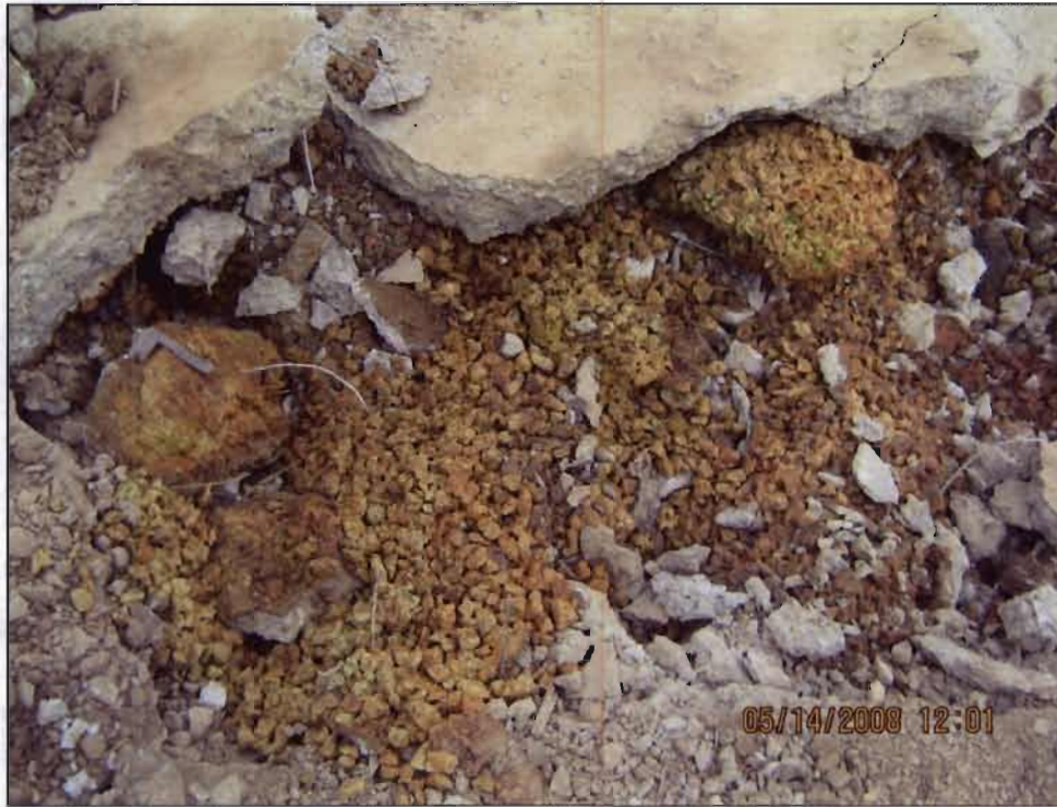
A view of discolored concrete floor removed from the MRS Plating Shop building area.