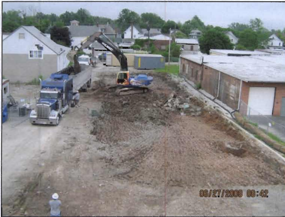
Overview of the Facility looking towards south during the loading of the contaminated soils removed for the off-site treatment and disposal at Michigan Disposal facility, MI.