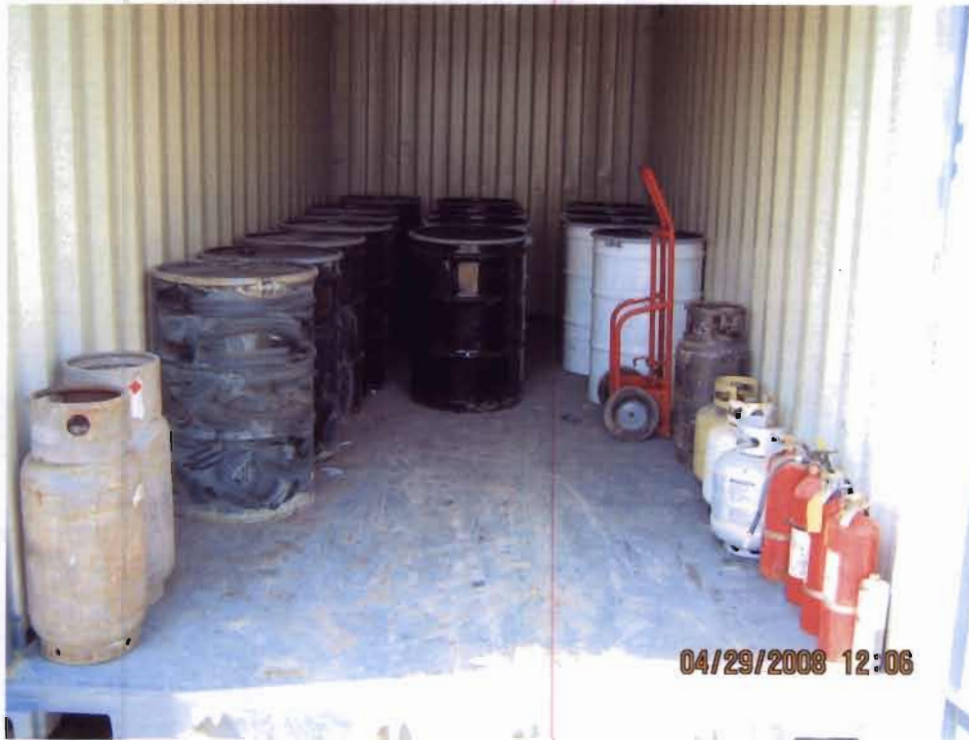
Drums containing waste from the MRS Plating Shop placed for storage.