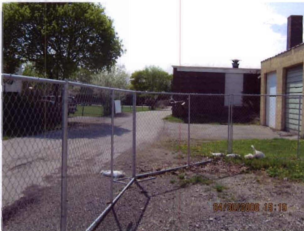
Air Monitoring Station #4 with SKC Pump located by Rene Place Road.