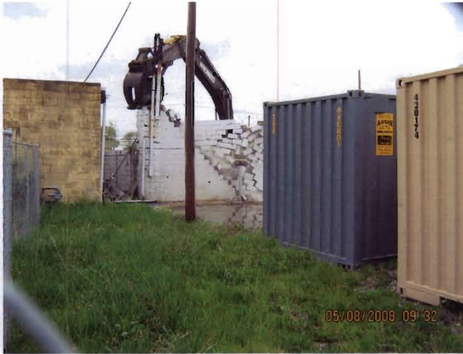
Demolition of the back wall of the MRS Plating Shop.