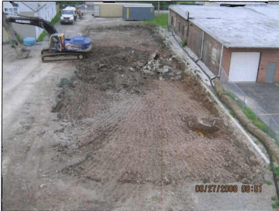
Overview of the facility looking towards (South) Rene Place. The adjacent private residence to east and the furniture store building to the west are in the background.