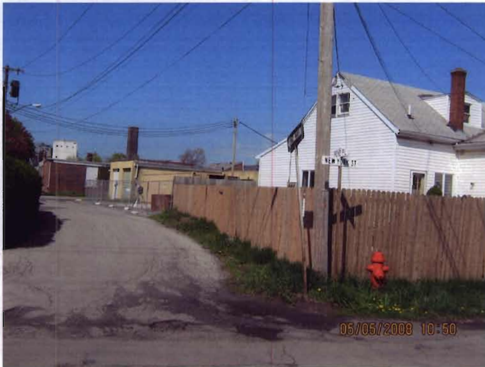
The corner of Rene Place and New York Street, looking down along Rene Place Road.