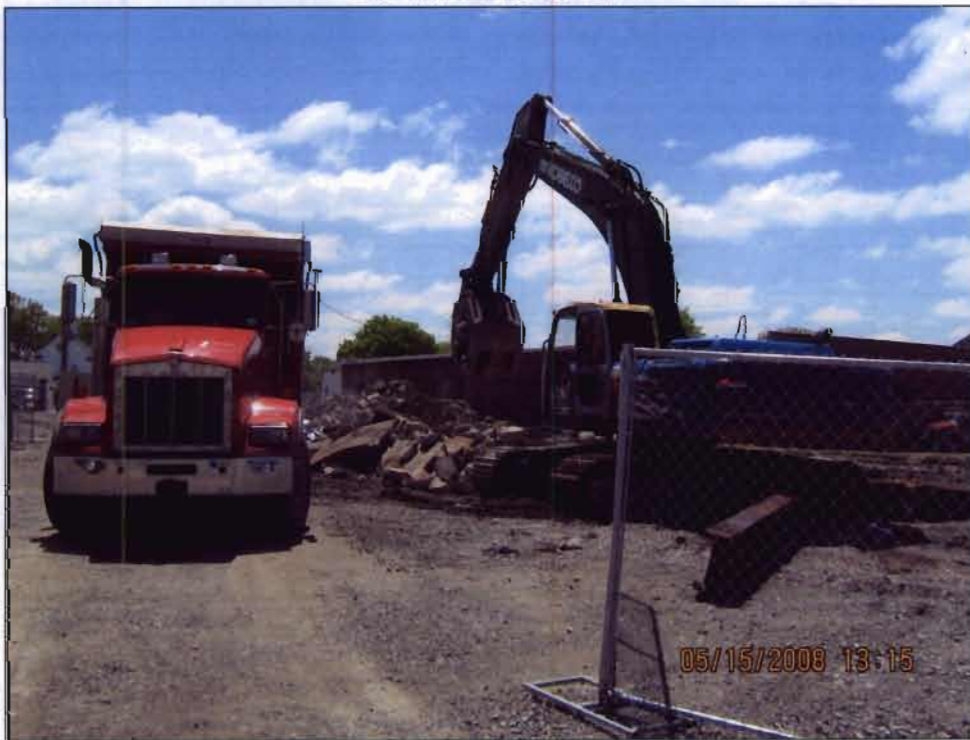
Loading of concrete debris removed from the MRS Plating Shop building floors and footers for removal.