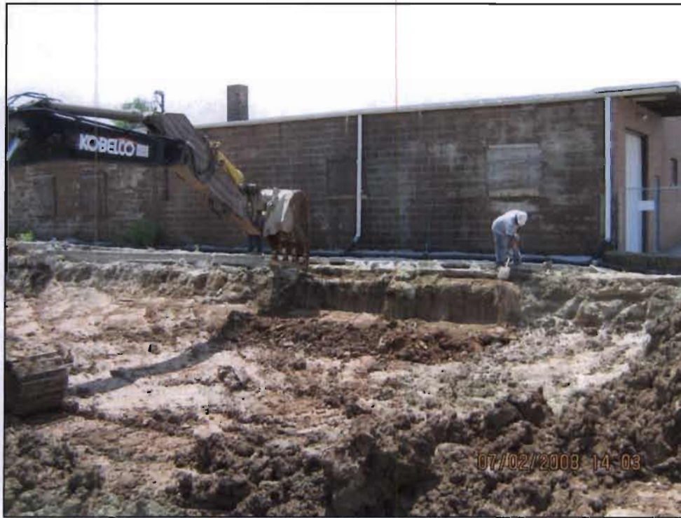
WRS removing soils at the former Plating Shop building foundation located along the adjacent furniture store building (located west) for off-site shipment and disposal.