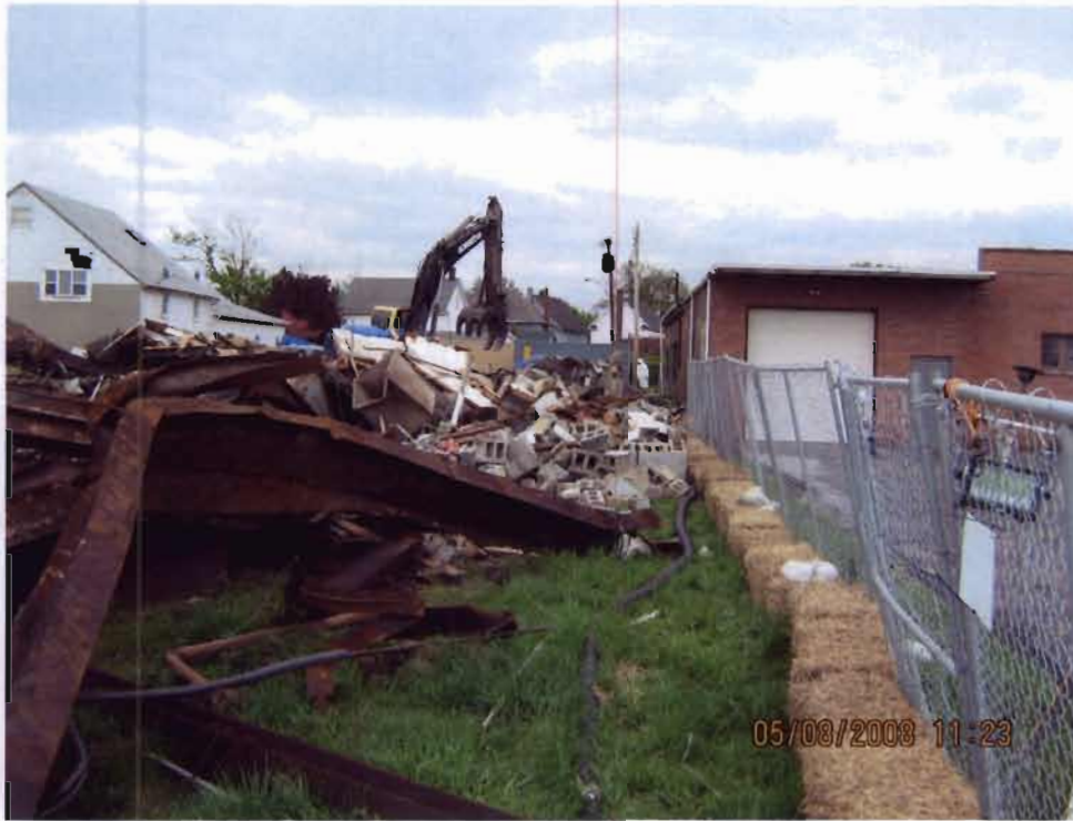
Following the demolition of MRS Plating Shop, WRS segregates building materials.