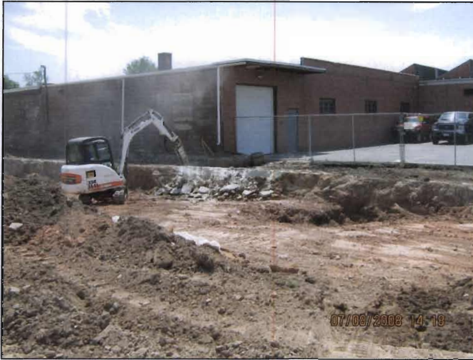
WRS removing top concrete (mostly discolored) layers from the remaining western foundation wall of the former plating shop building prior to filling area with the clean fill.