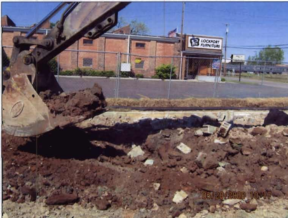
WRS excavating test pits for soil screening and sampling within the Plating Shop building area. Soil screening and sampling were performed by the RST 2 team members.