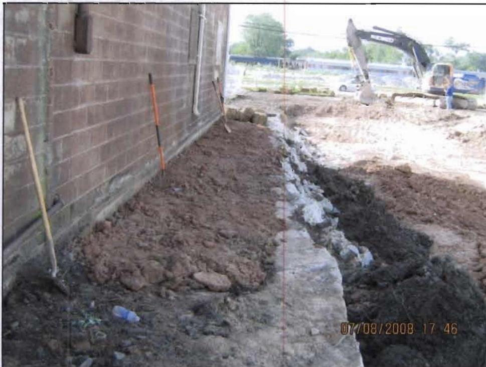
WRS placing clean fill area between the remaining western foundation wall of the former plating shop building and the adjacent furniture store building along the west.