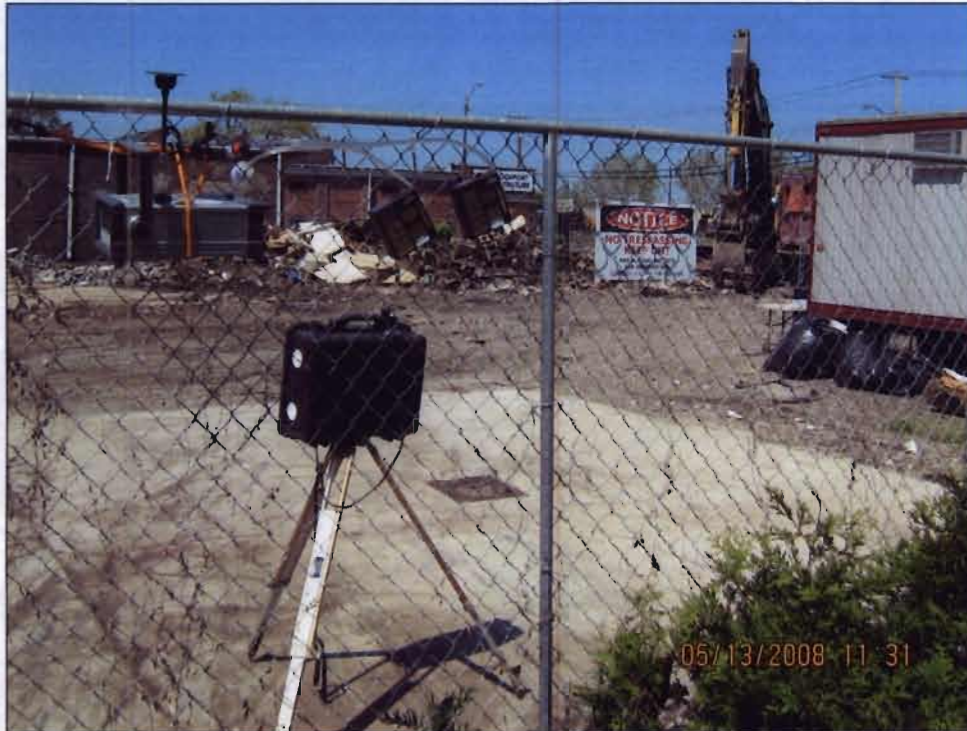
Air Monitoring Station #2 located at eastern facility fence next to a Residential Property.