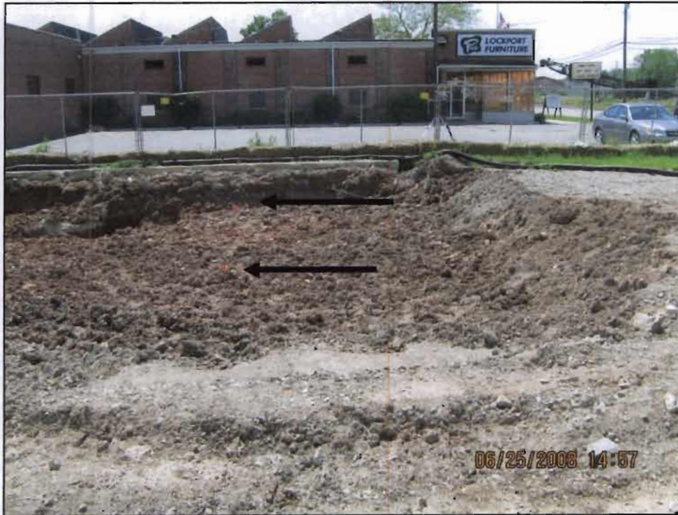
View of the northern section of the excavation along the Park Avenue. Locations of the two Confirmation (post-excitation) soil sample collected for laboratory analysis.