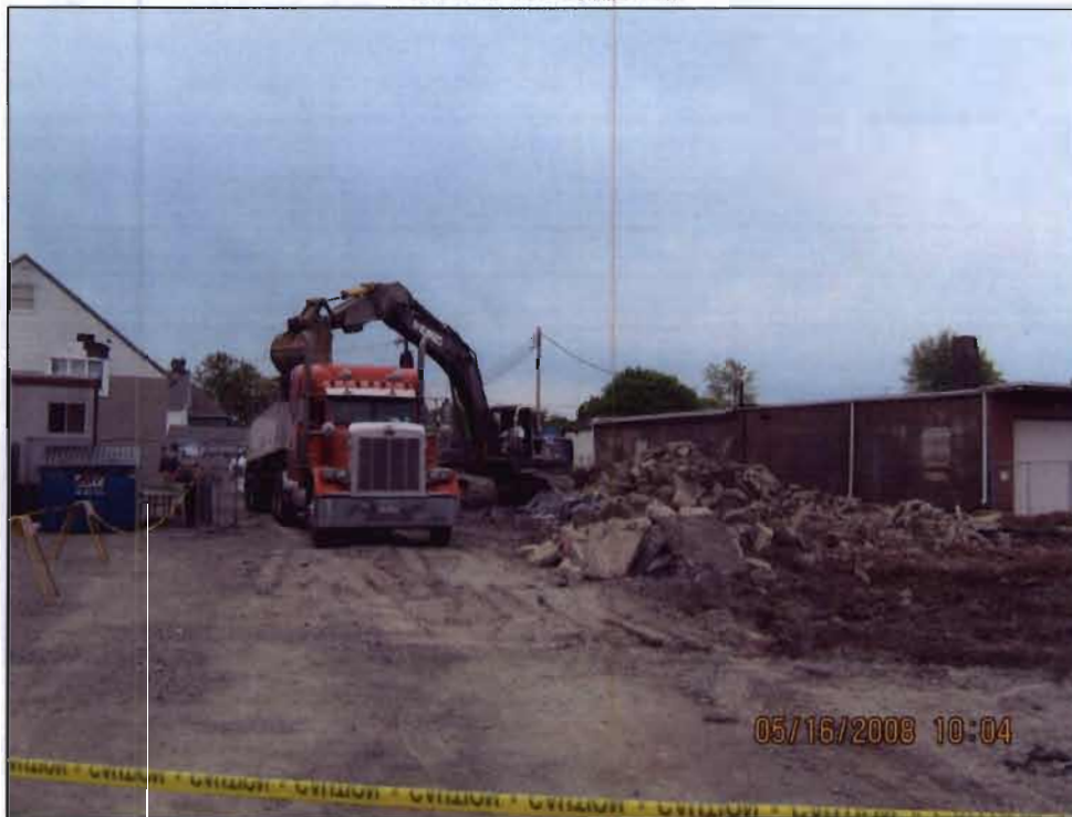
Loading of concrete debris removed from the MRS Plating Shop building floors and footers for removal.