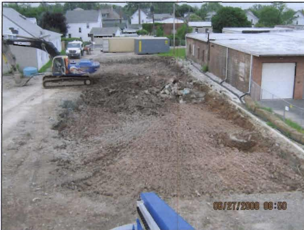
Overview of the facility looking towards (South) Rene Place. The private residences are located in the background.