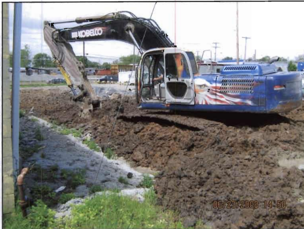
WRS personnel treating contaminated soil with cement to facilitate drying for off-site shipment for the disposal at Michigan Disposal facility, Belleville, MI.