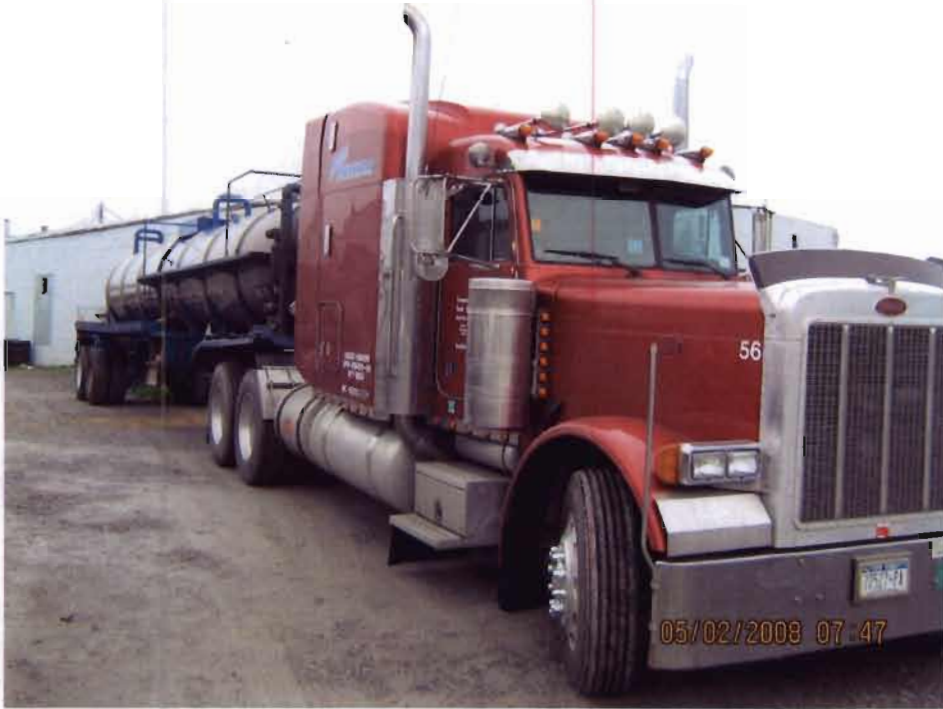
Water Disposal Tanker.