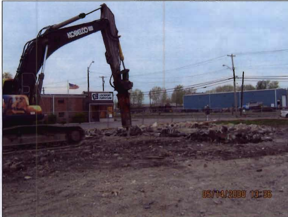
WRS removing concrete flooring and footers of the former MRS Plating Shop building.