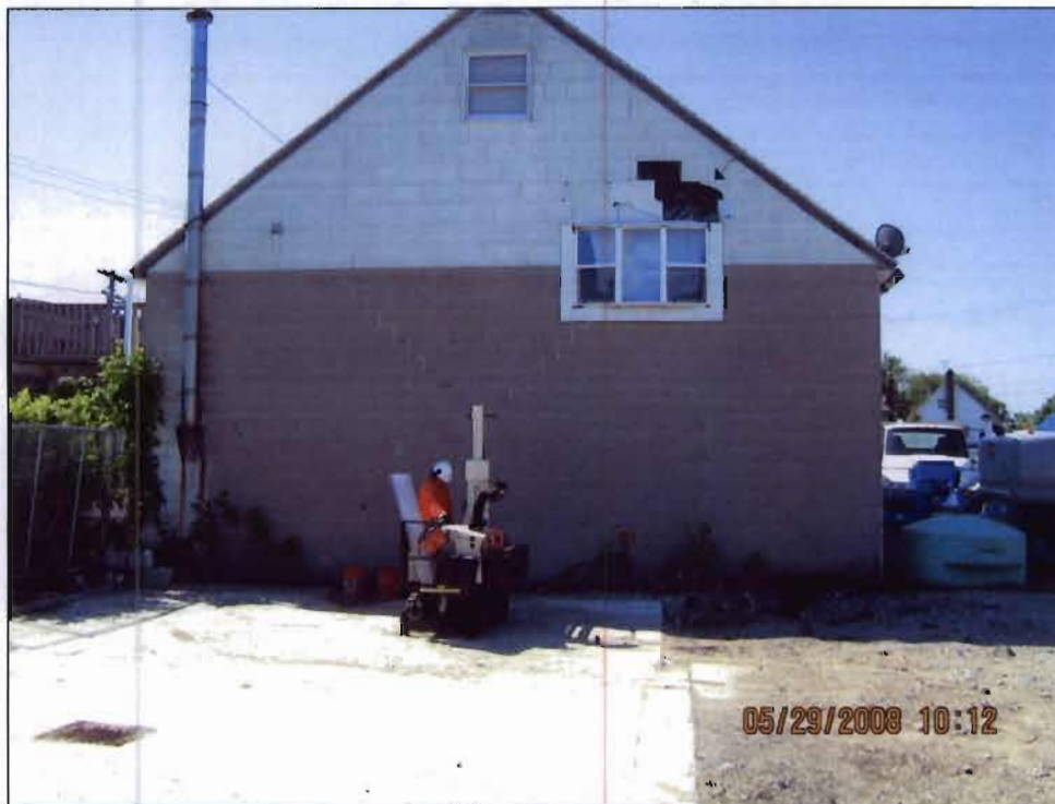
View toward south showing Geoprobe® setup. Soil boring and sampling performed at the former MRS Plating Office building area and north of the private residential property.