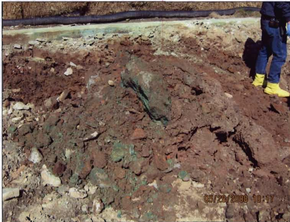
The discolored soils at the former MRS Plating Shop building area were sampled and analyzed for waste classification parameters for disposal purposes.