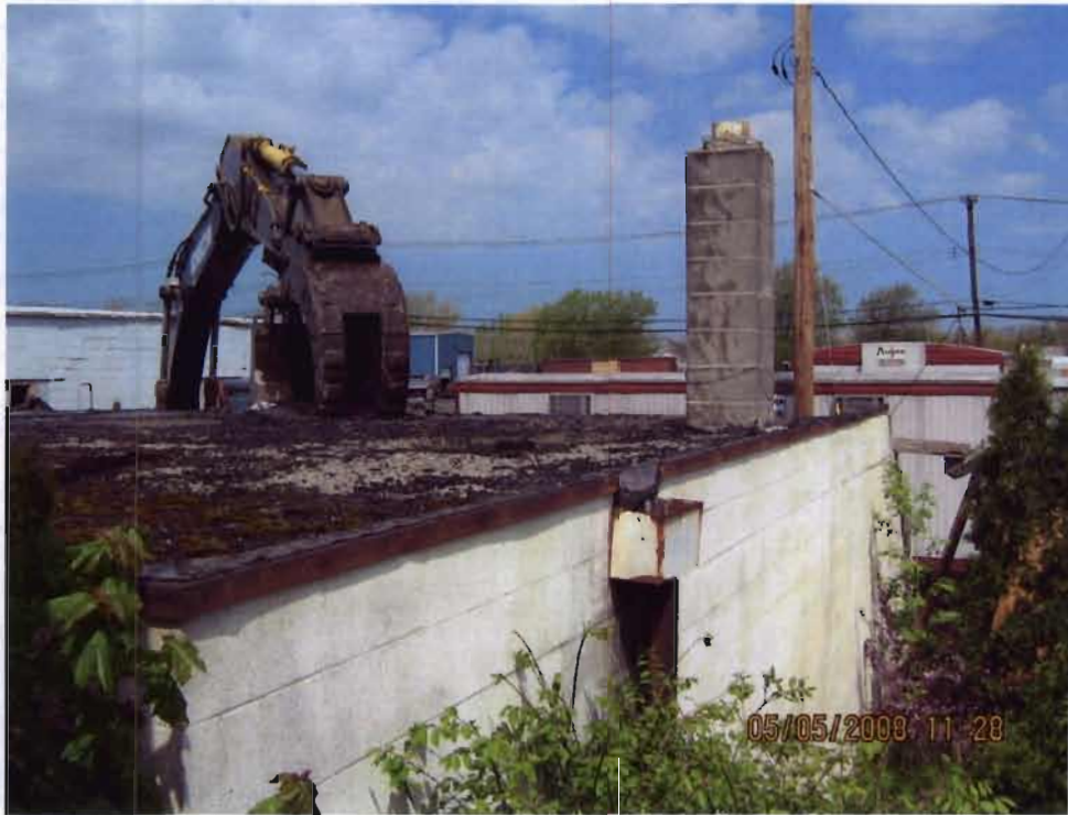
Demolition of the MRS Plating Office.