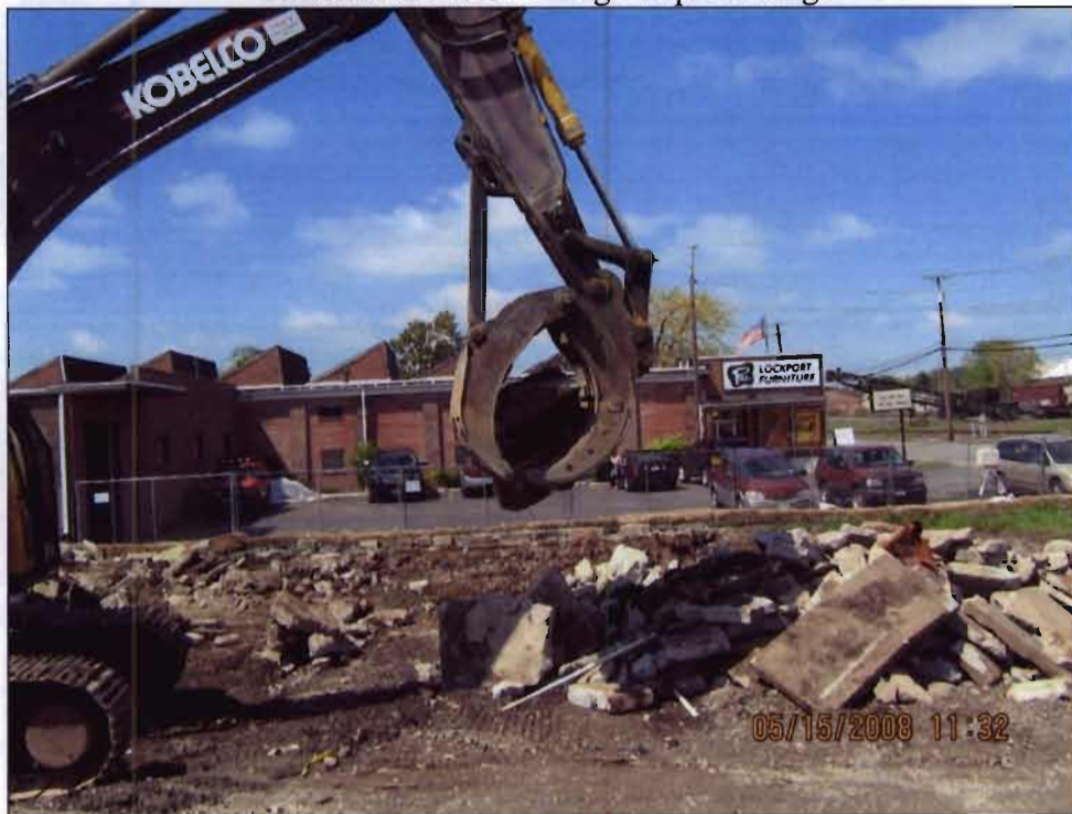
WRS segregating debris of the concrete flooring and concrete footers removed from the demolished MRS Plating Shop building.