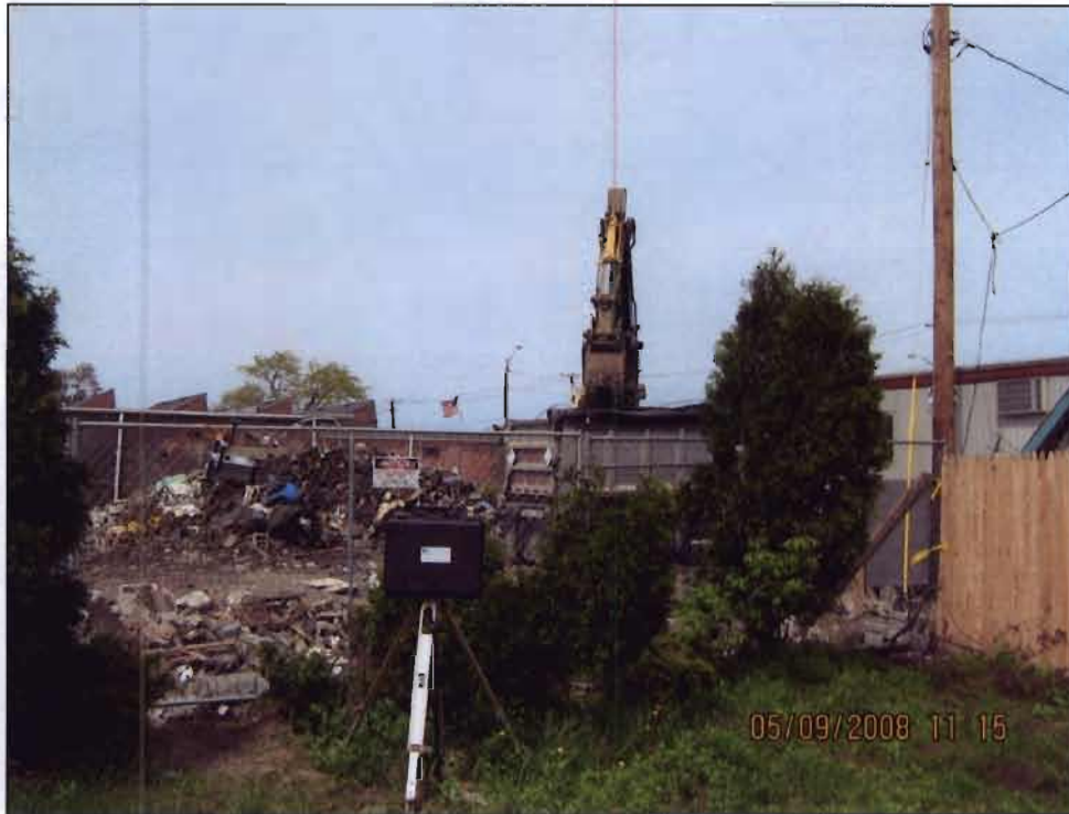
Air Monitoring Station #2 located at the eastern site fence.