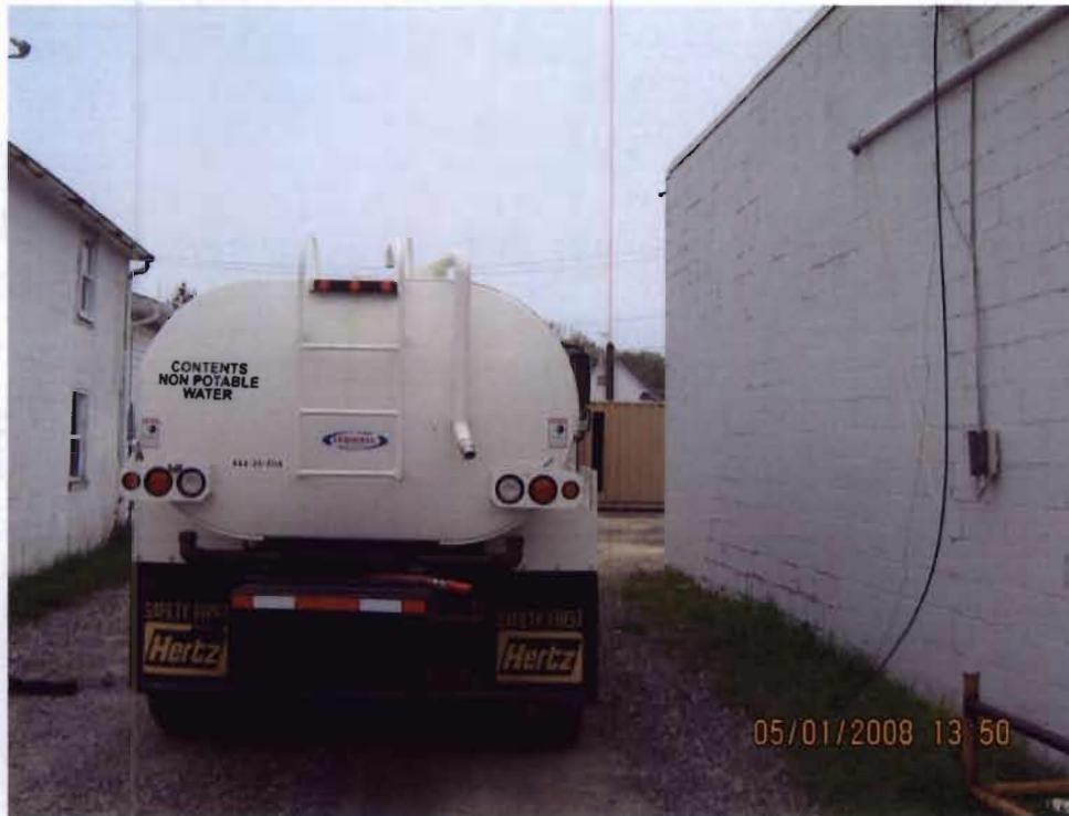
Water Tanker used for cleaning vats.