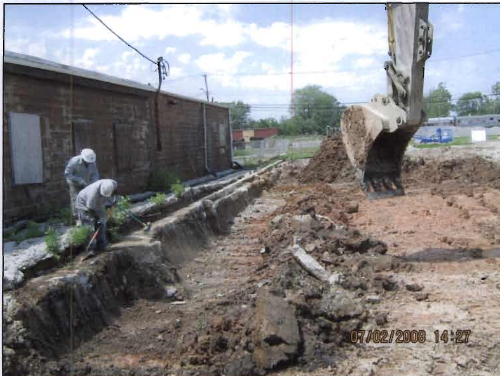
WRS removing soils at the former Plating Shop building foundation located along the adjacent furniture store building (located west) for off-site shipment and disposal.