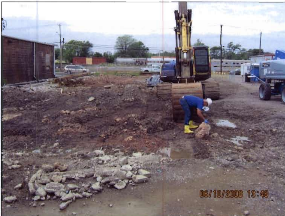
WRS personnel collecting non-hazardous soil samples from the area located between south of the former Plating Shop Building and the Rene Place.