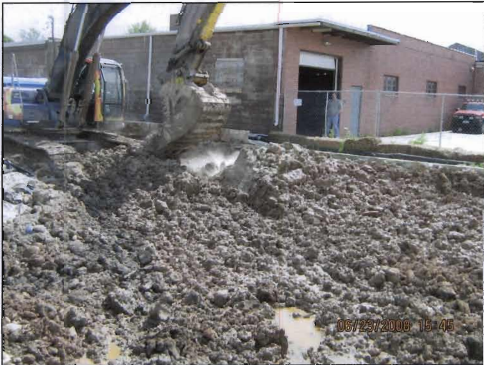
WRS personnel treating contaminated soil with cement to facilitate drying and reduce the TCE vapors for off-site disposal at Michigan Disposal facility, Belleville, MI.