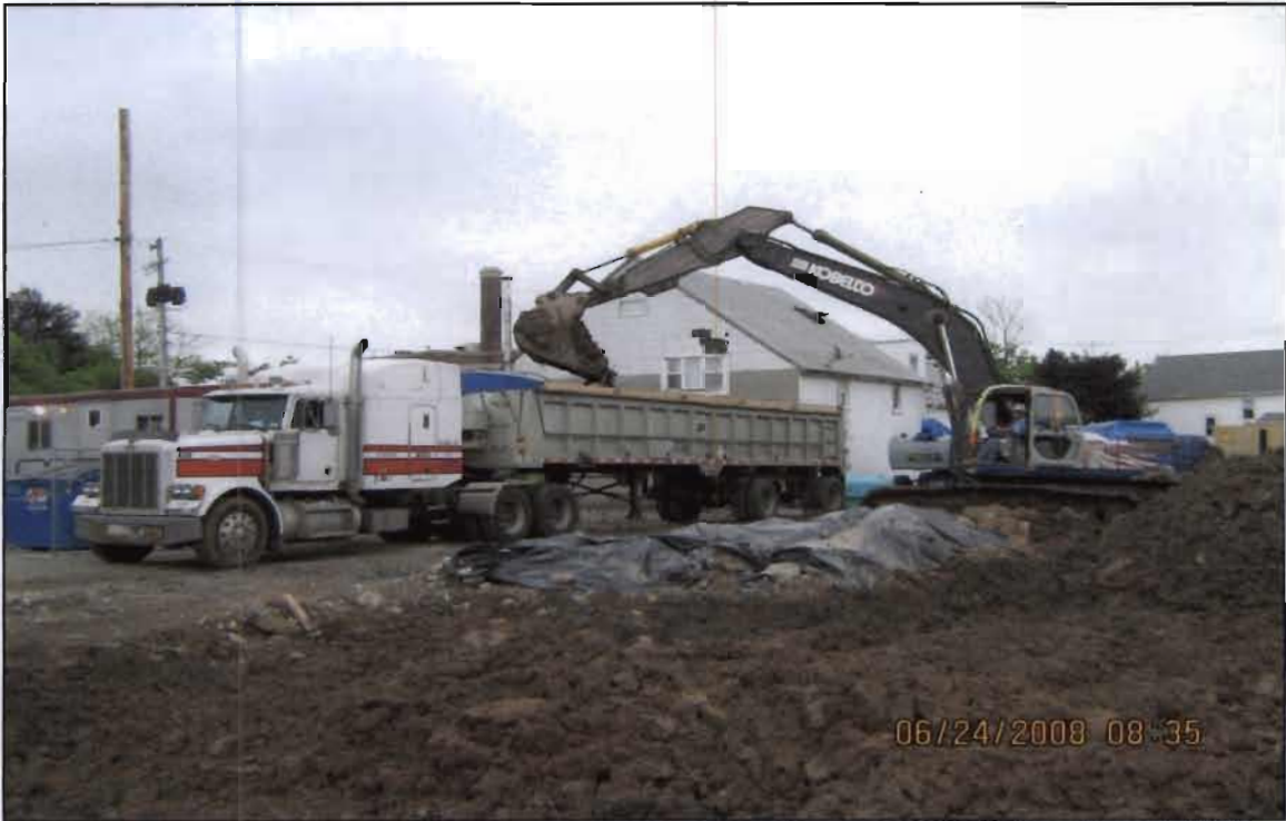
Loading of the contaminated soils, removed from the former MRS Plating Shop building area for the off-site treatment and disposal at Michigan Disposal facility, Belleville, MI.