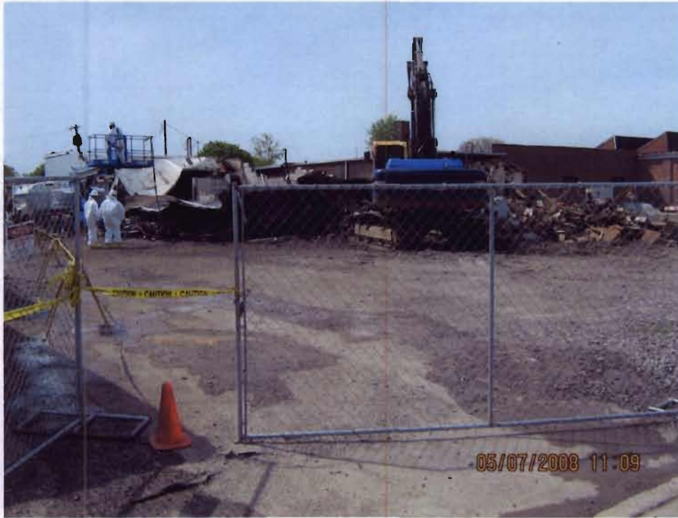
Demolition of the MRS Plating Shop, view from the front gate entrance.