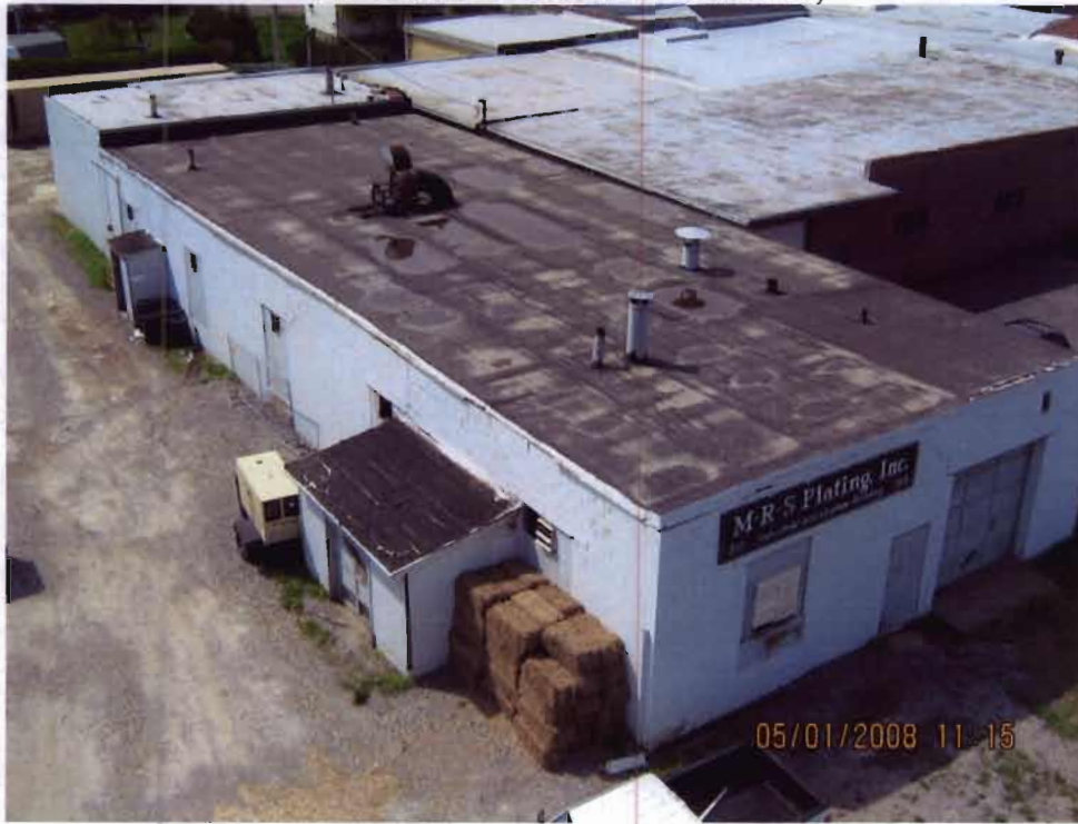
MRS Plating Shop Building.