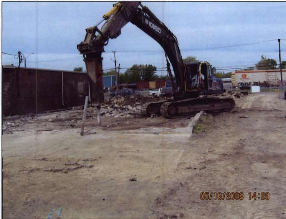
WRS removing concrete flooring of the demolished MRS Plating Shop building for off-site disposal.