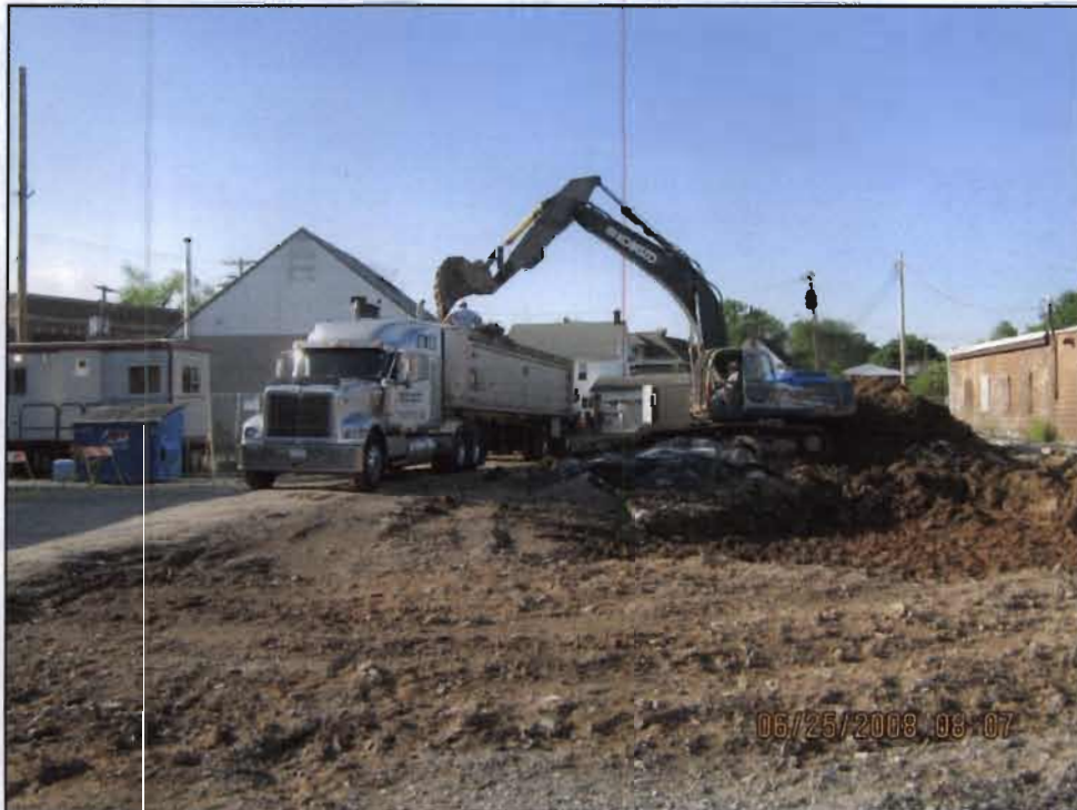
Loading of the contaminated soils, removed from the former MRS Plating Shop building area for the off-site treatment and disposal at Michigan Disposal facility, Belleville, MI.