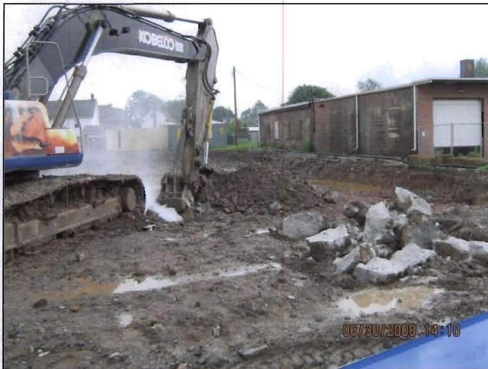
WRS crushing large concrete pieces into manageable small pieces for load out for off-site shipment, recycling and disposal at the Allied Waste facility.