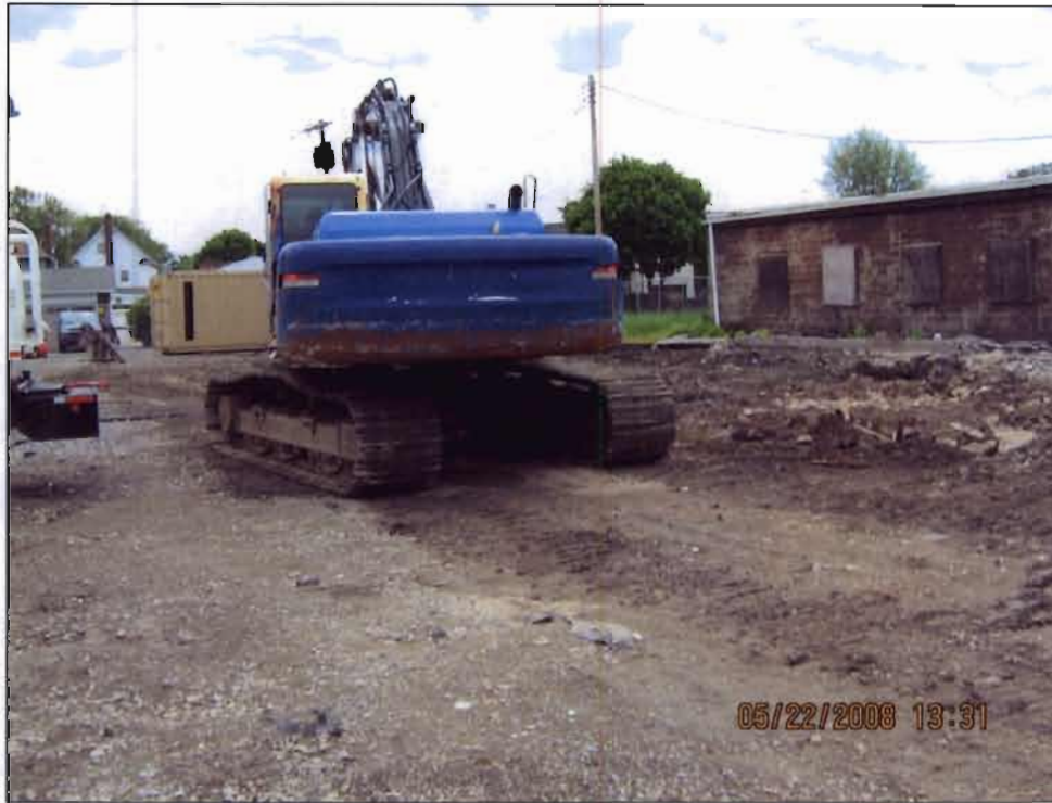
A view of the MRS Plating Facility looking towards Rene Place during the removal activities.