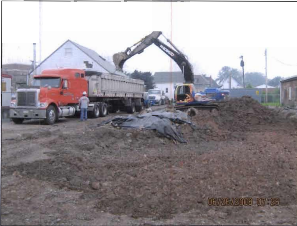
Loading of the contaminated soils, removed from the former MRS Plating Shop building area for the off-site treatment and disposal at Michigan Disposal facility, Belleville, MI.