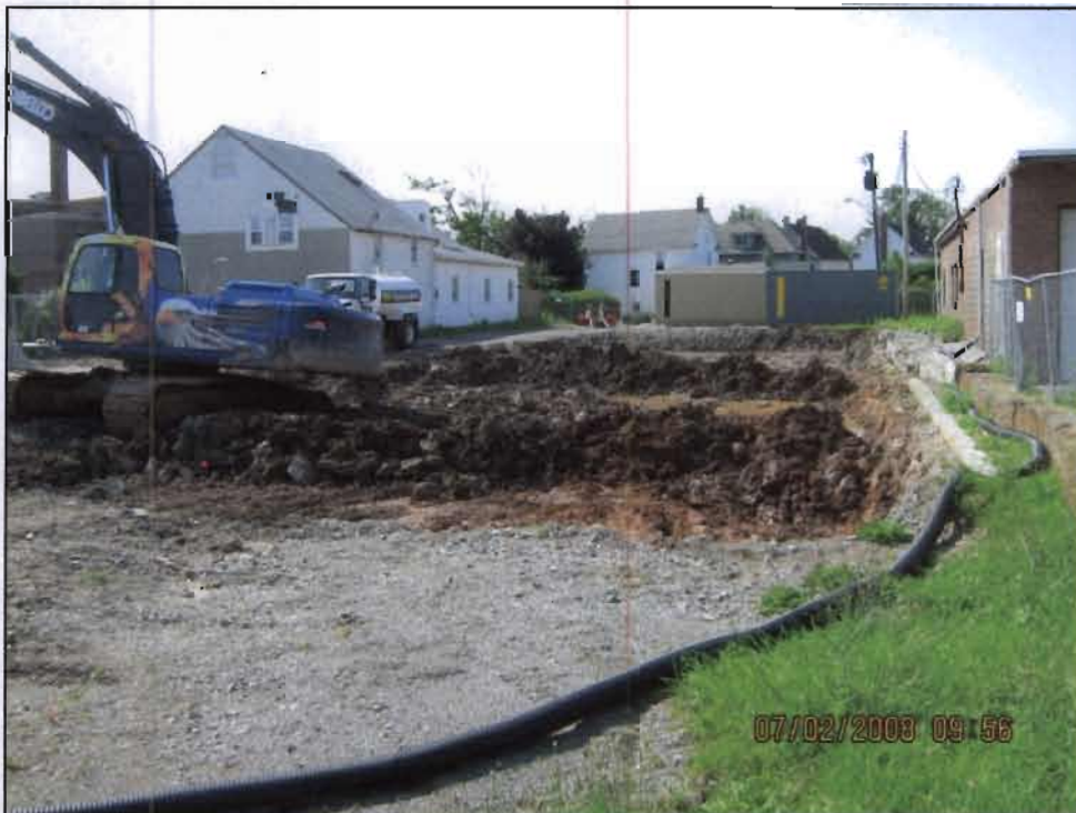
WRS removing soils at the former Plating Shop building location along the adjacent furniture store building (located west) for off-site shipment and disposal.