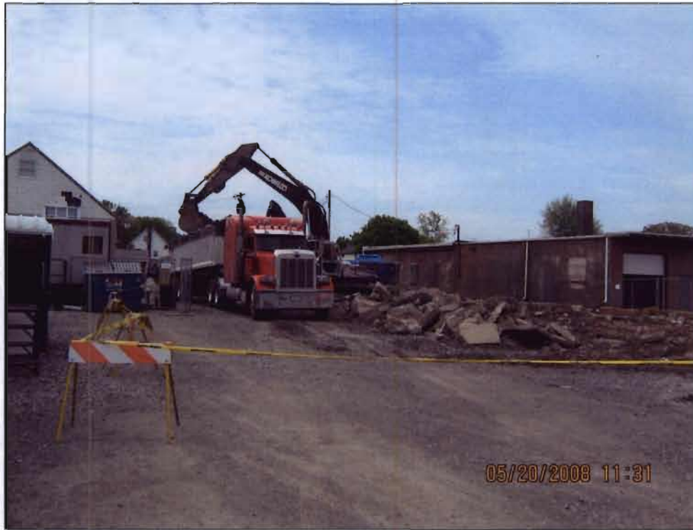
Loading of concrete debris removed from the MRS Plating Shop building floors and footers for removal.