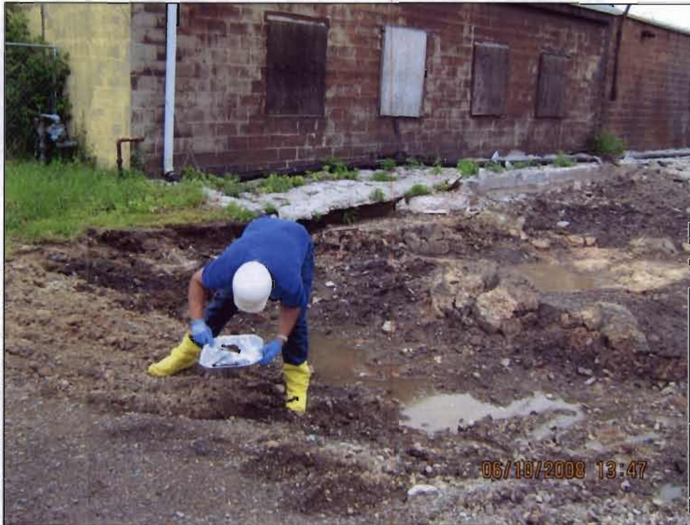
WRS personnel collecting non-hazardous soil samples from the area located between south of the former Plating Shop Building and the Rene Place.