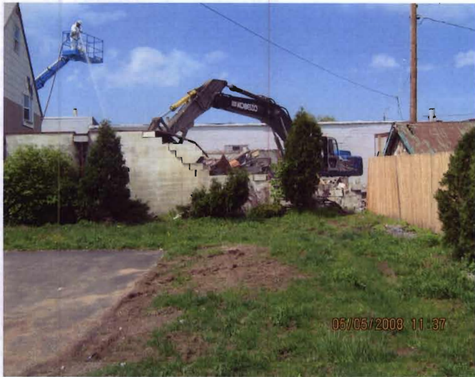
Demolition of the MRS Plating Office.