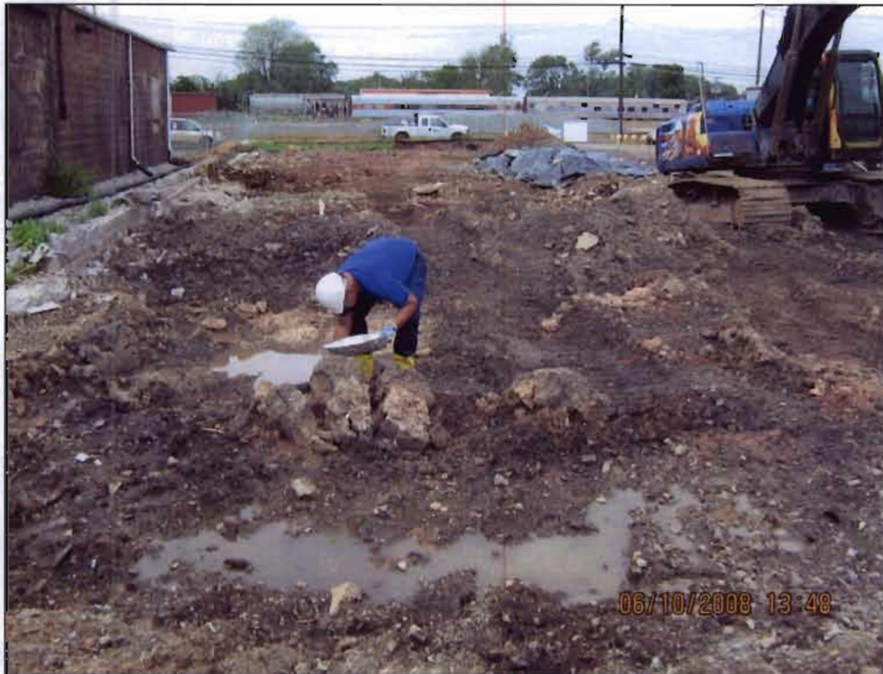
WRS personnel collecting non-hazardous soil samples from the area located between south of the former Plating Shop Building and the Rene Place.