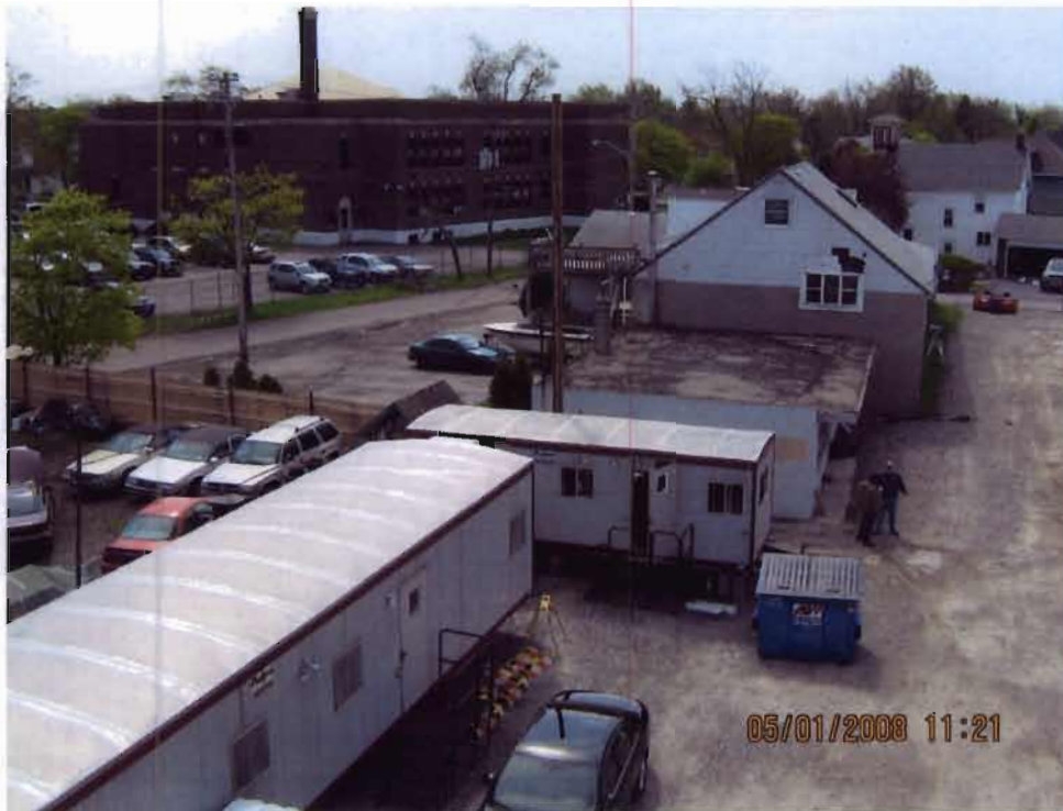
View of the MRS Plating Facility looking towards the Elementary School.