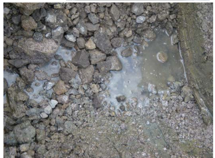
Hole with only water

Jon used the excavator to dig another hole about 8' north of the one where we'd found the oil to see if we could determine the extent of the plume. As you can see by the picture on the right, there was water in the clay layer, but no visible oil.