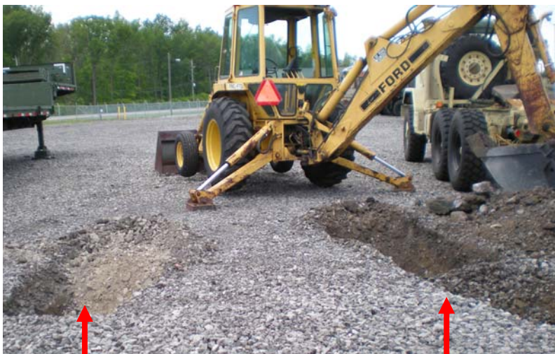
Hole with oil, over 6" pipe.